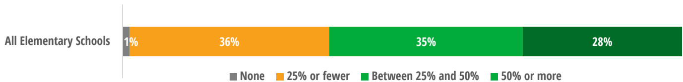
Figure 3 At the majority of campuses, at least 25%-50% of parents participated in the CATCH/Family Fun Night at their campus.

Source. 2016-2017 Elementary Coordinated School Health data collection. All percentages are rounded to the nearest whole number.