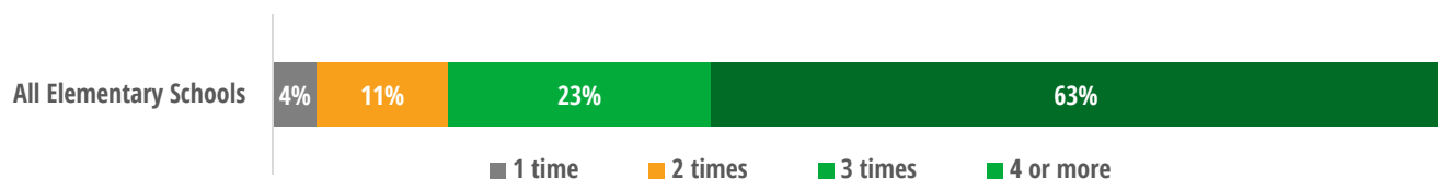
Figure 1 The majority of Elementary Coordinated School Health teams met 4 or more times this year

Source. 2016-2017 Elementary Coordinated School Health data collection. All percentages are rounded to the nearest whole number.