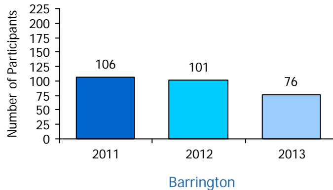
Figure 1. TELL AISD Participants Spring 2011 to Spring 2013

To do their jobs well, educators need supportive school environments where they are valued, are trusted, and can collaborate to improve instruction. The Teaching, Empowering, Leading and Learning (TELL) AISD Survey is a unique opportunity to gather information about school conditions from those whose views matter most—practicing educators. Respondents are asked for their perceptions on a variety of issues related to student achievement and staff retention, including Overall Climate, Use of Time, Leadership, Facilities and Resources, Student Behavior Management, Community Support, Professional Development, Instructional Practice, and Achievement Press. Participant counts are displayed in Figure 1.