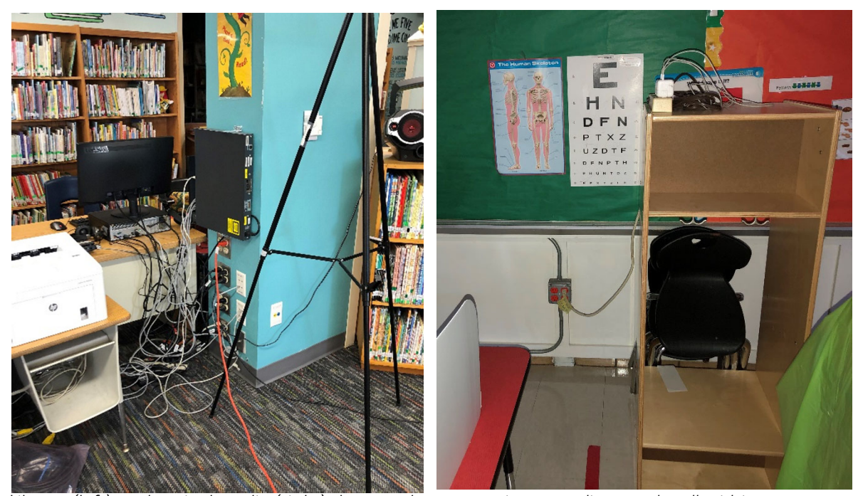
Library (left) and typical studio (right) show outlet connections not dispersed well within spaces.