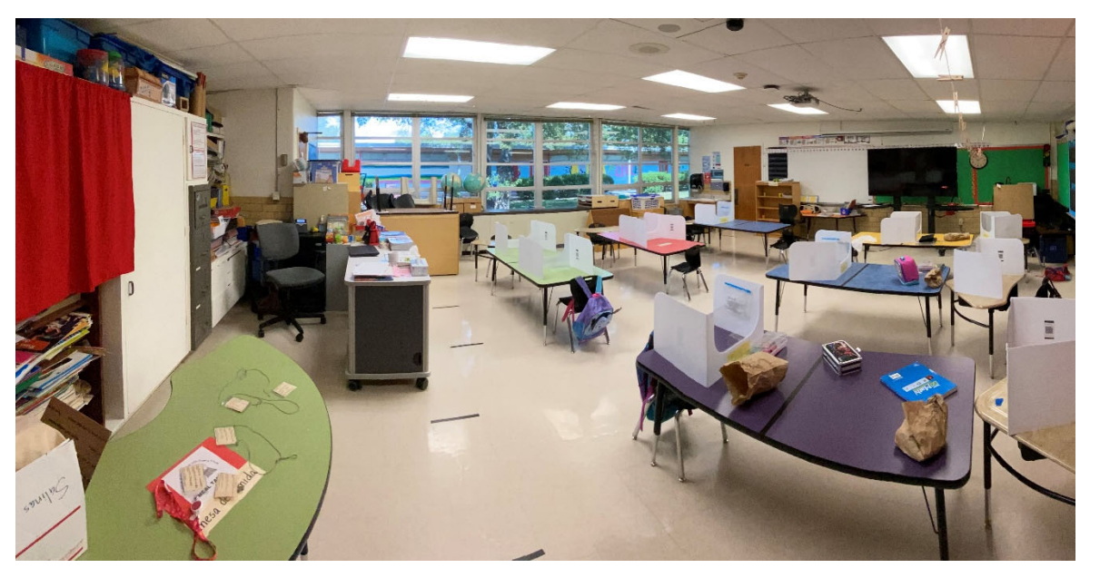
Typical studio has ample daylight. Finishes are dated. Storage is inconsistent between studios and larger tables do not allow for flexible teaching configurations.