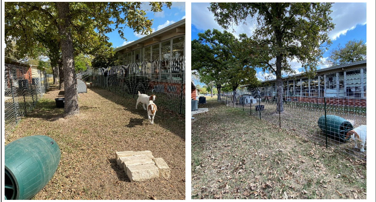
Main outdoor spaces between studio wings are narrow. Animal husbandry uses up one of the outdoor spaces.