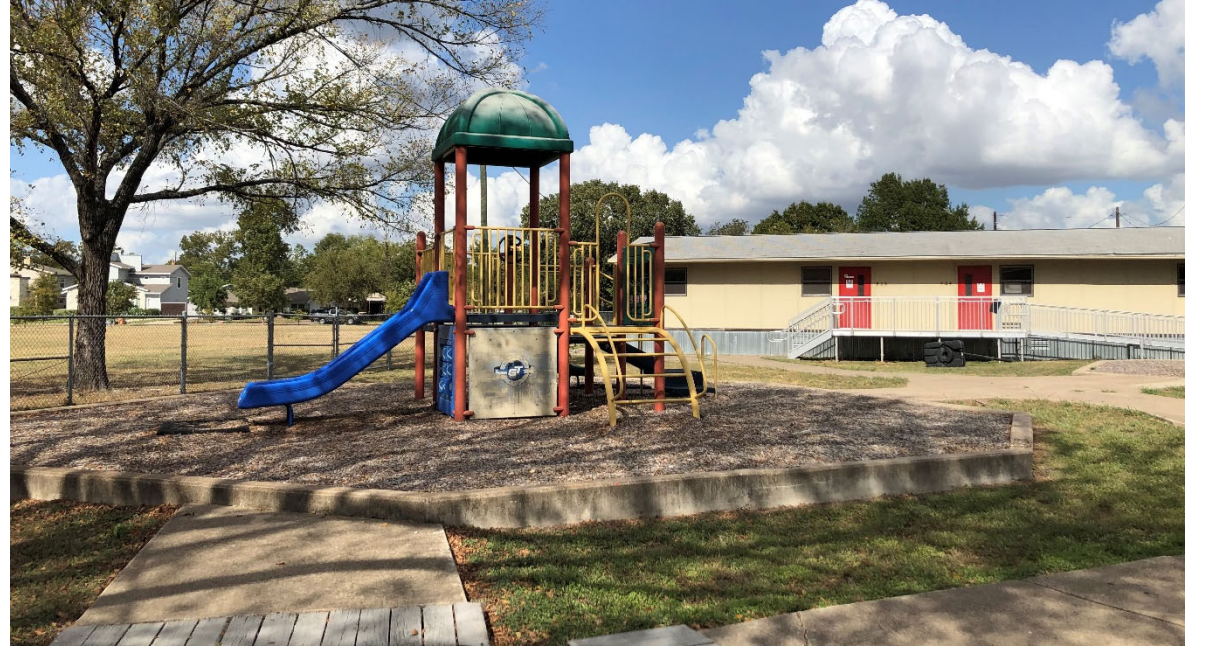
Playground equipment on campus is dated, not for a variety of ages and does not have shade.