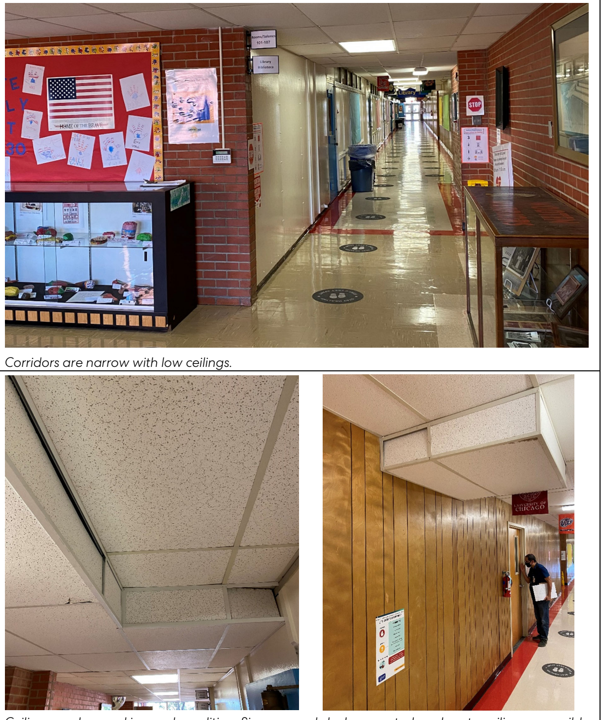
Ceilings are low and in aged condition. Signage and clocks mounted as close to ceiling as possible.