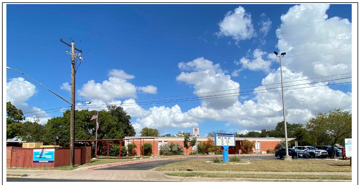
Confusing front entry and flow for visitors into building. Front entry is not where drive is. The school has attempted to make the front entry more visible with plants and signage. Stack space lacking for traffic with student pickup/drop-off on public street.