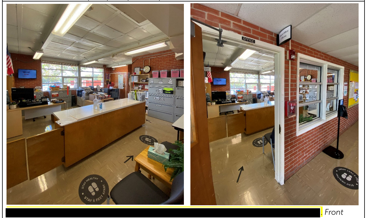
desk area is narrow with minimal furniture for waiting area.