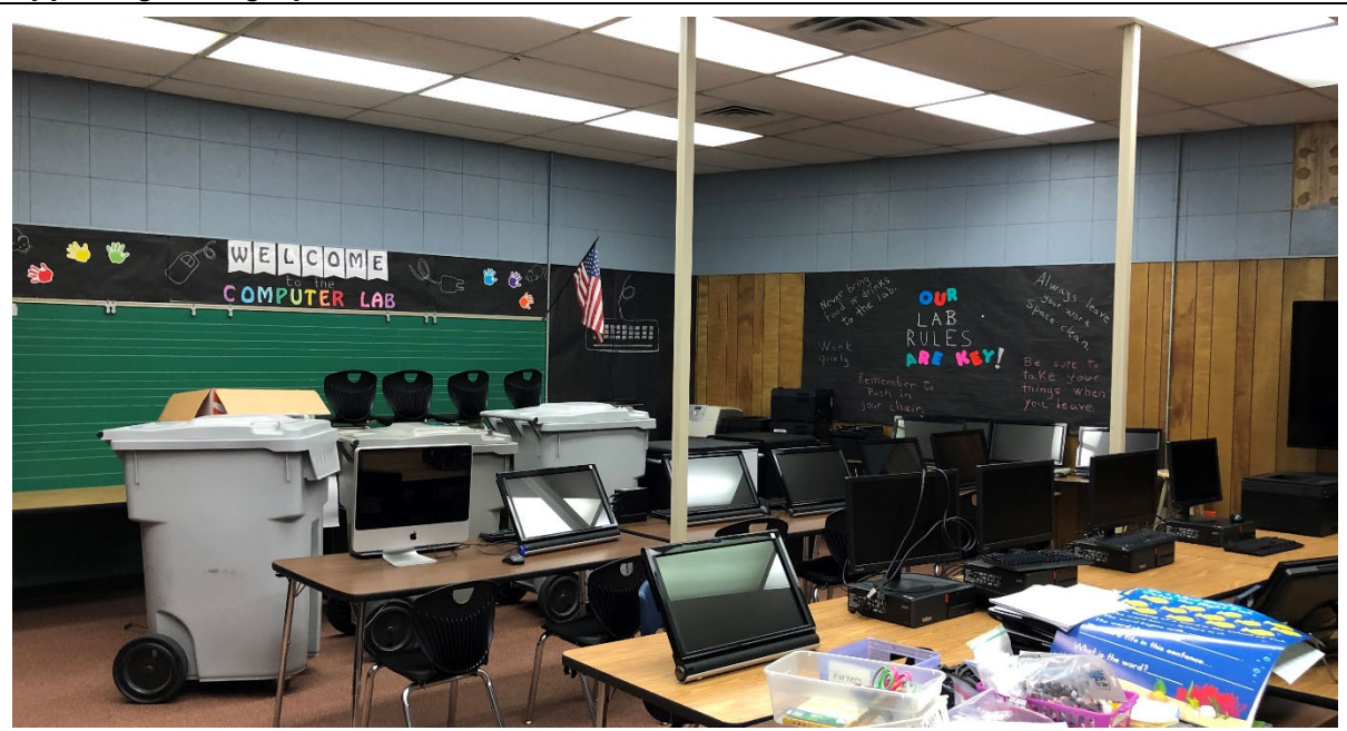
Computer lab finishes are dated. Thermal, acoustical and lighting quality are unsatisfactory and need attention. There was a strong odor in the room as well during the Assessment.