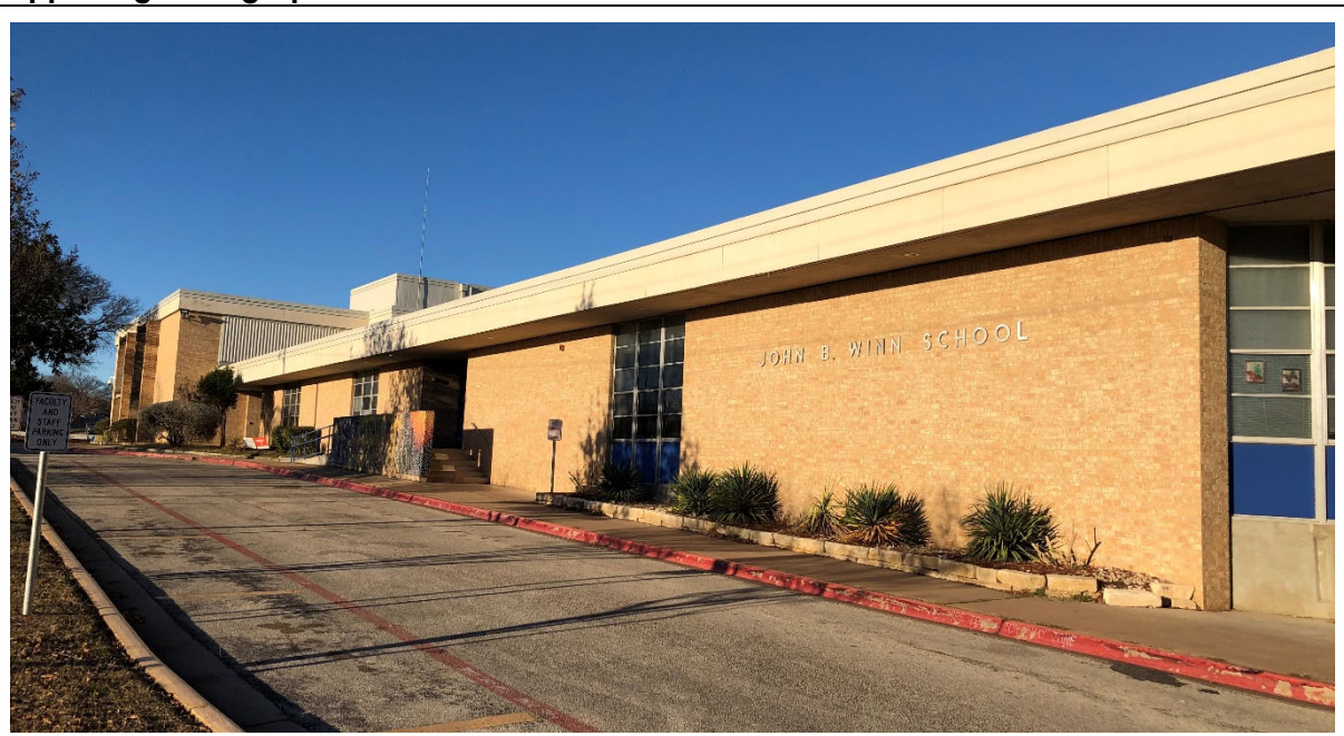
The main entry is difficult to locate. Wayfinding could be improved. There is no canopy.