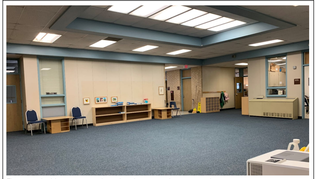
The annex building contains a large breakout space between studios.

Corridors are generous and could provide opportunity to host informal interaction and/or breakout functions. The school currently does use this space for interventionists by setting up tables and chairs.