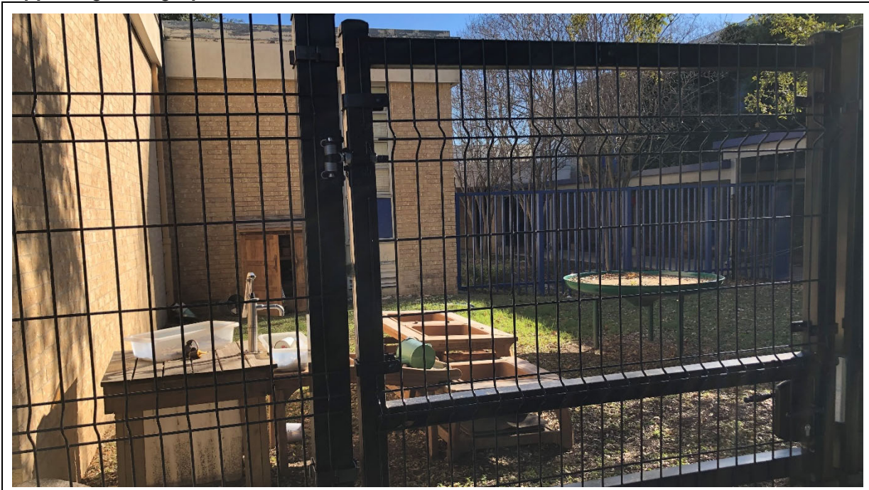
There are two enclosed areas outside for younger students.