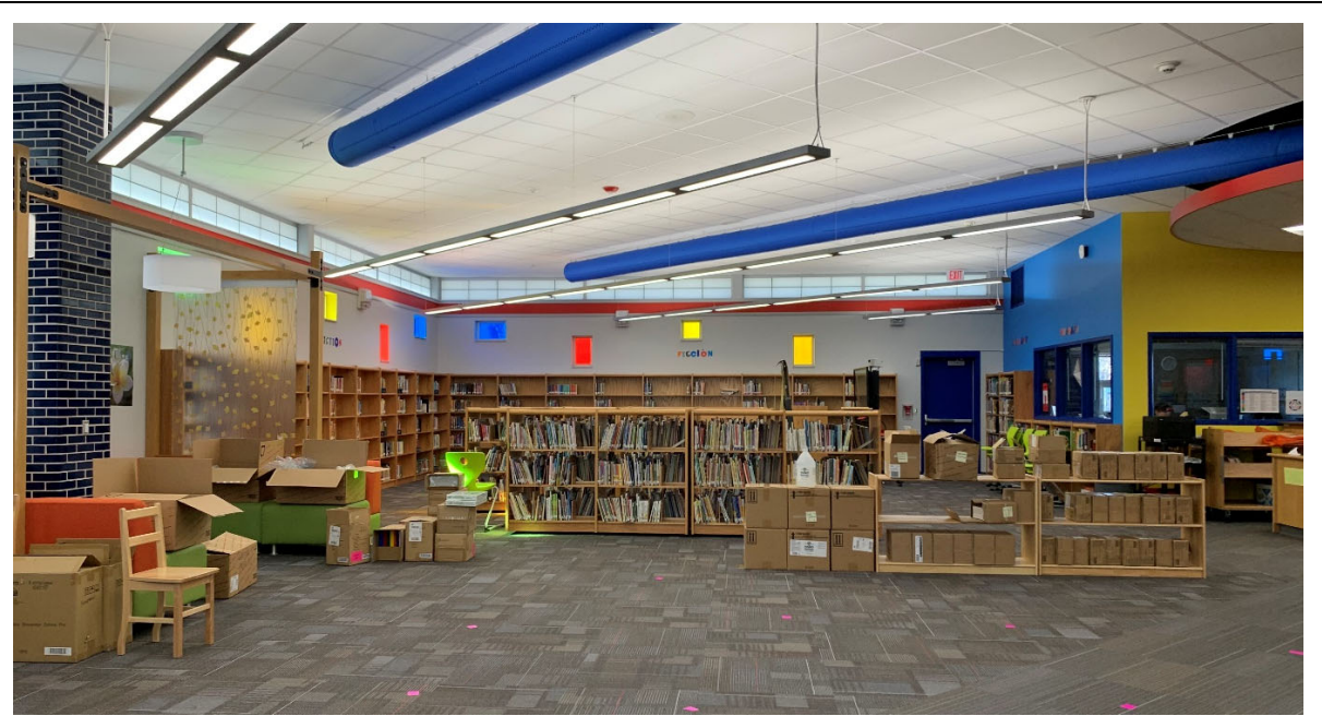
The new library offers plenty of space for various gatherings and events. The technology is brand new.