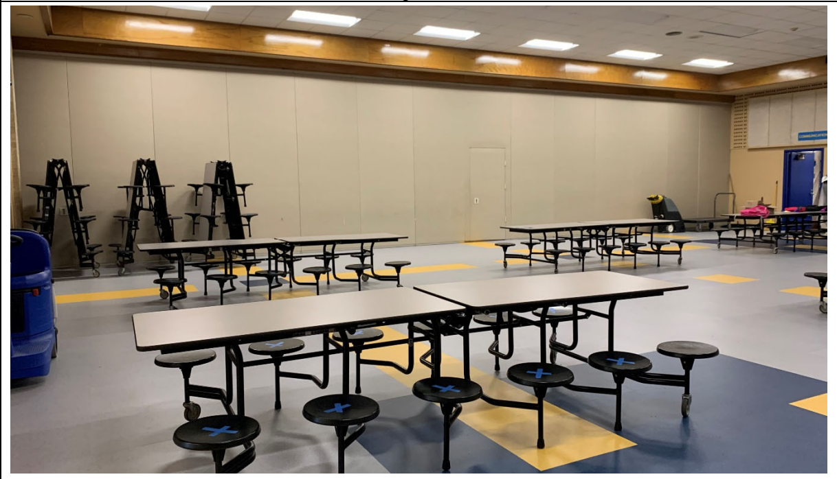
Cafeteria is slightly undersized for campus capacity but is adequate for enrollment. New flooring has recently been installed. No A/V equipment.

Studios in west wing are recently renovated. Windows did not have blinds at the time of assessment and were never installed after being renovated.