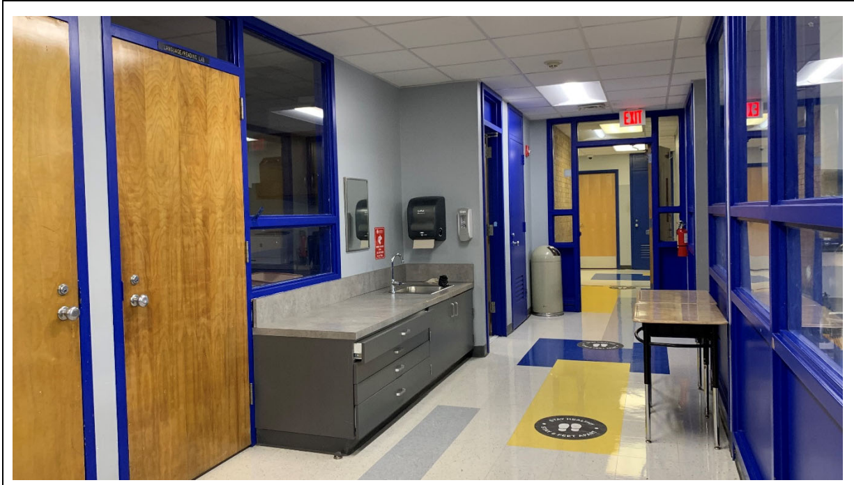
Renovated Studio Corridor: The studios have great visibility to the corridors; however, the quality/thickness of glass compromise acoustics.