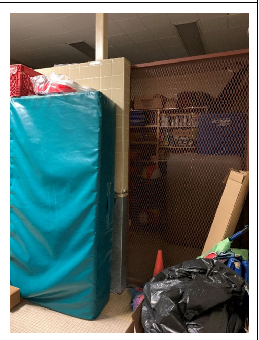
Gym Office and Storage: There have been several flooding events. The flooring has not been replaced, and there are odors. The storage is overflowing into the girls' restroom, making it unusable.