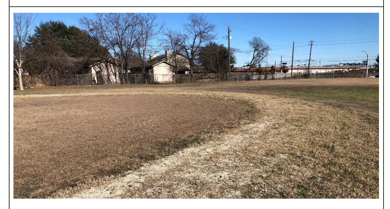
The school grounds are underdeveloped. There is a dirt track in the main field but needs maintenance to function well.