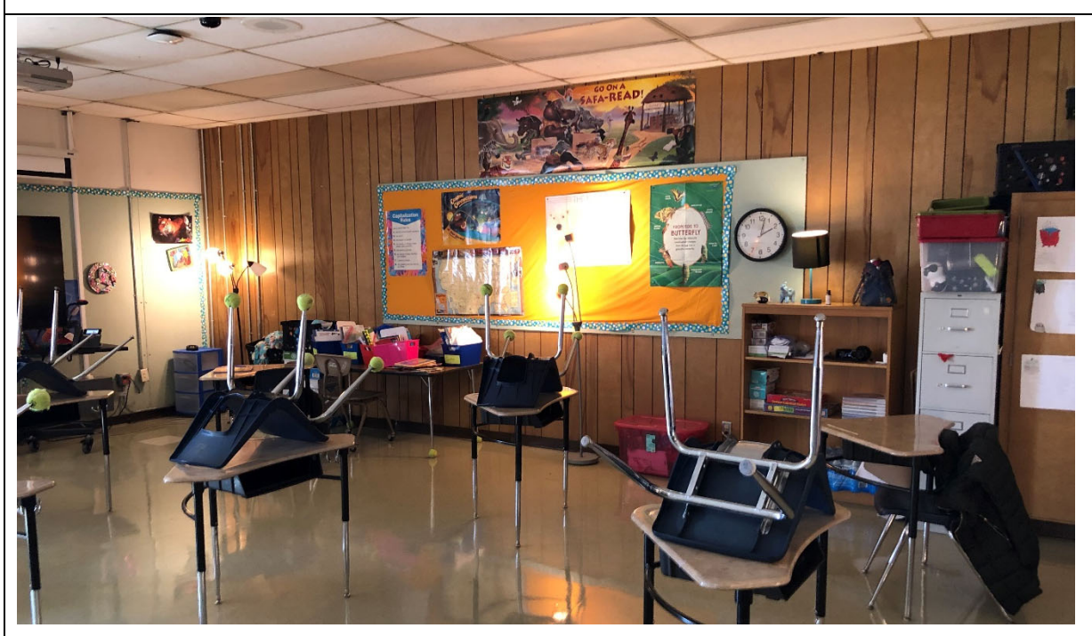
Studios in east wing have not been renovated to match west wing. Ceiling tiles, wall paneling and lighting are dated.