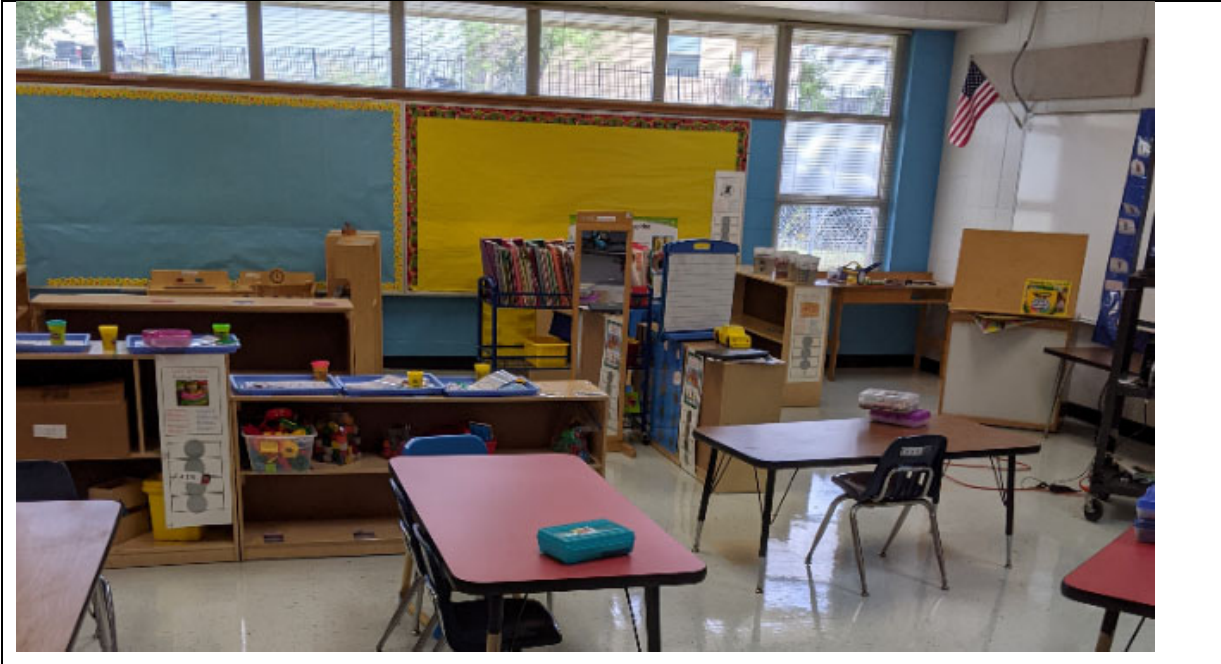
All studios have access to natural daylight. Studios do not meet current SF requirements according to Educational Specifications.