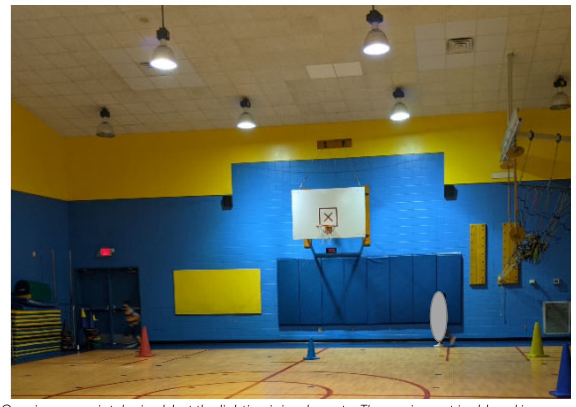
Gym is appropriately sized, but the lighting is inadequate. The equipment is old and in poor condition.