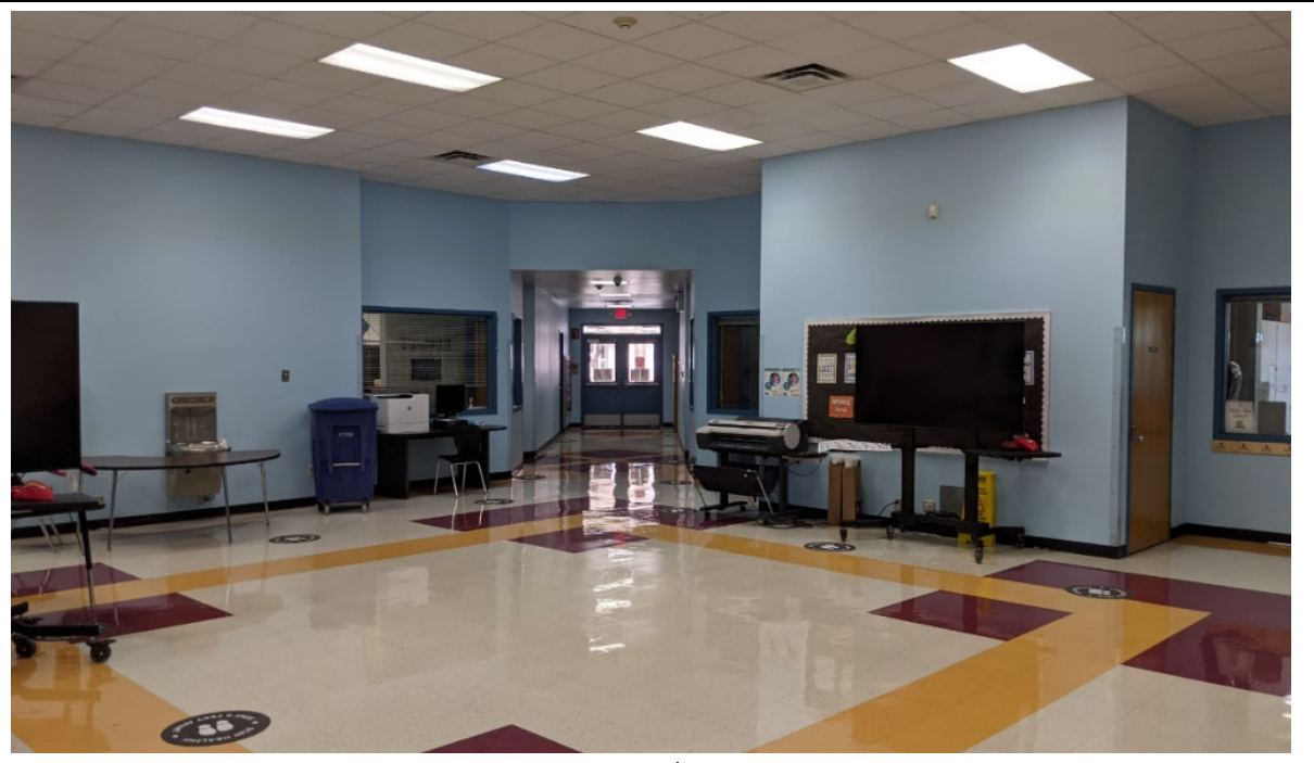
Collaboration space in studio pods. Storage room/restrooms block visibility from studios into collaboration space. These spaces are underutilized due to this issue.

Dark wood paneling is not conducive to an elementary school environment.