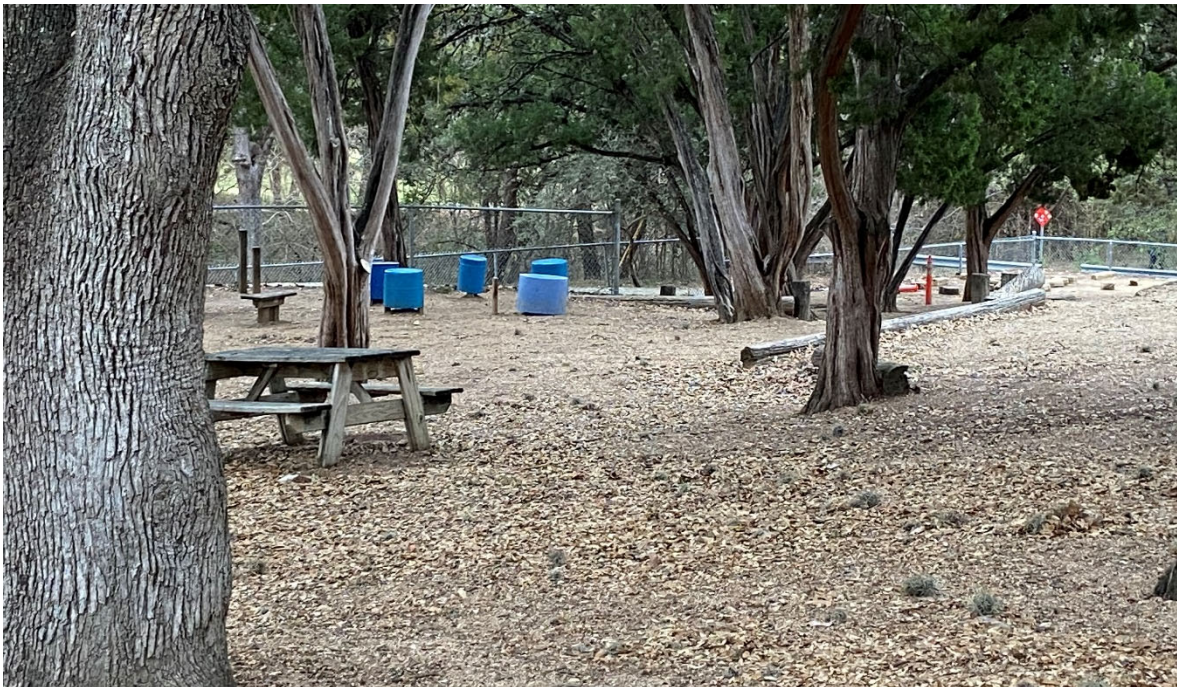
Wildman Woods is underdeveloped. The school notes [REDACTED], a lack adequate play structures for students to utilize, and has accessibility concerns