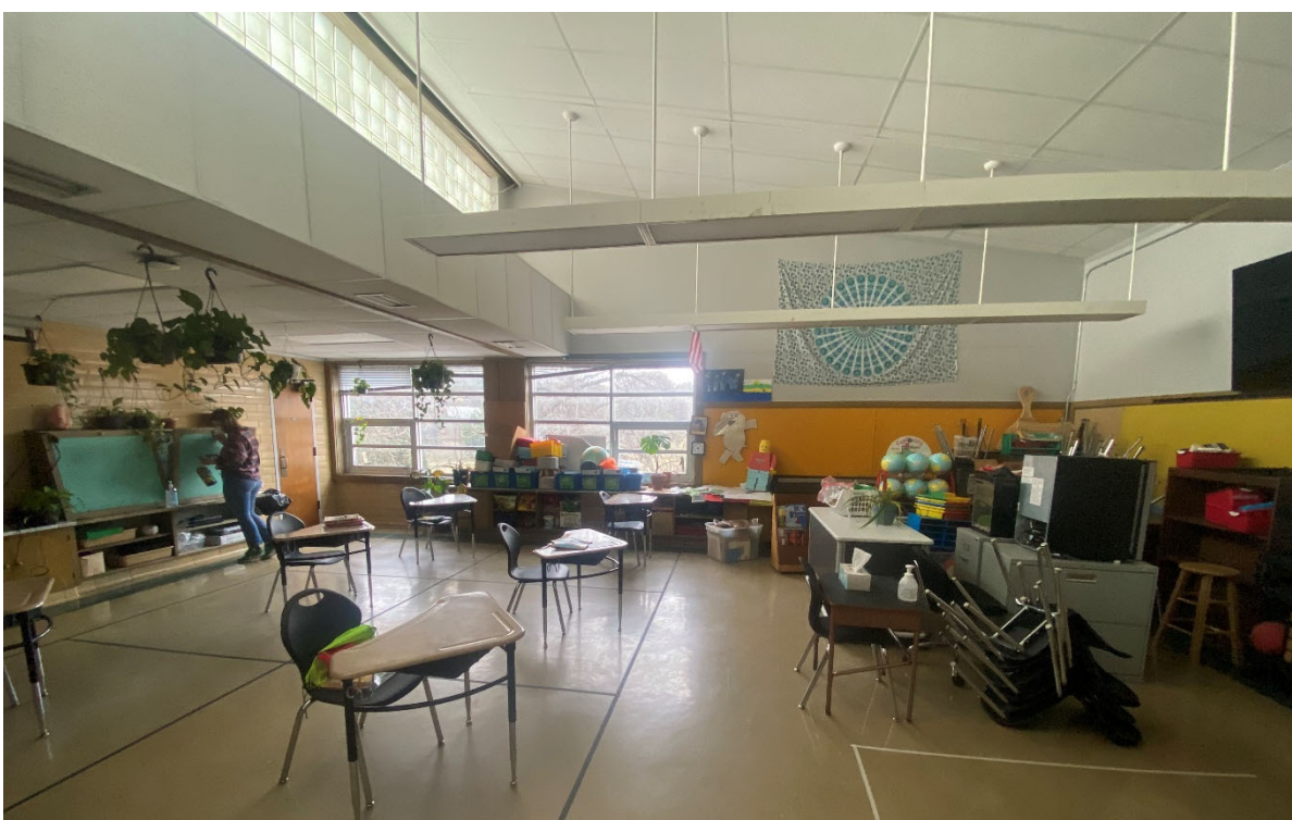
Original Building Studio: These studios provide a lot of natural light, but storage is old and not functioning well.