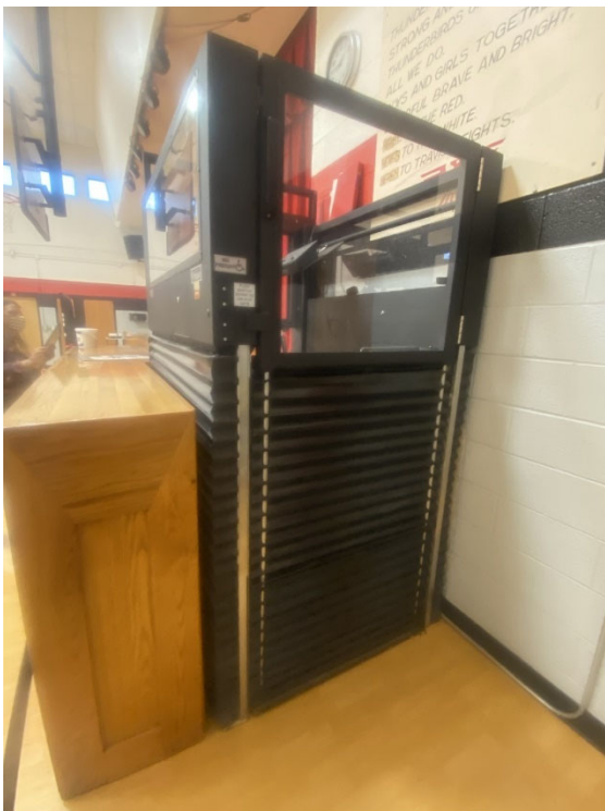
Gymnasium: The stage lift is being used for A/V purposes and there is no ramp to the stage.