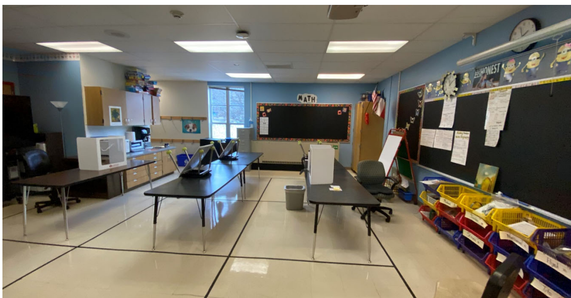
Academics and Learning: This studio has adequate storage and lighting, but there is limited visibility to the exterior and no visibility into the studios building.