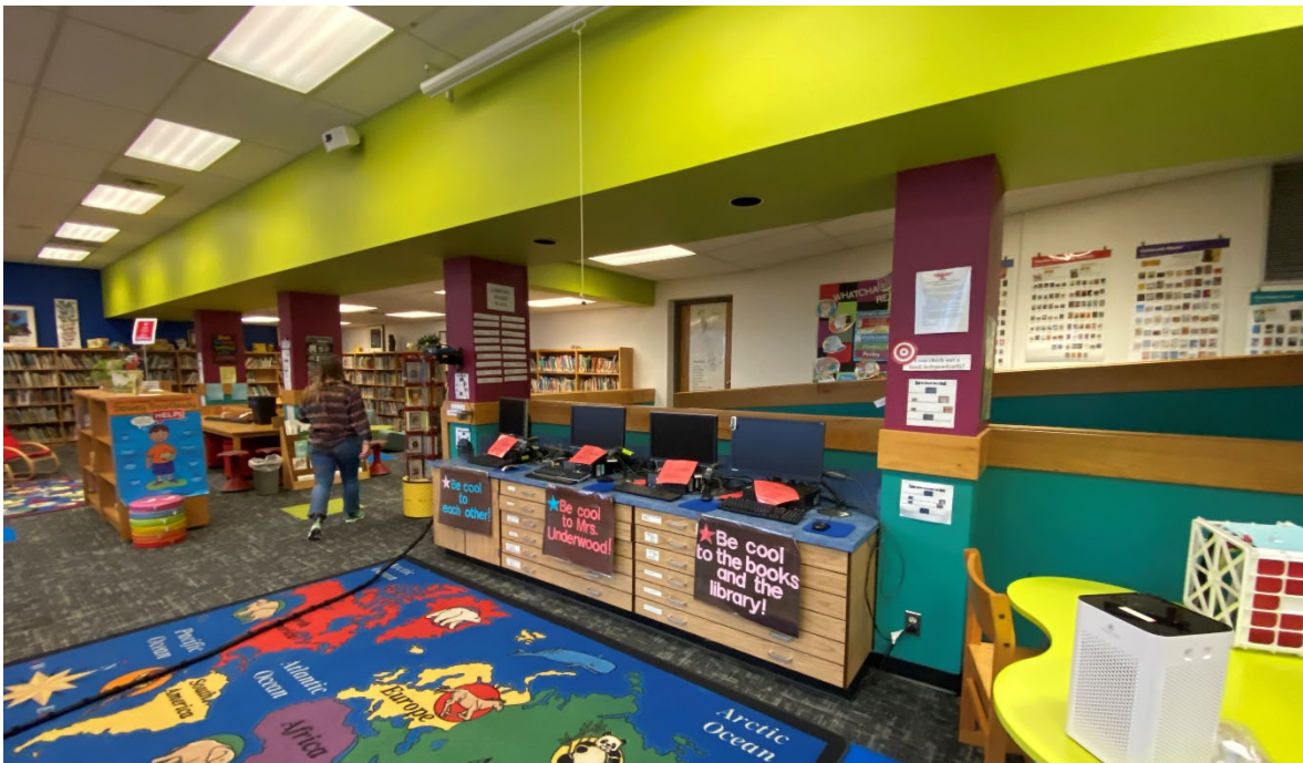
Media Center: The ramp on the right side of the image is the only accessible route into the library.