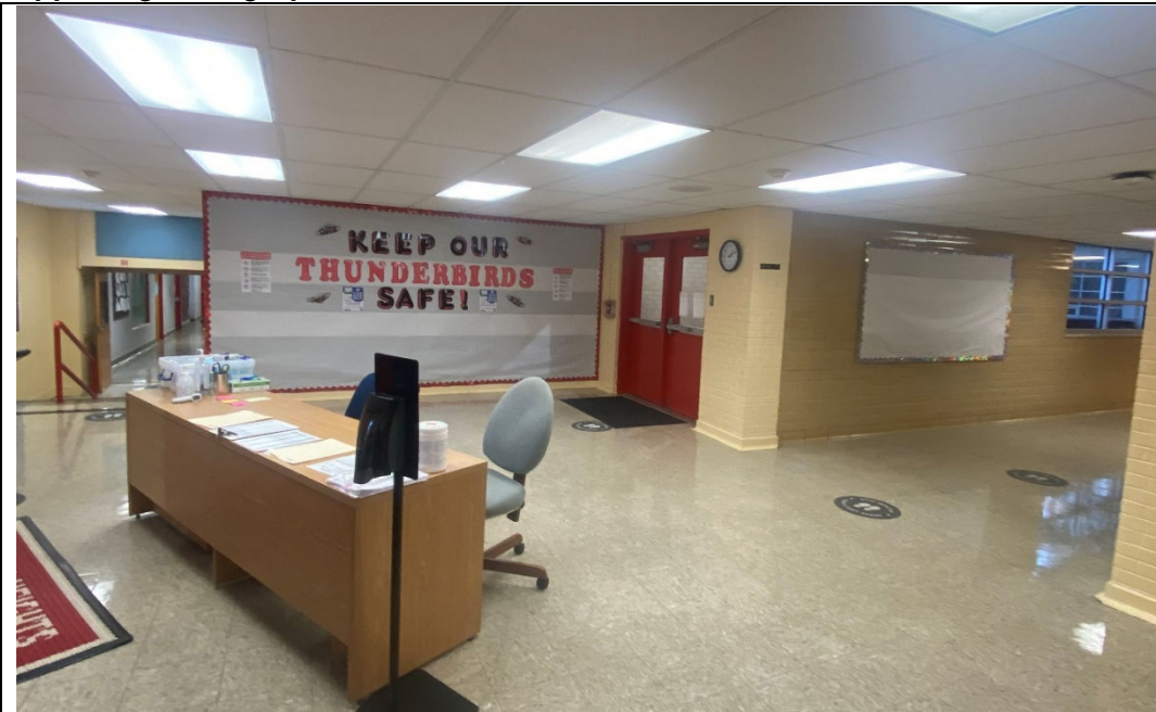
Main Entrance: [REDACTED] The ceilings are low, making the space feel unwelcoming. [REDACTED]