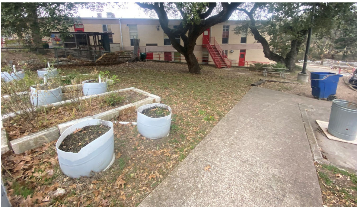
Exterior: There are several gardens and outdoor learning areas, [REDACTED]