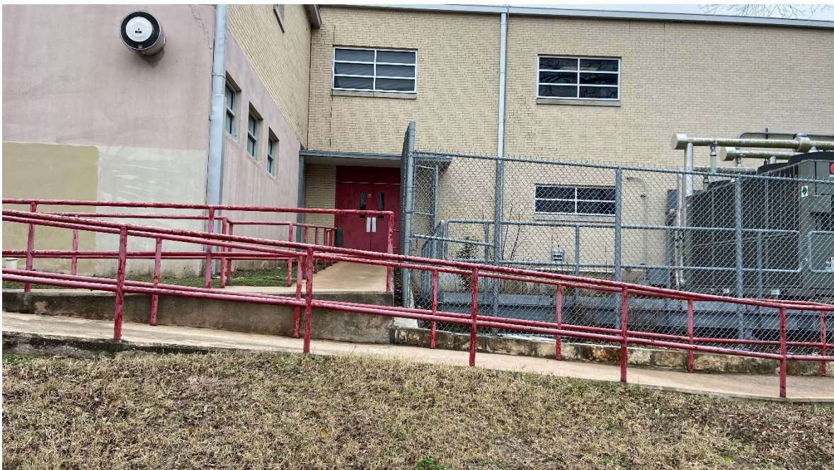
Exterior: There are several winding ramps throughout the campus to provide accessibility. The ramps lack any kind of overhead protection from weather.