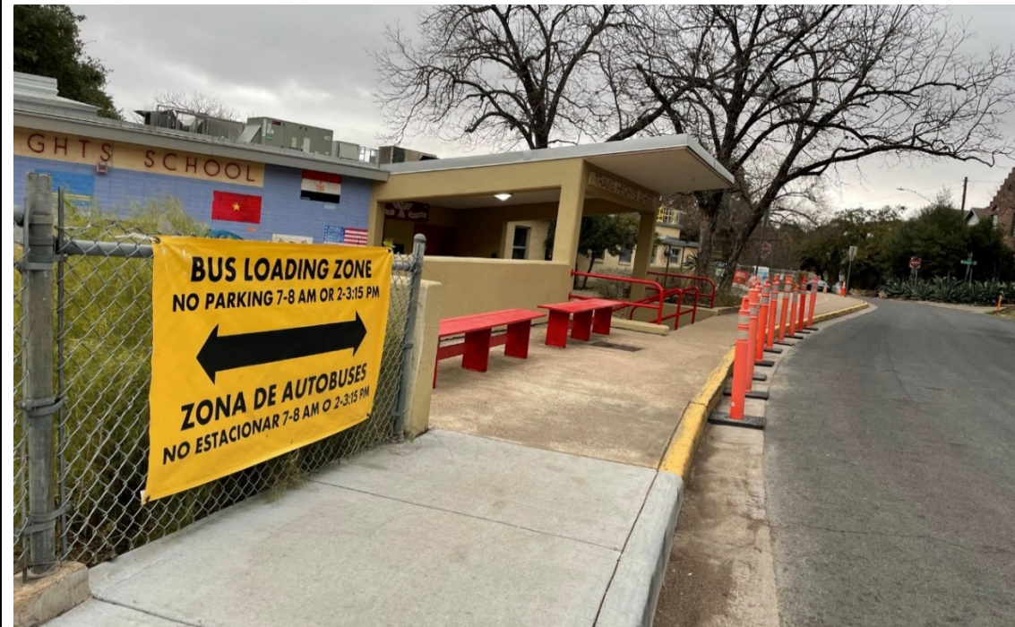
Main Entrance: The cones designate where the bus loop is set up at the beginning and end of the day. This is a residential street with houses across from the school.