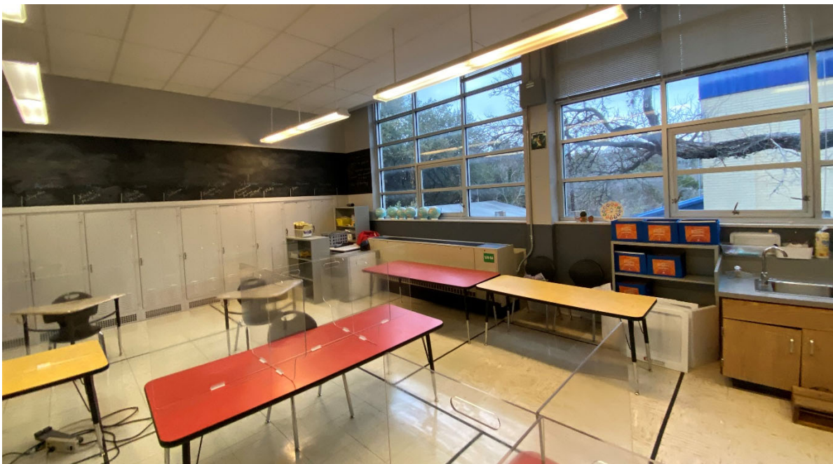
Academics and Learning: Studio has nice views to the outdoors, but storage is not usable and there is only one possible teaching wall.