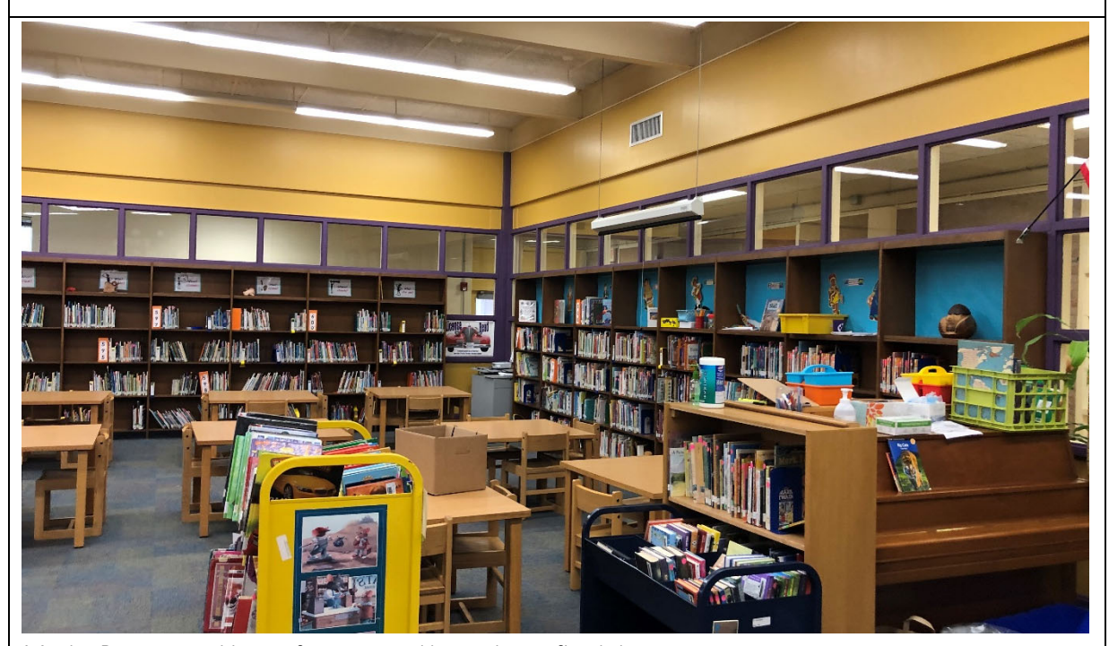
Media Resources: Heavy furniture in library limits flexibility.