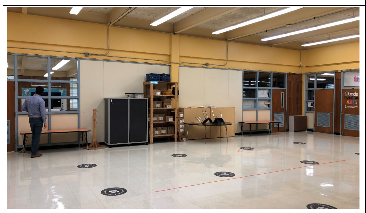
Academics and Learning: Typical common space between studios.