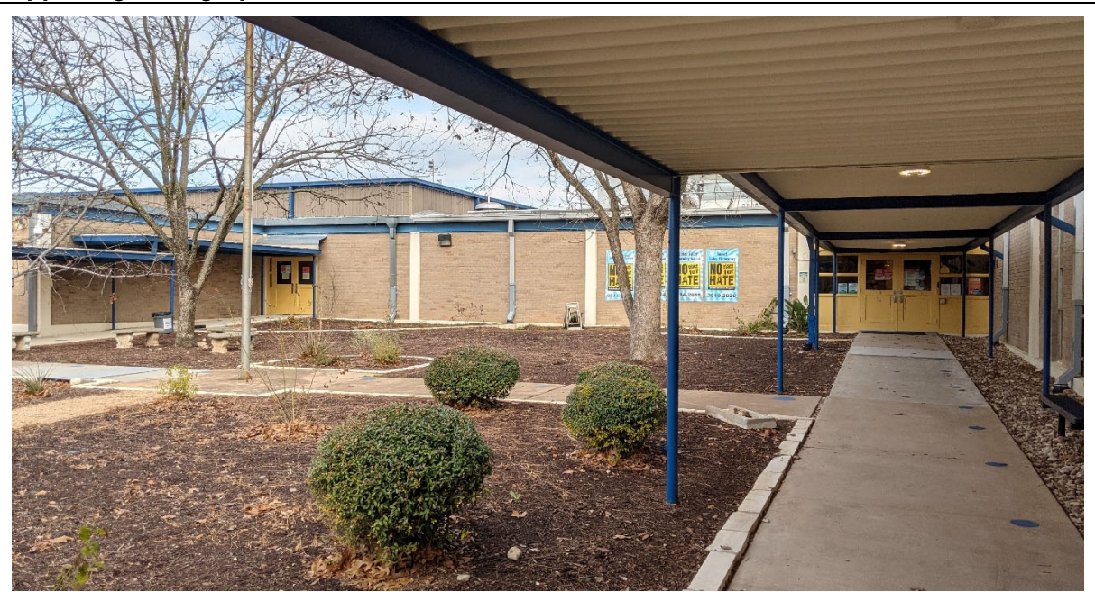
Exterior: Drop-off canopy at main building entry.