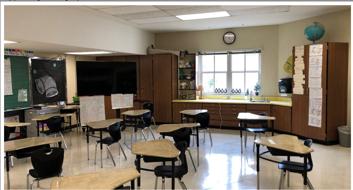
Academics and Learning: Typical studio with mobile furniture and access to natural light.