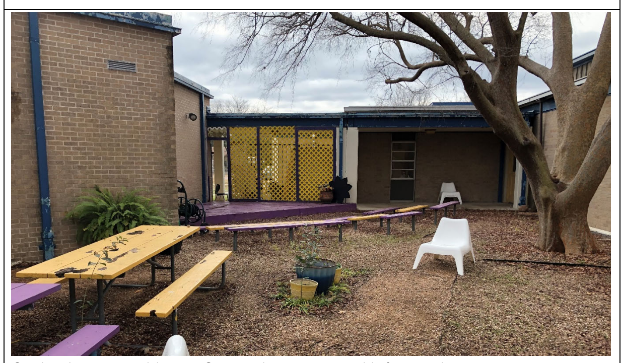
Outdoor Learning and Activity: Courtyard space is accessible from studios.