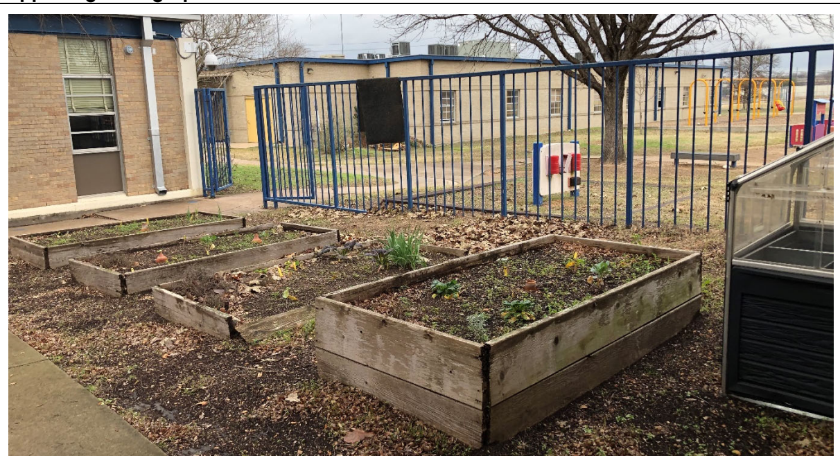
Outdoor Learning and Activity: Learning garden planters need repairs.