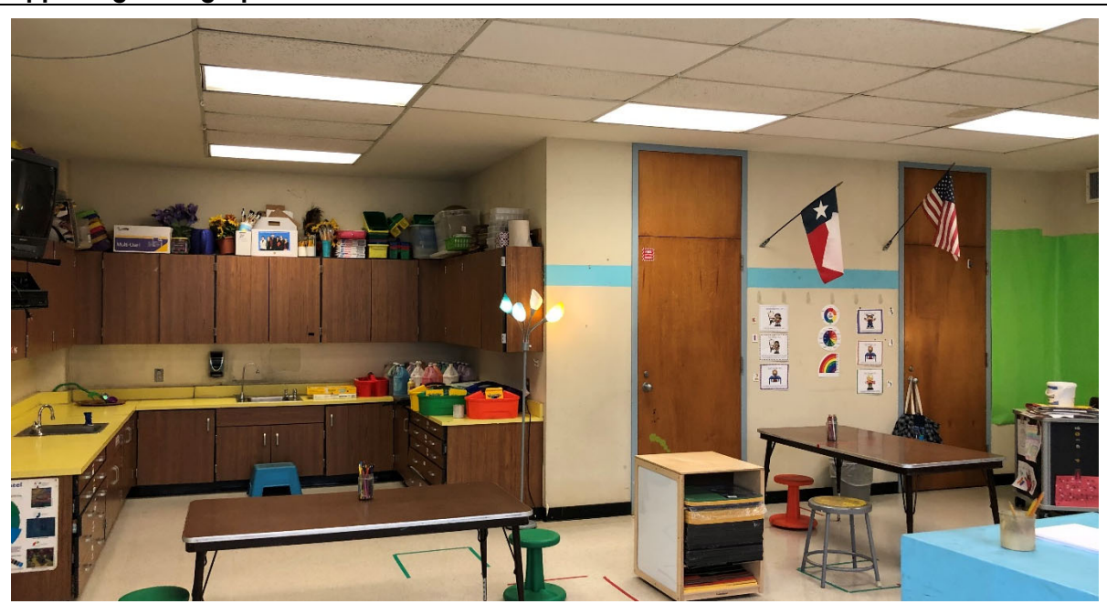
Visual and Performing Arts: Art studio is undersized but includes kiln room and storage.