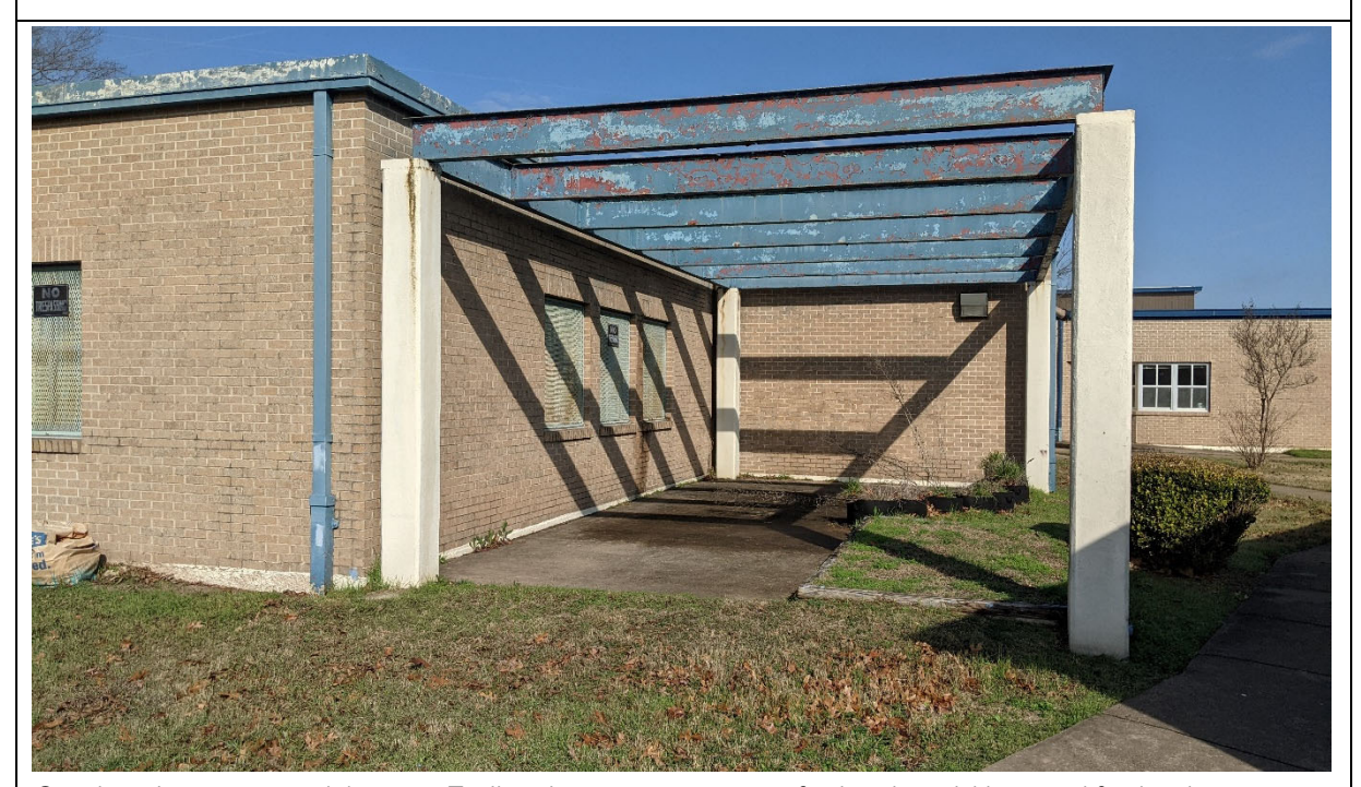
Outdoor Learning and Activity: Trellised areas in corners of school could be modified to be functional outdoor studios.