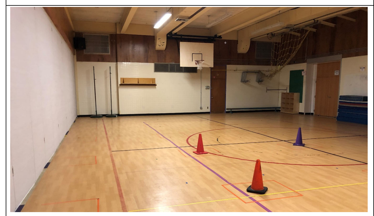
PE and Wellness: Gym floor is new, but rest of gym is very dated.