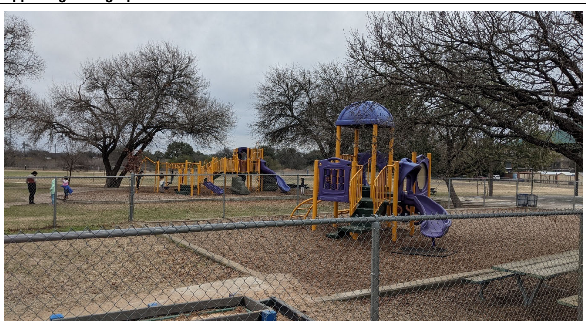
Outdoor Learning and Activity: Playscapes are in good condition but do not have shade.