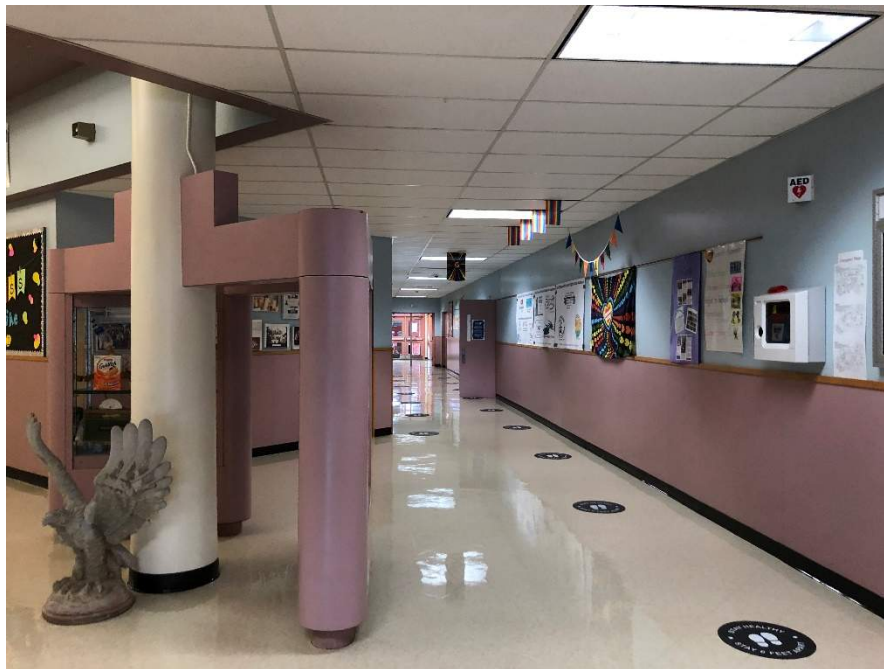
The corridors have areas for displays and highlights school price.