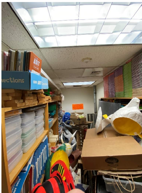
Art spaces with lack of storage and appropriate support spaces.