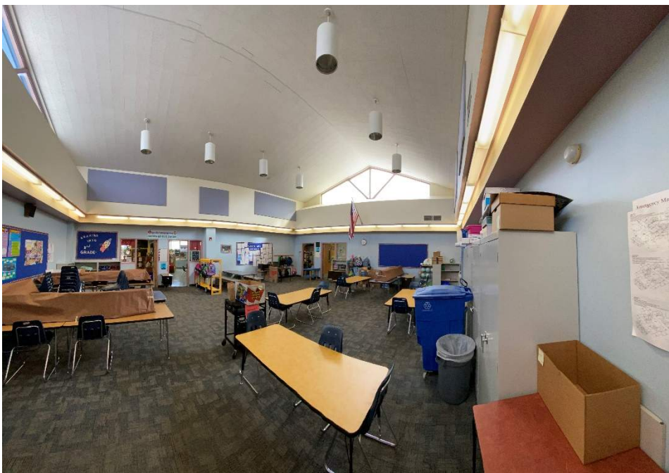
Learning neighborhood with large collaboration space. It has limited storage and limited furniture for different types of activities.