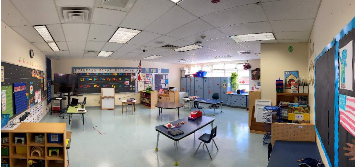
Access to natural light and adequate lighting in typical studio.