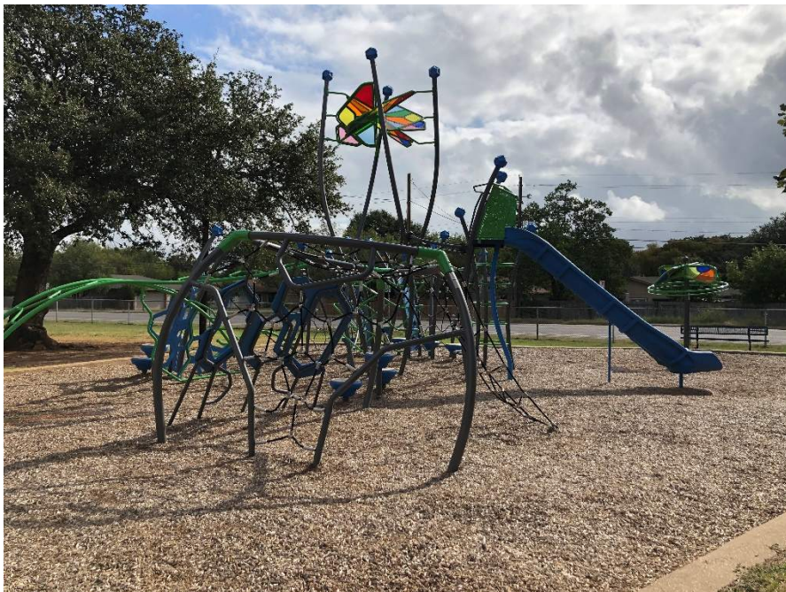
Active playgrounds are in good condition and suitable for a variety of ages.