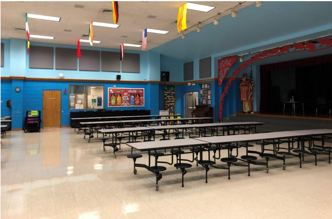
Cafeteria is undersized for campus capacity and only one type of seating is provided. Stage is adequately sized with a ramp provided for accessibility.