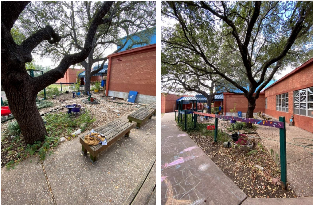
An outdoor learning area is located near the annex building, but for most studios in the main building and in the portables, this location is disconnected from the learning spaces.