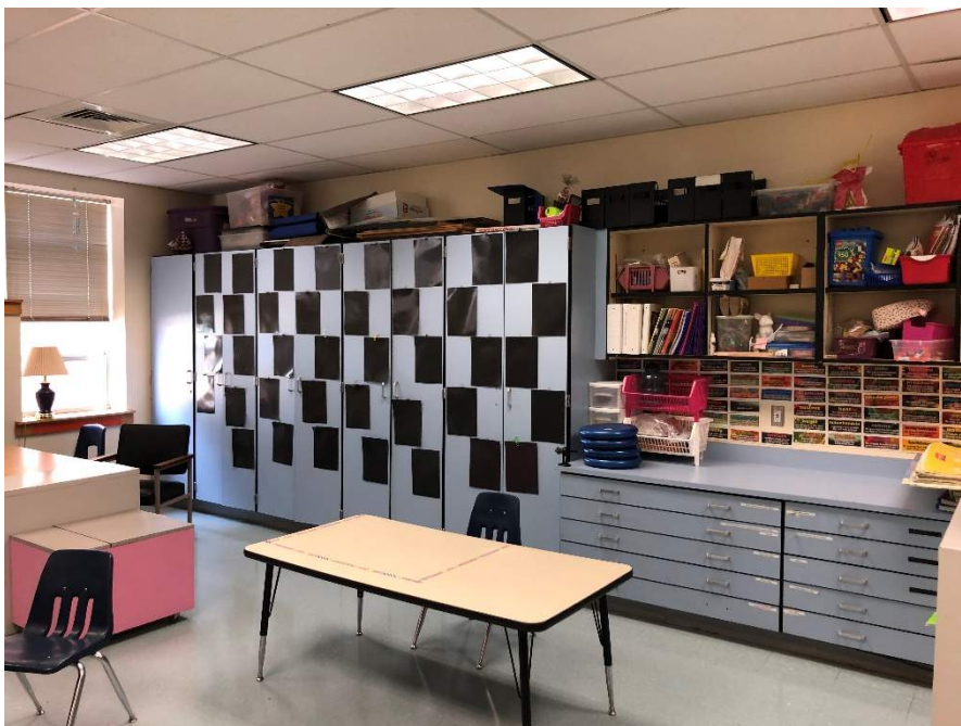
Studio being used as an art room. Does not have enough square footage per Educational Specifications or appropriate support spaces.