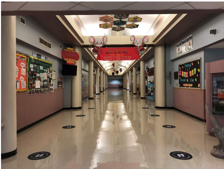
Main hallway is generous width, but lighting is poor, making hallway feel dark and dated.