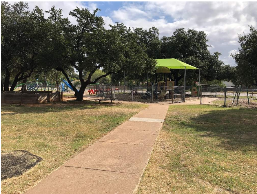
Active playgrounds are equipped with shade covering.