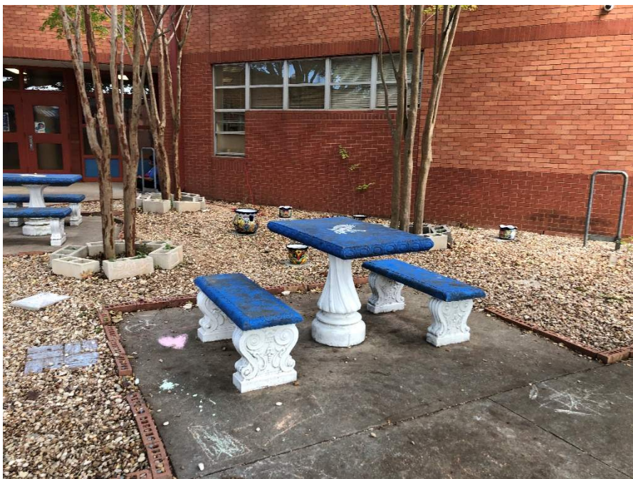
Outdoor areas lack adequate age-appropriate furniture.