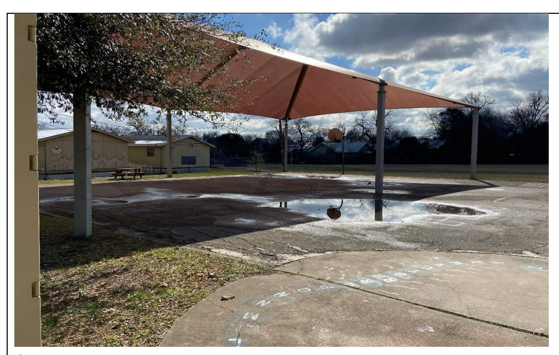
Covered outdoor basketball court adjacent to the portables.