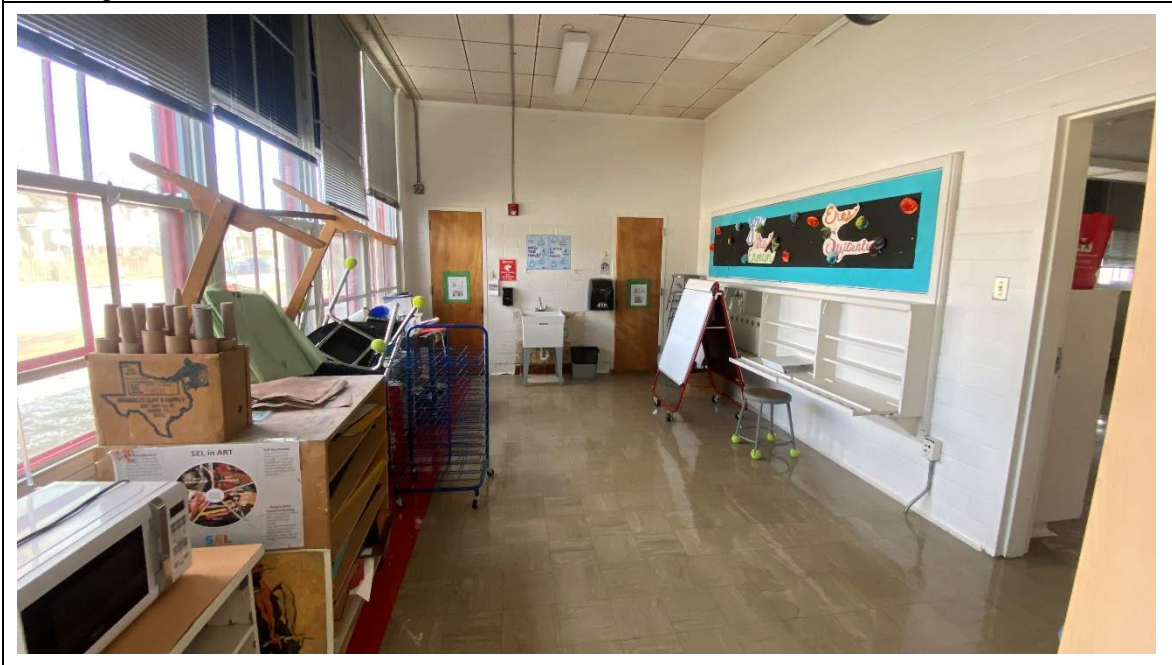
Some studios are joined by a connector space that could be used as small group setting. Restrooms are not ADA accessible.