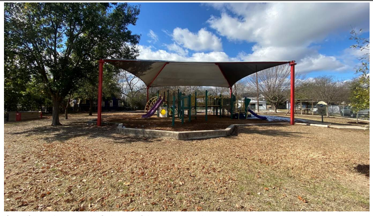
One of two playgrounds. Only one of them is covered.