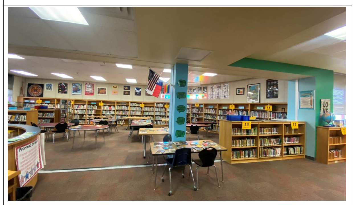
Library has minimal visual connection to the school and to the outdoors.