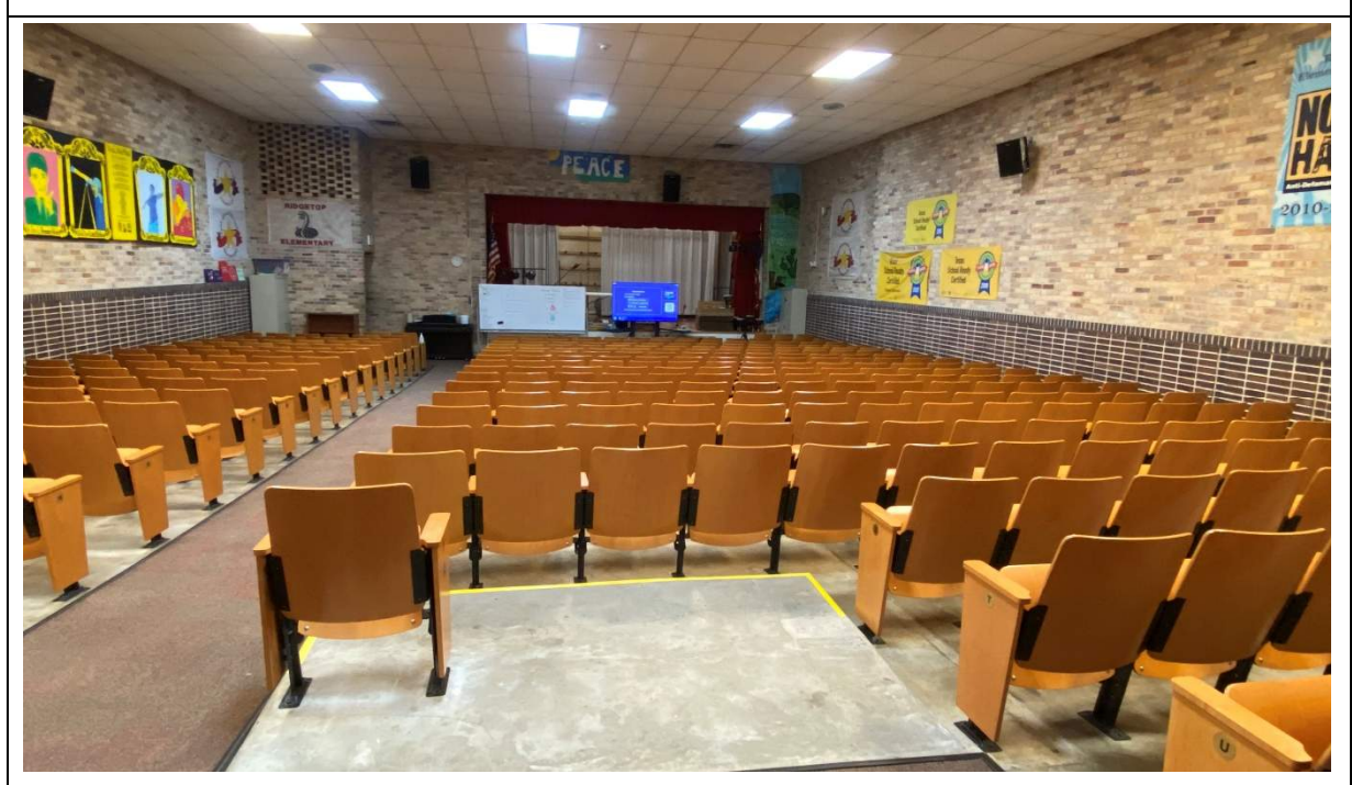
A separate auditorium is adjacent to the main entrance. There are speakers and a permanent overhead projector.