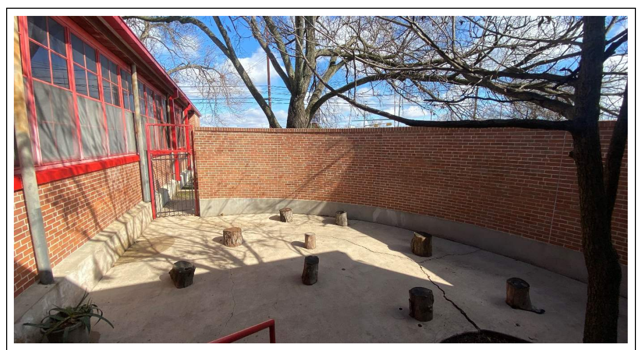
Outdoor studio is accessed through the library. Space is not accessible from library due to steps leading up to the door.