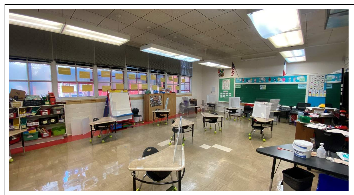
Typical studio with portable screen, built-in cabinetry for storage and furniture that can be reconfigured.