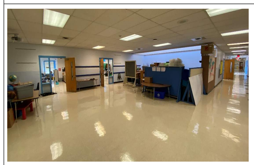
Studios wings are organized around "pods," open spaces equipped with projectors where grade levels and larger groups can gather. Skylights bring in natural light to this space. It is being used for storage, but this is due to COVID protocols.