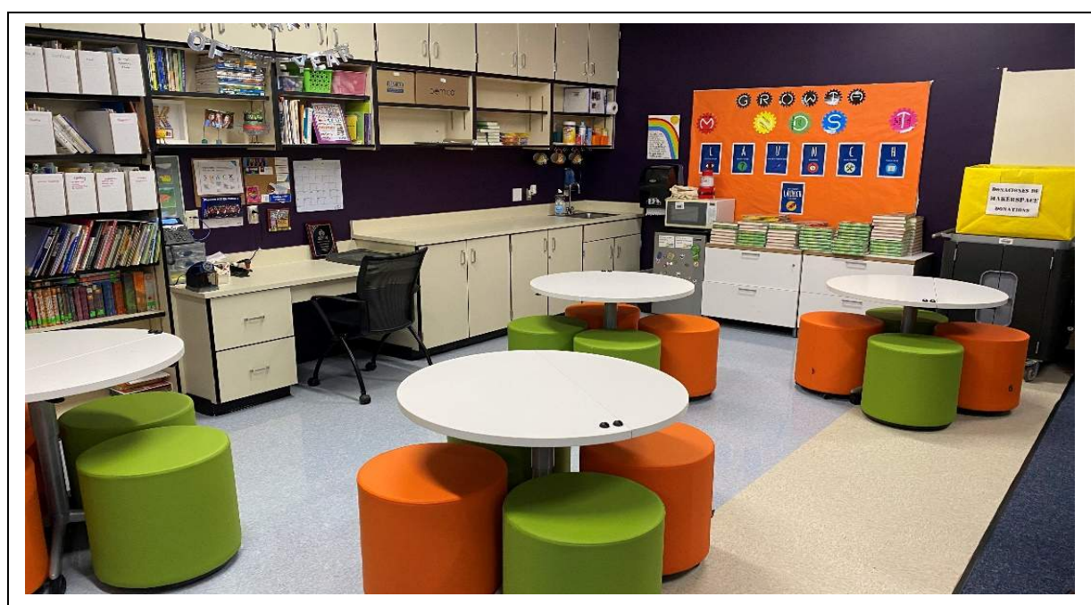
Space used as maker space in library with flexible furnishings and organized supplies.