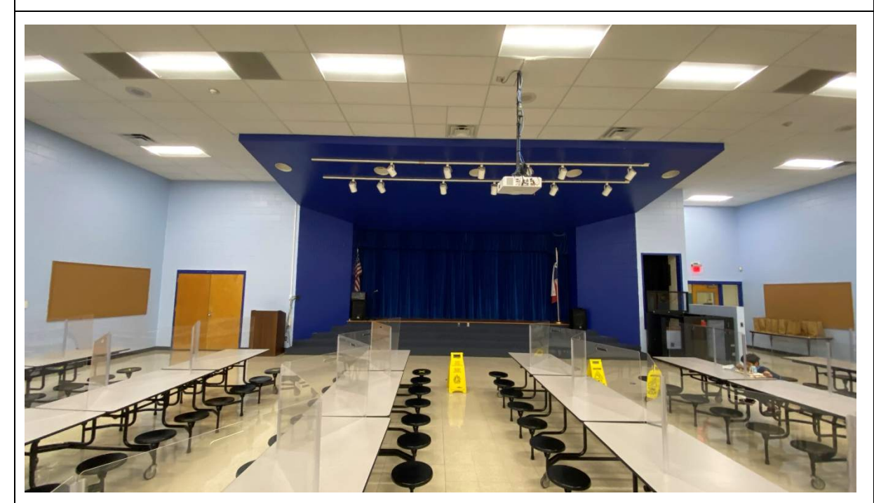
Cafeteria is adequately sized for the capacity but does not meet the needs for the school currently. The finishes need updating and acoustic control is also needed.