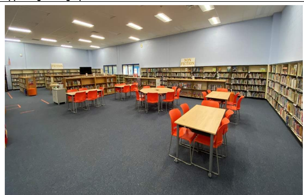
Furniture in library is new, flexible and easy to reconfigure for different sized groups.