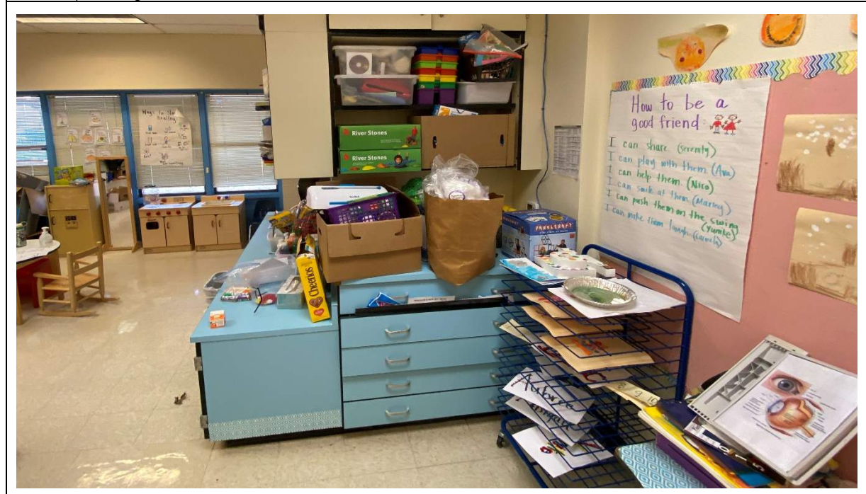
Storage space in most studios is inadequate and dated.