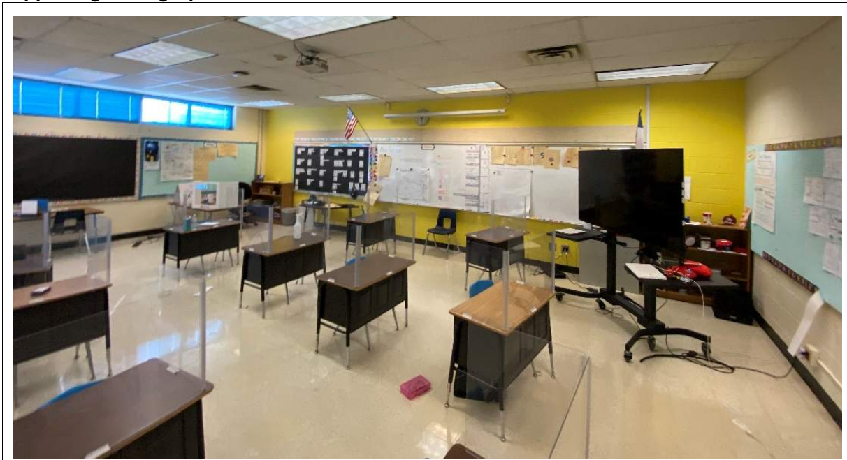
Most studios are equipped with edu-boards and/or projectors, but furniture and other technology need updating.