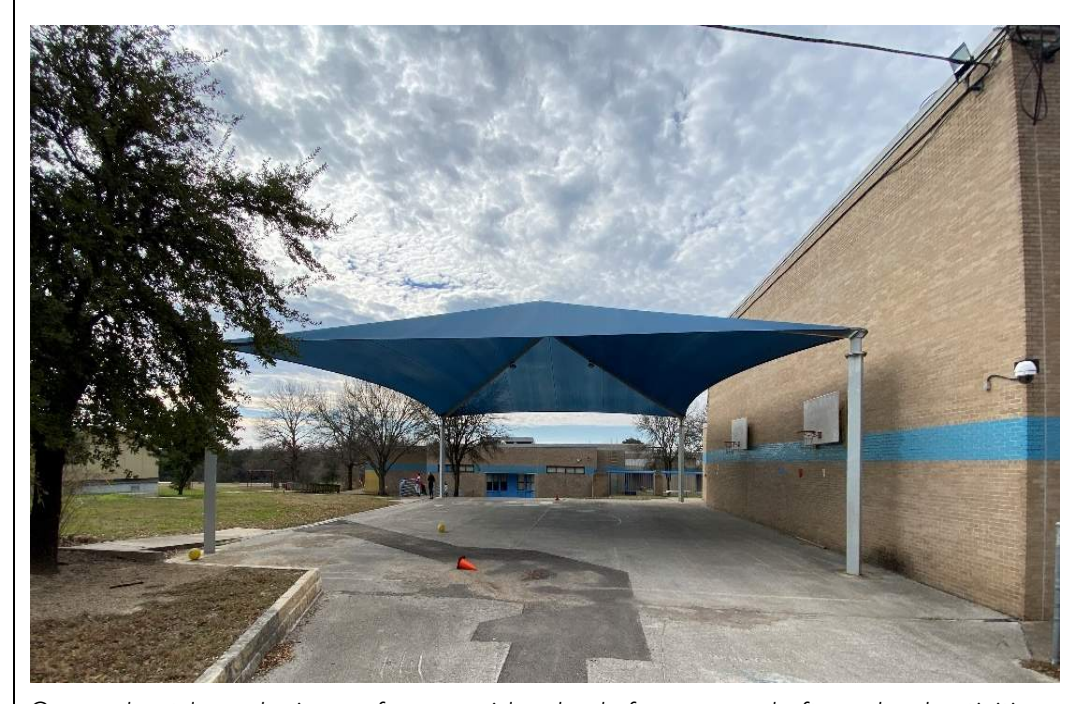
Covered outdoor playing surface provides shade for gym and after-school activities.