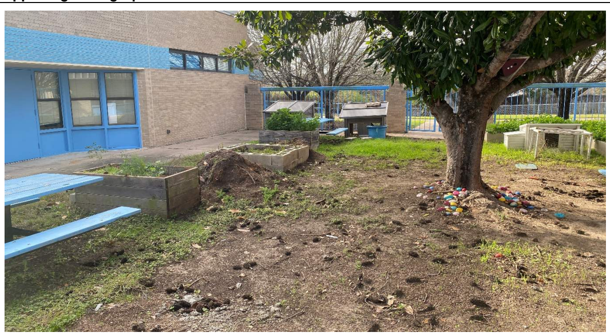
Outdoor garden is a valued learning space and has one medium-sized tree to provide some shade.