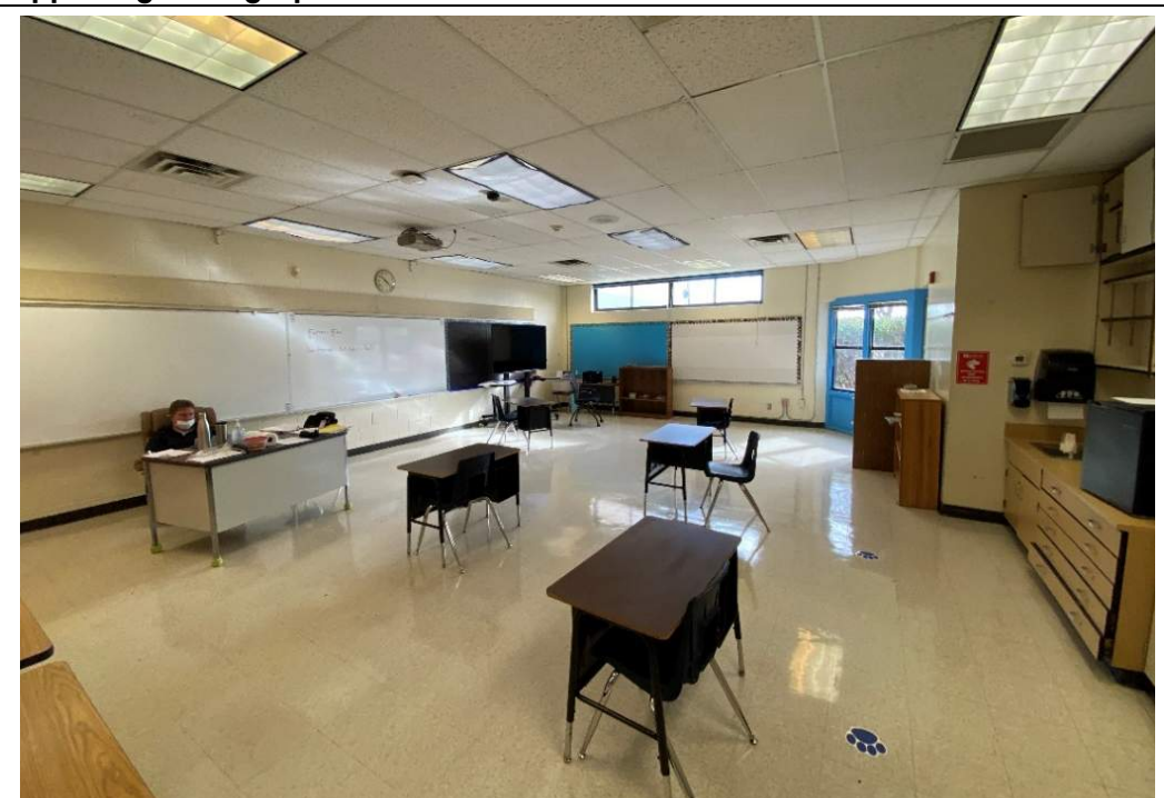
Academics and Learning: Studio storage space and furniture are dated.