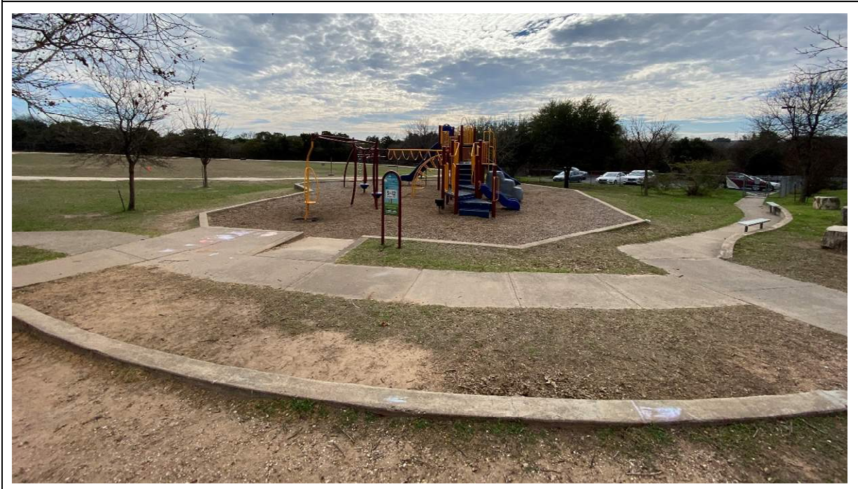
Playground space with no shade. Sidewalks are broken in some places and need upgrades to be ADA accessible. Picnic tables are in poor condition.