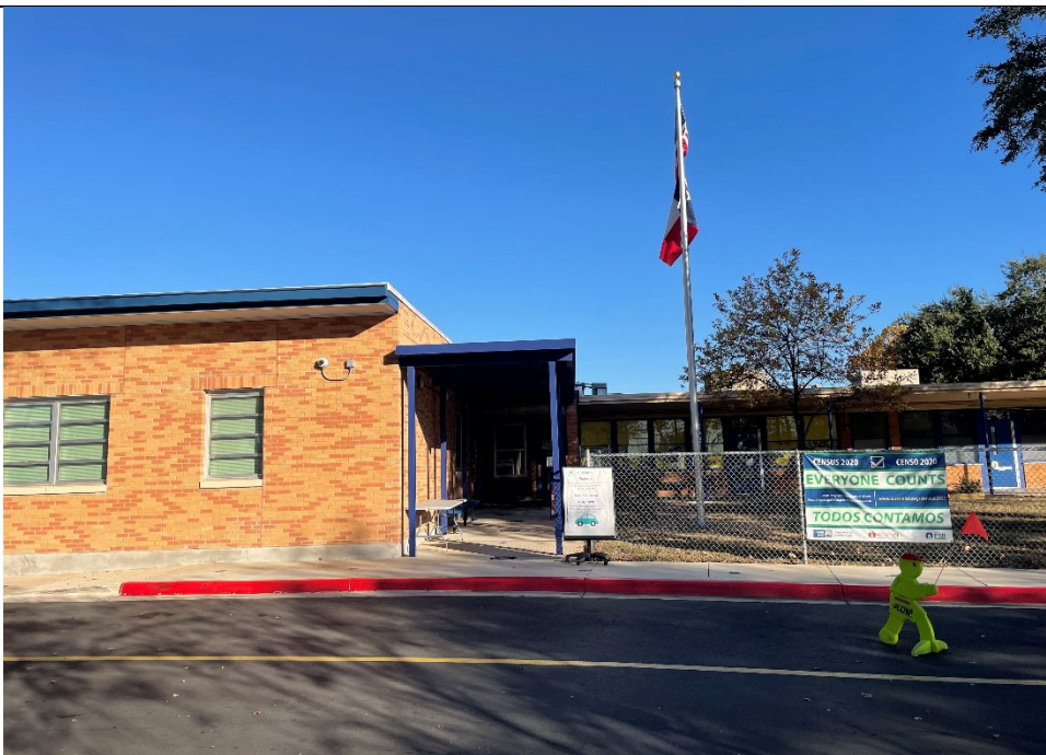
Main entry is well-defined and covered with an awning.