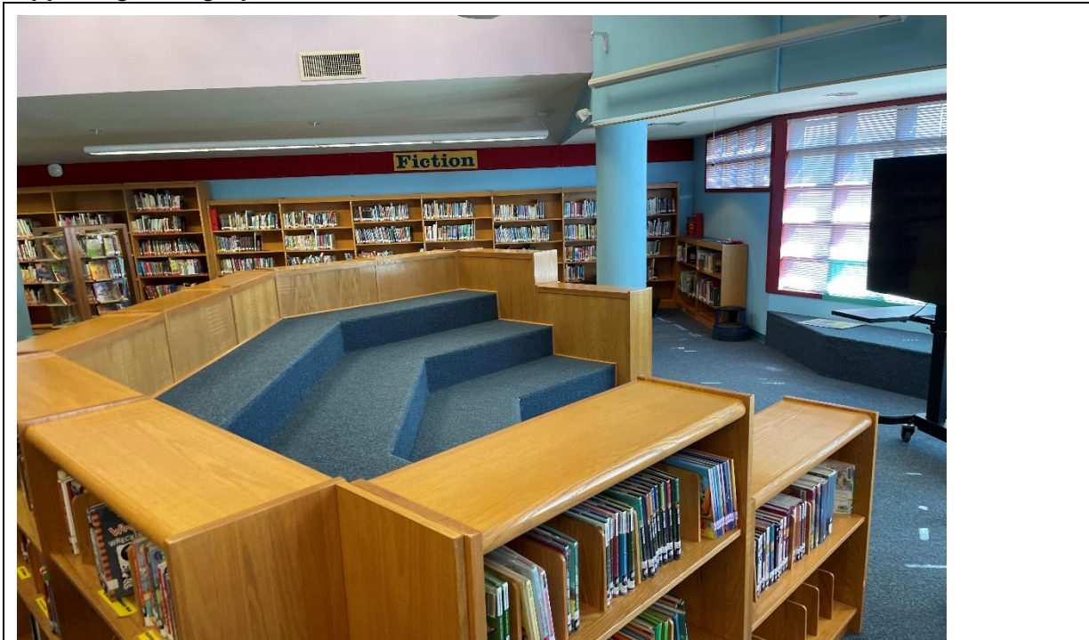
Media Center: Library is in good condition but needs bigger screen and projector.