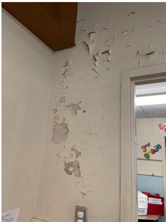
Studio walls are cracking, and paint is failing.