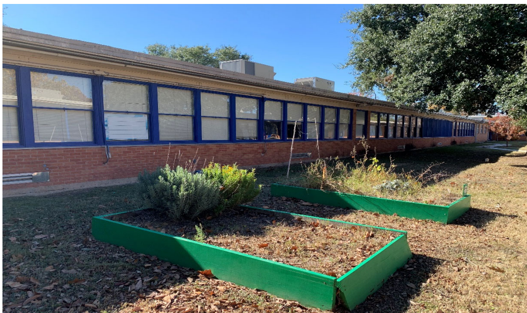
Garden is small and needs improvements to function well.