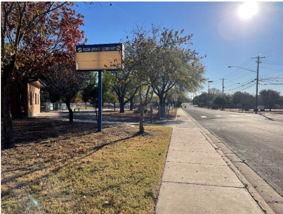
School marquee is cracked, in poor condition and not visible.