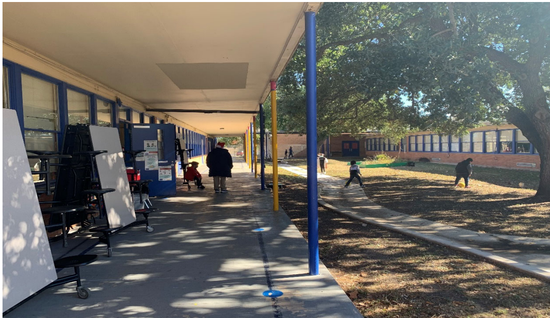
Exterior breezeways connect campus. Outdoor space between wings needs upgrades. There have been recent improvements to courtyard drainage.