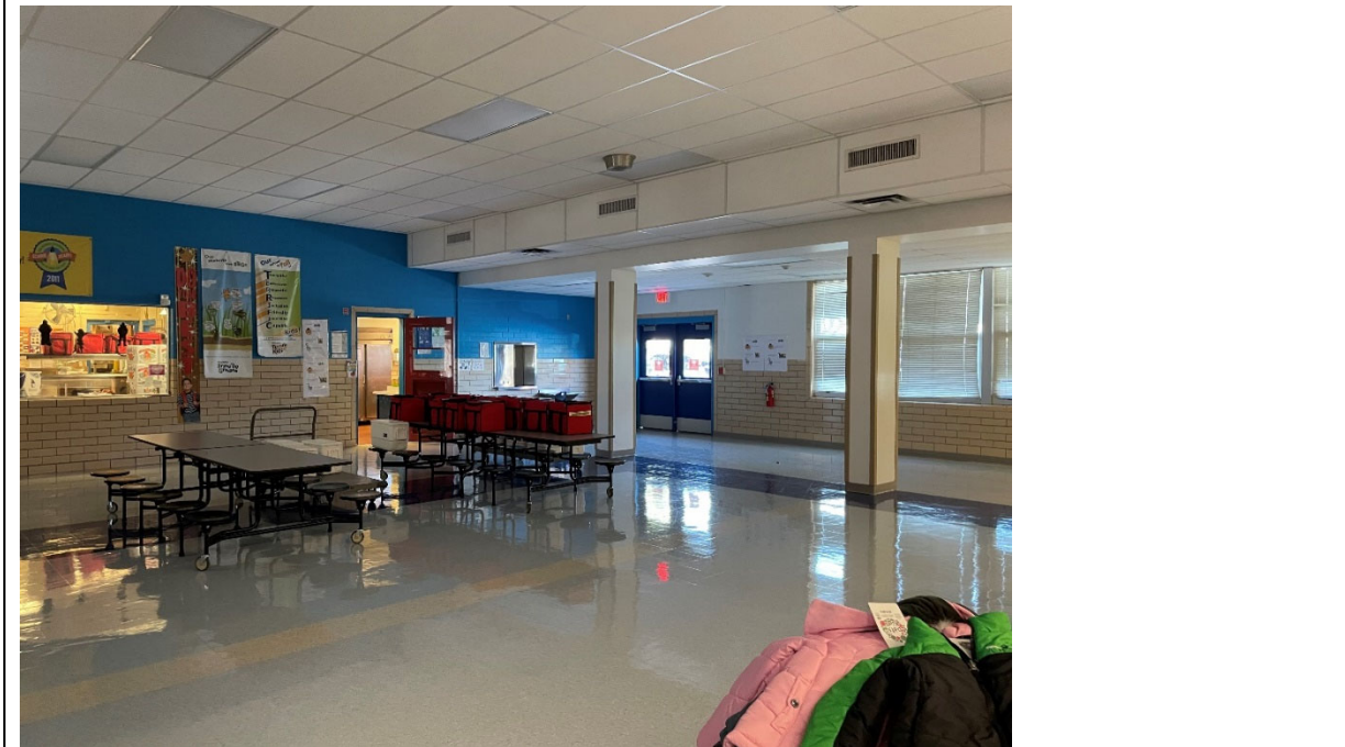
Cafeteria is accessible to outdoor area, but no outdoor eating space is provided. Small community meetings are held in the cafeteria. Upgrades in 2019 included ceiling, lighting and flooring replacement.