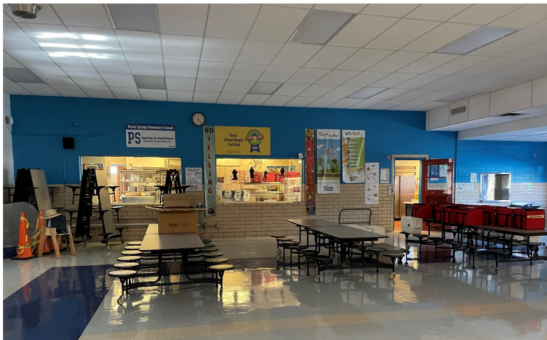
Cafeteria is adequately sized for campus capacity. Kitchen and serving line are undersized.