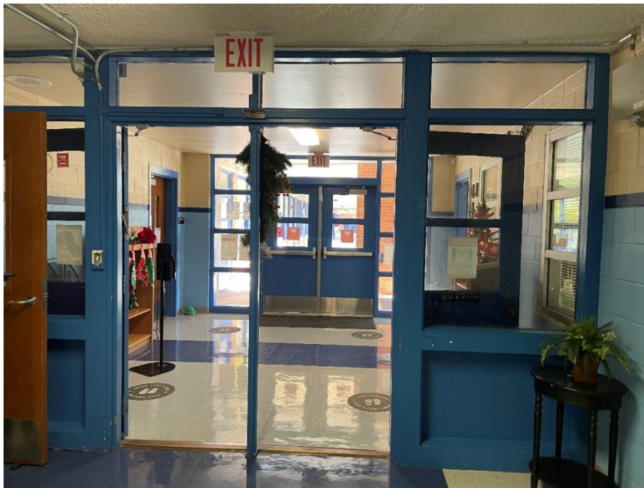
Main entry vestibule is generous but finishes and paint are dated.