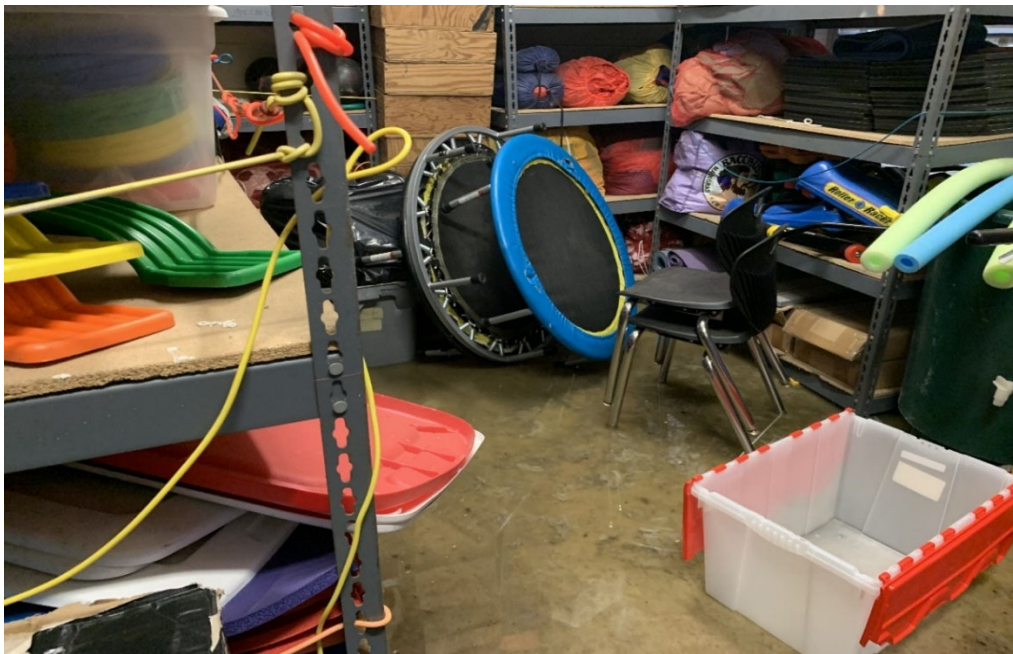
Gym: Adequate space, but storage is insufficient. Sewage backups have flooded one of the storage spaces.