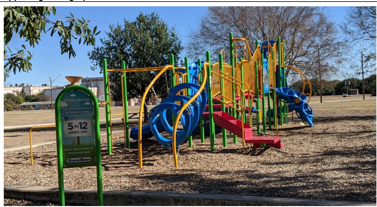
Playground in good condition but uncovered.