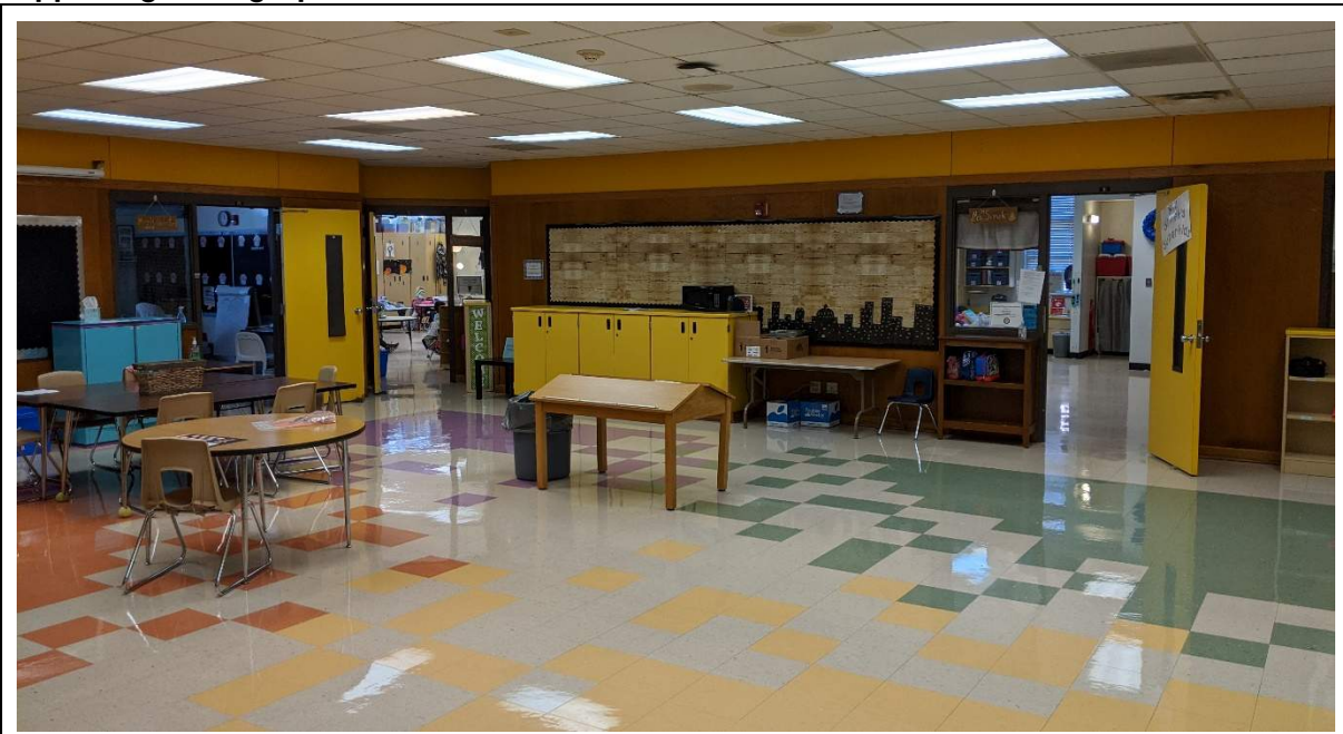
Shared commons area between cluster of studios.