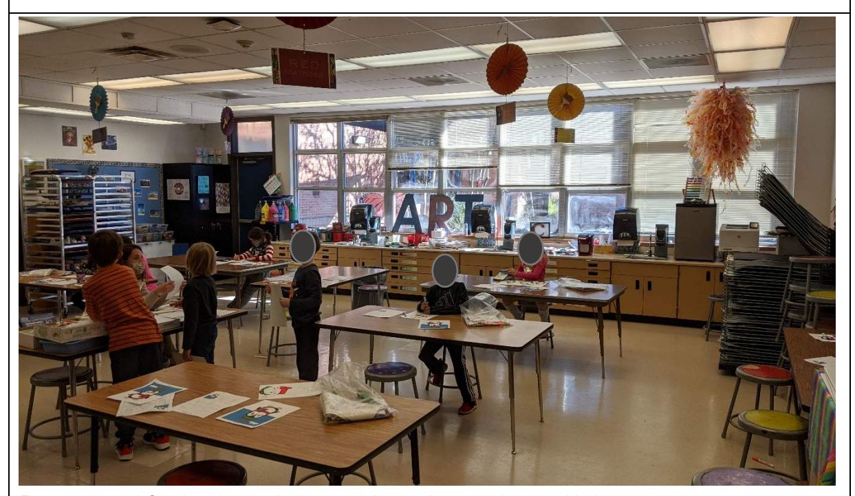
Environmental Quality: Art studio has ample windows and natural light.