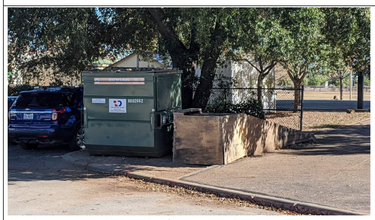
Waste bins are not accessible and makeshift ramp is required.