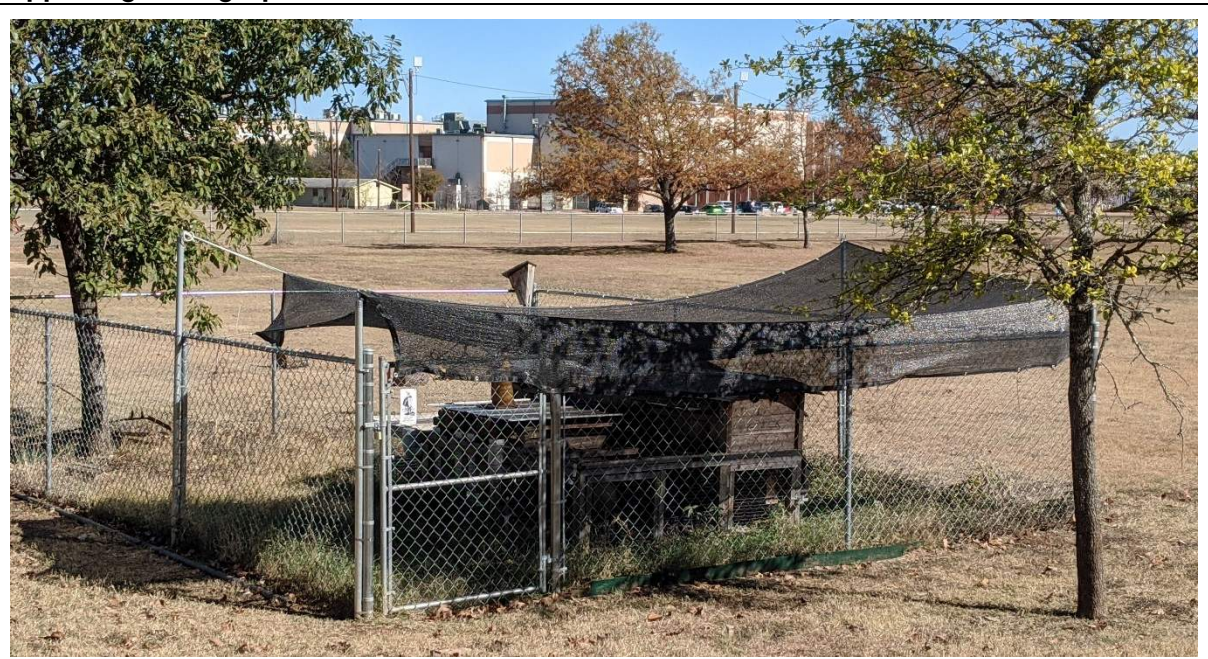
Chicken coop on campus.