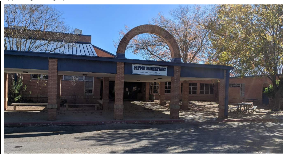
Main entry has good building identification.