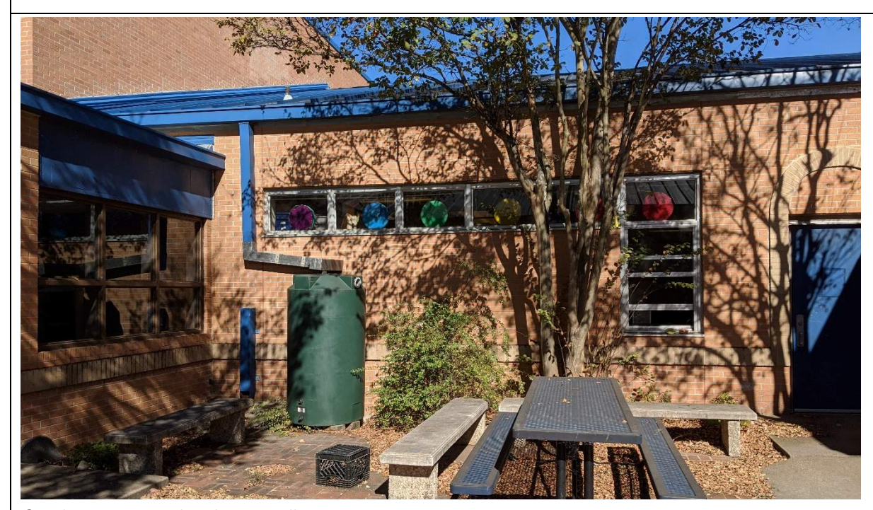
Outdoor courtyard with rain collection cistern.