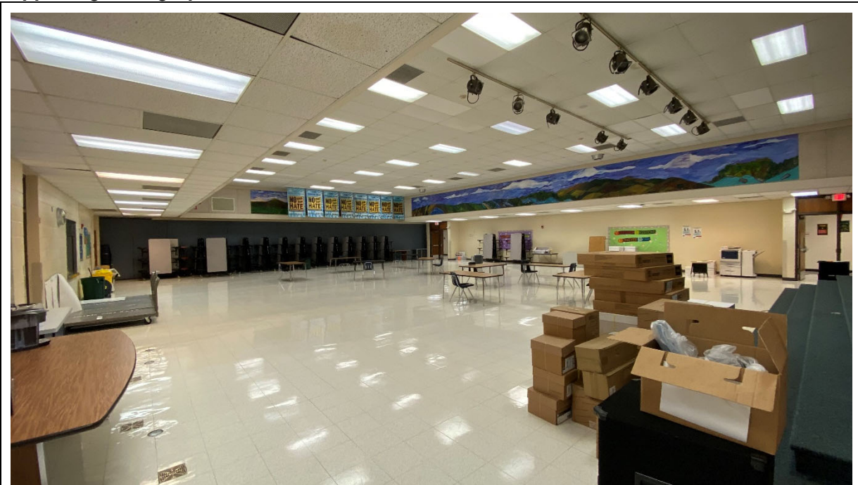
The cafeteria is appropriately sized and connects to the gym with an operable wall. There is only one seating type available and no access to natural light.