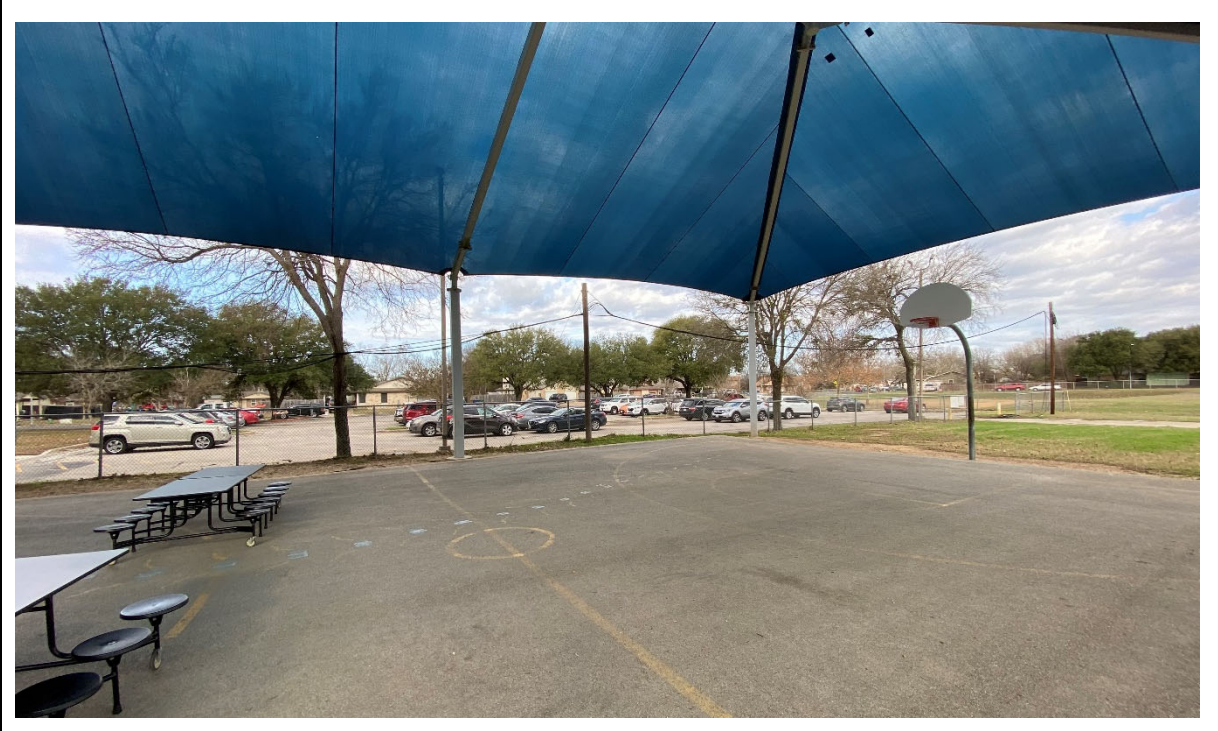
Outdoor Learning and Activity: Large outdoor courts with a canopy cover are located directly off the gym with easy access to other outdoor activity areas.