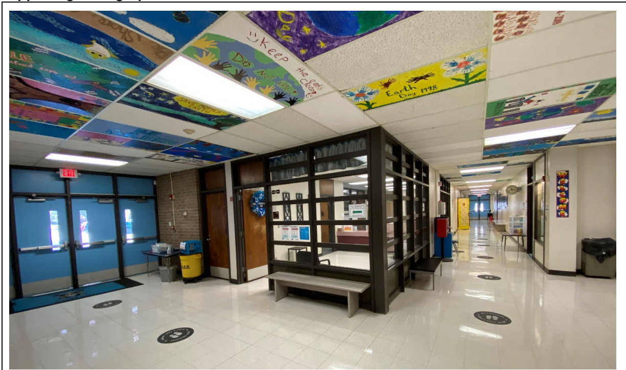
The main entry is bright and colorful with painted ceiling tiles.