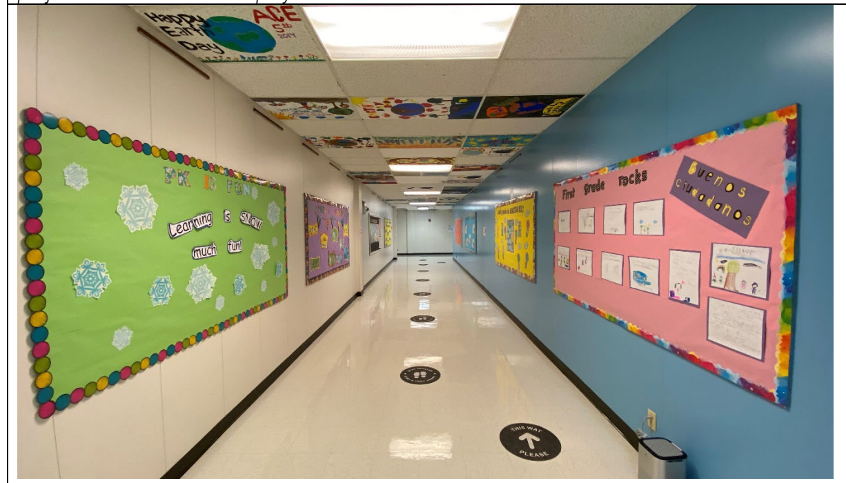
Corridors are an adequate width, and there are many opportunities to display student work on walls throughout the campus.

All studios have windows with access to natural light and views of nature and are equipped with projection and mobile TV displays.