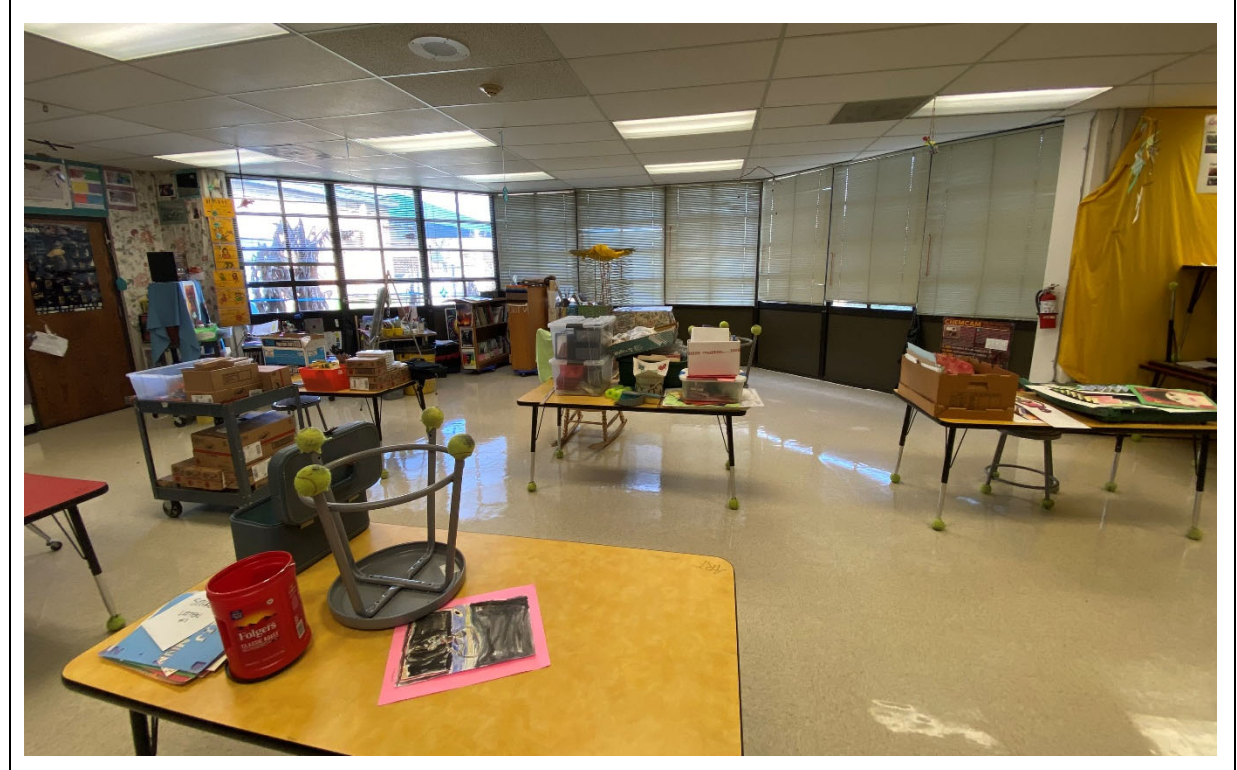
Large art studio has adequate storage closet space as well as a kiln and three sinks.