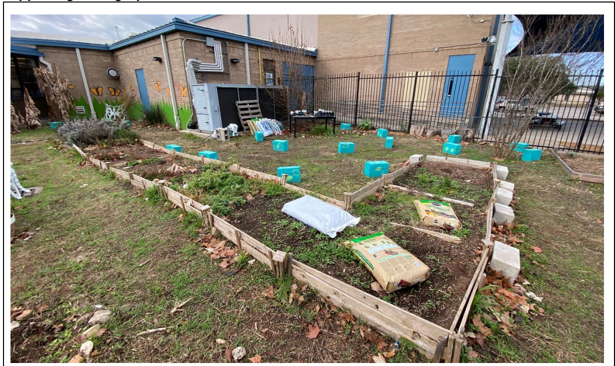
Outdoor Learning and Activity: A large, fenced garden area has stools for outdoor learning and close access to water.