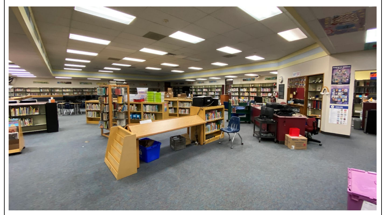
Media Resources: The library is generously sized but lacks flexible furniture and book stacks for easy reconfiguration.