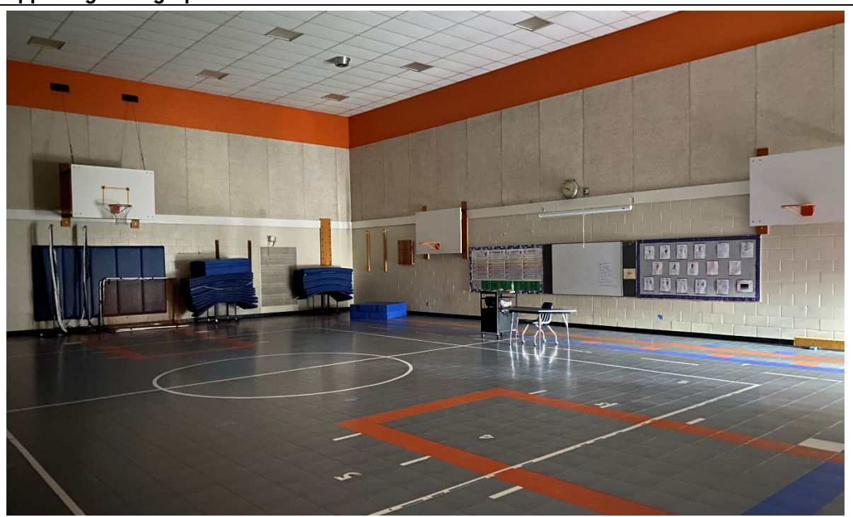
The gym is appropriately sized and equipped with a projection screen, as well as other teaching instruments such as markerboards and tackboards.