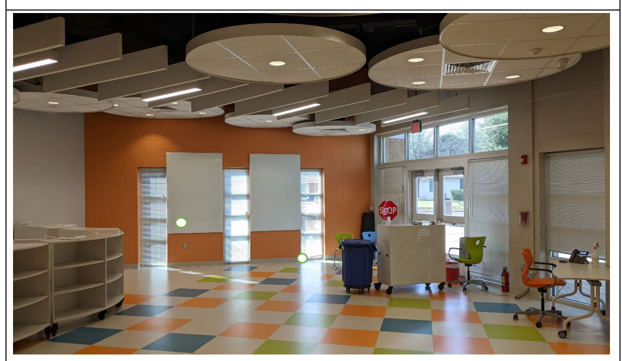
Academics and Learning: New flexible multipurpose space.