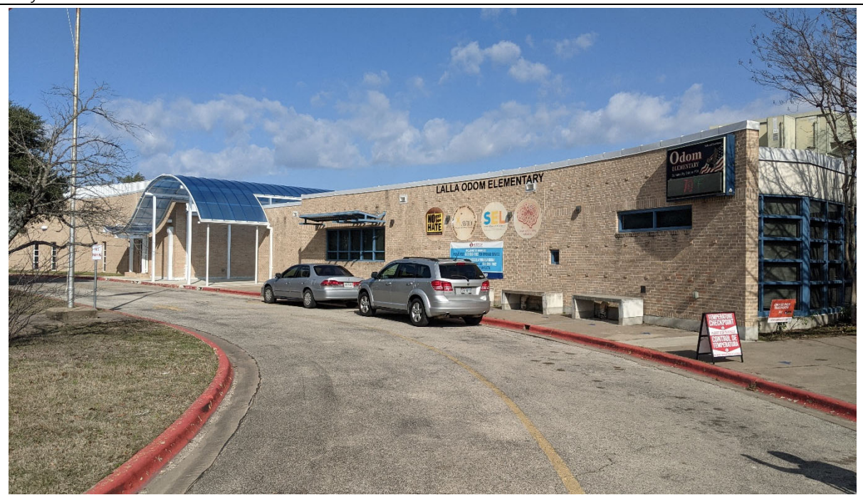
Exterior: Main entrance with new curved canopy.