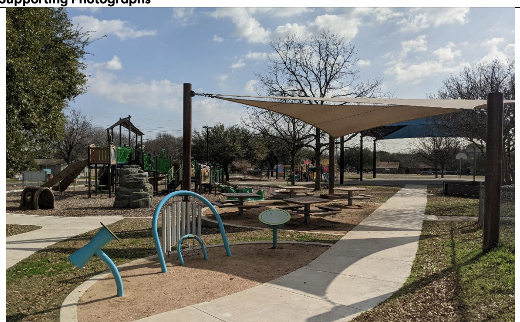
Outdoor Learning and Activity: Grouping of tables provides area for outdoor leaning. Playscape beyond does not have shade.