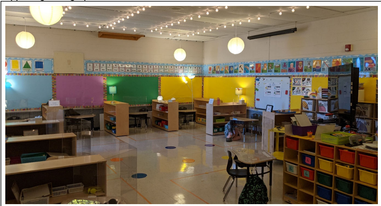
Academics and Learning: Typical studio in the pod wing of the campus.