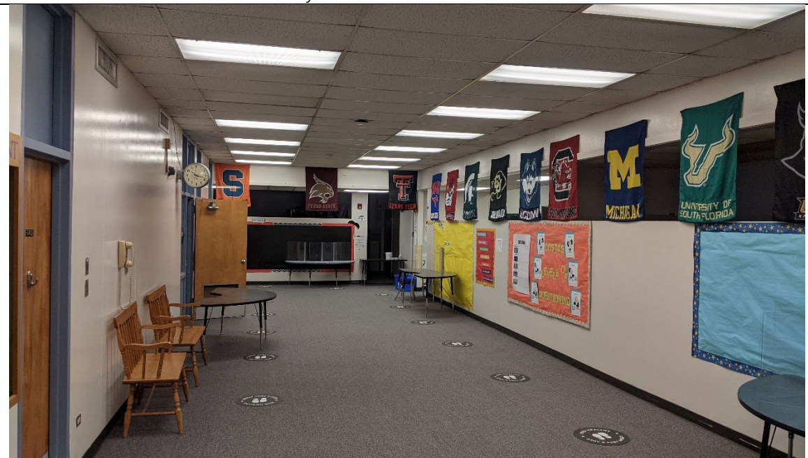
Academics and Learning: Half-wall creates a large circulation area directly adjacent to studios. Large circulation area has potential for use as collaboration spaces.

Media Resources: Library reading room is large and has an exterior door to help with access for after-hours events. There is a variety of new furniture.