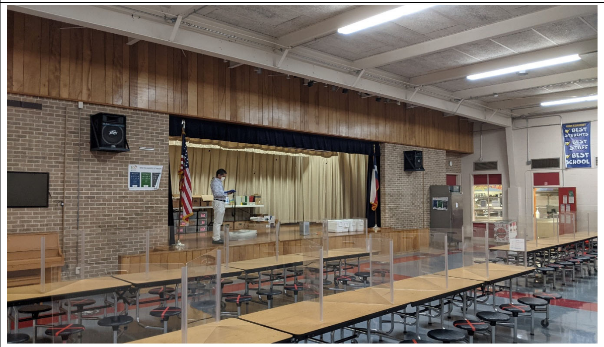
Stage area in the cafeteria needs upgrades to make it work effectively.