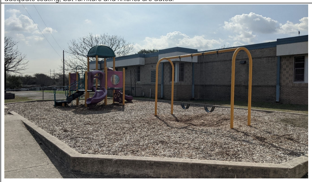
Outdoor Learning and Activity: Playscape that does not have shade.