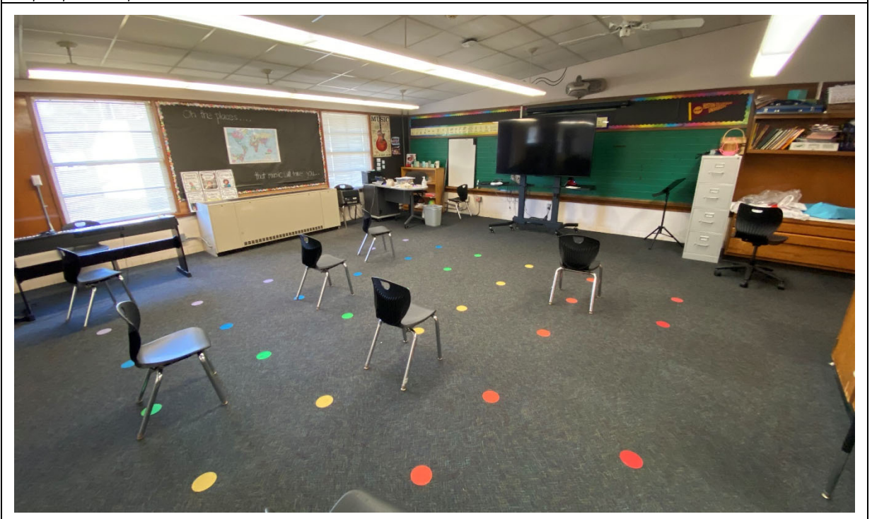
Academics and Learning: Good natural light in the space. Studio is adapted to current COVID-19 protocols. There is a mix of old and new technology. Projector is outdated and storage space is inadequate.