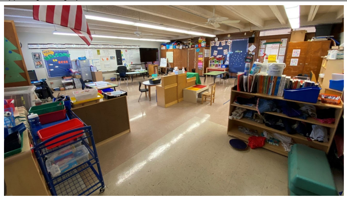
Pre-K studio: Space is adequate. Storage is not standardized in the studios.