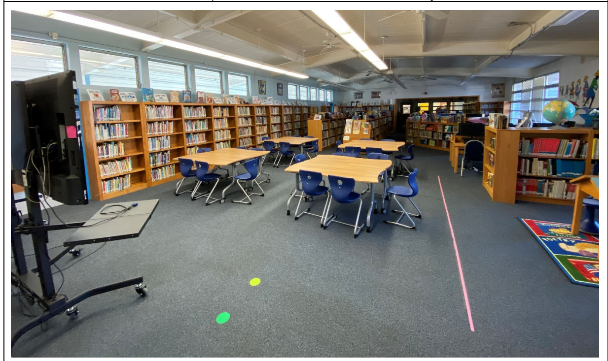
Media Resources: Space is adequate in size, but no quiet study rooms provided. There is a mix of old and new technology.