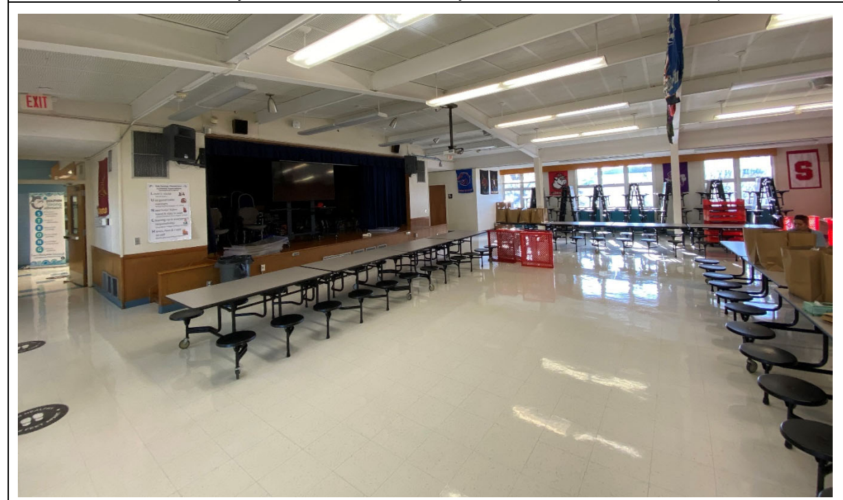
Cafeteria stage is not ADA accessible, and storage is inadequate. There is no variety in the types of seating provided.