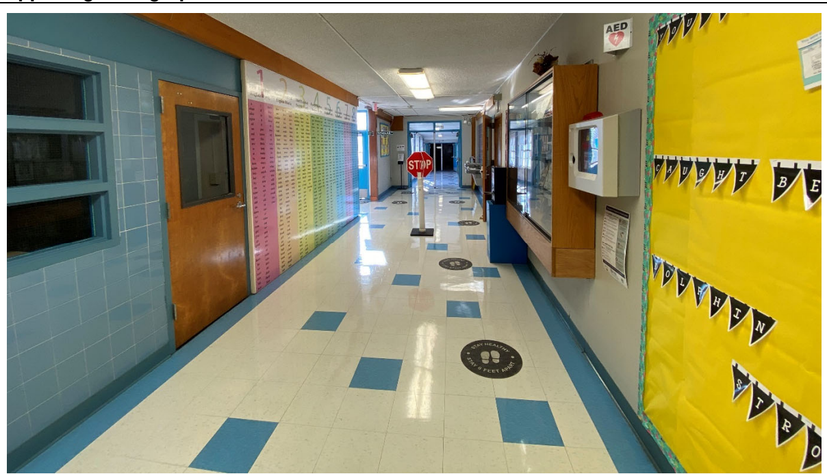
Corridors are wide and well lit. There are locations for 2D and 3D display in corridors.