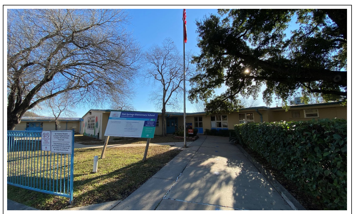
Main entrance is not clearly marked and is not directly accessible from a student drop off area.