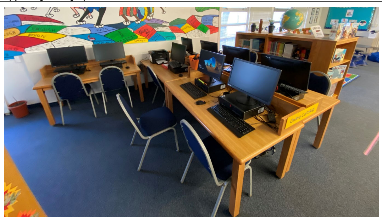
Media Resources: Insufficient computers and outdated furniture is bulky and not flexible.