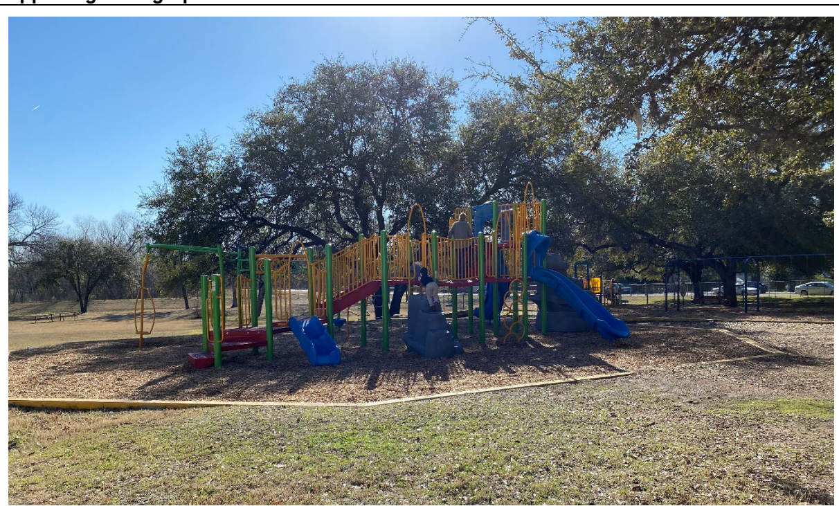
Outdoor play areas are provided but do not have shade.