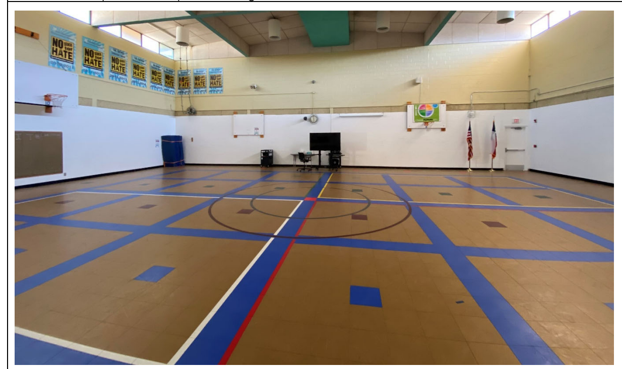
PE and Wellness: Gym is adequately sized but needs updates to function well. Flooring is uneven and outdated. There is shortage of storage space.