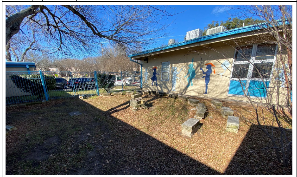
Central courtyard near the entrance serves as outdoor learning space. It needs shade and appropriate furniture to function well.