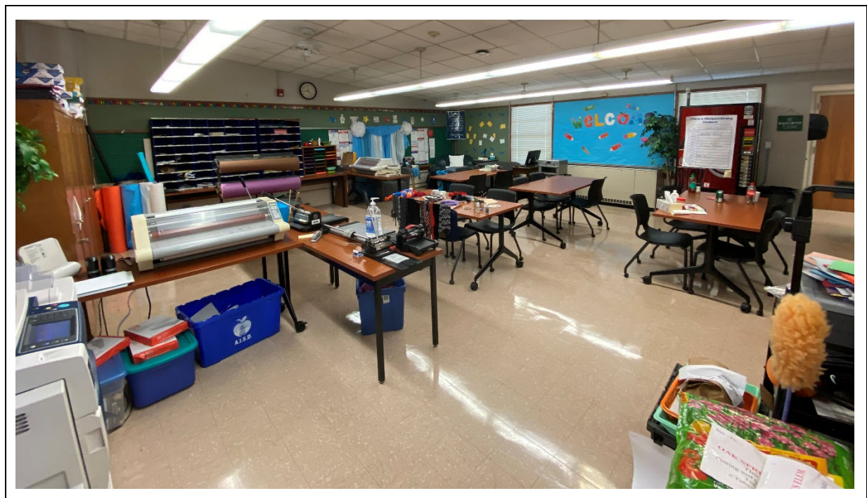
Repurposed space used as a workroom.