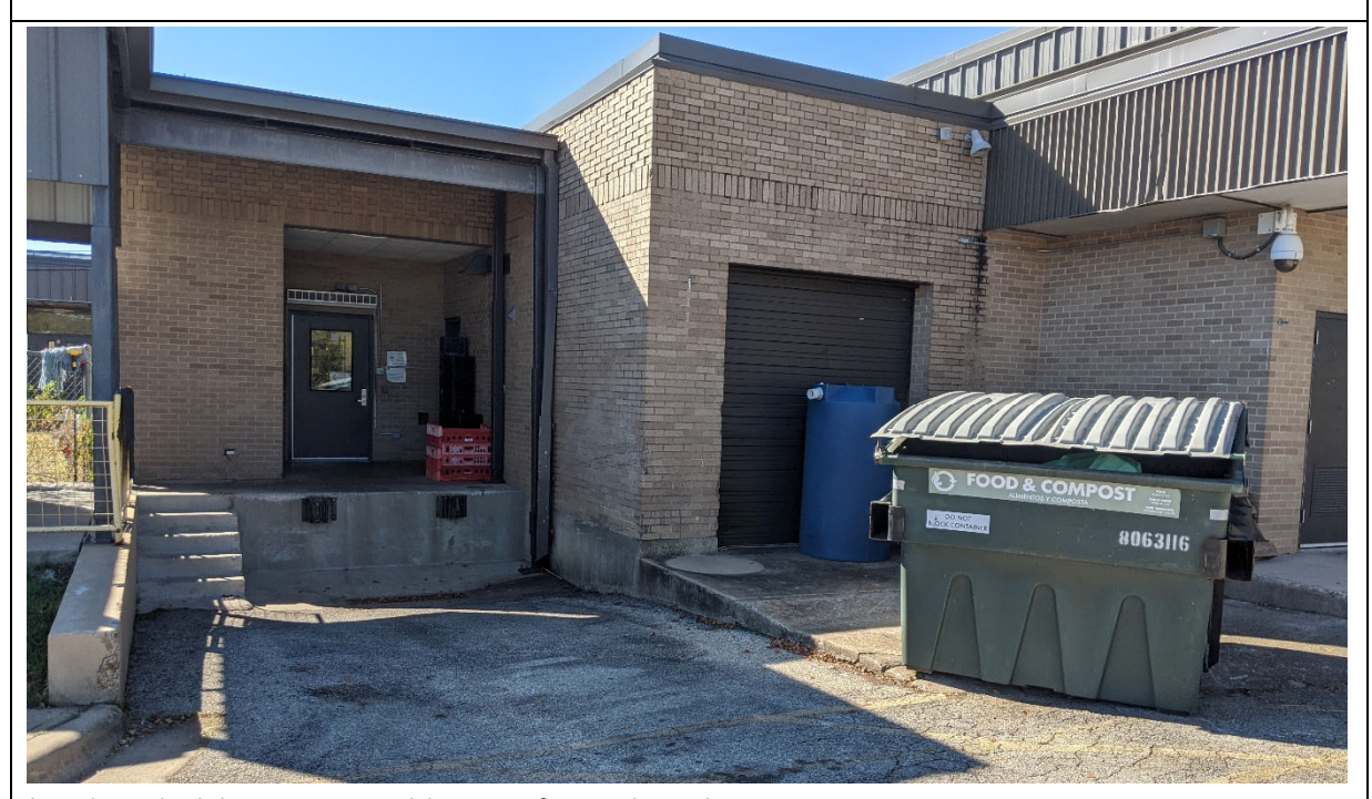
Loading dock but no accessible route for trash and compost.