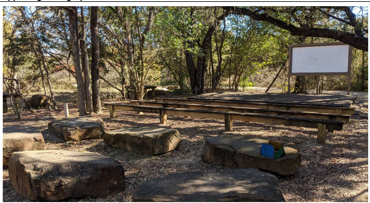
Outdoor Learning: Outdoor classroom could be very well used if the mosquito problem is solved.