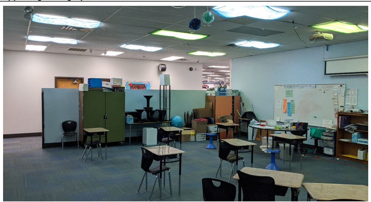
Environmental Quality: No natural light and no acoustic or visual privacy in studios.