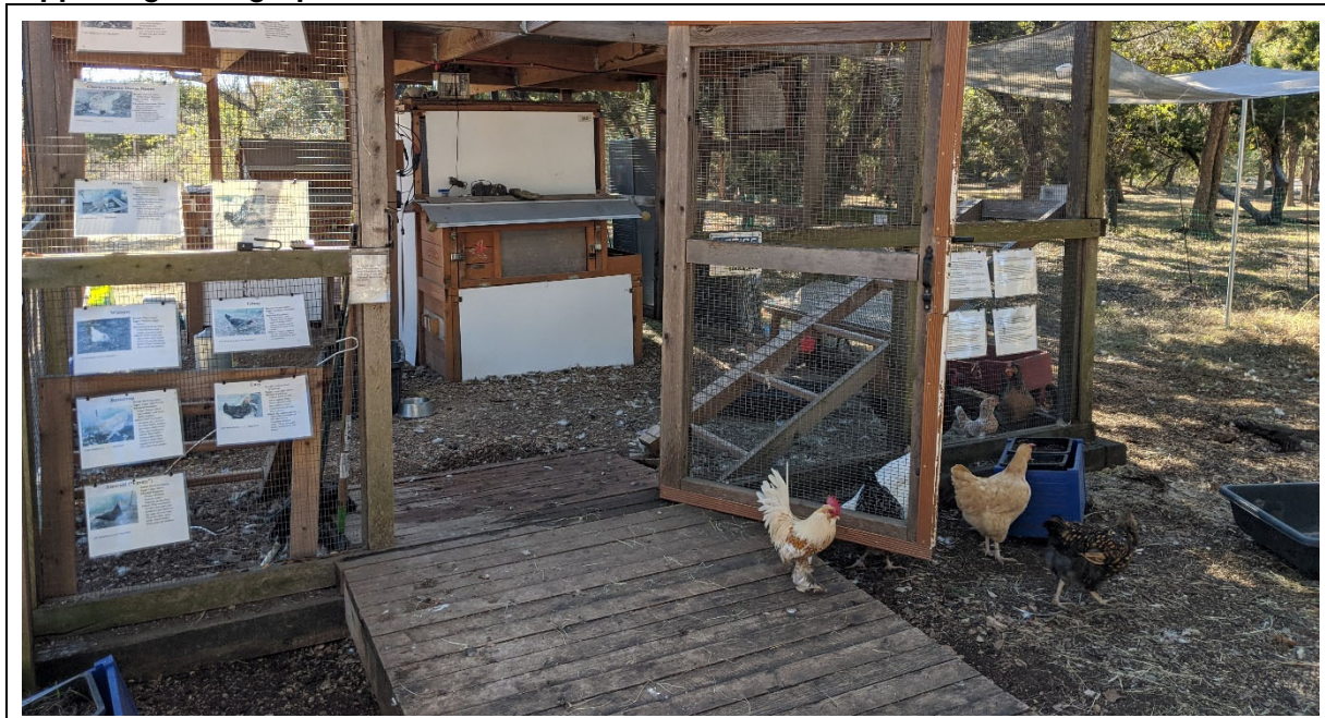
Outdoor Learning: Large chicken coop and fenced area.