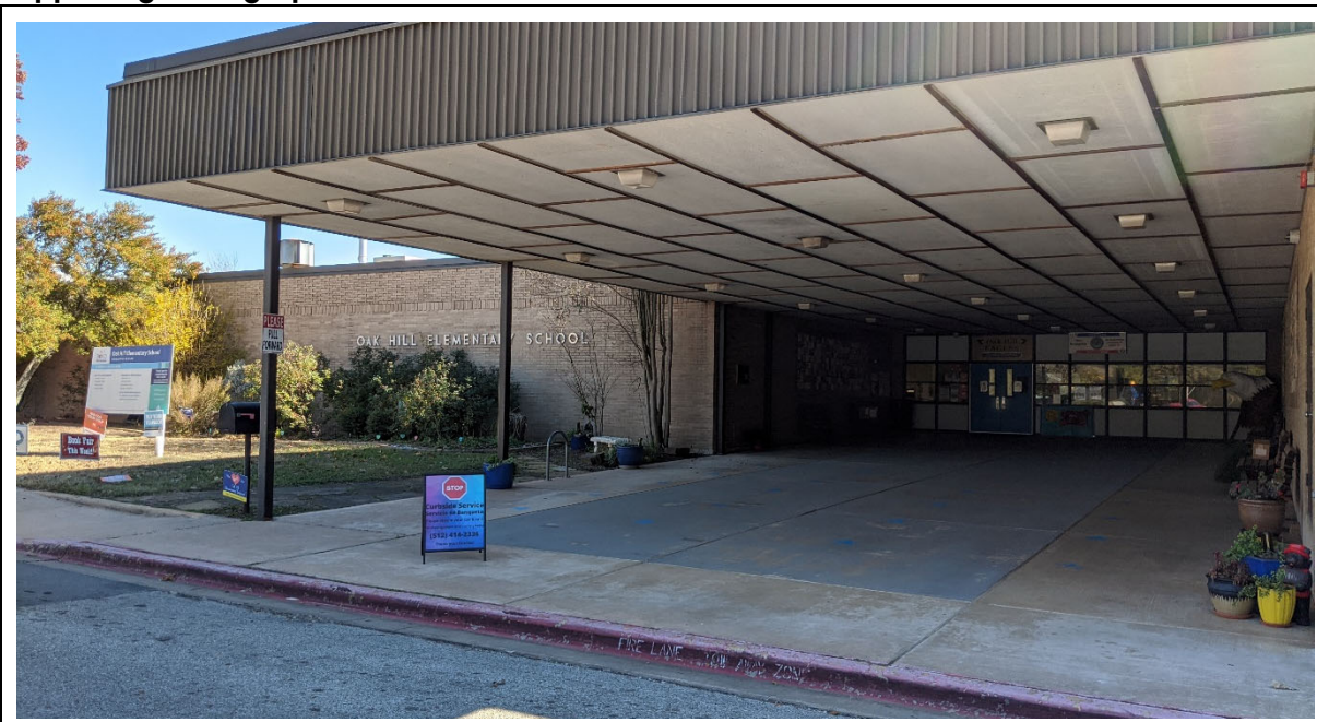
Main entry to the school with large canopy.