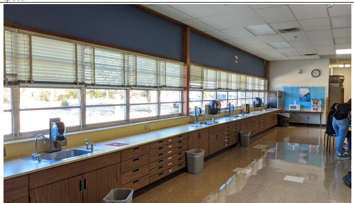
Environmental Quality: Most daylight comes from large areas of sinks at both ends of school.