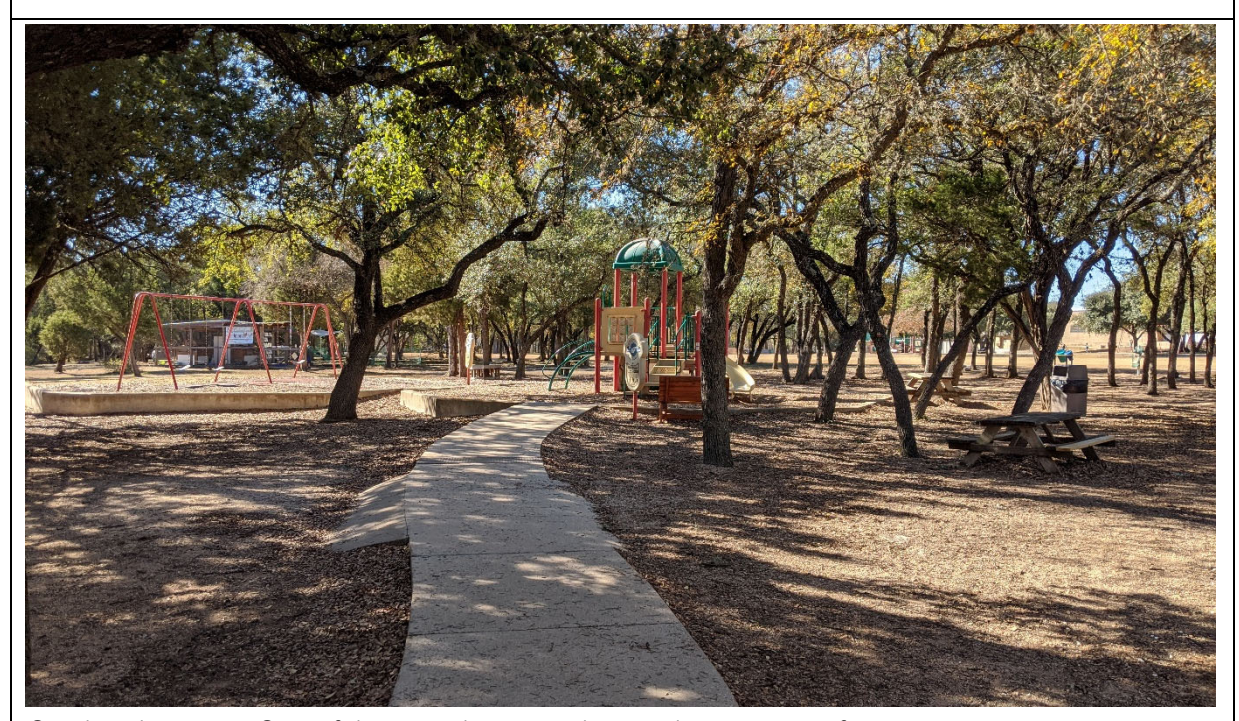
Outdoor Learning: One of the two playgrounds set in large grove of trees.