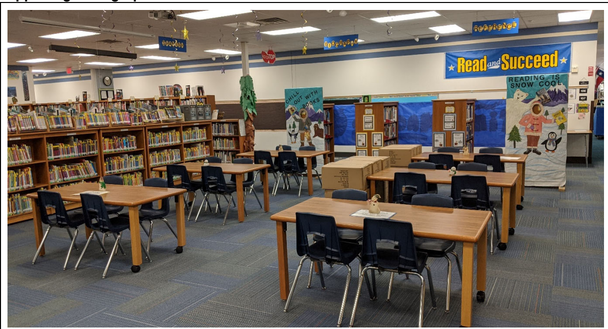
Media Center: Library has movable furniture and some stacks that can move to reconfigure the space.