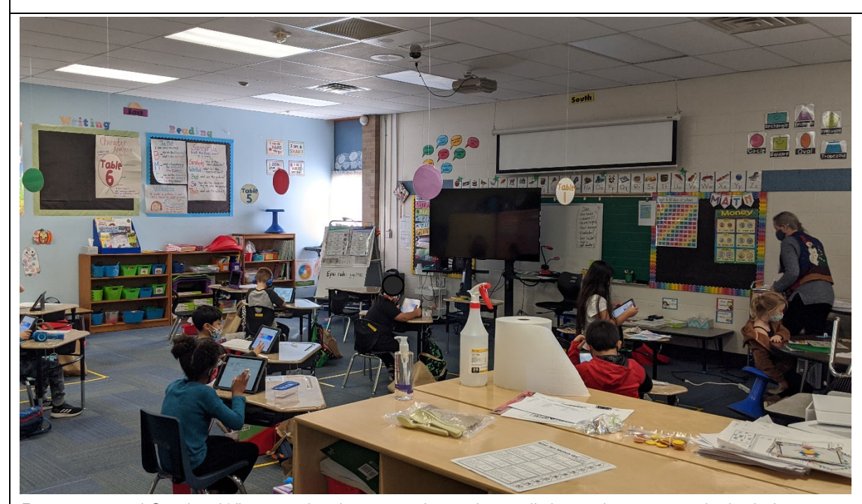
Environmental Quality: When studios have windows, they still do not have enough daylight.