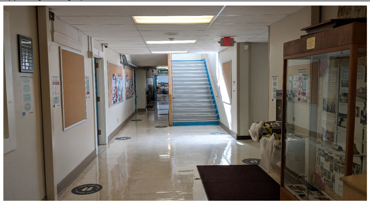
Hallway space and display area.