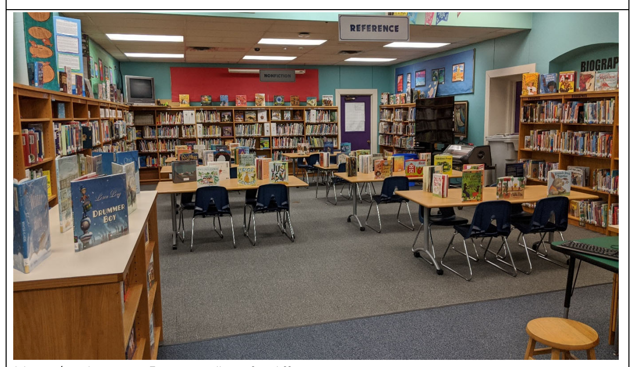
Library/media space. Furniture allows for different size groups.