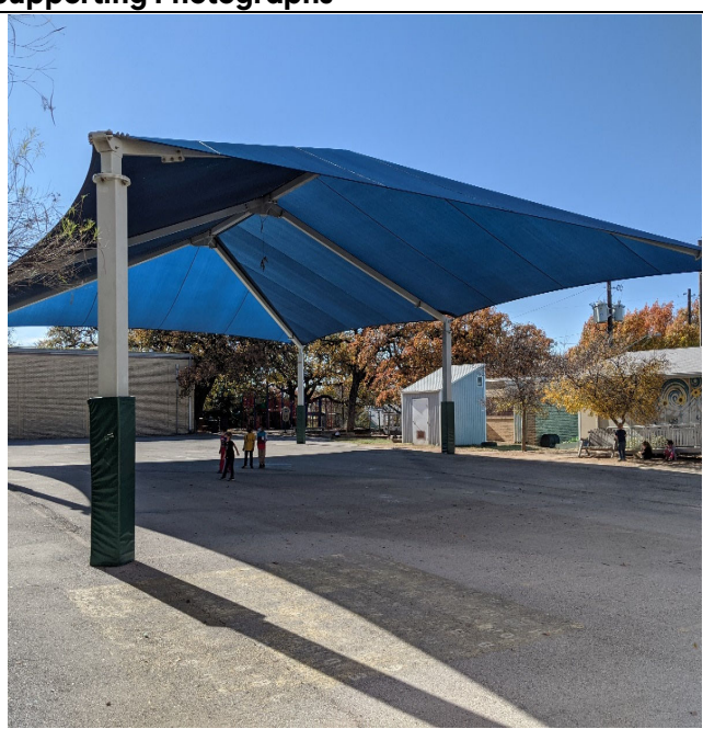
Outdoor playground area. Concrete area takes large portion of playground area.