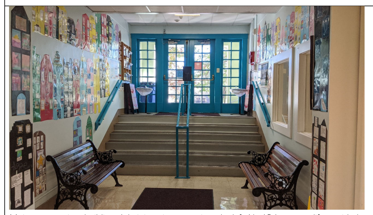
Main entrance into building. Administration space is to the left. No ADA ramp or lift provided.