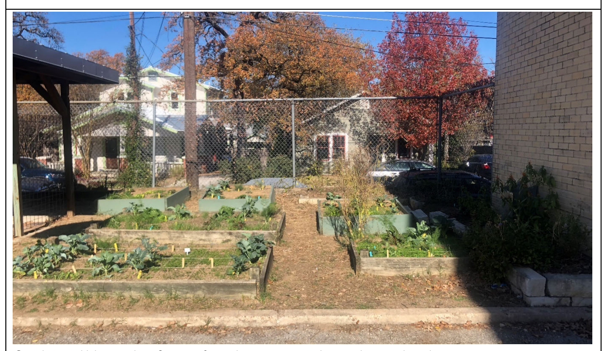
Outdoor edible garden. Series of garden spaces make up the outdoor learning spaces.