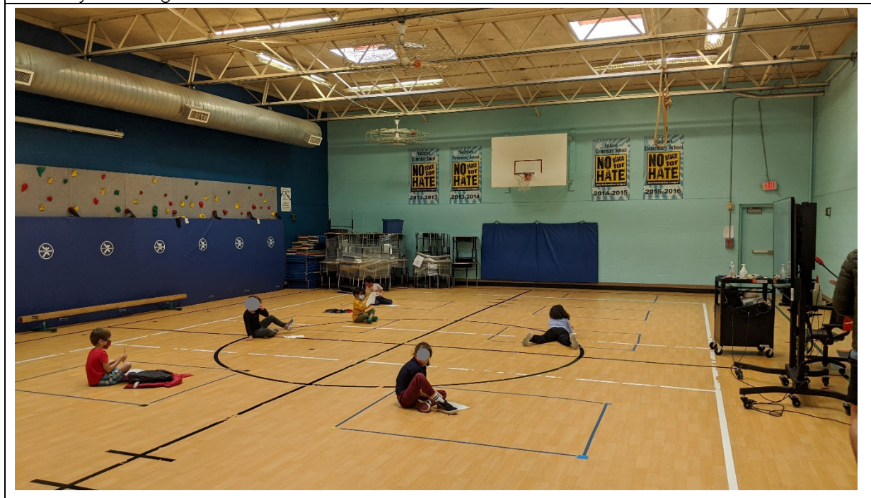
Gymnasium area has limited storage and is undersized.