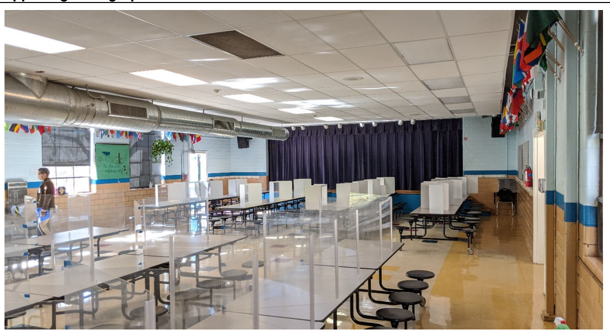
Cafeteria and stage area are undersized and do not meet Ed Spec. Furniture does not allow for flexibility. The stage is not accessible.