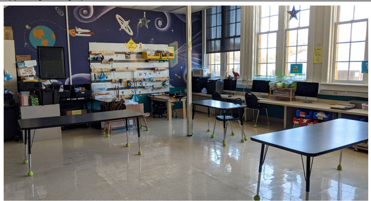
Maker space on the second floor. Ample room and equipment. All studios have abundant daylight and access to views.