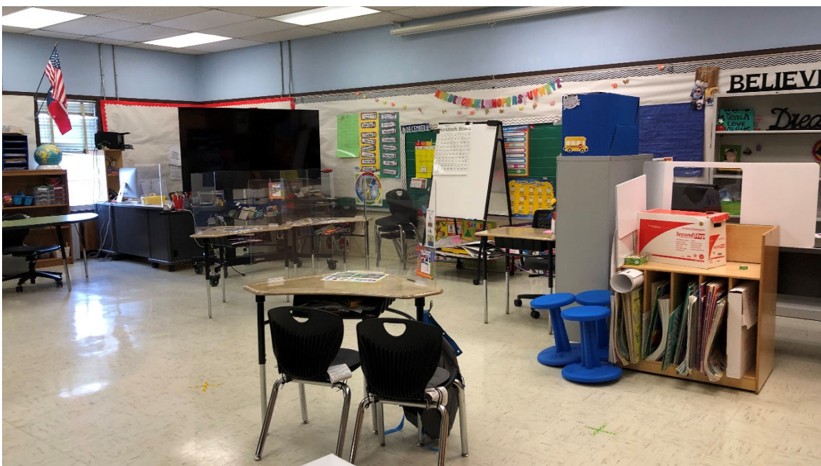
Many studios need more storage space and have a mix of old and new furniture.