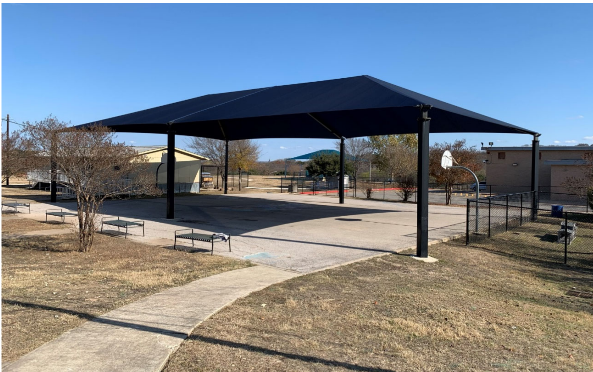
Large outdoor court/play pad with a large canopy is in excellent condition.