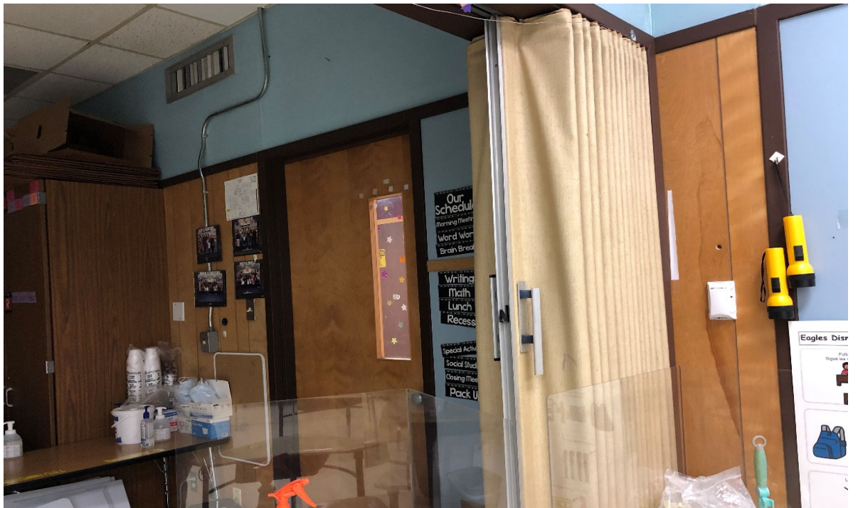
About half of the studios have aged operable partitions that may not perform well acoustically and are not always in functioning condition.