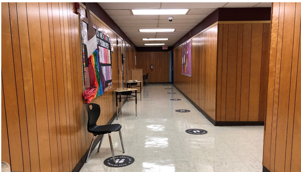
Corridors are narrow and maze-like, and lack of wayfinding makes it difficult to navigate.