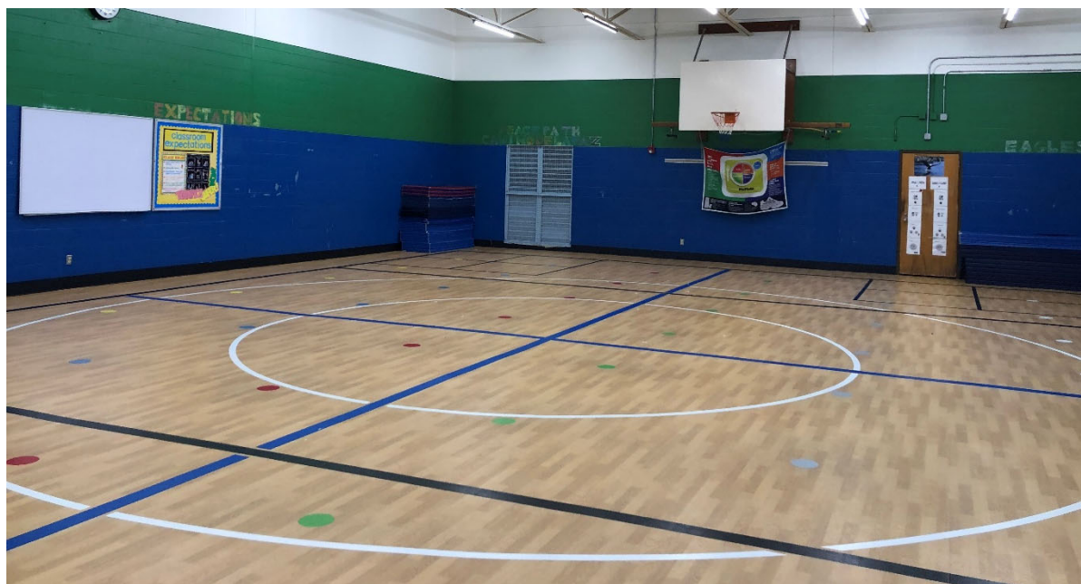
Gym is connected to the cafeteria with an operable partition. The floor appears to be new and is in excellent condition, but paint on walls is chipping or peeling in many places.