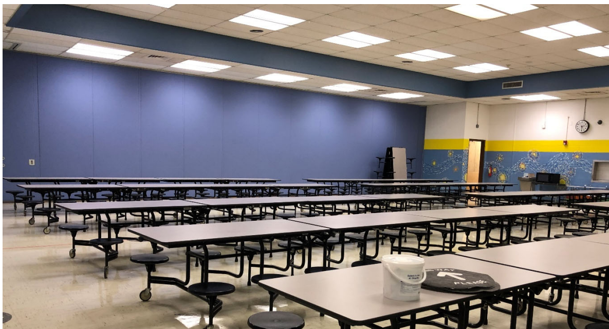
Cafeteria has only one option for seating and is slightly undersized with limited circulation space.