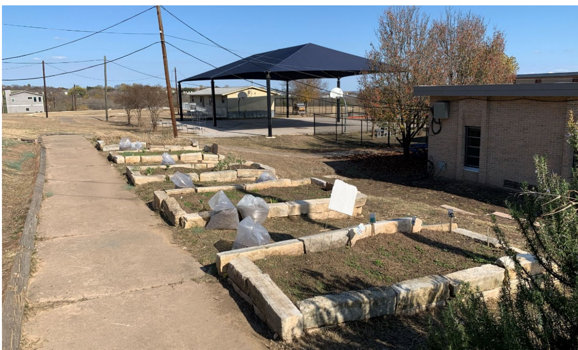
Campus garden spaces have close access to water and are near other outdoor activity and learning features.