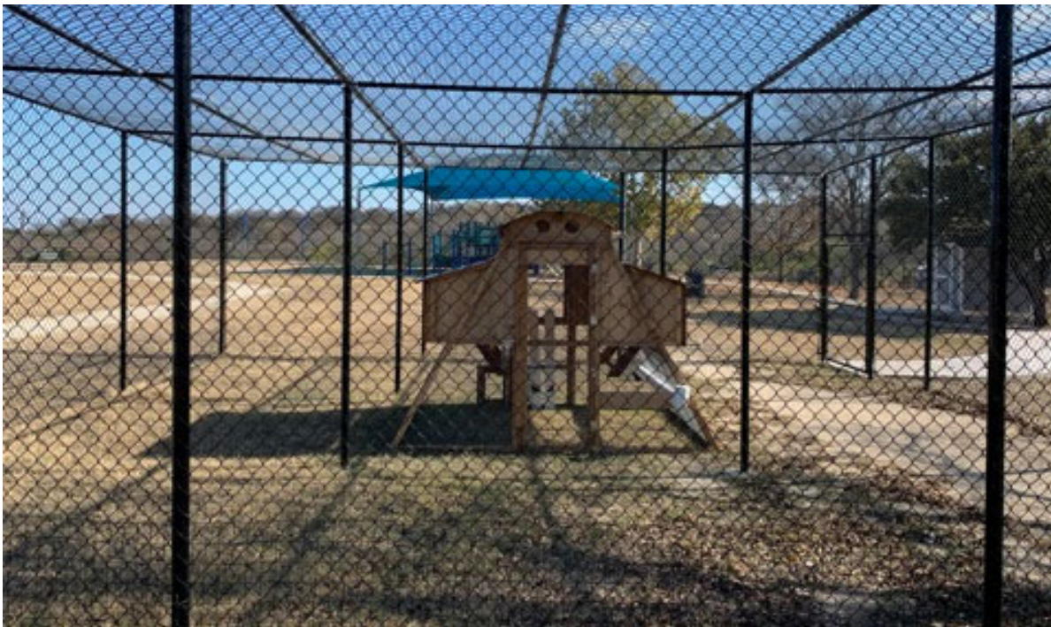
New chicken coop and fencing near small outdoor learning space.