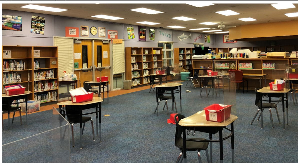
Library is undersized with limited space for larger groups and no private study spaces. Needs updates to function well.