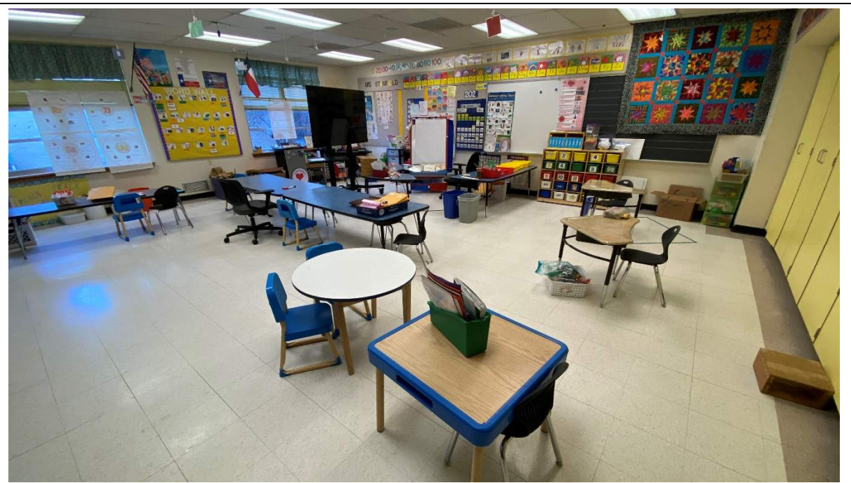
Kindergarten studios have a variety of furniture types and adequate storage. There are no attached restrooms.