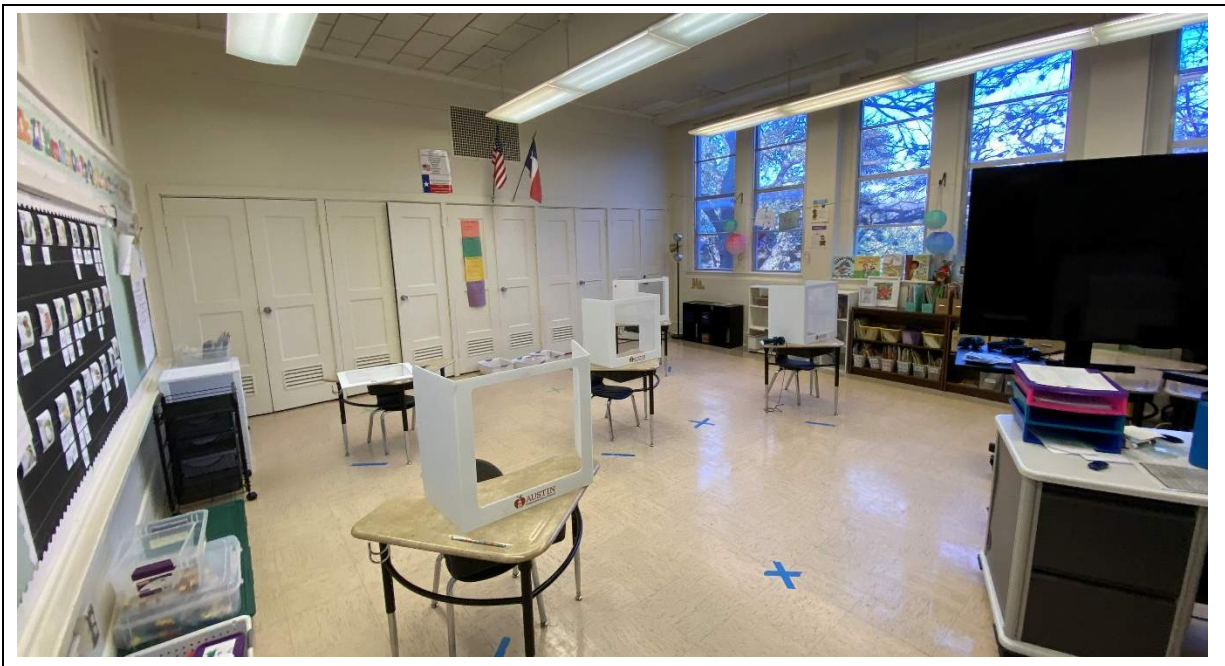
Studios are small but have an abundance of natural light. Most studios have built-in storage closets.