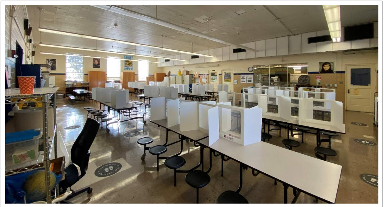
Dining commons area is undersized and does not have connection to outdoors or other seating options.