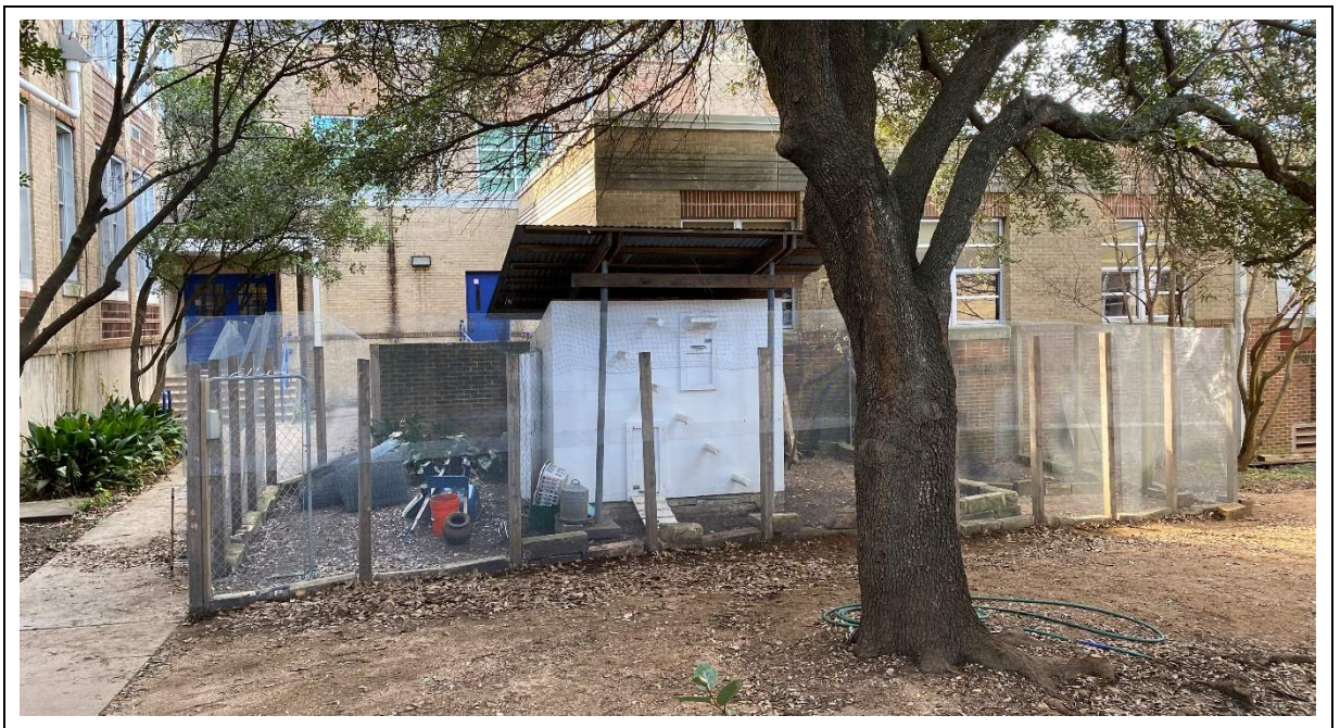
Chicken coop was donated by a parent.