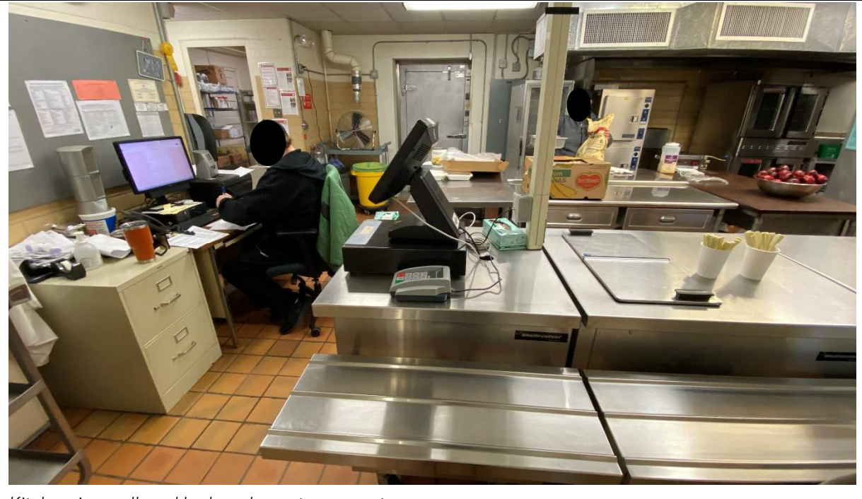
Kitchen is small and lacks adequate support spaces.