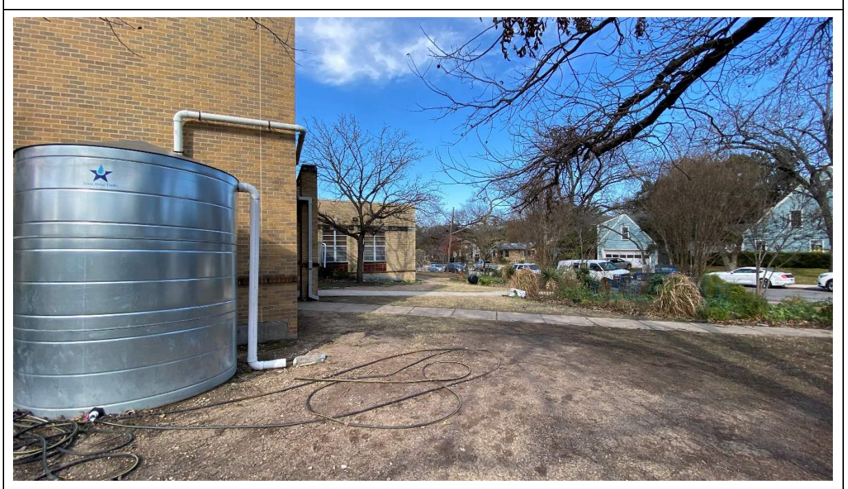
One of the cisterns and the outdoor gardens are on the front of the campus and visible to the community.