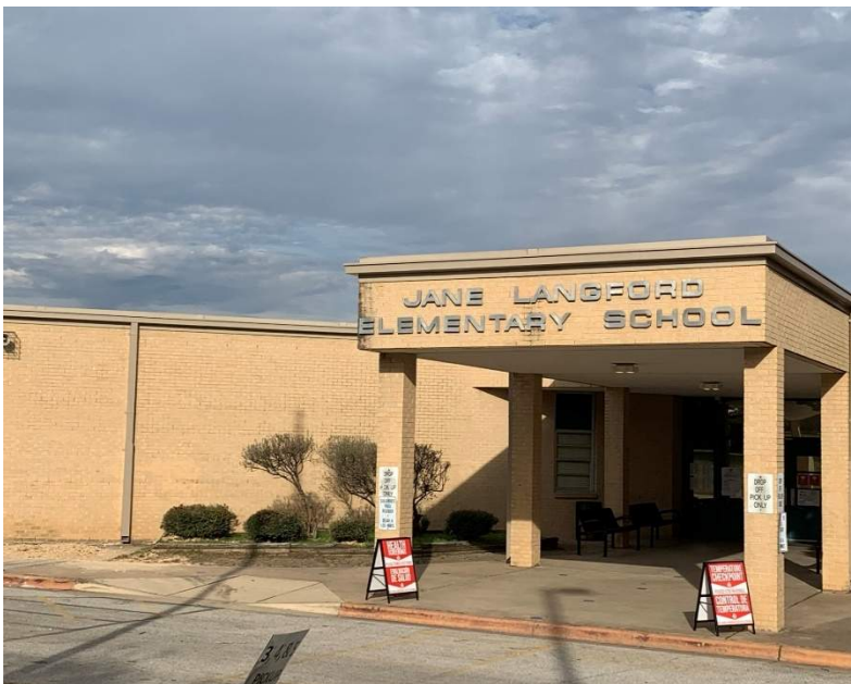
No separate marquee or directional signage around entrance; side fences are damaged.