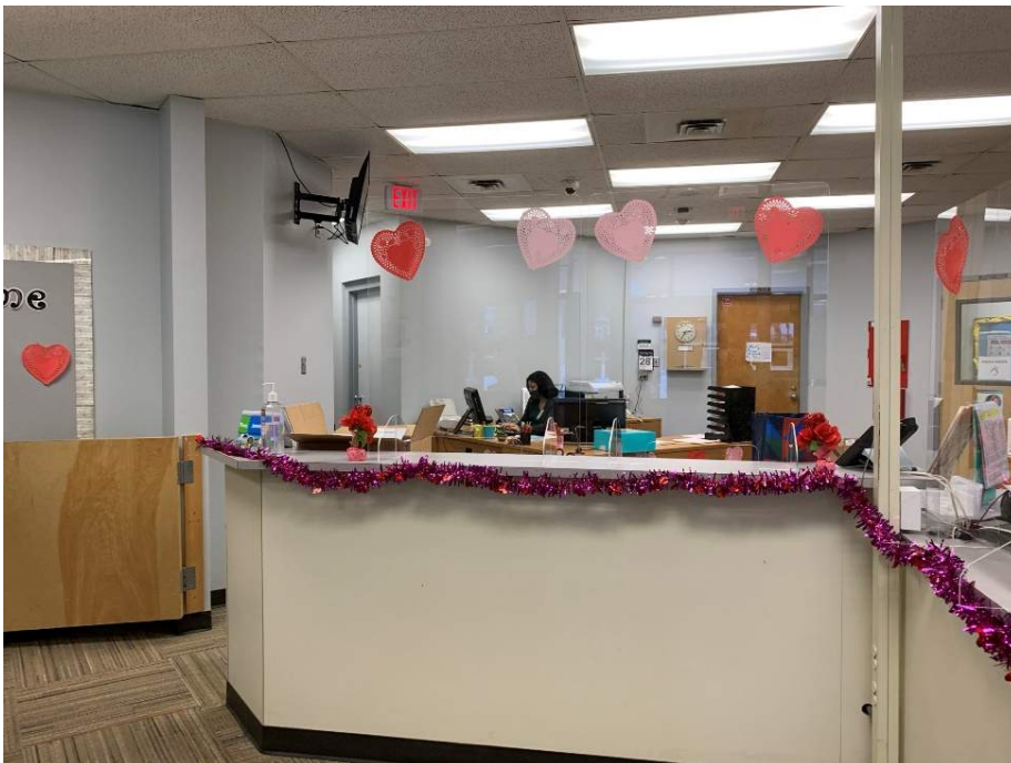
Administration: Reception area requires updates to feel more welcoming.