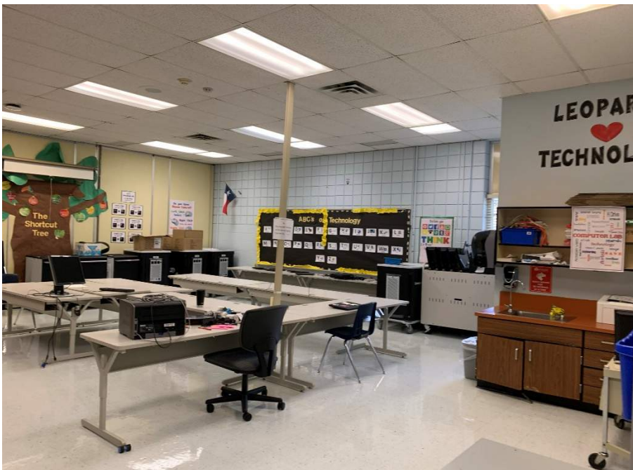
Computer Lab: Access to power outlets is unsatisfactory.