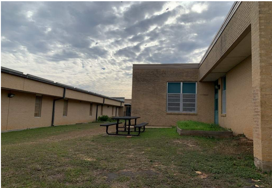
School does not support outdoor studios. [REDACTED] no furniture for students is provided; maintenance and updates are needed.