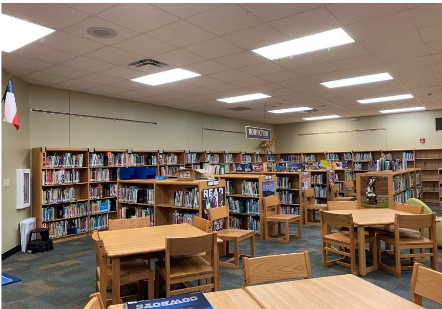
Media Center: Library is in average condition and can support group or individualized study, but most furniture is not easily movable.