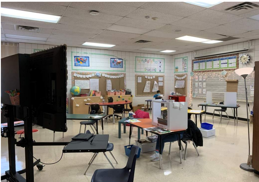
Studios are adequately sized; no natural daylight in approximately 25% of the studios; acoustic condition is good; technology devices are well equipped in most studios.