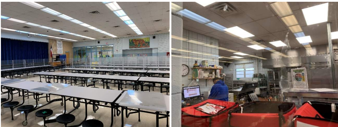
Cafeteria is undersized based on campus capacity. There is no access to outdoor dining and finishes and furniture are in average condition. The kitchen is adequately sized. Stage is adequate but lacks dedicated storage.