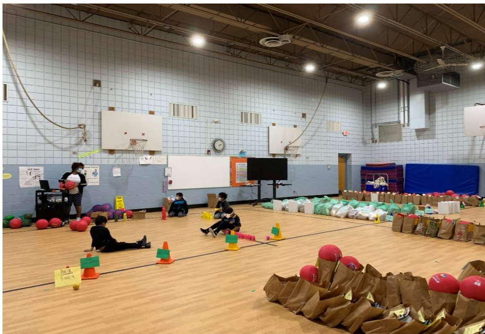
Gym is undersized and does not have sufficient storage space.