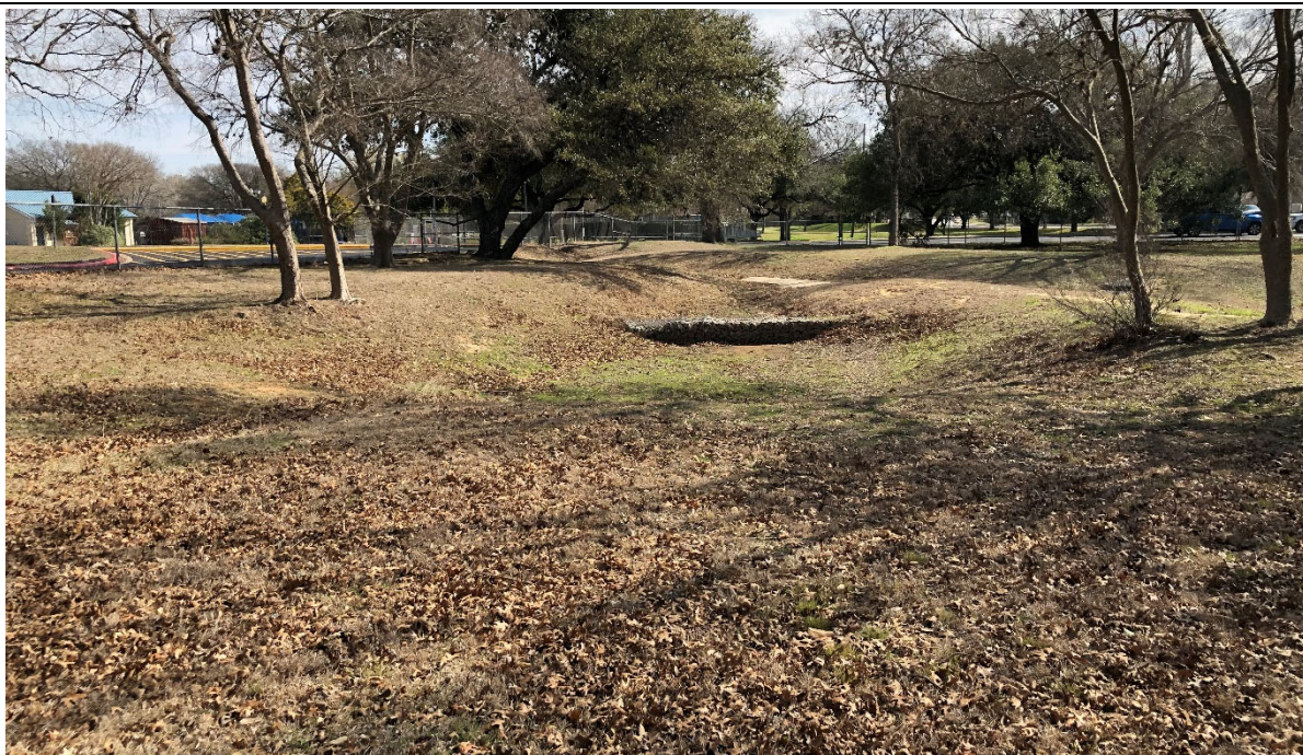
Depressed areas for water retention near playground