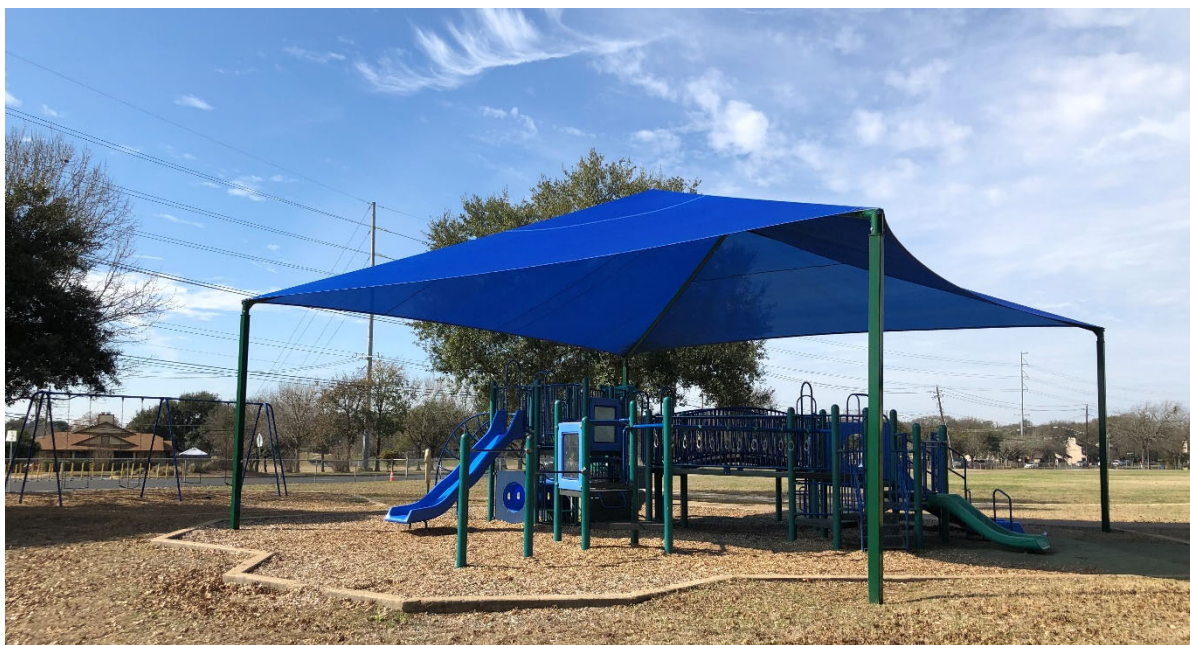
Playground space is shaded and equipment in good condition.