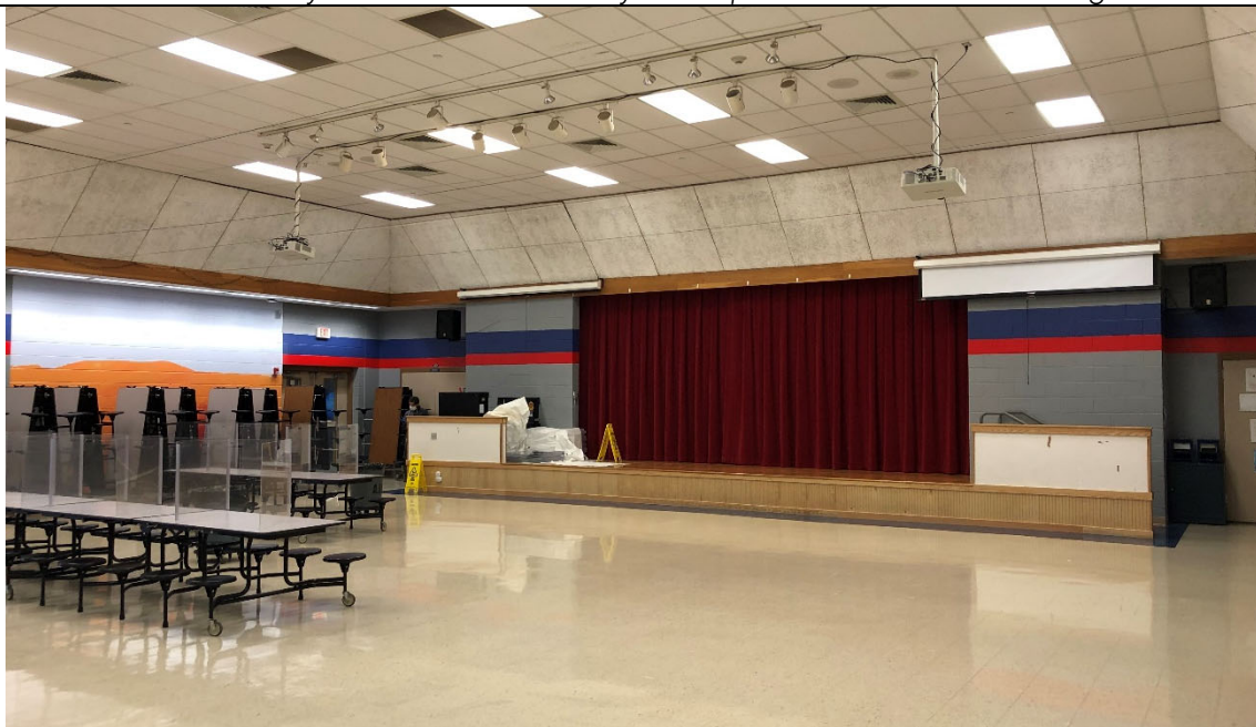
Cafeteria stage has two donated projectors that are dated but does not have a central screen for projection. There are some acoustic panels, but more are needed to reduce noise levels.