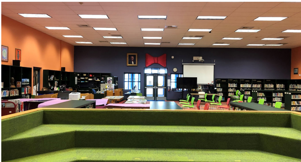
Library outfitted with flexible furniture, including tables with wheels for ease of reconfiguration but does not have a variety of furniture. The library is the space used for most meetings.