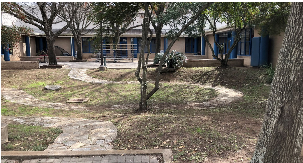
Interior courtyard space used for outdoor learning. Space is underdeveloped and needs updates.