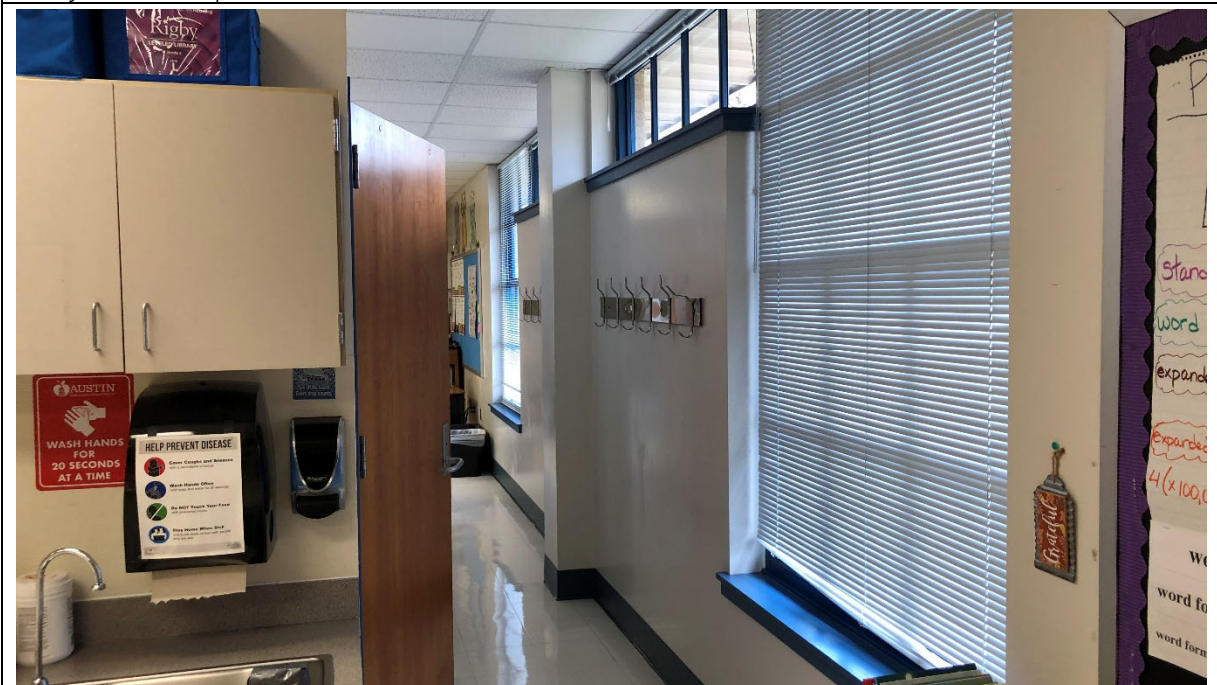
Natural light access to newer studio addition limited to the connected restroom corridor.