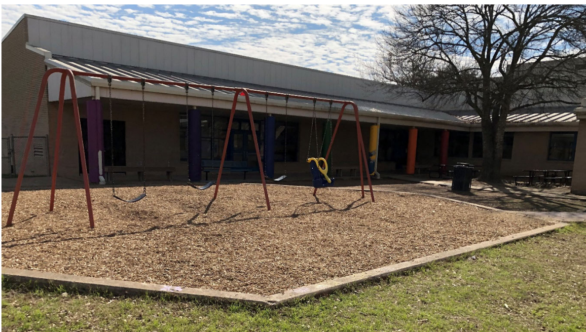
Kindergarten wing of building configured with covered area and direct access to a dedicated playground.