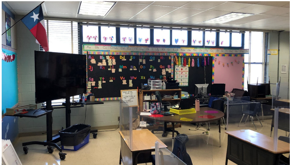
Studios in main building with a good amount of access to natural light. Blinds are old but in working condition. Furniture is in good shape but lacks flexibility and is somewhat cumbersome to reconfigure.