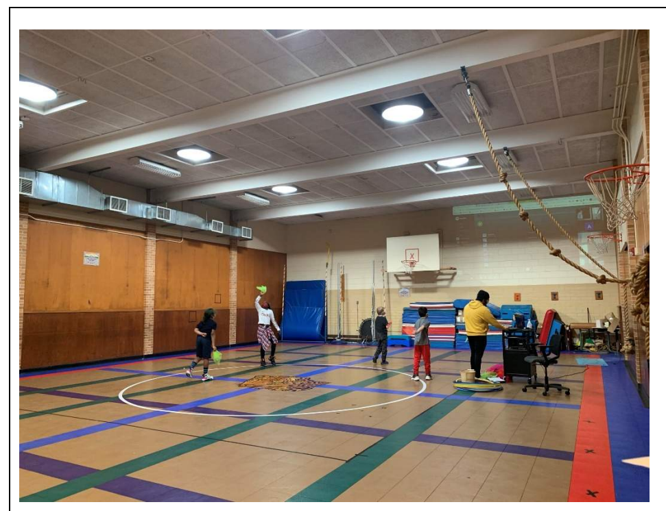
Gym is undersized and finishes need upgrades.