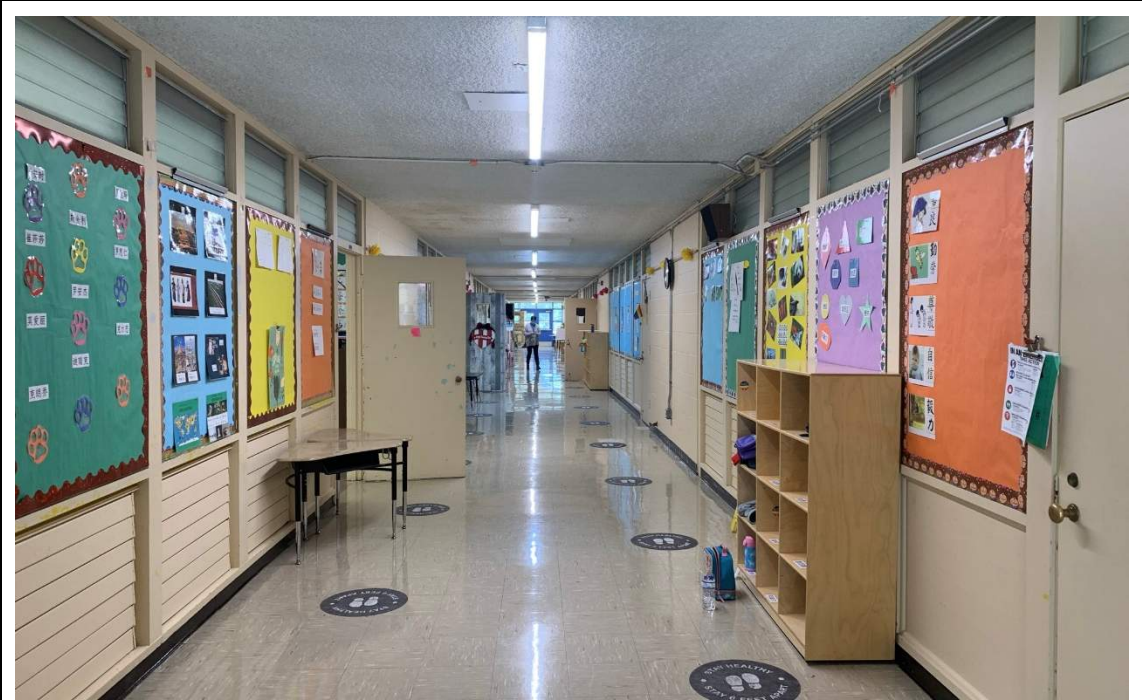
Studios have poor acoustics. Walls between hallway and studios have louvers/vents, creating a high level of sound transmission.