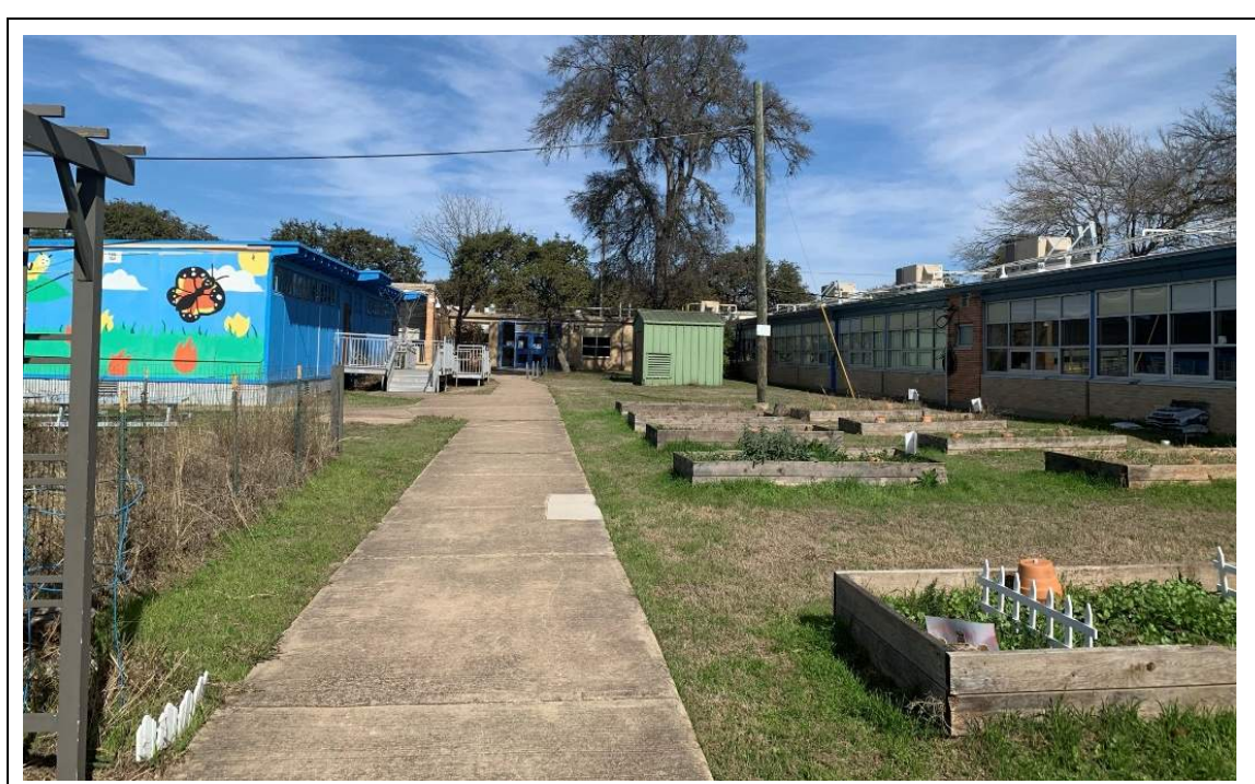
Garden space is provided for outdoor learning, but lack of shading and limited furniture prevents it from being utilized as an outdoor studio.