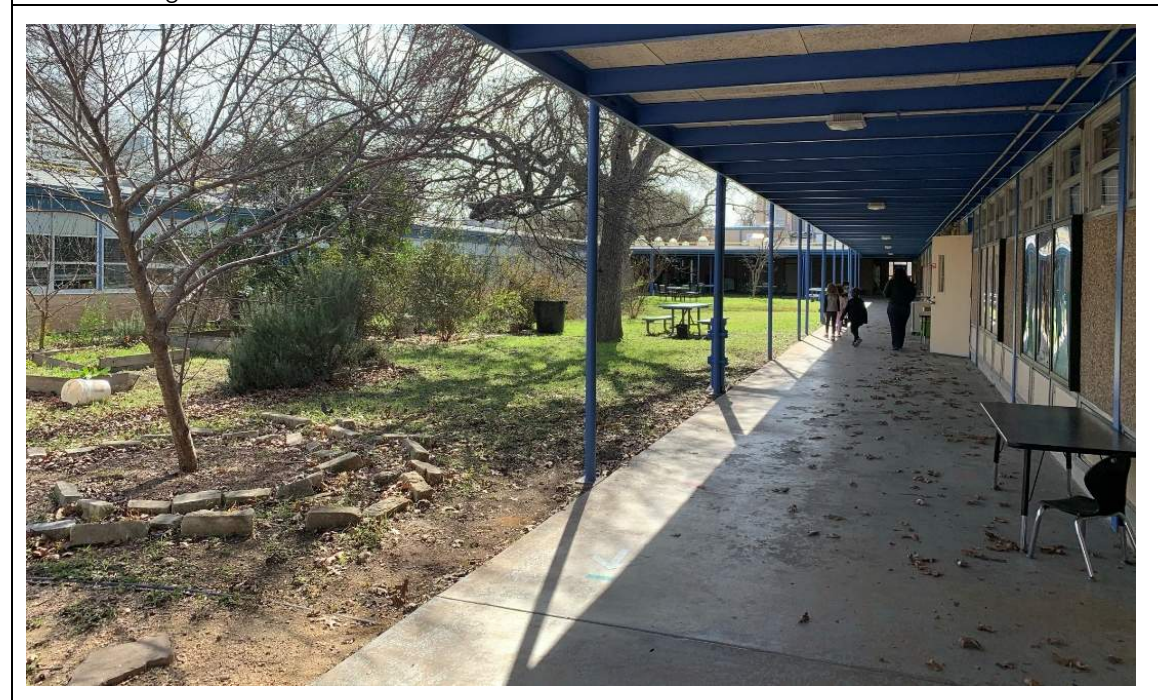
Courtyard is secured within school perimeter but requires upgrades to furniture and landscape to function as an outdoor studio. The plants and landscaping sustained damage from the winter storm (after site visit).