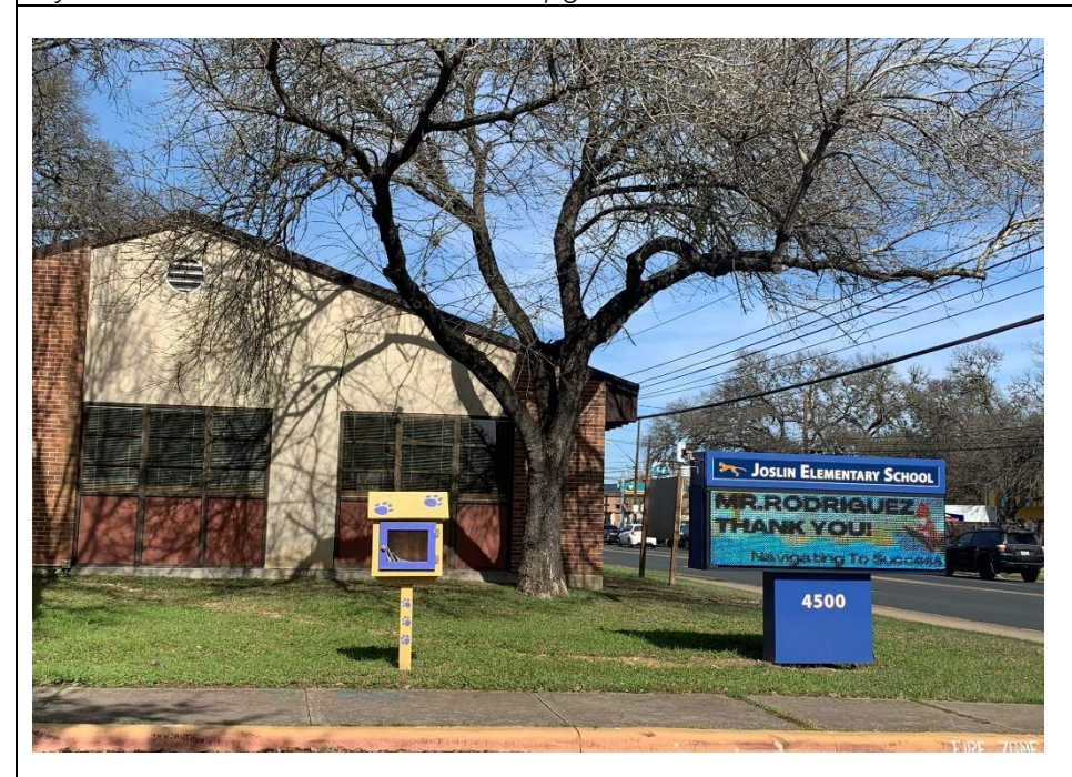
Small digital marquee sign in front of school. Location of staff/visitor parking is not apparent and difficult to access off Menchaca Road. Admin office is located far from main entry gate.