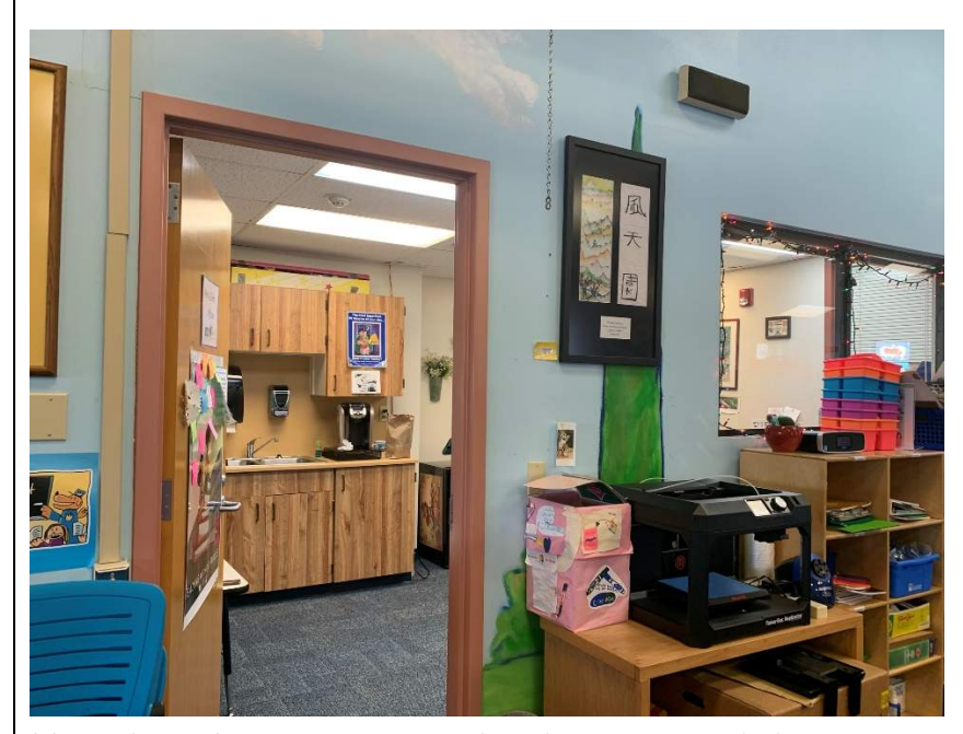
Library has adequate storage and workroom is provided.

Library can be separately opened for after-hours activities. Library does not support group or individualized study/reading. Most furniture is not easily movable. Technology is adequate.