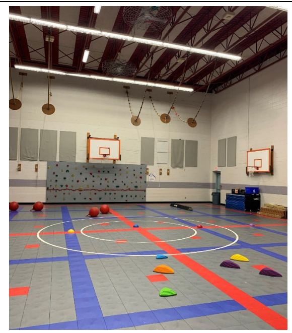
PE and Wellness: The gym connects to the cafeteria with an operable wall. The space is in good condition but aged.