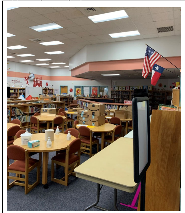
Media Resources: Furniture supports large group gatherings but is bulky and difficult to move. Individual quiet study spaces are not present.