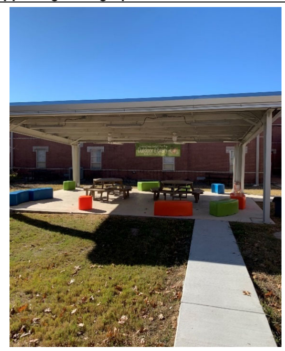
Outdoor Learning: Generous covered outdoor library space provides a great opportunity for students to read and learn outside.