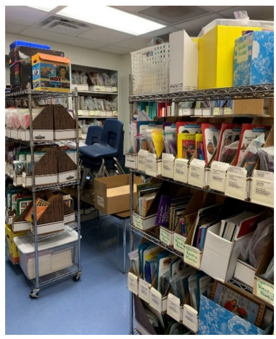
Storage: Space for storage is a concern across the campus both for studio needs and general use. Closet space is preferred to cabinets due to limitation in the size of items that can be stored.