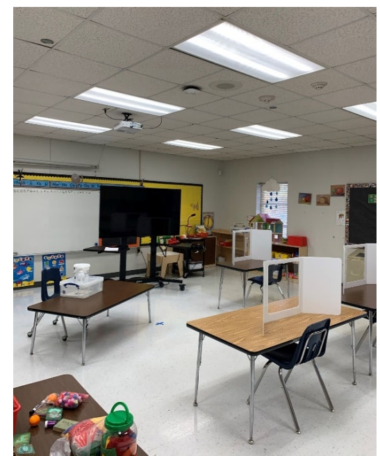
Furniture/Equipment: Dated or damaged furniture in main building. Some not correctly sized for grade level. Limits flexibility and is difficult to rearrange.