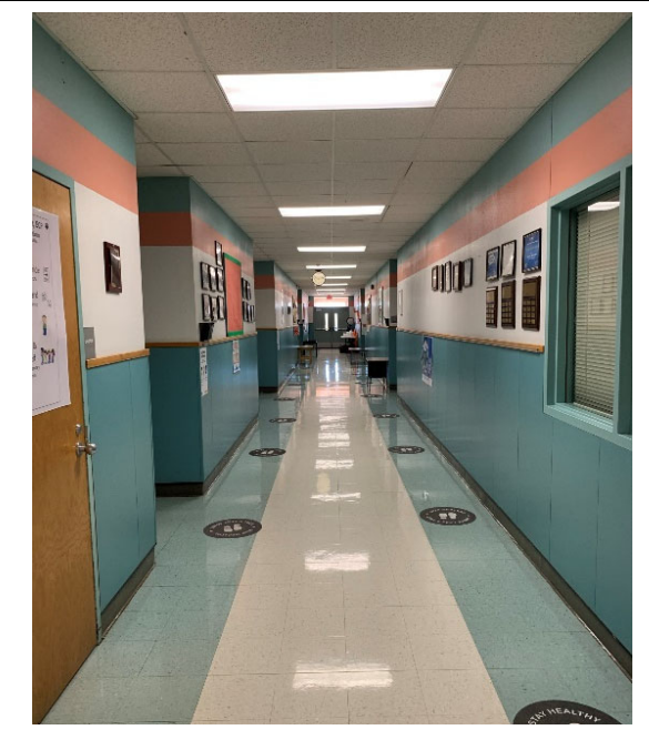
General: Most corridors are undersized and with low visibility. Little opportunity for collaboration or informal interaction.