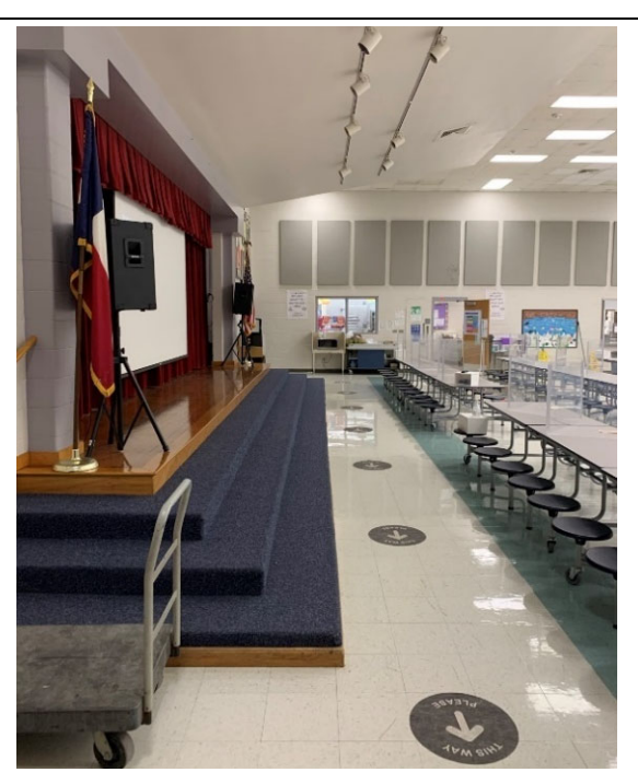
Cafetorium: Works well to hold district meetings but a separate auditorium space for larger events/performances was requested during the interview.