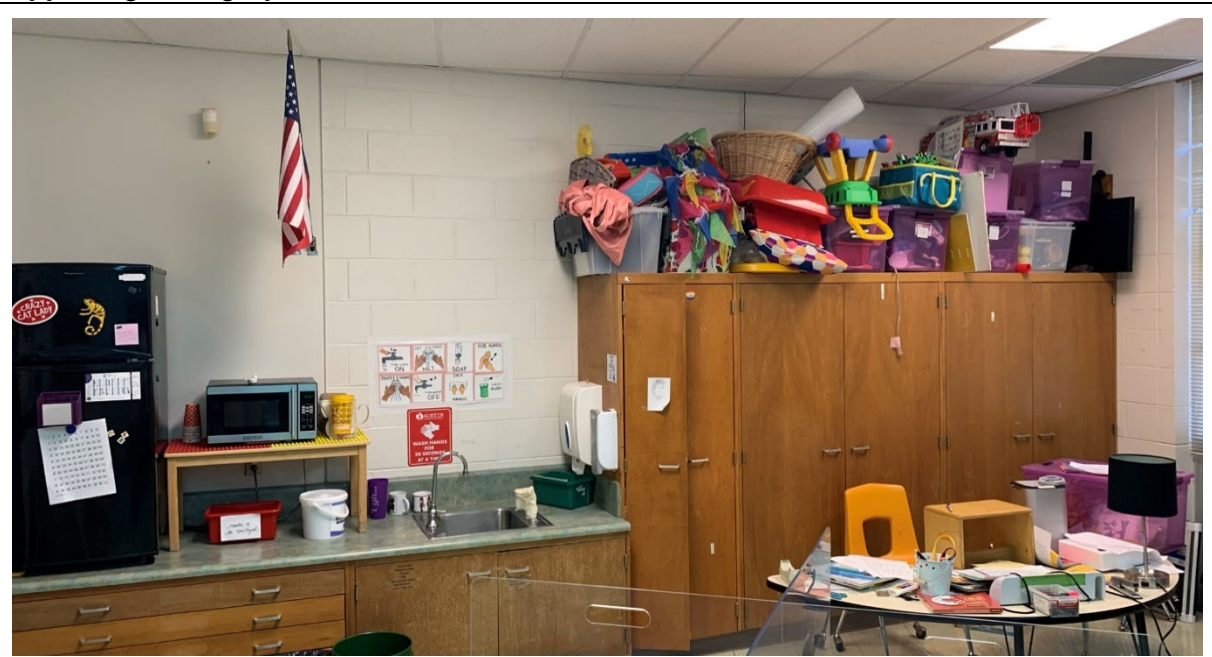
Casework storage is dated and insufficient throughout the school.