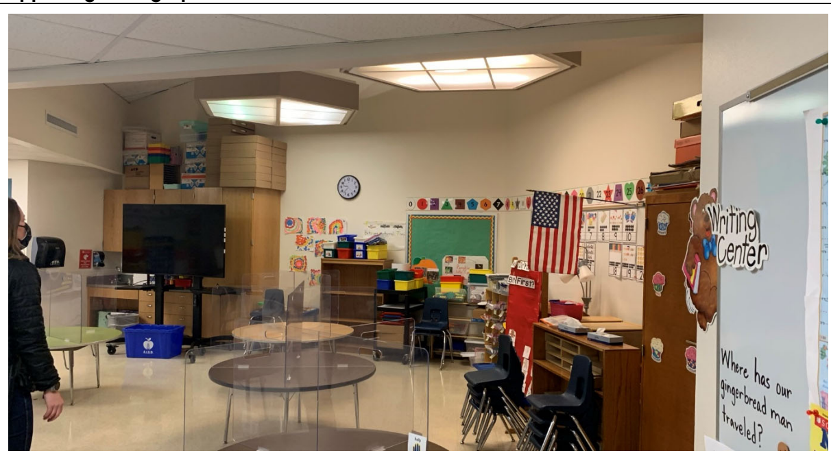
Studio in the interior of the ring. Studio is undersized per Ed Spec and does not have any access to natural daylight and no transparency between the studio and corridor.