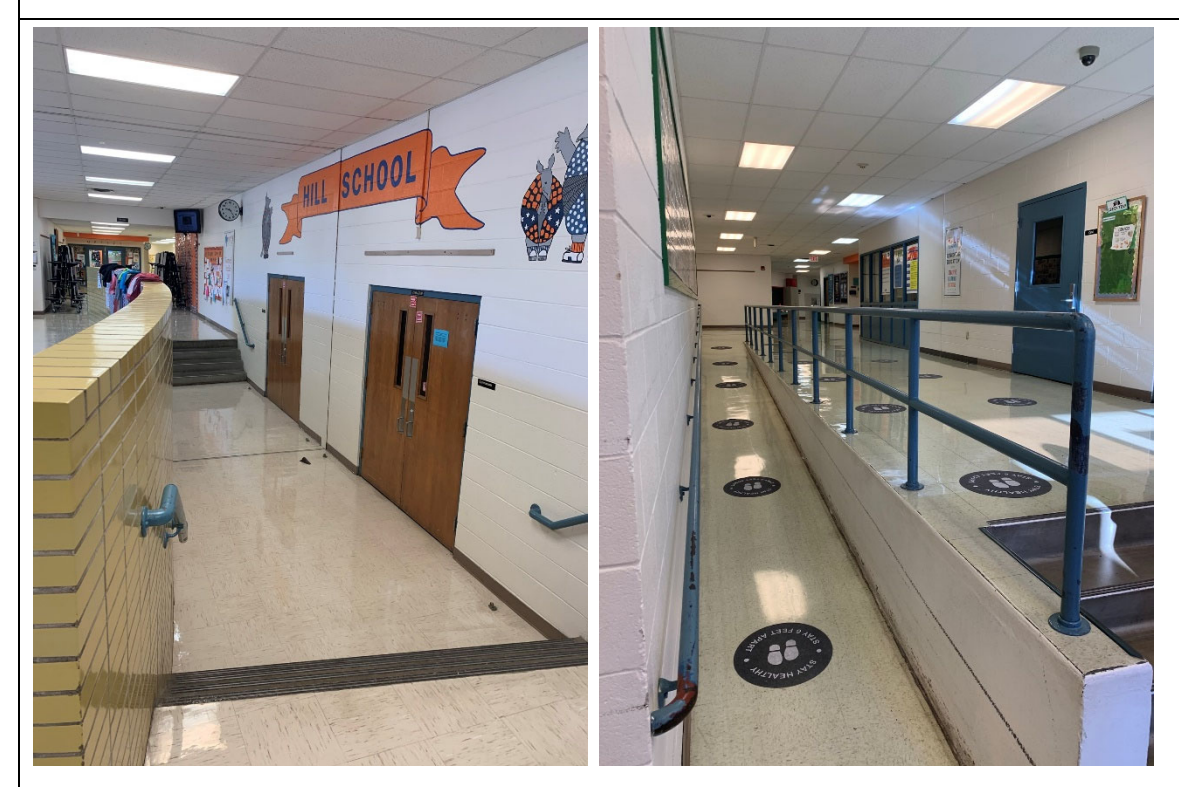
Steps to cafeteria and gym along main corridor. Accessible ramp is on side hallway.