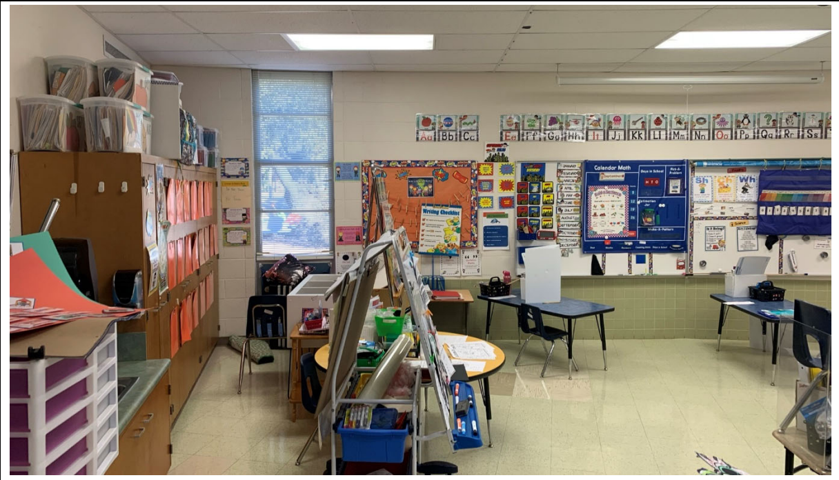
Typical studio on the exterior of the ring. Studio is undersized per Ed Spec. There are limited windows but natural daylight/views to the exterior are provided.