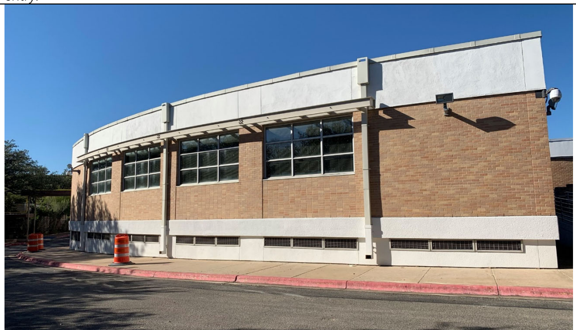
Brick and stucco are in good condition. Stucco was recently painted.