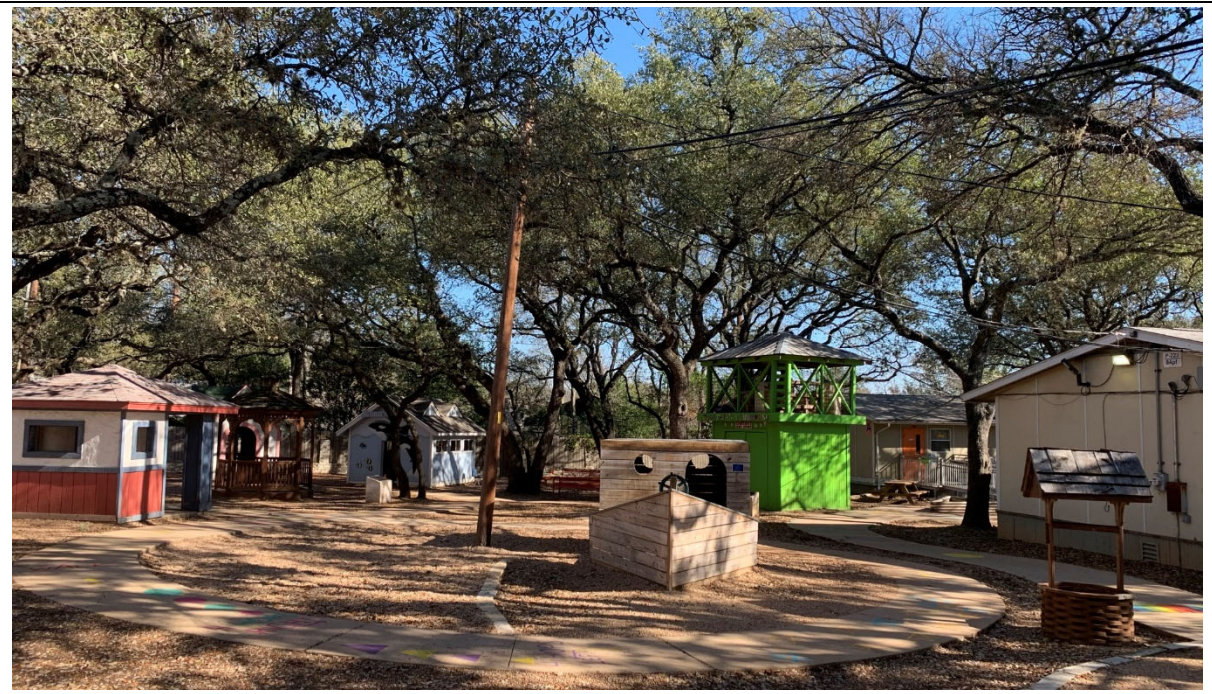
Exterior play area: Hill Harbor - small pavilion play structures are provided and nicely integrated with trees and landscape.

Gardens are in excellent condition. Somewhat removed from the school, but a path will be provided to the gardens with opening of new addition. New teaching spaces will also be close to the gardens. A renovation of the garden beds is being planned for school year 2021-2022.