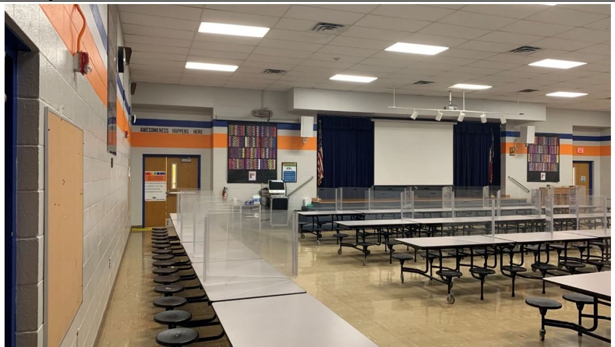
Cafeteria and support spaces are undersized per Ed Spec. Stage is small and ramp is outside of the cafeteria for stage access.