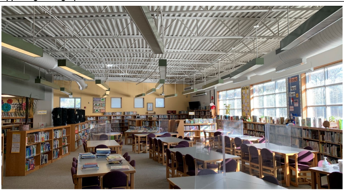
Media Center: Adequate size and nicely daylit space. Furniture is heavy and not easily reconfigurable.