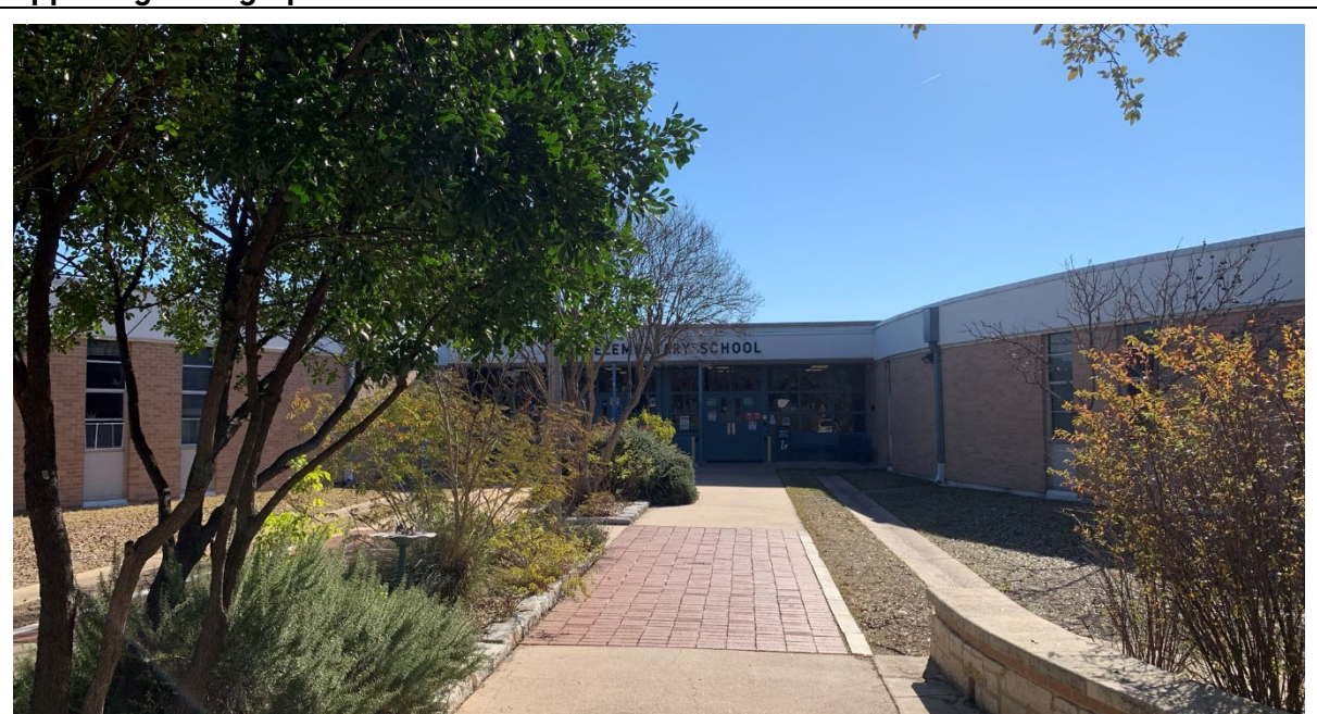
School Entry: Nicely landscaped front area of school. No canopy or overhang is provided at the entry.