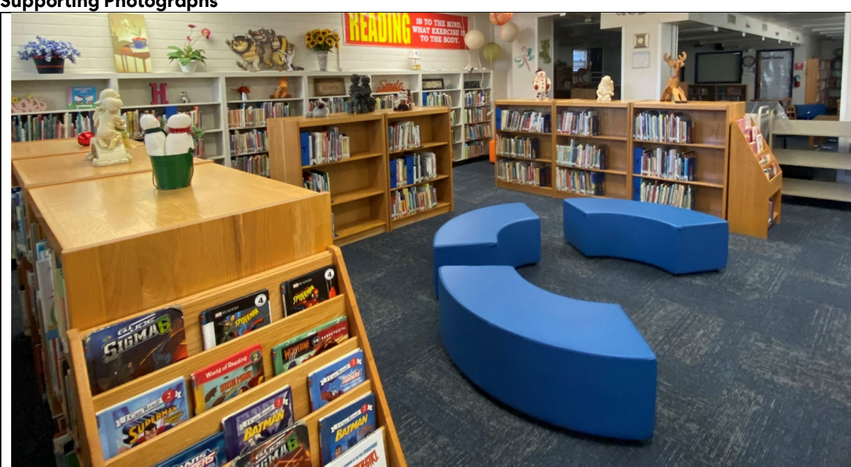
Library is small but does have some flexible furniture settings.