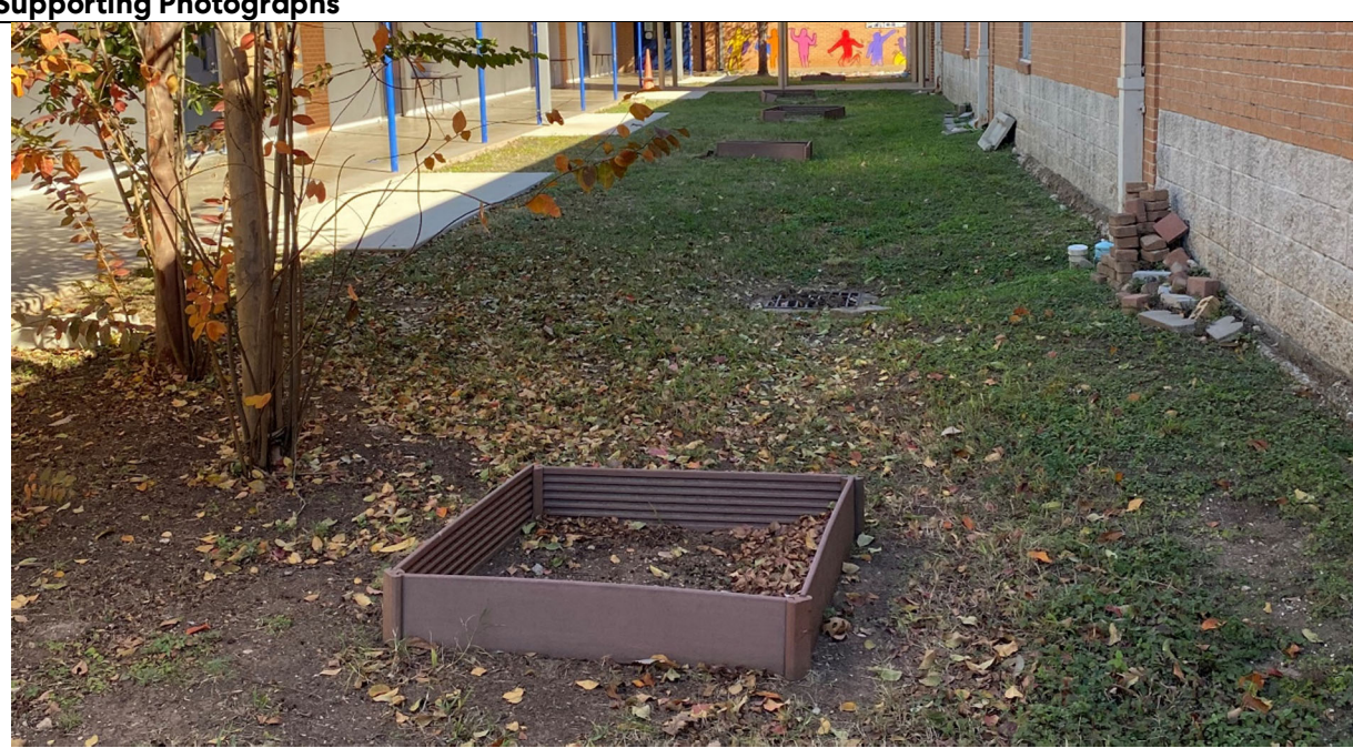
Outdoor gardens are in poor condition and do not appear to be in use.