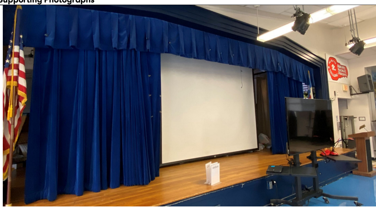
Stage is small with outdated lighting and production equipment. Stage storage is limited.