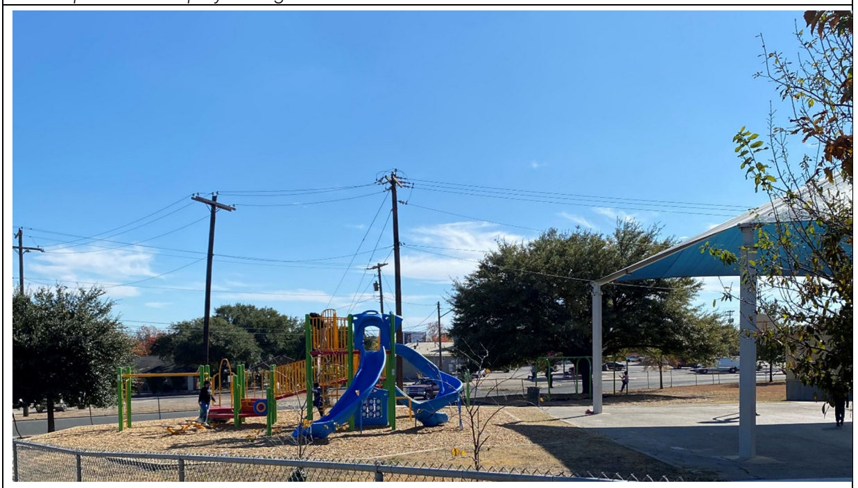
Basketball court has adequate shade covering, but playground does not.