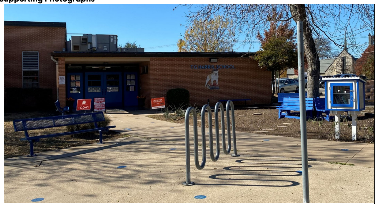
Harris ES Main Entrance: A canopy covering is provided at front entry and signage is hard to read from the street.