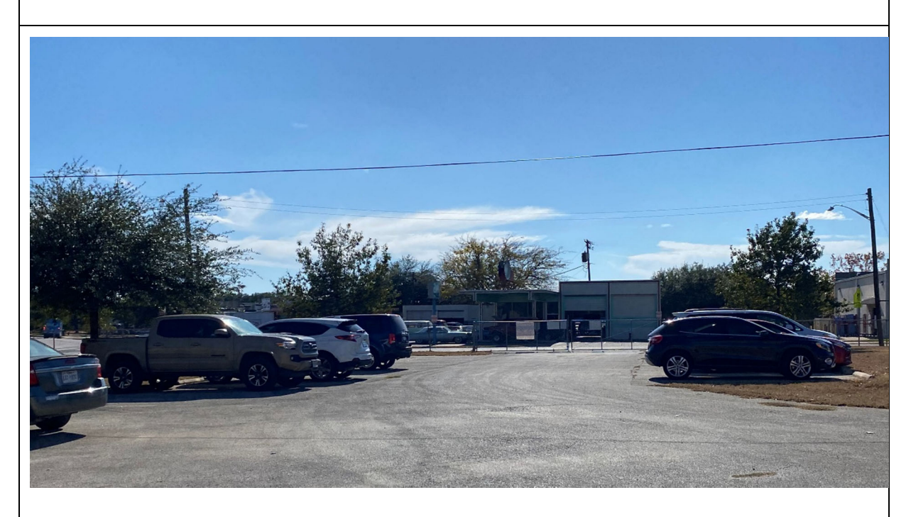
The bus drop-off and rear parking must access through gate. Buses do not have a circular drive for drop-off.