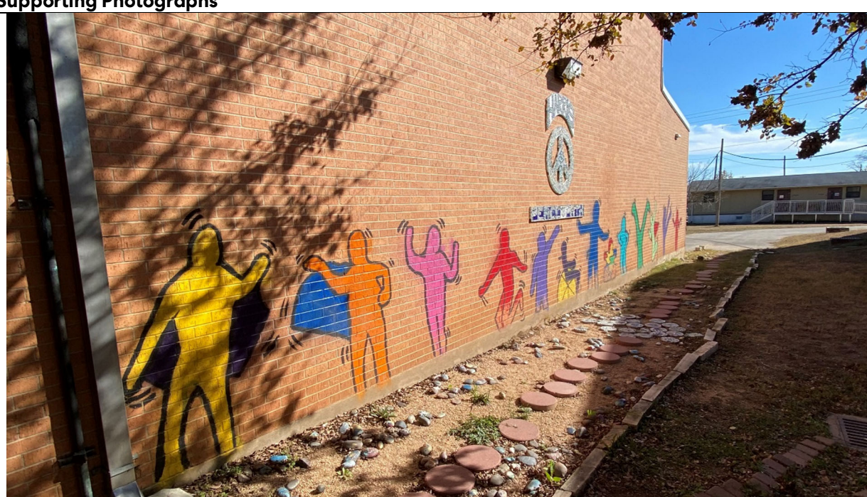
School pride is on display throughout interior and in some exterior locations.