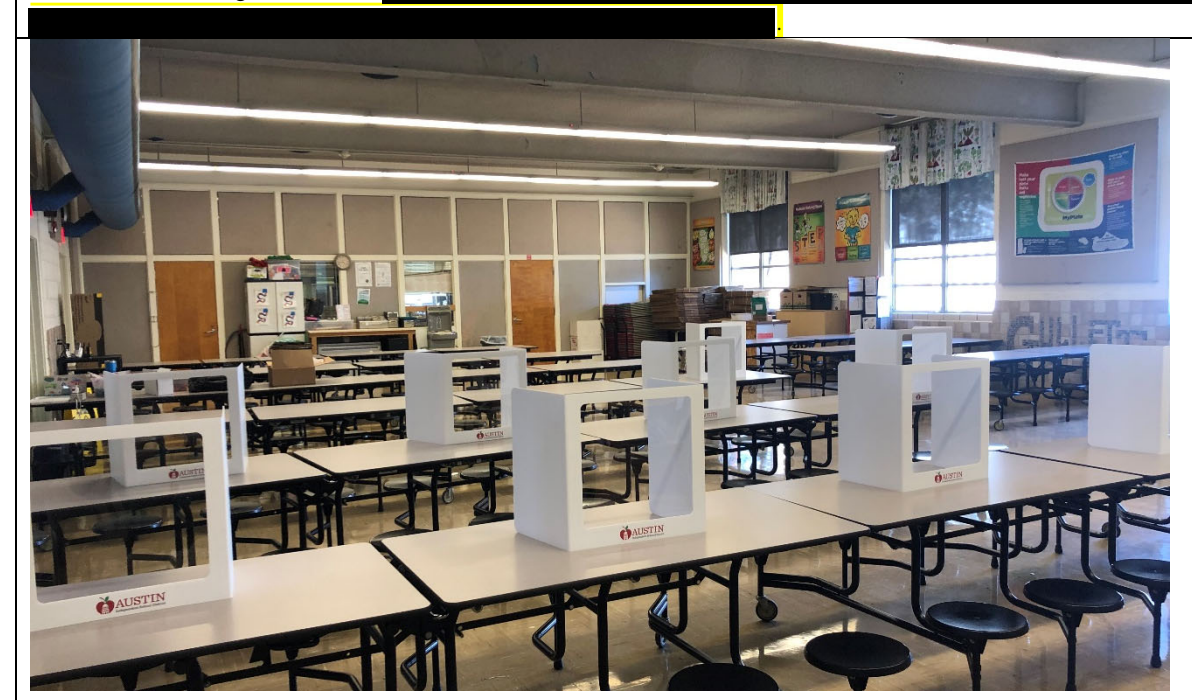
Cafeteria and kitchen are very undersized. Kitchen is 850 square feet and requires exterior freezer/coolers. Stage within cafeteria is not accessible.