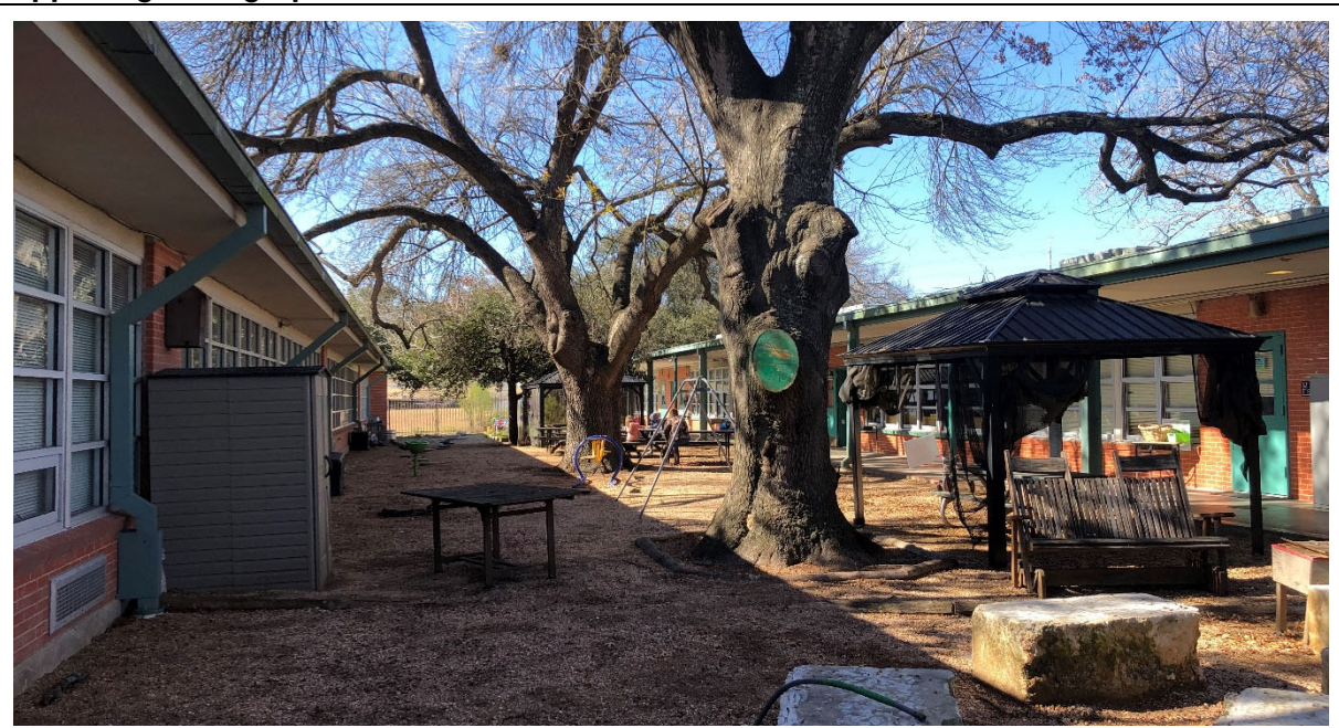
Space between the wings provides garden space and informal seating.