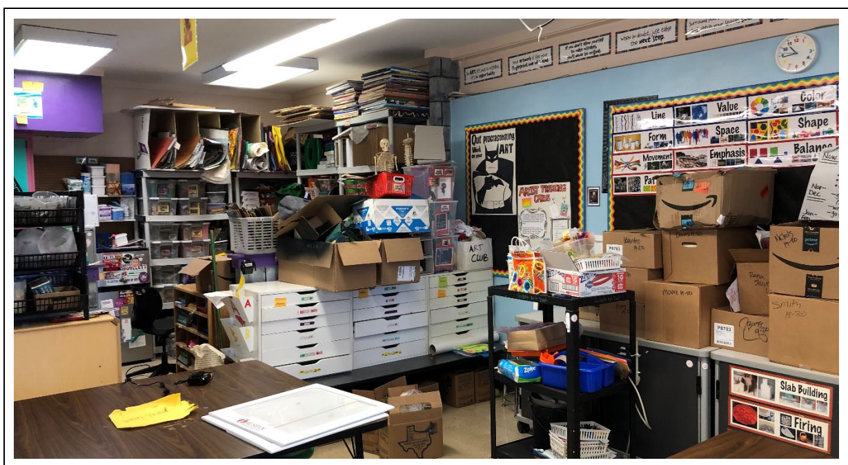
Art studio does not have any storage and is a regular studio turned into an art room. Kiln is in janitors' closet/electrical room, creating a safety concern.