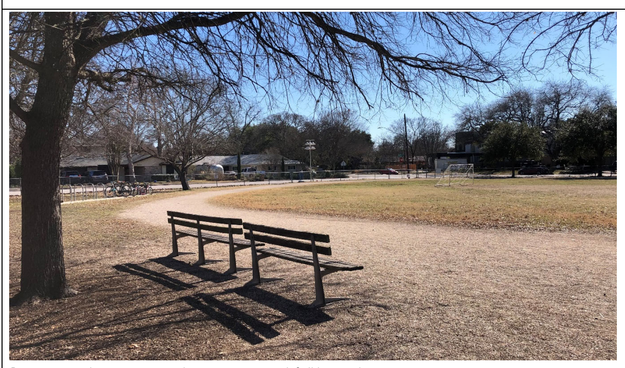
Running track is uneven and creates trip-and-fall hazards.