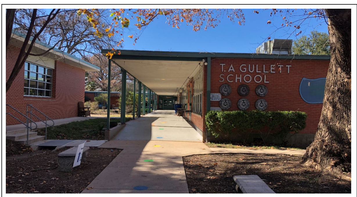
The school was built in the late-1950s and is nicely integrated with the surrounding old growth trees and the neighborhood.