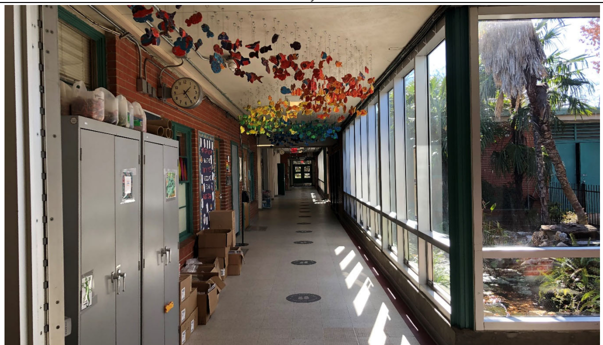
Main Hallway: There is a lot of natural light and great connection to the outdoors and the gardens. Storage is nonexistent throughout the school and many corridors have storage cabinets. Main corridor also does not have any climate control, no heating or cooling.