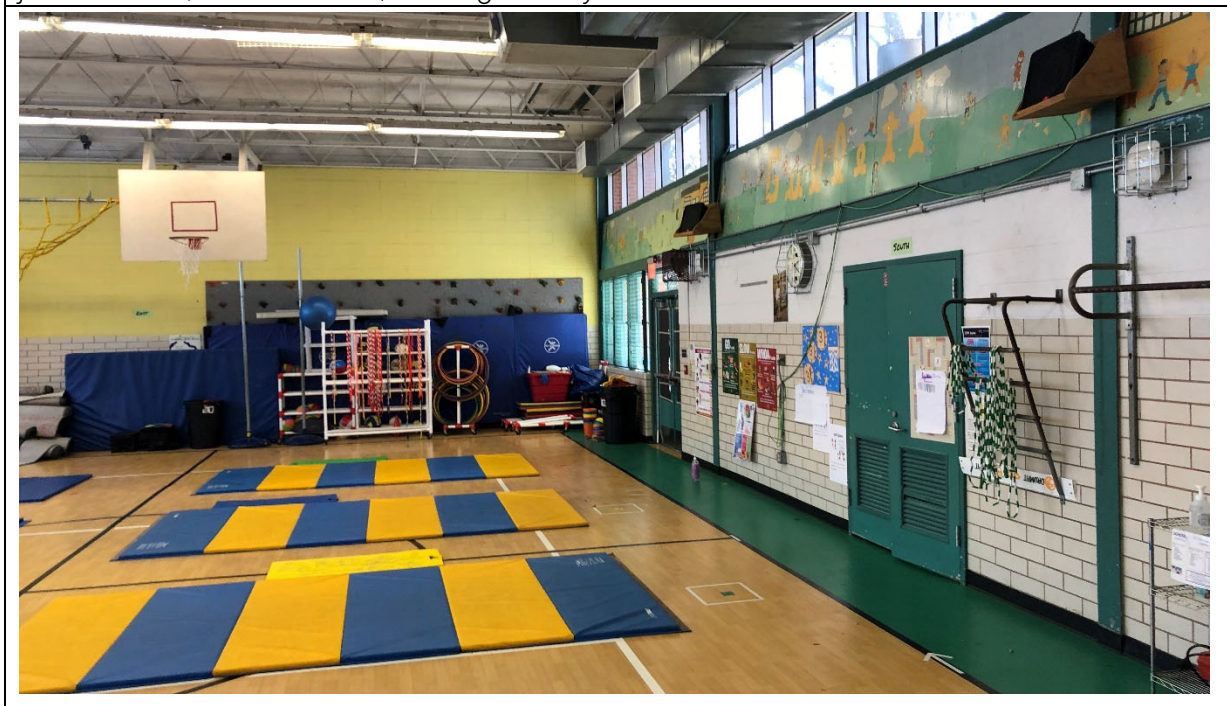
Gym is undersized and there is no office or storage available. .