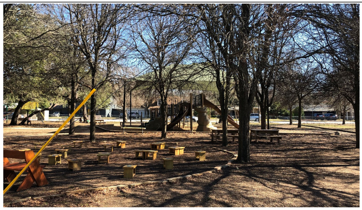
Throughout the campus, the school has created these informal studio areas with little benches. Active playgrounds are in good shape and have shade.