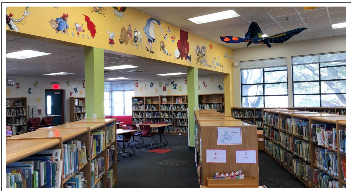
Media Center is about five years old and is satisfactory. There are multiple types of seating. Media Center is accessed from exterior, and there is no key card access.