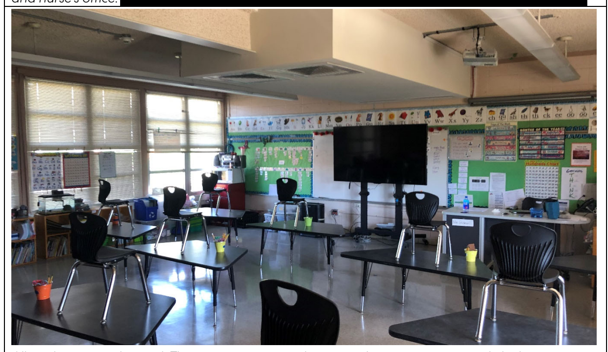
All studios are undersized. There is some casework storage, but storage is severely lacking throughout the school. Studios all have ample access to daylight with windows on both sides of the room,

Administration: Main office is located near the primary entry. It is missing many programmatic elements, such as a conference room, staff lounge, separate offices for principal / Asst. Principal, and nurse's office.