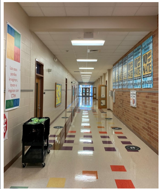
General Building: Most corridors are approximately 12 feet on average.