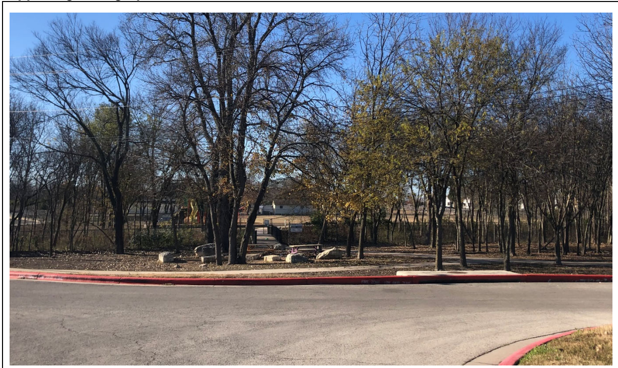
The grass play field, walking loop and larger playground are disconnected from the main campus.