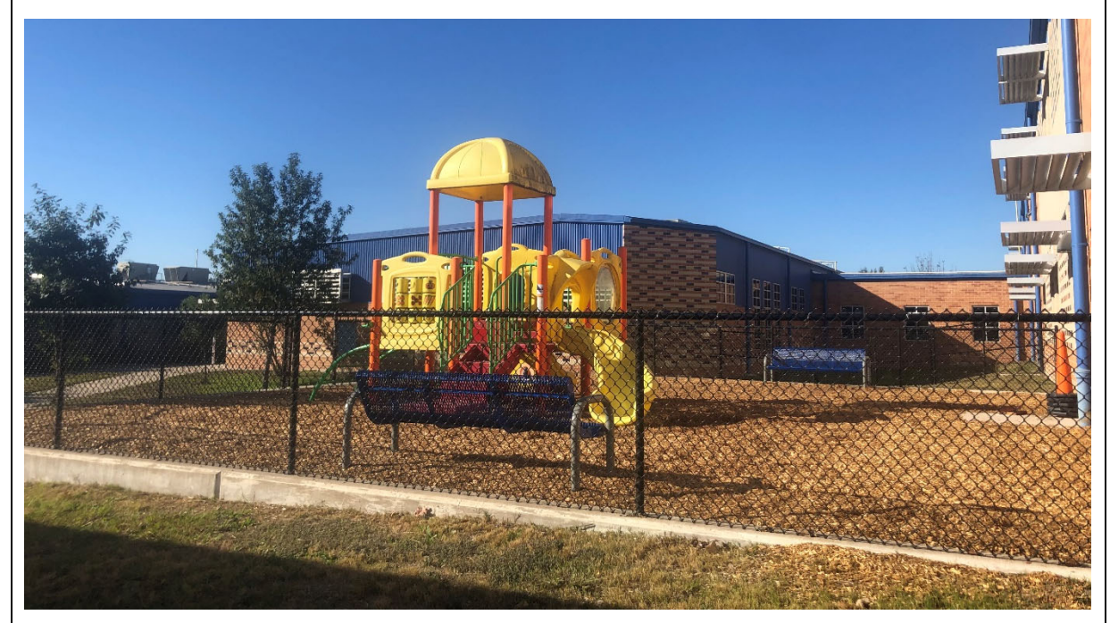
Outdoor Learning and Activity: Both playgrounds on campus do not have shade. This smaller structure is well-connected to the studio wings for lower grade level students.