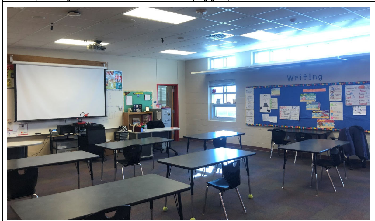
Academics and Learning: All studios have ample access to natural light and views. Furniture is a mix of old and new. More mobile pieces would allow for greater flexibility.