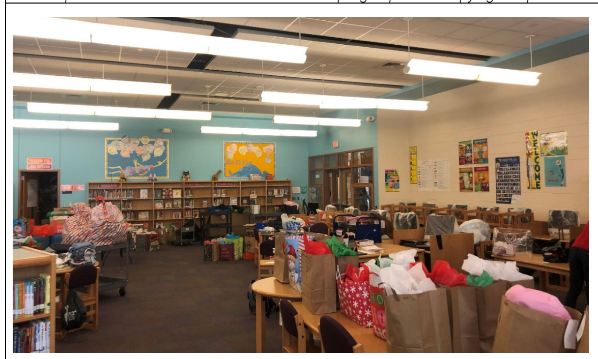
Media Resources: The library is generously sized and centrally located on the campus. Furniture is old and cumbersome to move, but there is plenty of space to accommodate larger groups. Currently the library is not being utilized due to COVID-19 protocols.

Media Resources: Large windows bring ample natural light into the library and a glass partition at the kiva provides some acoustical control when multiple groups are occupying the space.