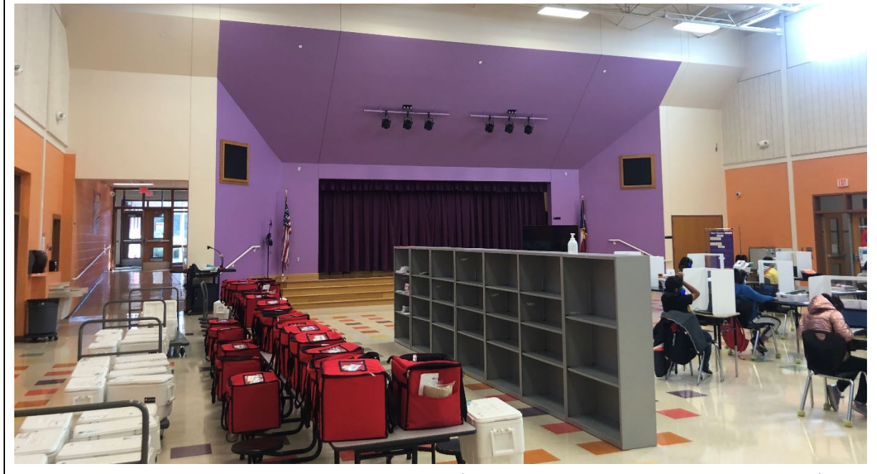
Food Services: The cafeteria is adequately sized (currently set up for COVID-19 protocols) with appropriate support spaces and is connected to the gym with an operable wall.