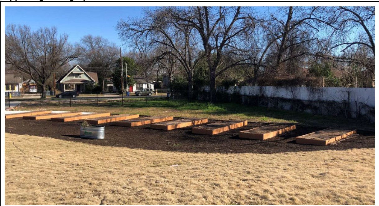
Outdoor gardens with an additional outdoor classroom space adjacent. This space is far removed from studios.