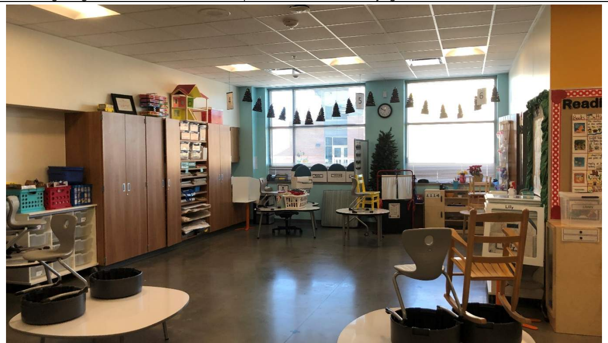
Typical studio has flexible furniture, casework storage and excellent daylight/views.