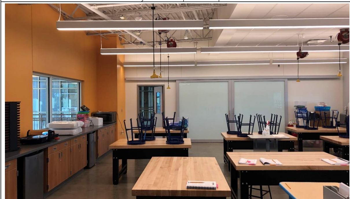
Maker space on second floor provides power for a variety of activities. Large sliding doors open the room to a large commons area.

Hallway in learning neighborhoods is wide enough with flexible furniture to allow small groups to meet. Glass in the studios to the hallway allows for passive supervision of students.