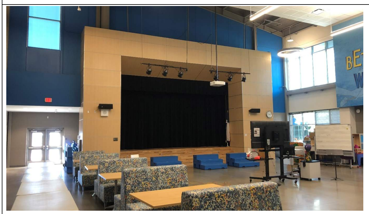
Cafetorium has movable partition between gym and cafeteria. All program elements are appropriately sized per Ed Spec. Stage A/V is new and satisfactory.