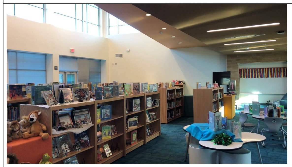
Media center has different types of flexible seating and small nooks for individual reading. Doors (shown beyond) open to a secured courtyard with shade and seating.

Library is located off main corridor near entry. A moveable glass partition can open the Library up to the corridor where additional informal seating is located. The main corridor is daylit and has a generous amount of space for informal interaction.