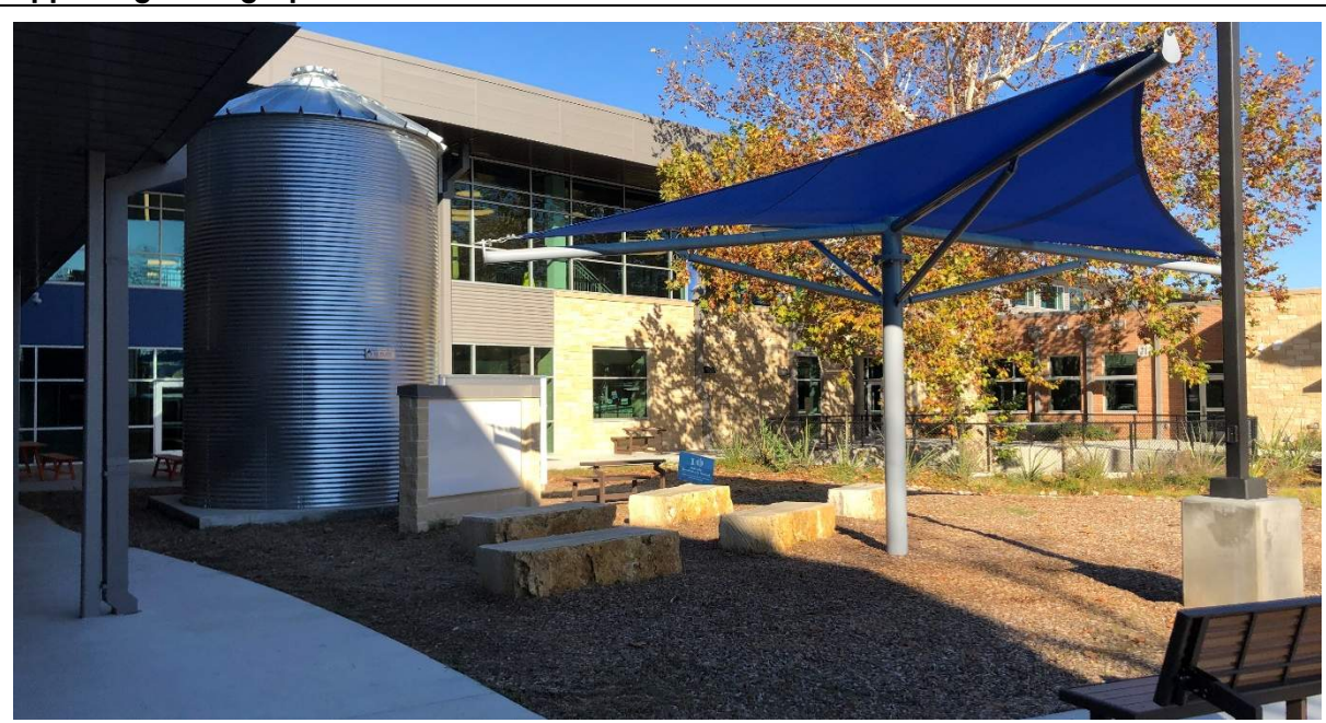
Outdoor teaching space adjacent to collaboration space has some shade and a whiteboard.