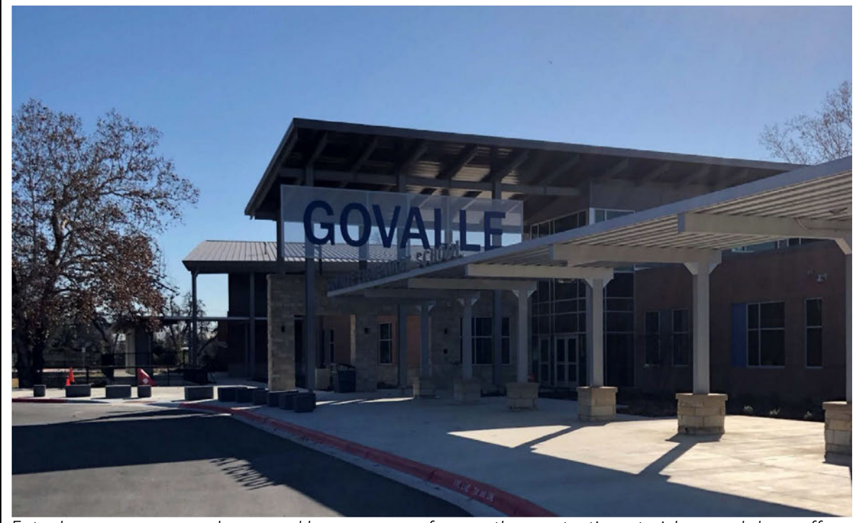
Entry has generous overhang and lower canopy for weather protection at pickup and drop-off.