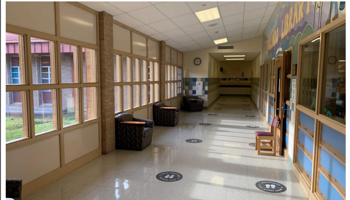
Primary corridors are wide and have opportunities for informal interaction and breakout spaces for students and teachers, with furniture available to support them.