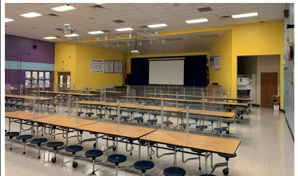
The cafeteria is appropriately sized but only has one option for furniture. It is well connected to the music room for easy access to the stage.