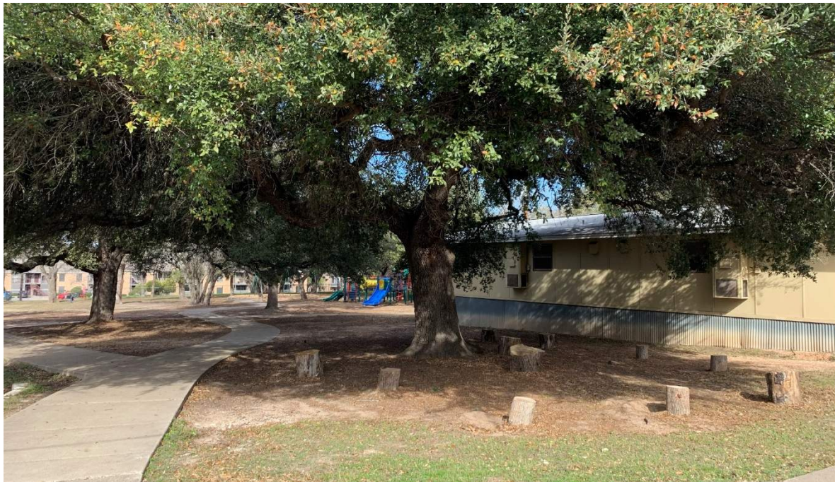
On the back of campus there is a playground for upper grade levels, a play field and walking trails, and portables, as well as areas for outdoor studios. A covered outdoor concrete court is present (not shown in photograph). A water source for their bee apiary (not shown in photograph) is a high priority for the campus.