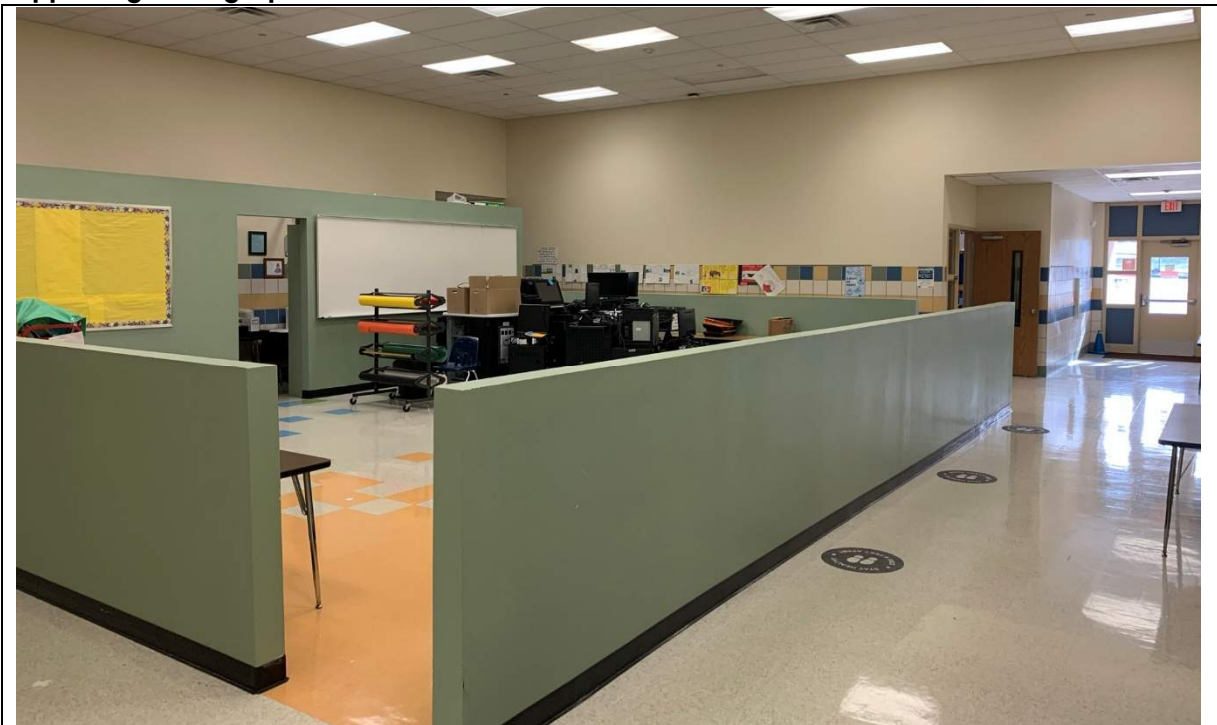
Three of the four studio wings have a large, shared flex space in the corridor. This space is used for science activities with materials stored behind the back wall.