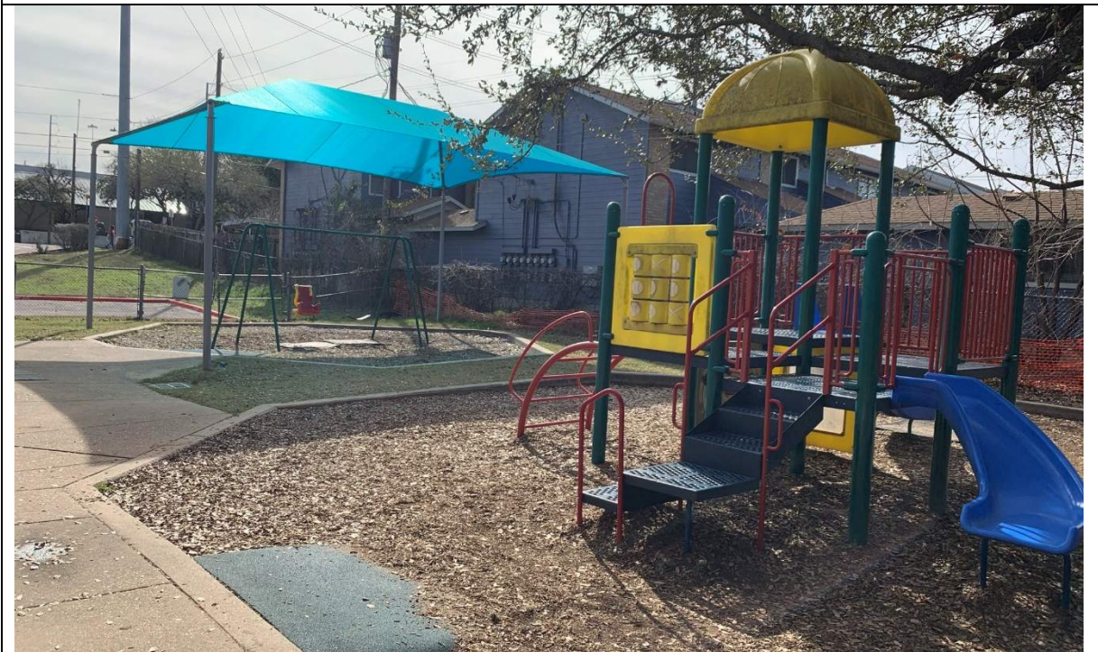
Pre-K and kindergarten have a separate playground with easy access to the studio wing. It is only partially shaded.