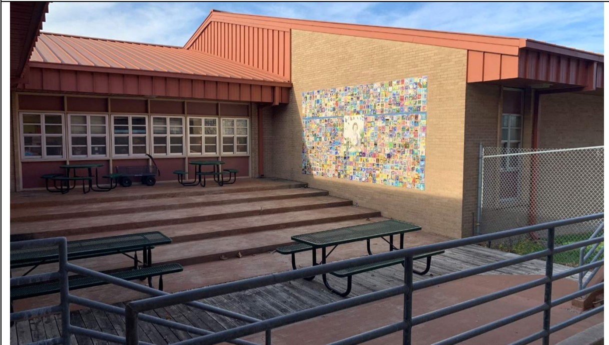
The Emma Courtyard contains artwork honoring the namesake of the school that the campus would like to keep. It is off the cafeteria and could be used for outdoor dining as well as an outdoor studio space.