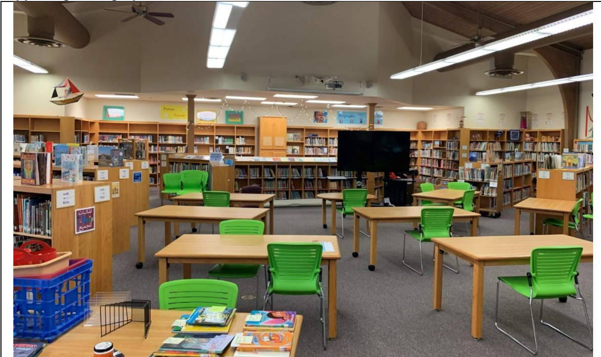
Media Resources: The library is generously sized and has a variety of furniture. It is laid out so that zones for different activities can be created.