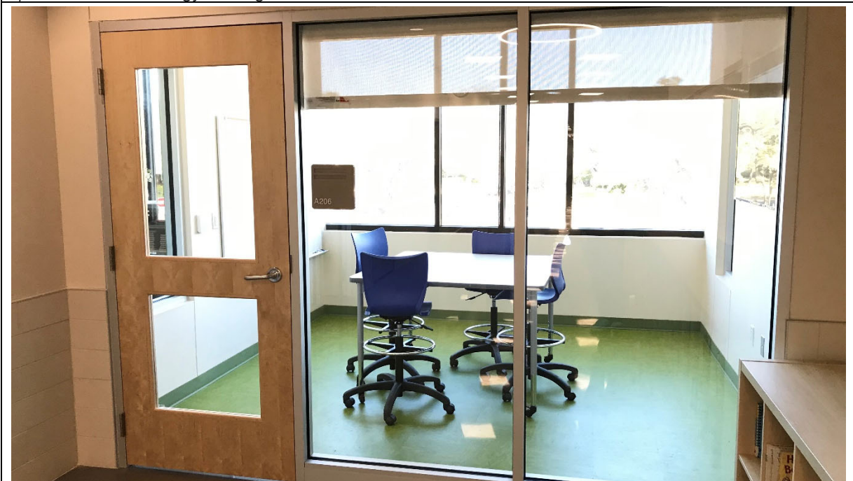
Example of a small group room. Each learning neighborhood has a small group room with varying types of furniture.