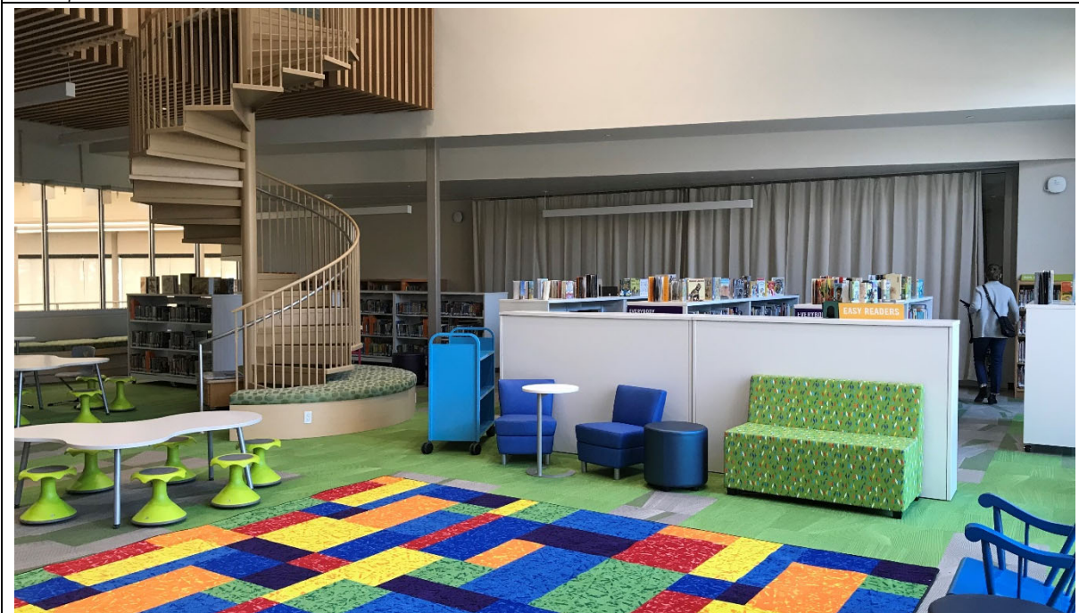
Media Center connects the second and third floor. The space opens up to the community room beyond. Excellent flexible furniture is found throughout the school.