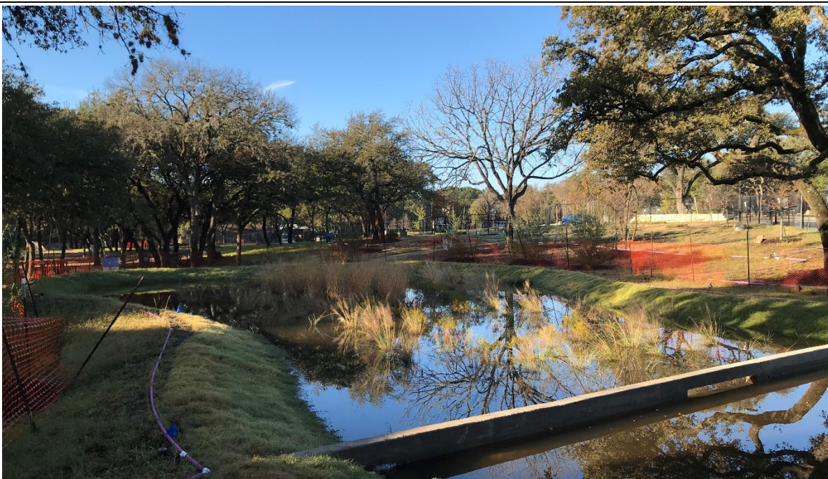
Pond for water detention integrated within the landscape. Adding appropriate safety features around the pond was mentioned in the interview.