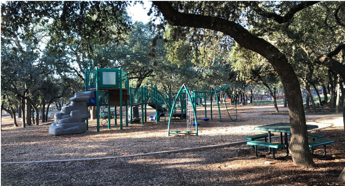
Active playground nestled within grove of live oak trees.