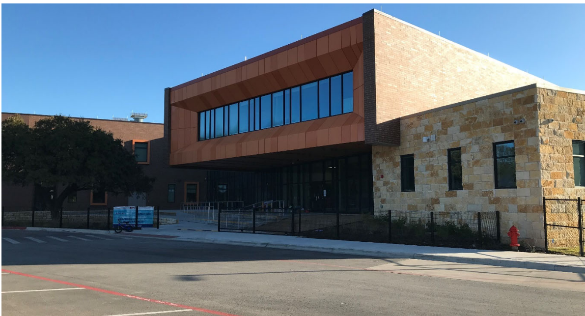
Front entry of school. Overhang from building provides protection from weather at entry door.