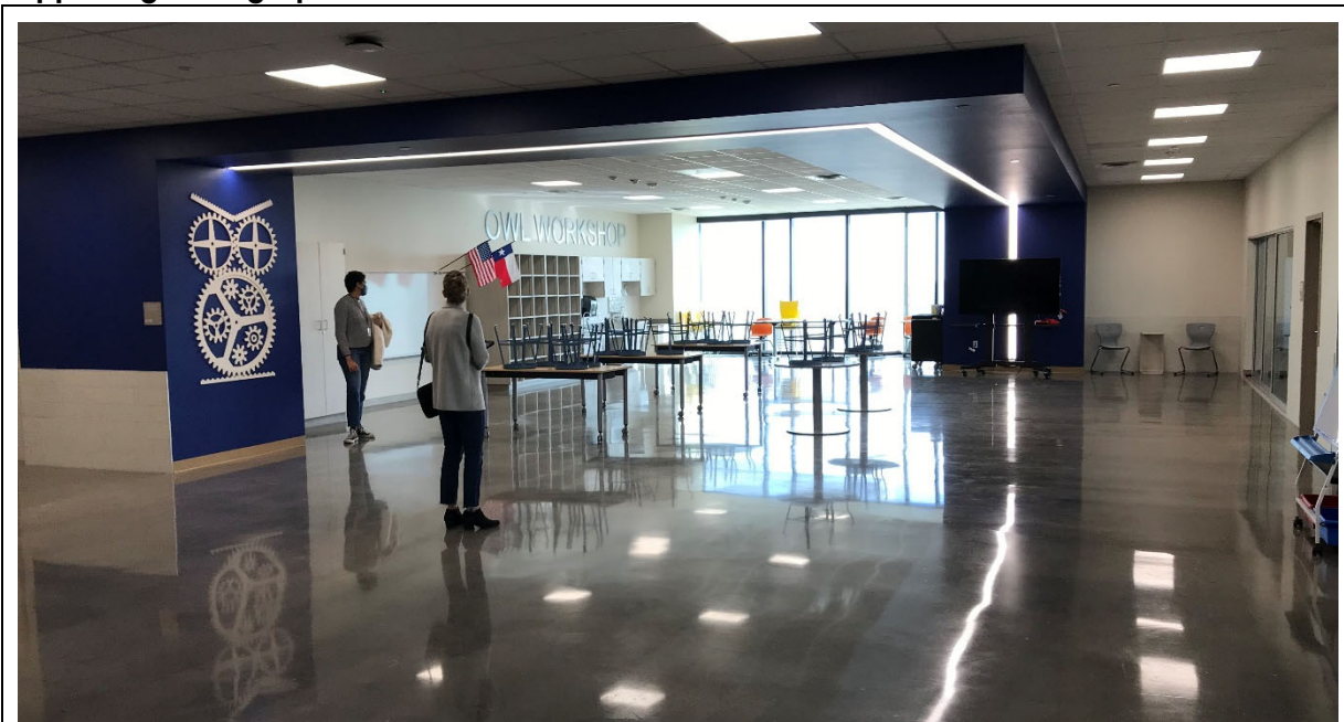
Maker space on upper level. This one is on the upper floor of the school, and it is an open, flexible space with technology, storage and two sinks.