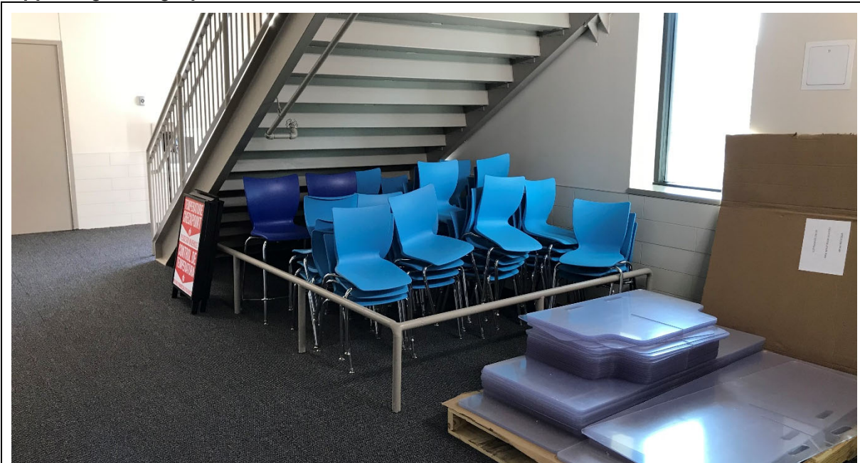
Chair storage underneath stairs. Storage concerns were an issue raised by the users of the school multiple times in the interview.