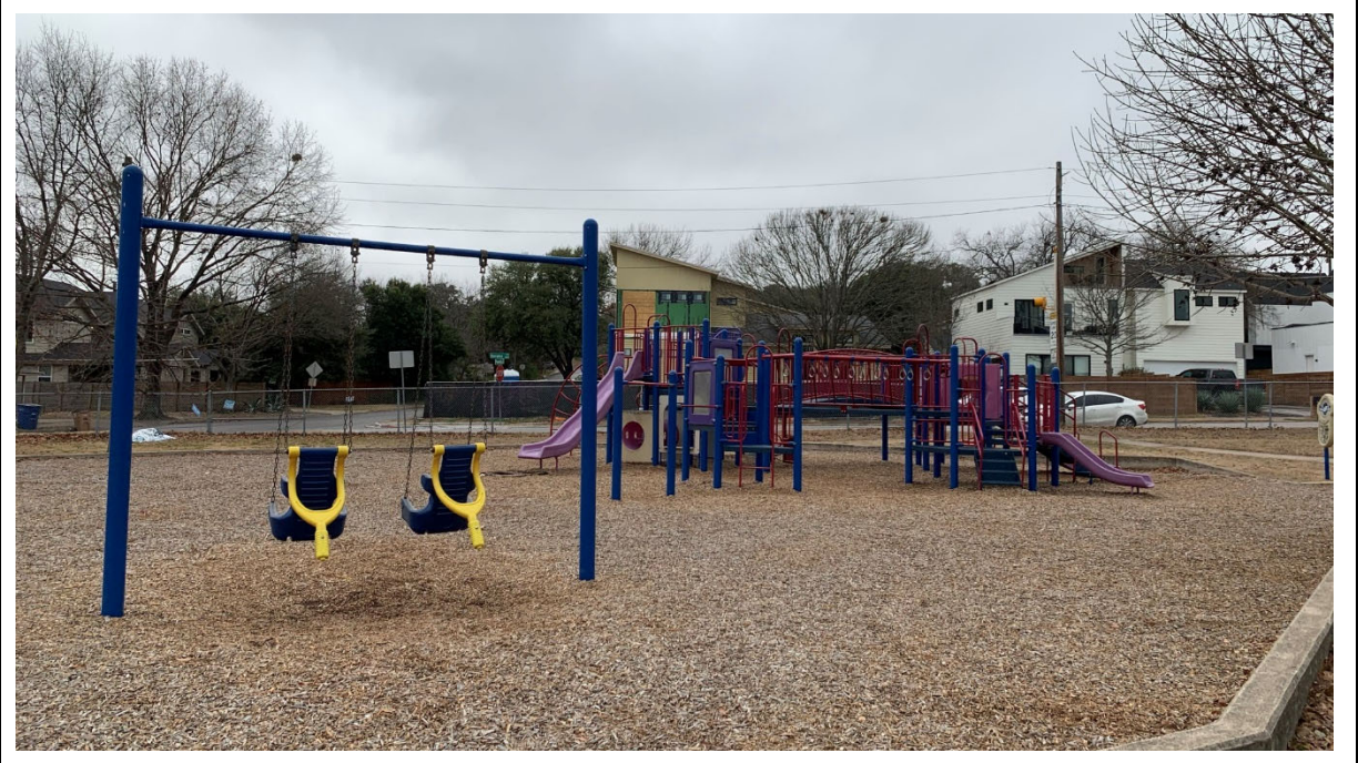
All playgrounds on campus have no shade coverage. There is a small playground dedicated to pre-K and kindergarten that is located near the studio wing.