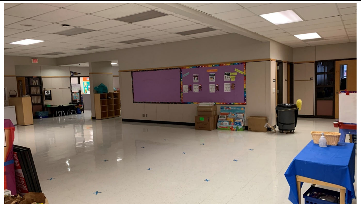
Most corridors on the original building are exterior, but the pre-K and kindergarten addition has a shared flex space in the center of the building for collaboration.