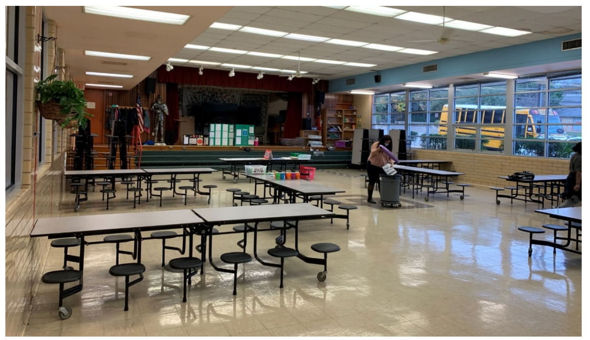
Cafeteria is undersized but has great access to natural light and good visibility to the campus.

There are not many interior hallways due to the courtyards and connection to the outdoors that the studios have, but the campus is still able to adequately display student work.