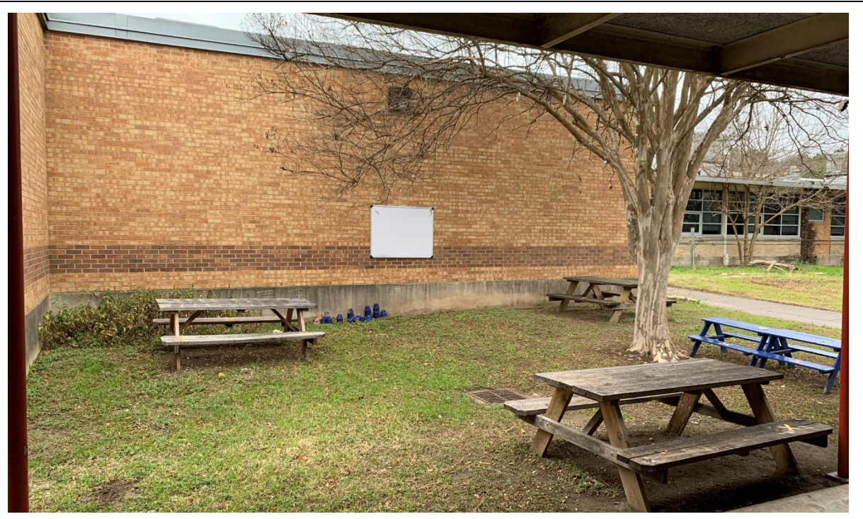
The courtyards throughout campus are well used due to their close connection to each studio wing, as each room opens to the exterior. Furniture needs updates.