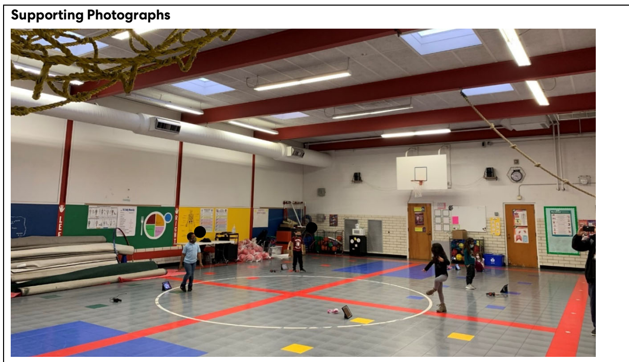
The gym is undersized and needs updates. Flooring appears to be original and there is minimal storage space.