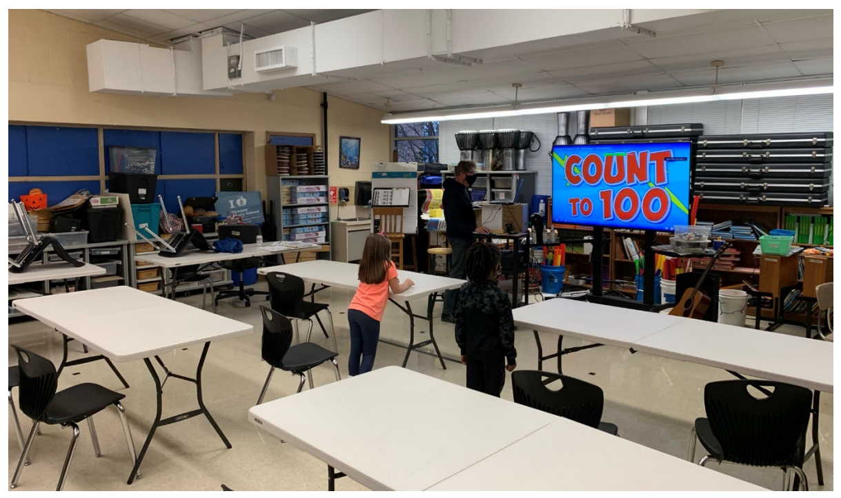
Music is in a standard studio without adequate storage. Furniture in this classroom is due to Covid protocols and does not accurately reflect a normal school year.