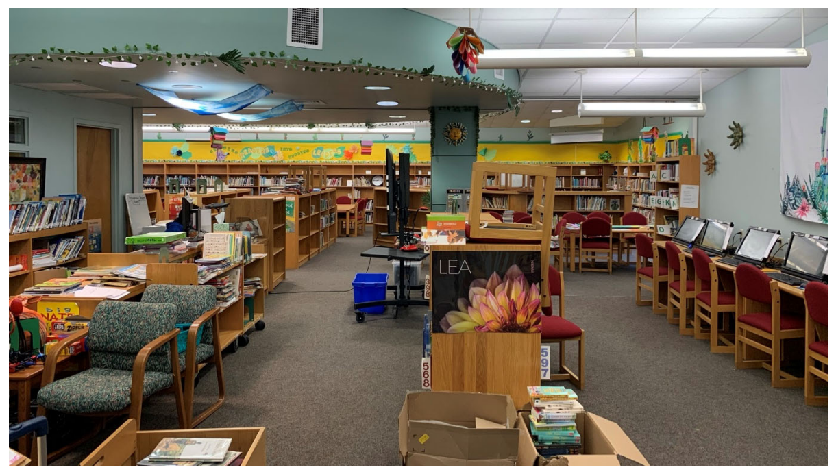
Media Resources: The library is small with dated furniture that is cumbersome to move, causing the space to lack adequate flexibility.