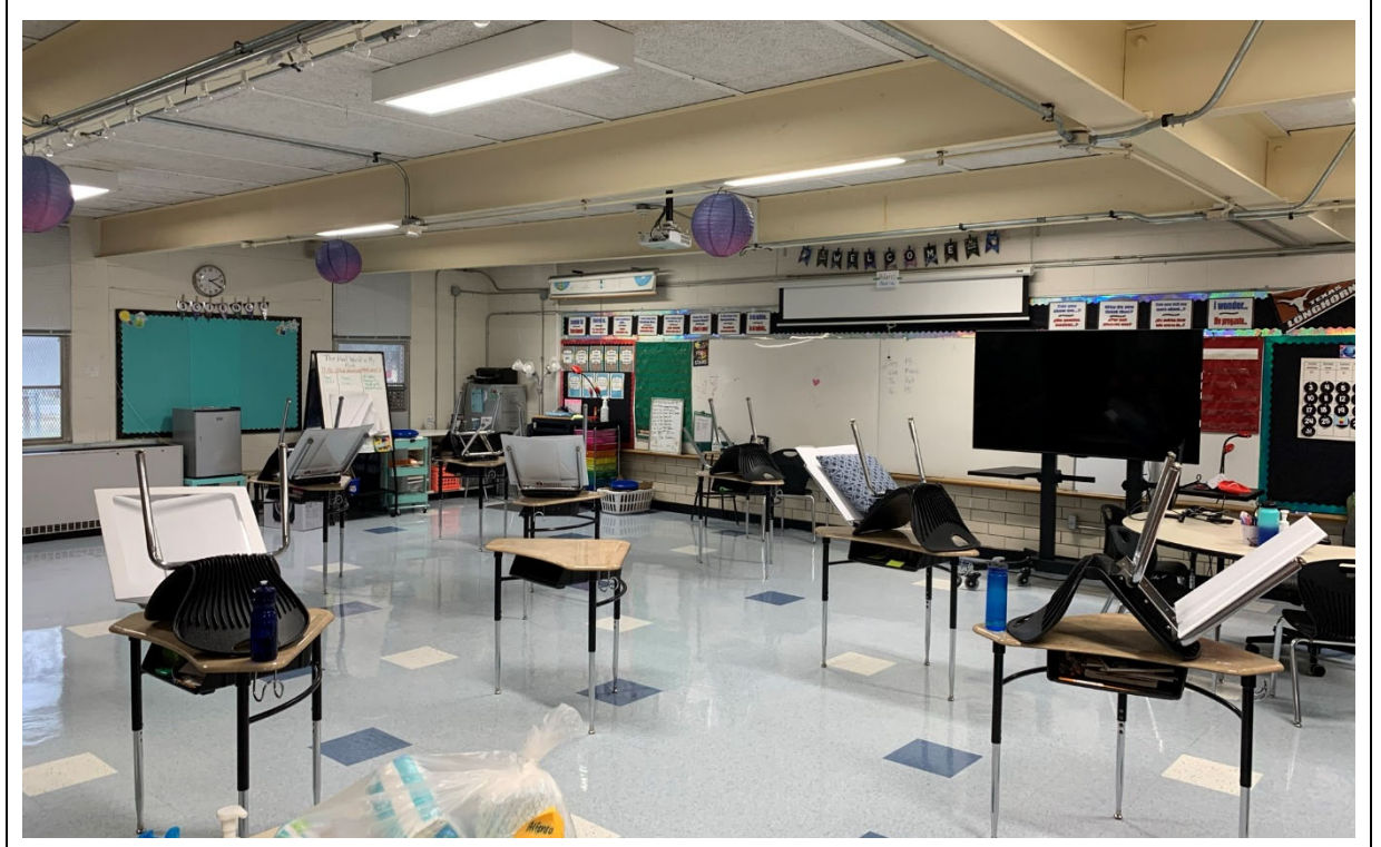
All studios have access to natural light, varying between a few small windows in a room, as shown here, to two full parallel walls of windows.