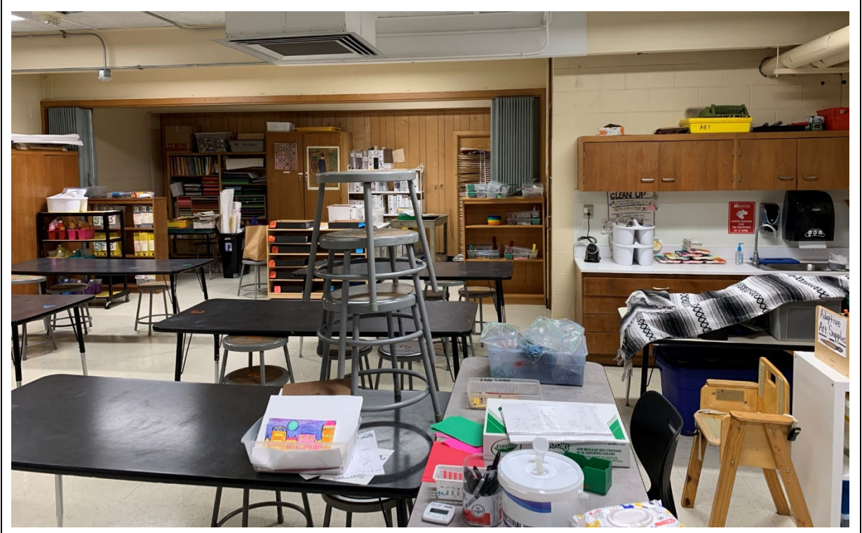
Art is in a standard studio space with no dedicated storage and only one sink. The kiln is not connected to the room and is located far from the room.