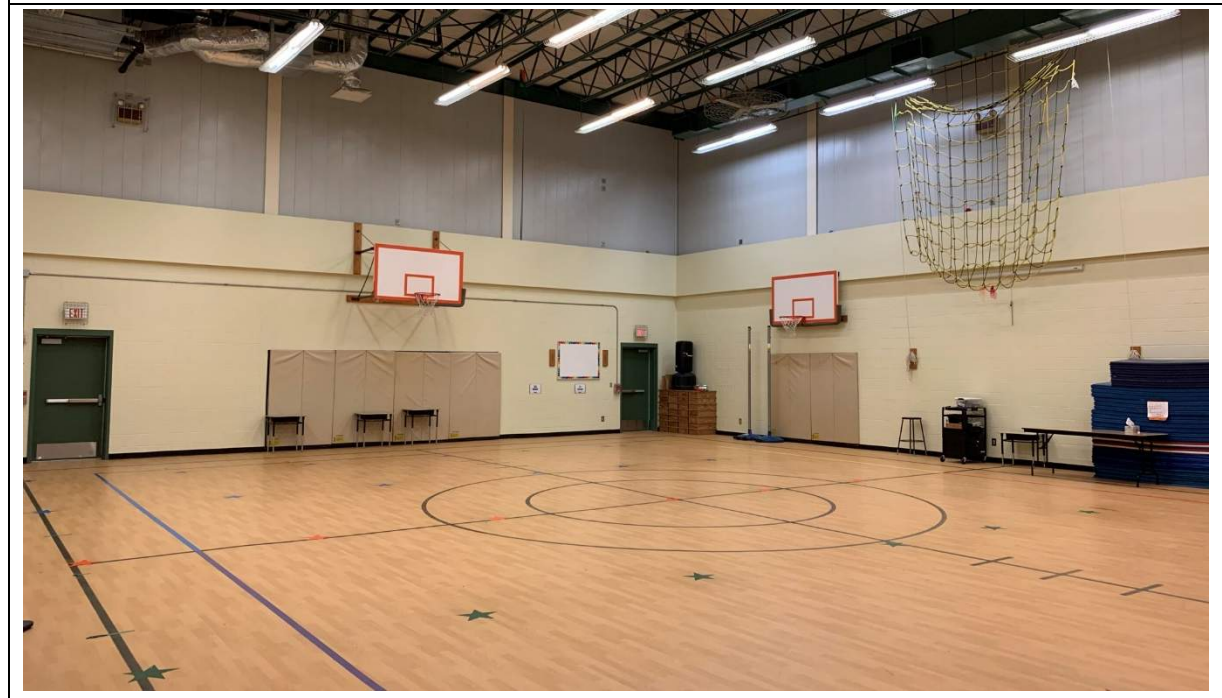
The gym is not well-connected with the outdoor activity areas but can be secured from the rest of the campus for after-hours functions.