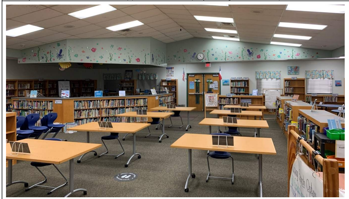
The library is centralized on campus and has good visibility. Furniture is flexible but the stacks are cumbersome to move and make reconfiguration difficult.