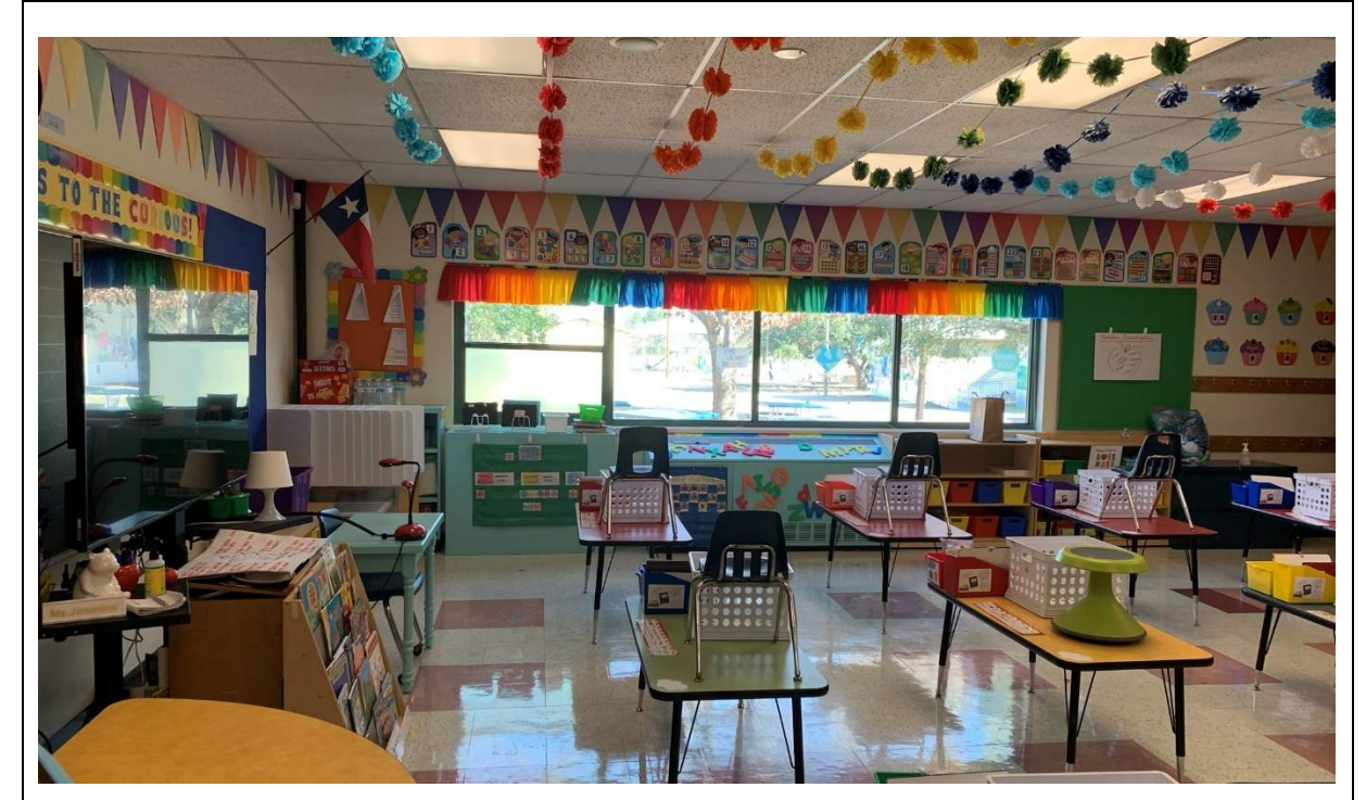
All studios have access to natural light and views and have blinds to control daylighting.