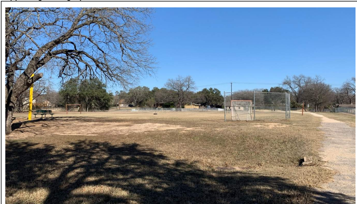
Grass playfields and a walking trail are present and well-connected to the building.