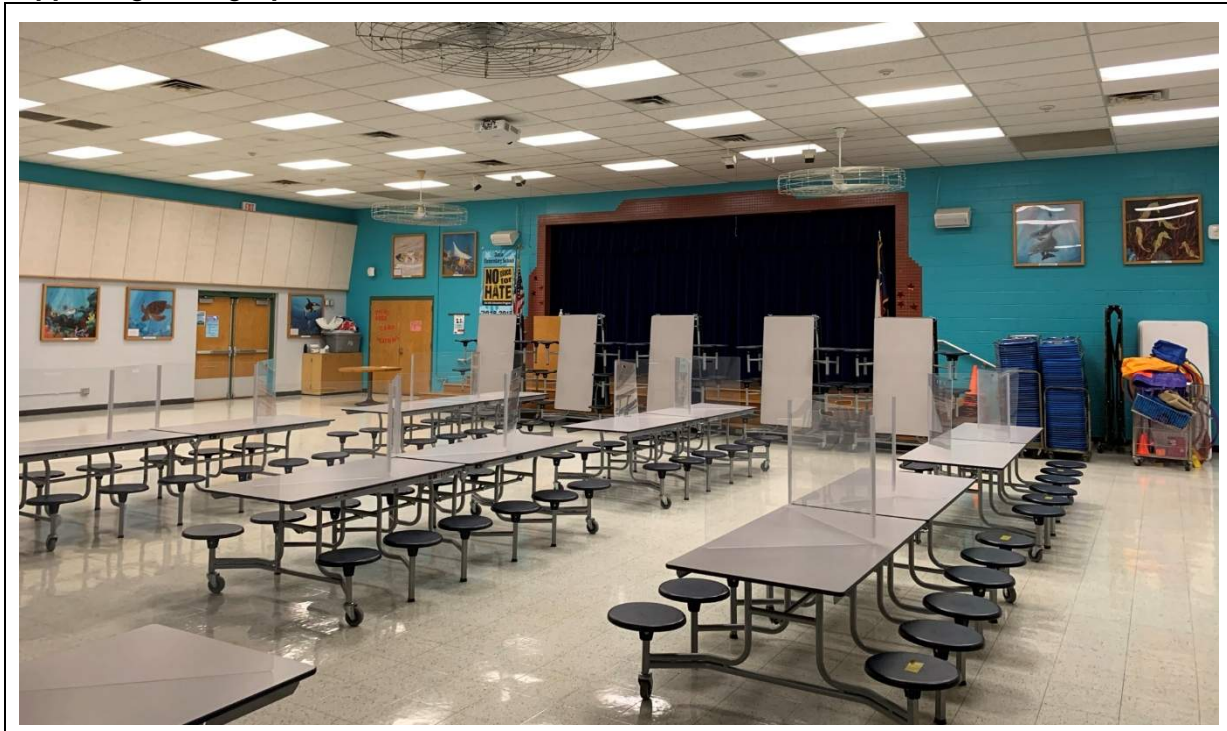
Cafeteria is adequately sized but only has one seating option. It is not connected to the outdoor areas but shares an operable wall with the gym.