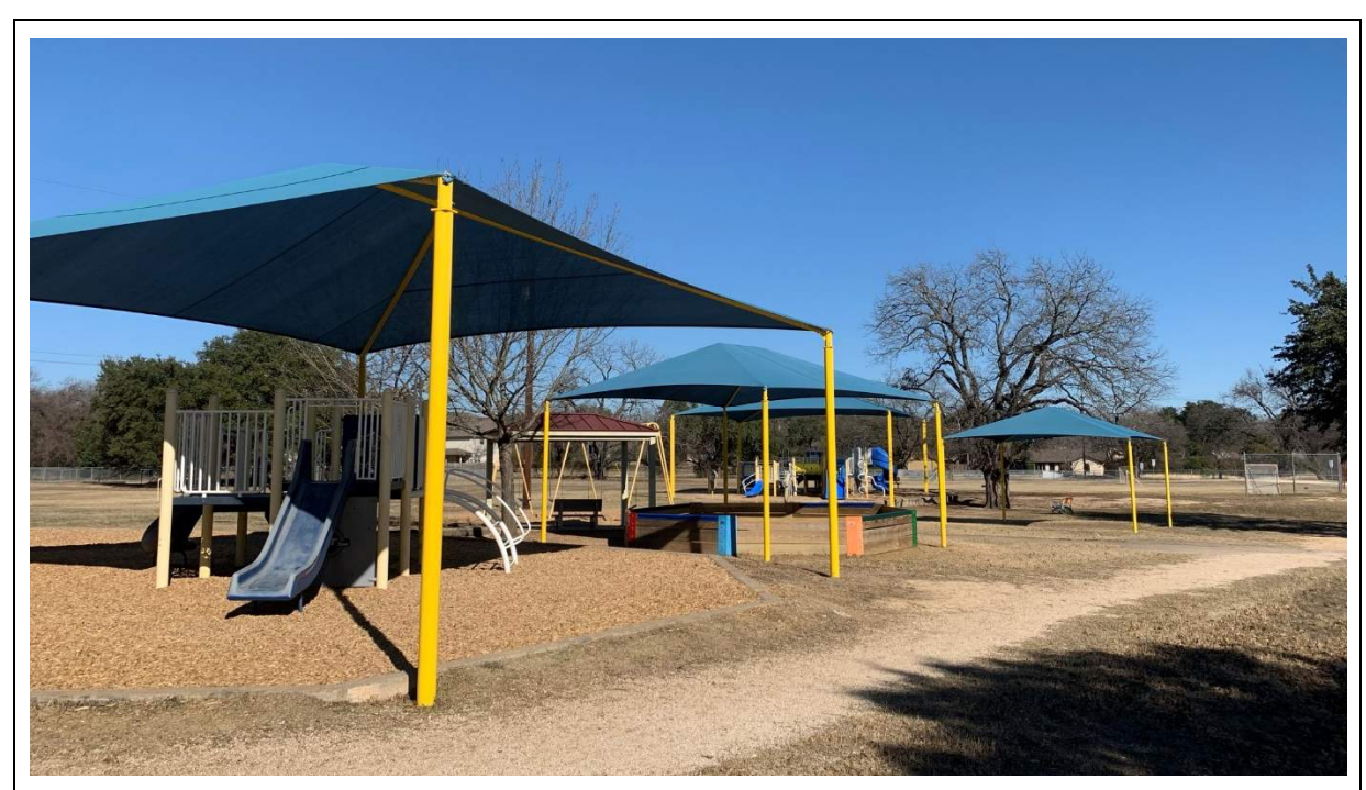
All playgrounds are in good condition and have shade structures, as does the paved outdoor court.