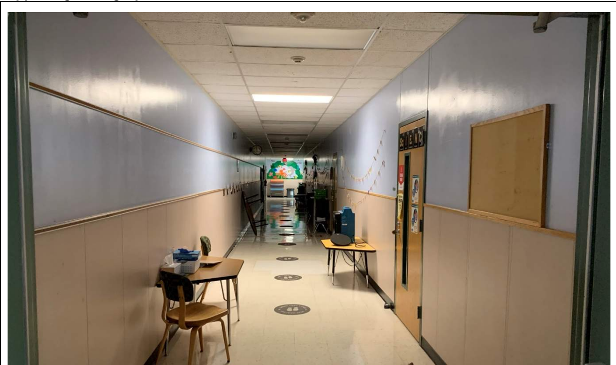
Interior corridors vary in width, but some are narrow and more difficult to navigate and lack natural lighting.