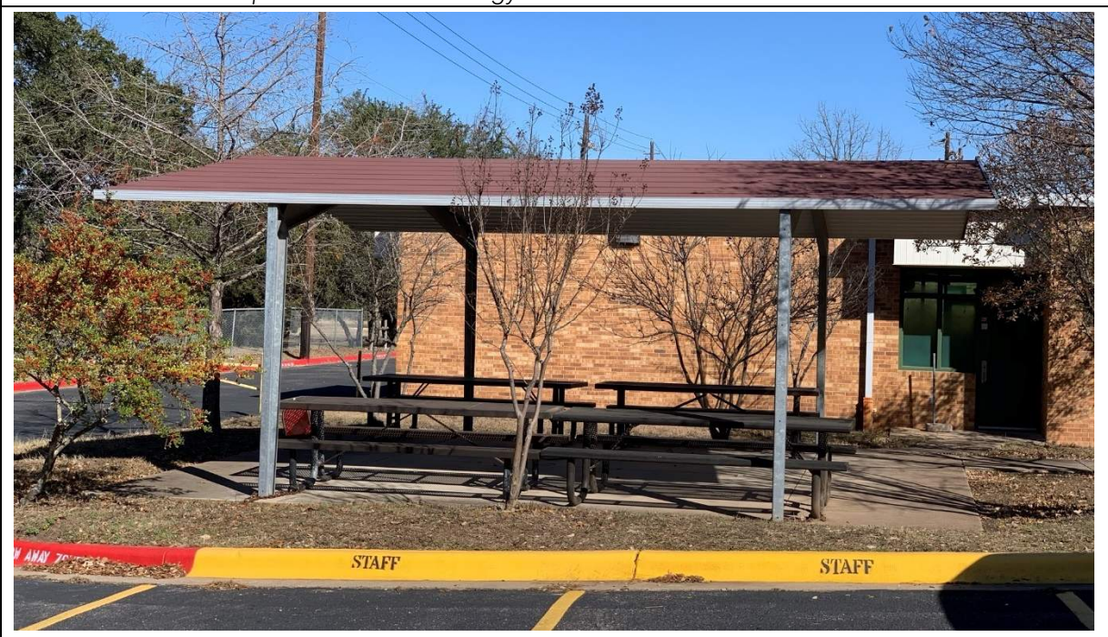
A few areas for outdoor studios around campus but they are disconnected and in average condition.