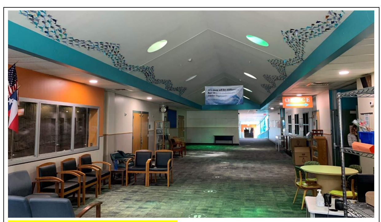
There is no secure vestibule at the main entry. Windows to the reception area provide some visibility to the corridor. There are opportunities for display throughout the campus.