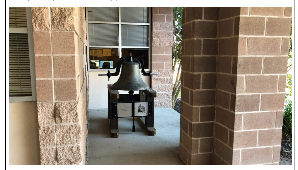
Historical relics are on display where visitors and students can view them.