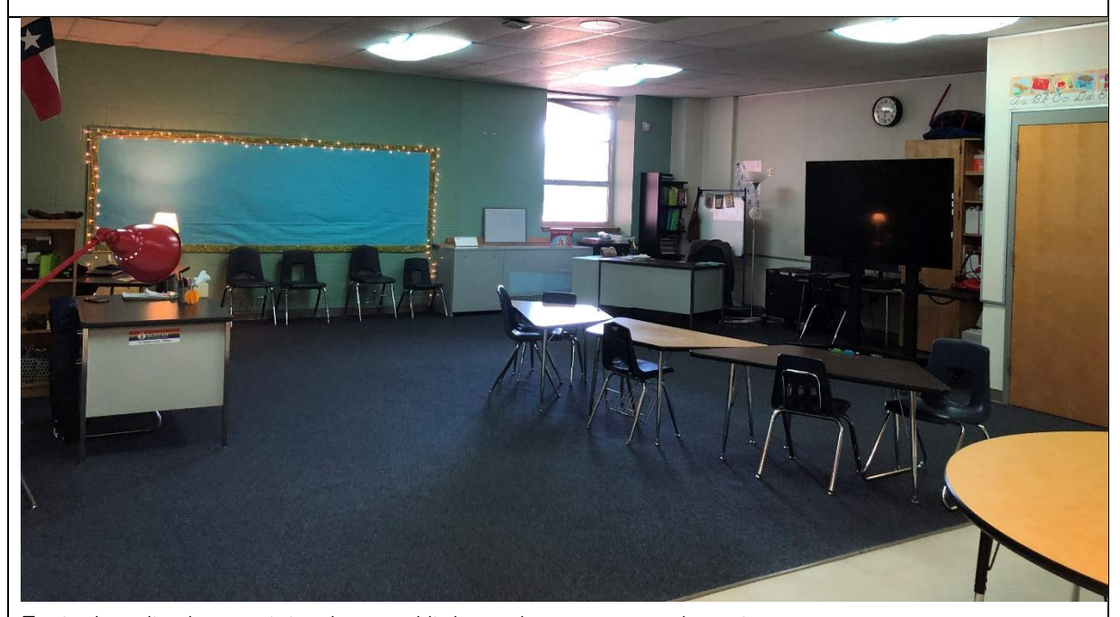
Typical studios have minimal natural light and access to outdoor views.