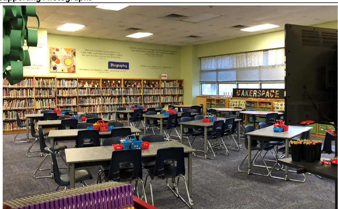
Media Center: There are reconfigurable tables and chairs for various group sizes.