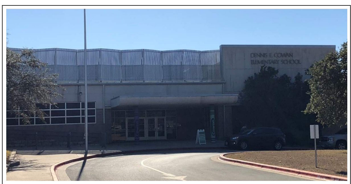
Entry has iconic crayon columns. Bus and car drop-off and pickup are separate and away from parking. Canopy does not sufficiently protect children from rain.