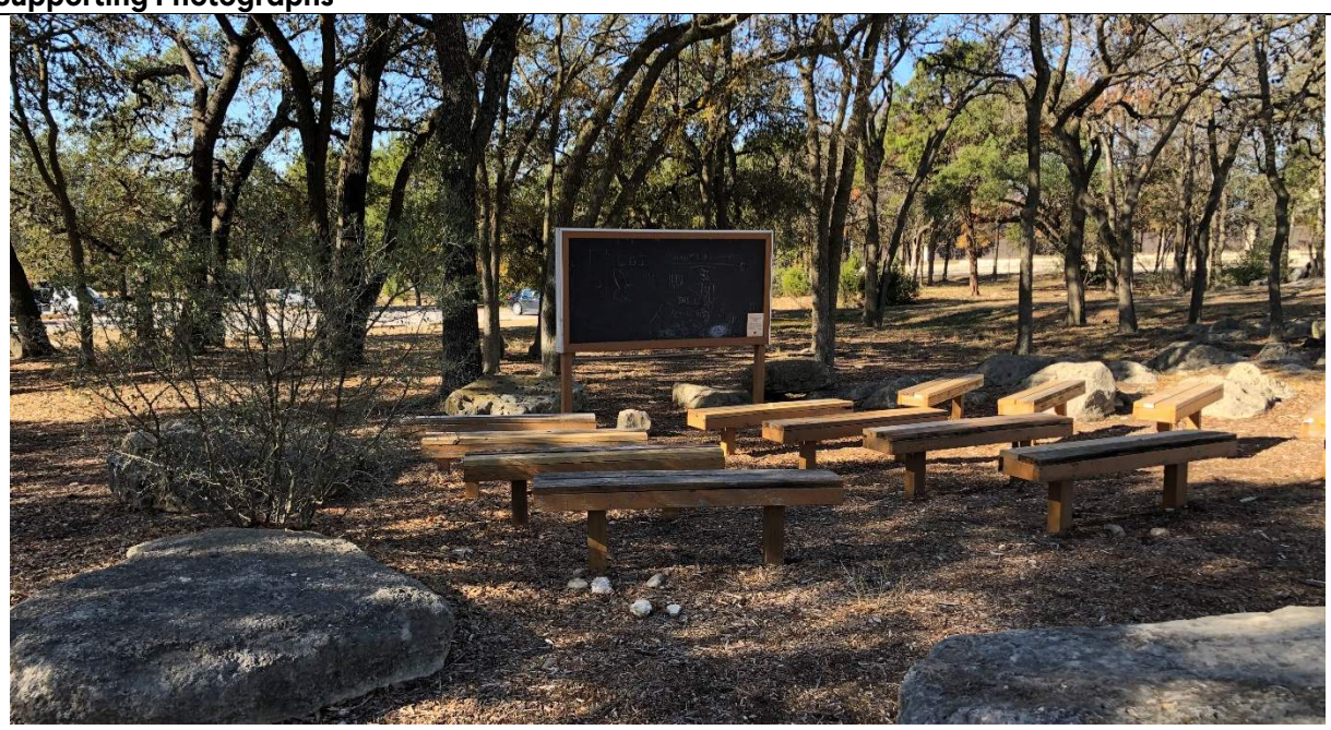
Outdoor learning space has bench seating and chalkboard display. Shade provided only from trees.