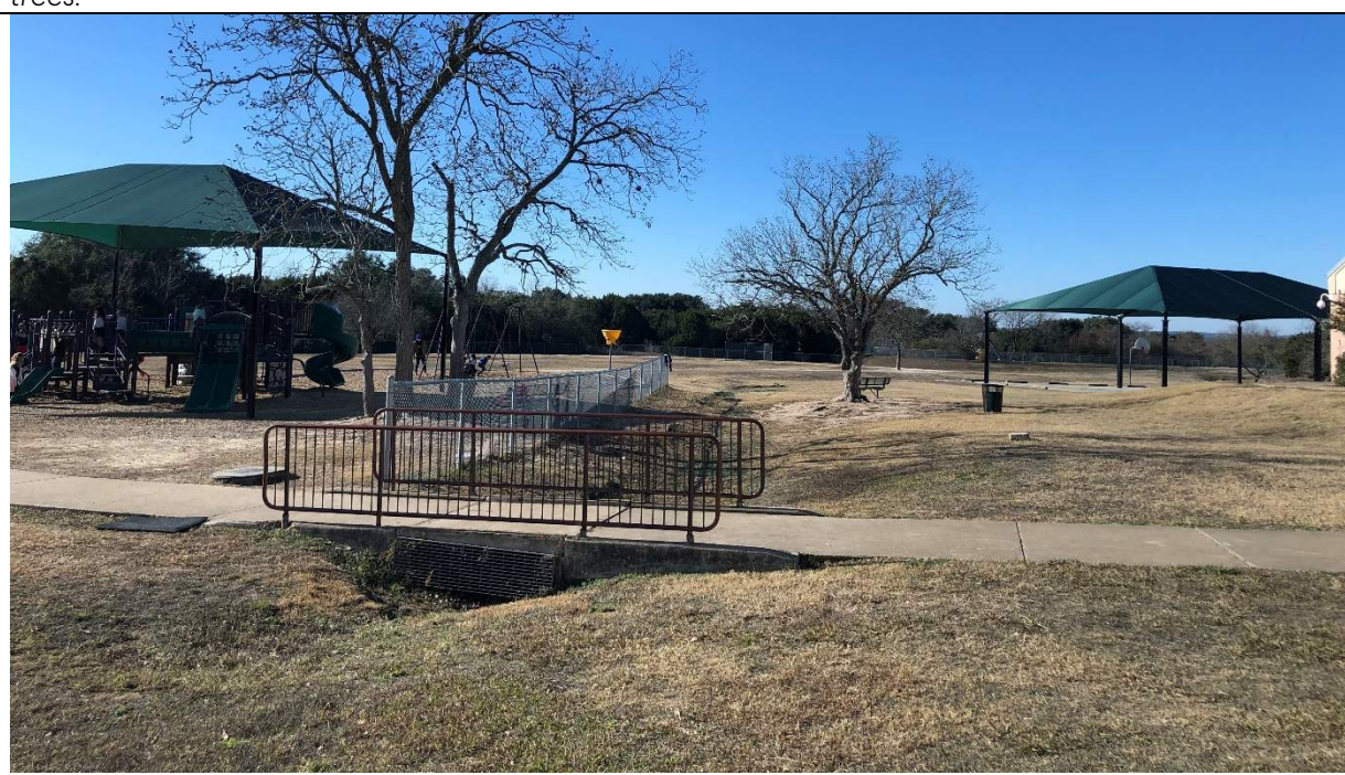
Play areas are fully covered by shade structures.