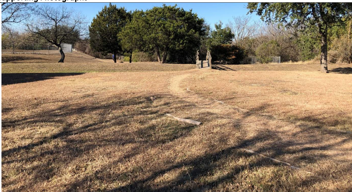
Neighborhood walking path connects Westgate to campus