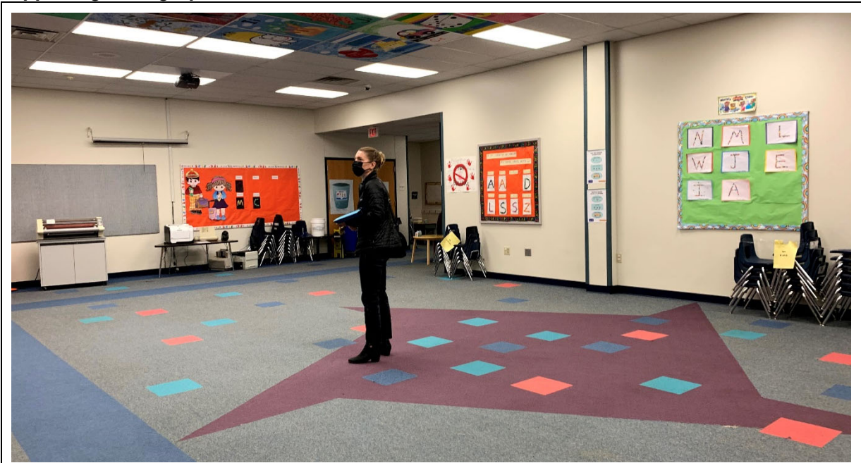
Stand-alone studio building has 9,000 SF and was built in the late '90s. It has adequate collaboration space that all studios share.