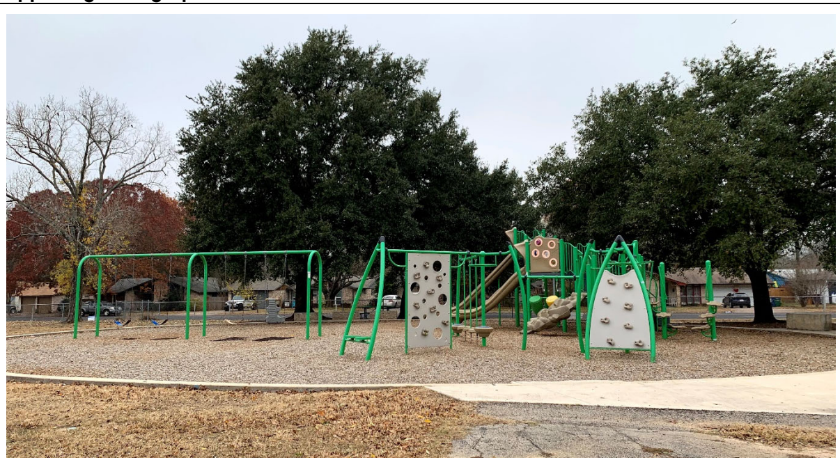
There are two generously sized active playgrounds. Neither has shade.