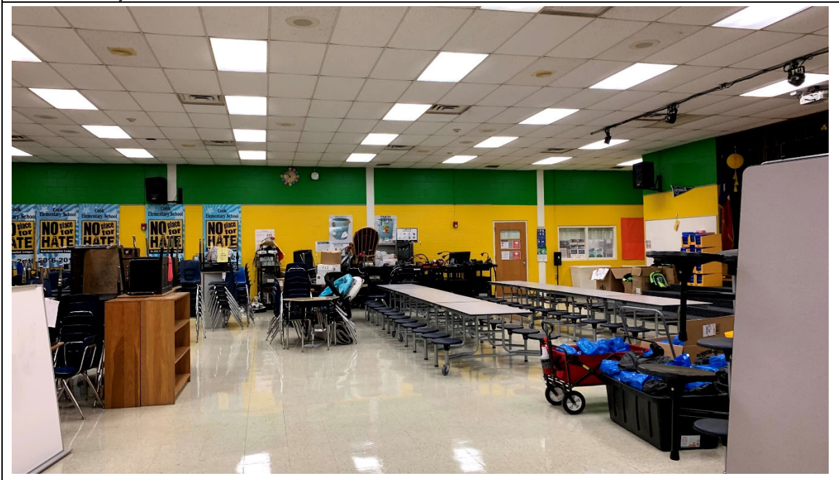
Cafeteria is adequately sized. Stage to the right of the image does not have adequate A/V for presentations.