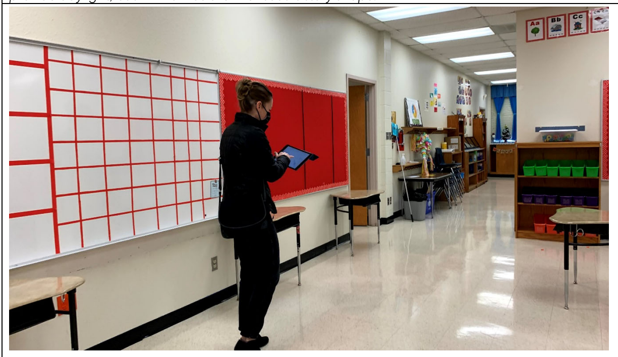
Studios (numbered 1-7 and 18-25) are horizontally stacked and have a large opening from front to back studio, creating acoustical and disruption issues for students traveling from a studio to the hallway.

Art studio is undersized per current Ed Spec and does not have adequate storage. Ample windows provide daylight, but mini blinds are in unsatisfactory shape.