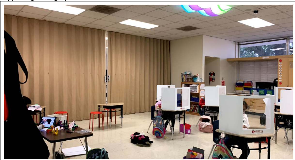
Studios (numbered 10-17) have accordion partition. They are not used very often and create acoustical issues.