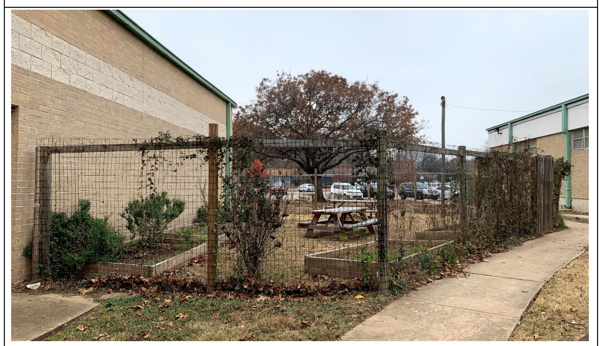
Outdoor garden space is in development. School is applying for grants to provide upgrades for landscaping and outdoor furniture.