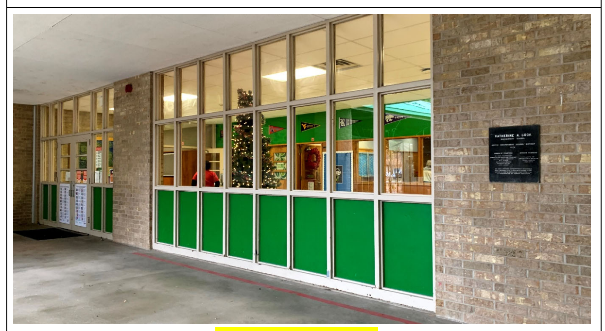
Front entry door has limited glass. There is no secure vestibule. Main office is at front entry and has limited line of sight to the front door.