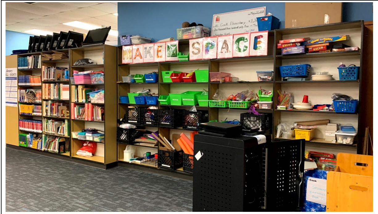
Library has a small maker space. There is not adequate library storage, and the media resources furnishings are dated.