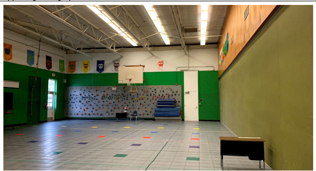
Gym is adequately sized per Ed Spec and opens to cafeteria. Flooring and lighting are unsatisfactory.