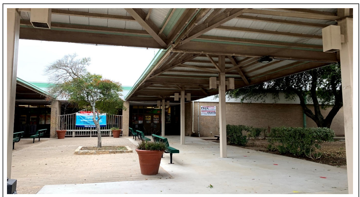
Entry Canopy: Generous canopy but limited glass at main entry.