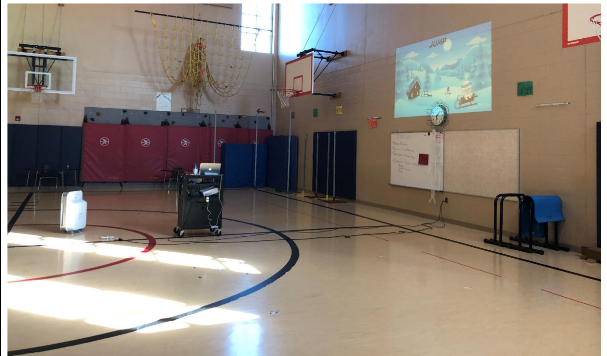
Gym has natural light and is adequately sized. Storage space in gym is on smaller side.