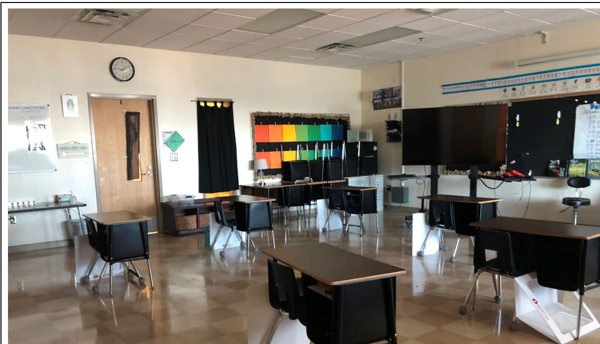
Most studios have adequate natural light, but doors with small windows provide little transparency into the learning spaces. Furniture is bulky and difficult to reconfigure.