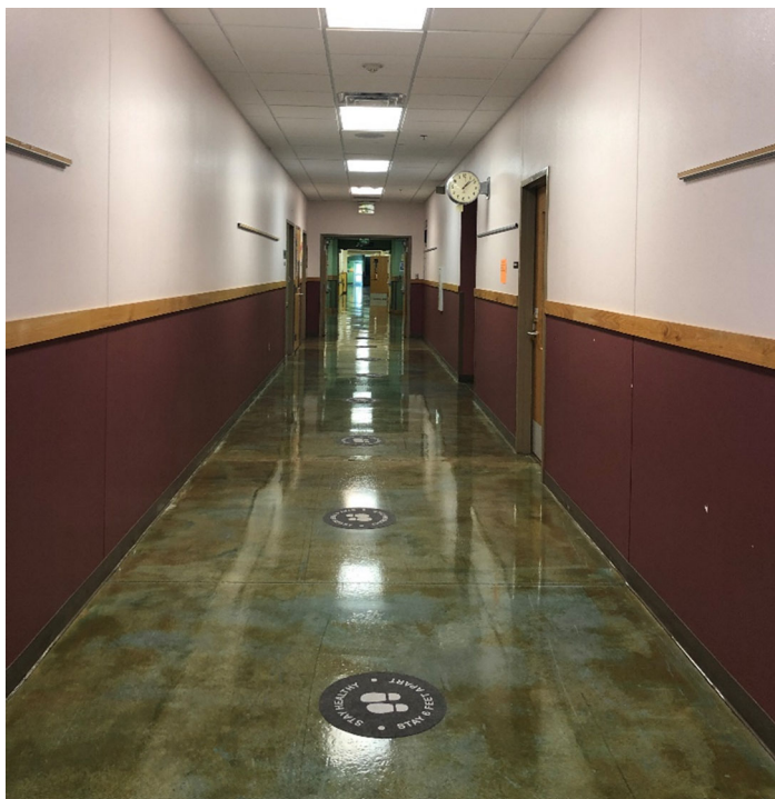
Hallways are adequate in size, varying from 8-10 feet in width. They are double-loaded corridors, and there is limited visual connection or transparency to the learning spaces.