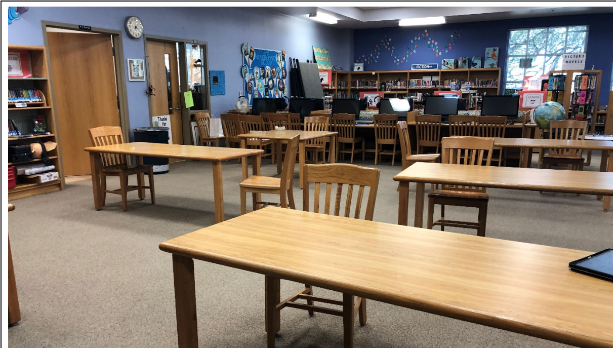
Media Center: There is no flexible furniture available for different configurations and current furniture is not appropriately sized for students.