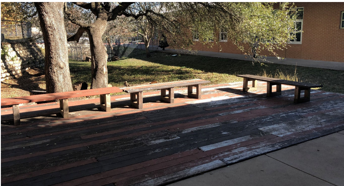
Outdoor learning spaces are available. They need renovations, additional seating and shade.