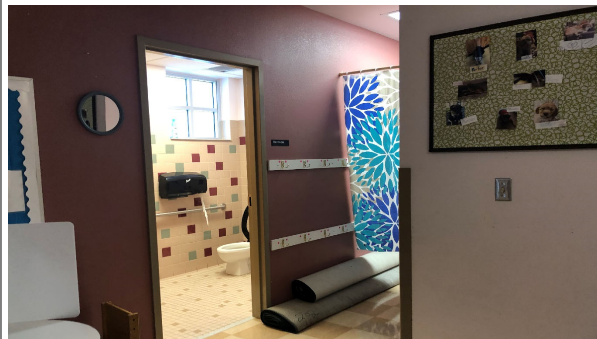
Acoustic and visual privacy suffers from the current restroom connections in the studios.