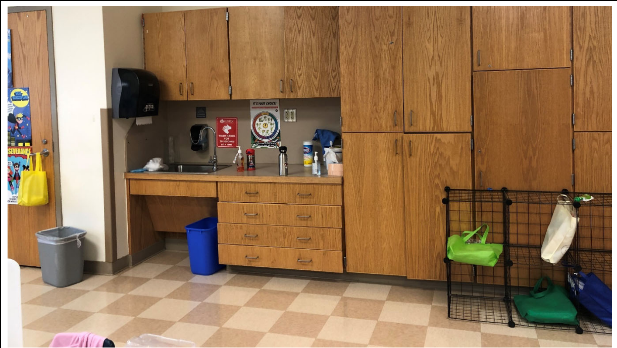
Typical studio storage is provided by built-in cabinets.