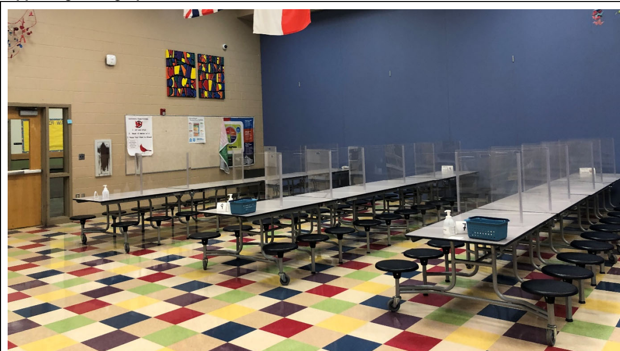
Cafeteria: Adequate space but only one type of furniture is provided.