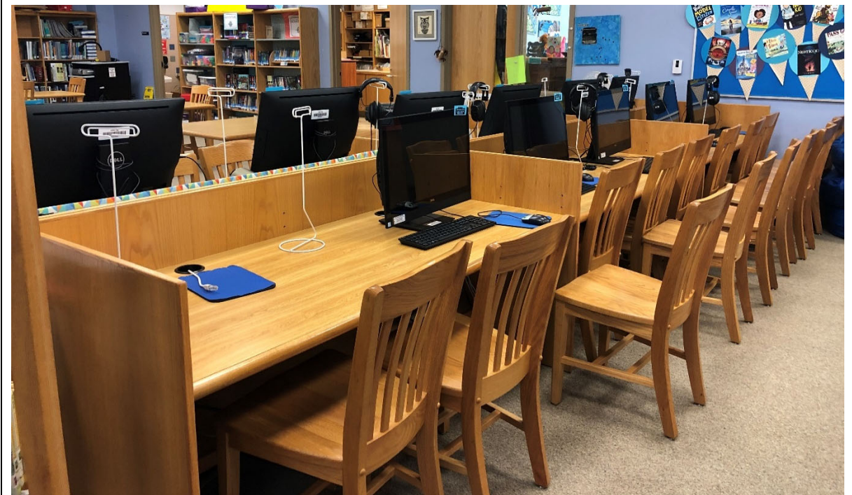
Media Center: Individual desks with computers. Better acoustical privacy could be provided. No private quiet study spaces. There is a need for different seating types for small- and large-group collaboration and to support informal interaction.