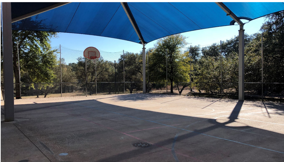
50% or less of the play areas are shaded. Some play areas need updates and are not in good condition.