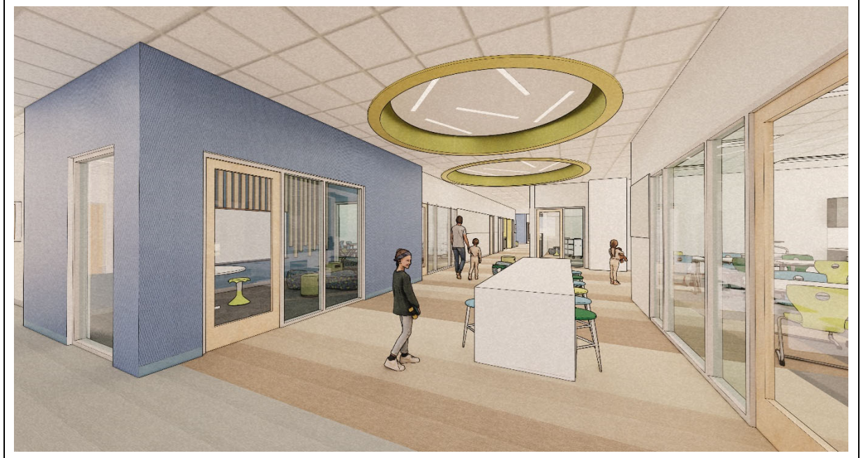
Rendering of typical learning neighborhood with collaboration space and transparency into studios.