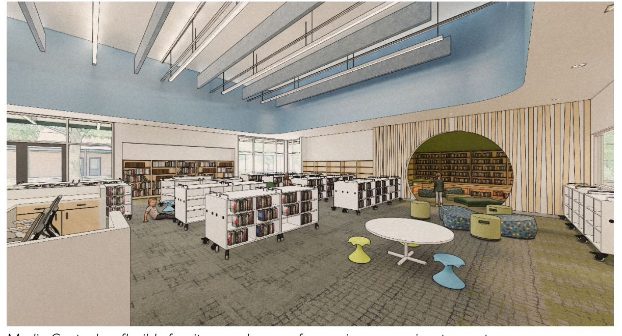
Media Center has flexible furniture and spaces for varying group sizes to meet.