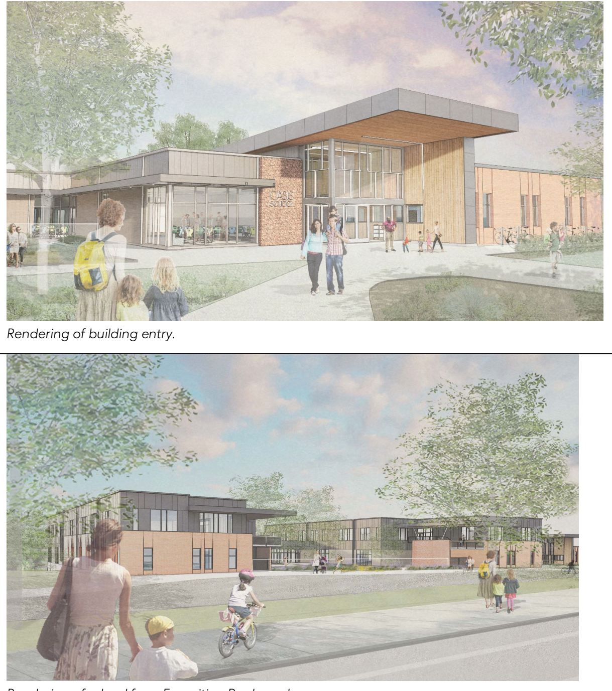
Rendering of school from Exposition Boulevard.