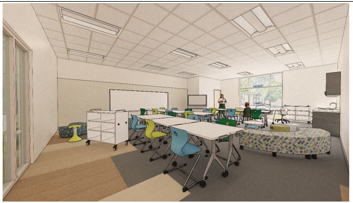
Rendering of typical studio that has transparency into corridor, excellent daylight / views, and flexible furniture.