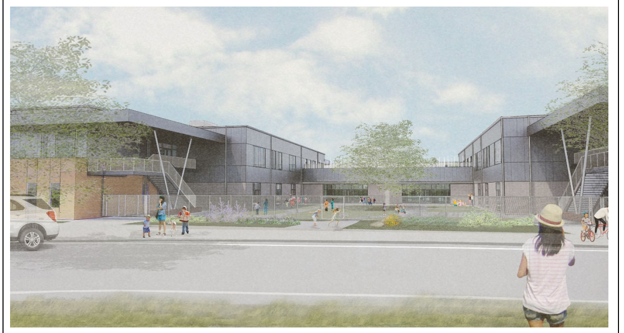
Rendering of secured outdoor courtyard space.