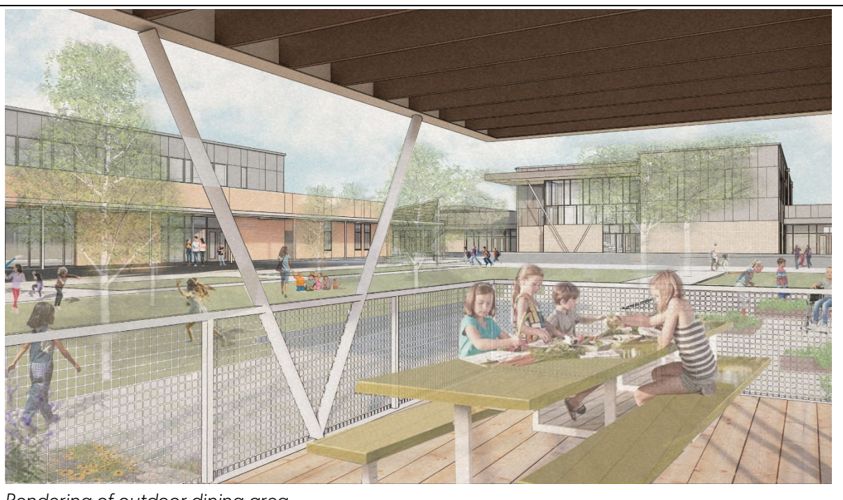
Rendering of outdoor dining area.