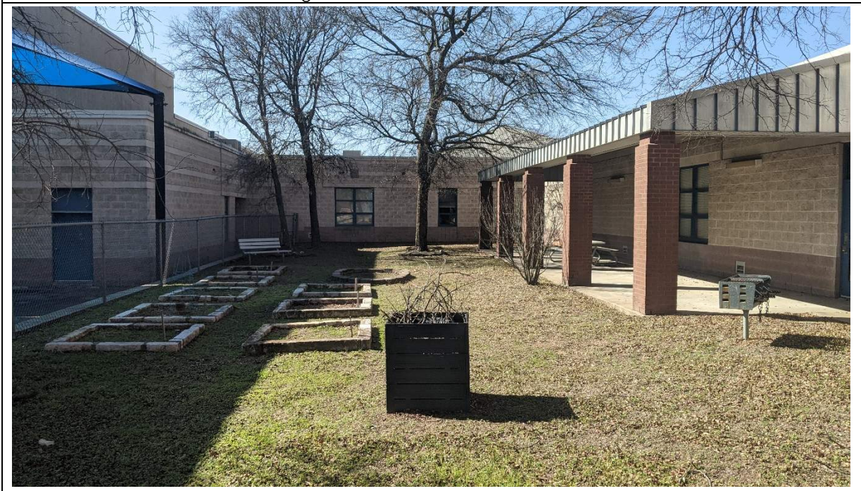
Studio wing with direct connection to small, fenced-in exterior space. There is a picnic table and a bench. Area needs further development to function well as an outdoor learning space. It was noted by the District Project Manager that the cover (left side of image) for the play area is torn and needs to be replaced.