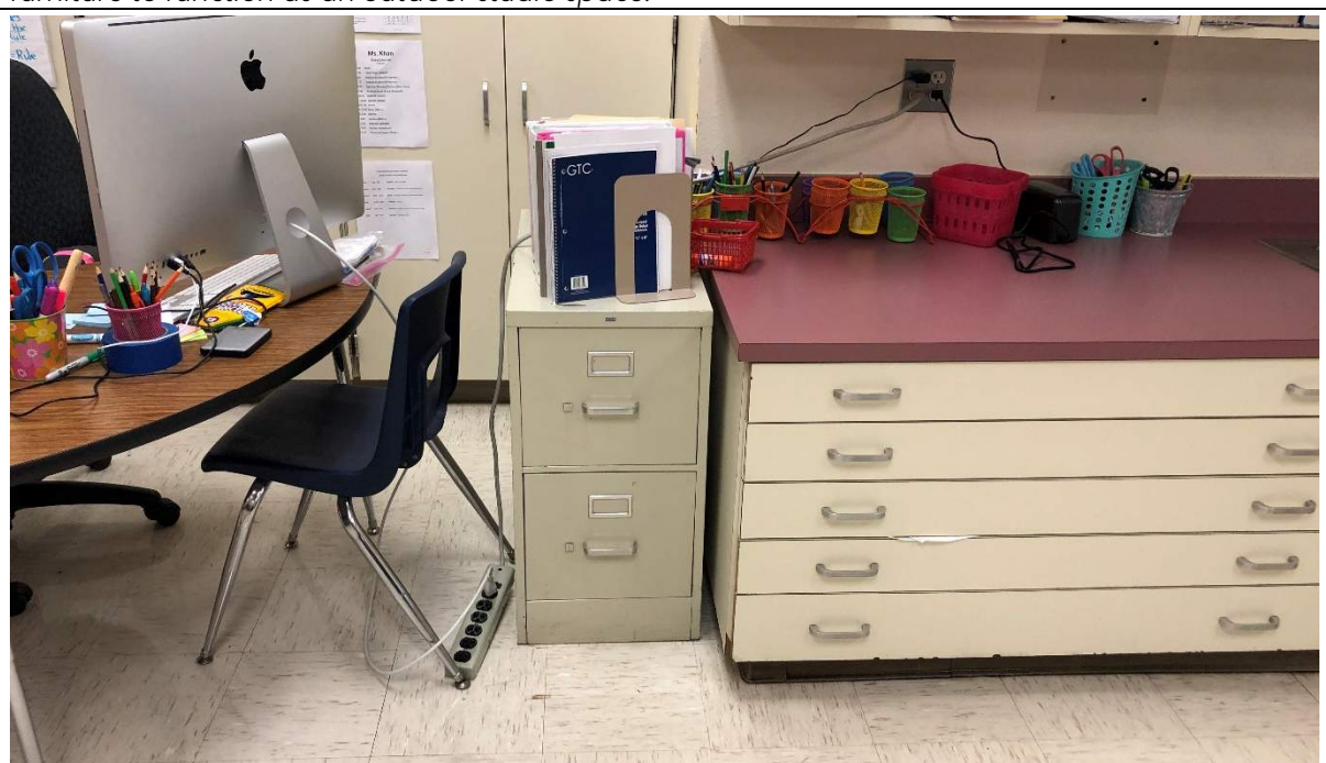
Electrical connections are lacking in studios for charging devices. Extension cords and power strips are used in studios and there are no centralized charging locations.

Wooden deck was built as an Eagle Scout project. It needs further development with shade and furniture to function as an outdoor studio space.