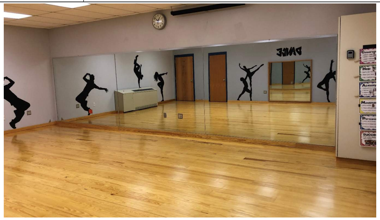
Opposite wall of dance room includes built-in storage cabinet.

Small interior room is converted to dance studio with small mirror. Space has storage closet and connected ADA-compliant restroom.