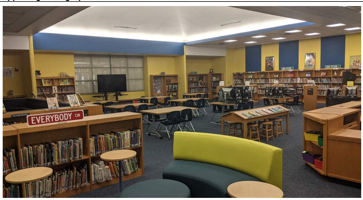
Library has a mix of furniture for social interaction. Tables have wheels for ease of reconfiguration and chairs are stackable for storing.