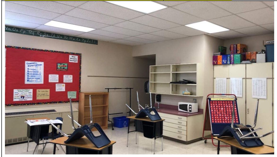
Typical studio has connection to adjacent studio through small bathroom corridor. It is requested that the studios be separated by a door that can close. Adjacent studio noise is distracting to learners. Typical studio furniture can be reconfigured, but not easily. Some furniture is in worn condition.

View of the main entry is welcoming with displays and use of color. The main entry does not have a secure vestibule, but there is an office window in the space to check in visitors.