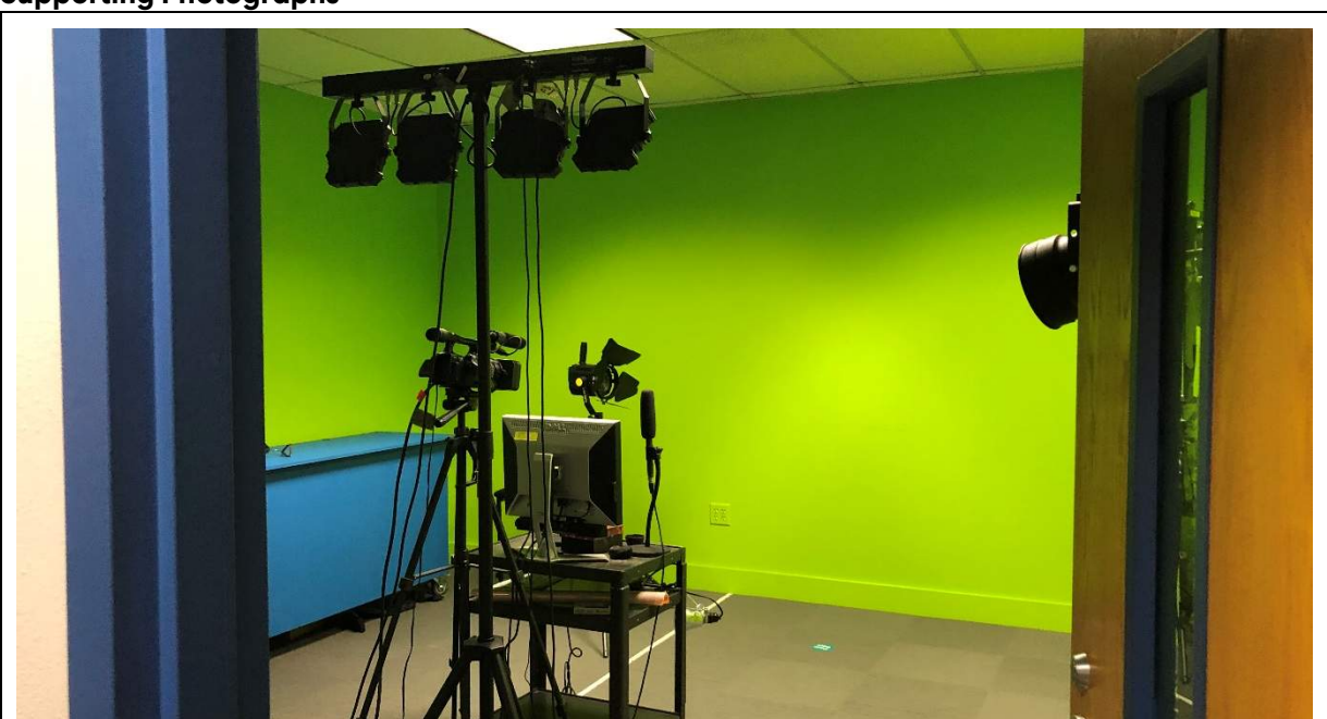
Dedicated green room for video media production.