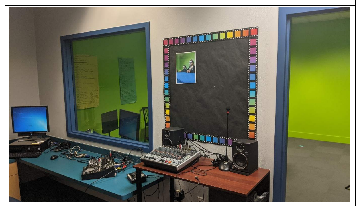
Part of computer lab area/part of control booth to green room.