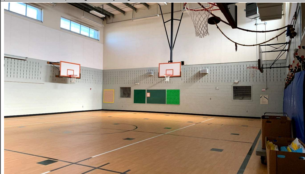
Gymnasium: The gym is in satisfactory condition and is adequately sized.