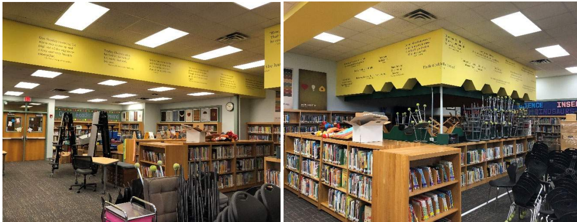
Library: Due to COVID restrictions, pictures do not reflect normal conditions; however, they show the book layout and the larger group reading "stadium" seating area. There is a need for small breakout areas.