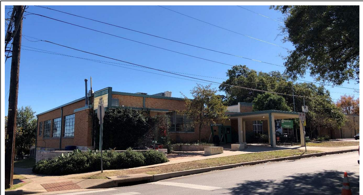
School Entry: A single canopy indicates the location of the main entry.