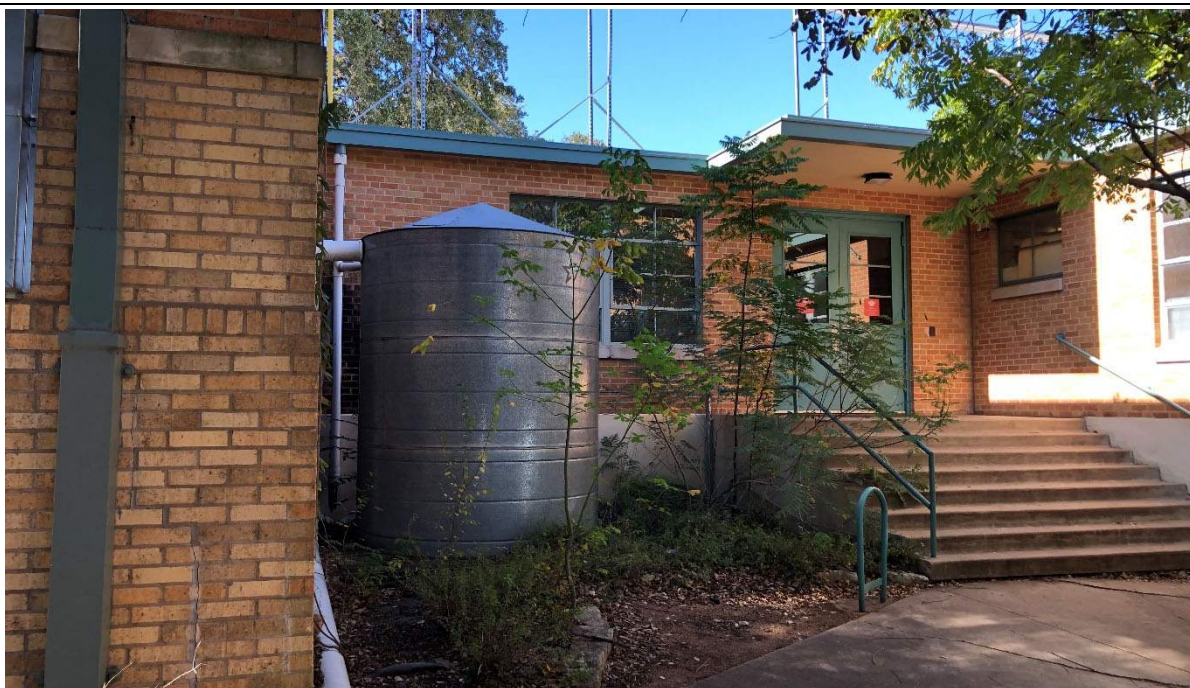
Back Entry: The back entry from the playground showing one of the cisterns on site.