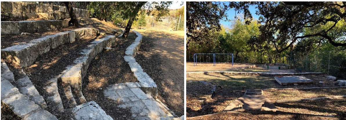
Outdoor Studio: The outdoor studio consists of stadium seating and a small stage platform and is shaded by a large oak tree. The space can accommodate a large group of people. Sloped site appears to be a visibility concern.