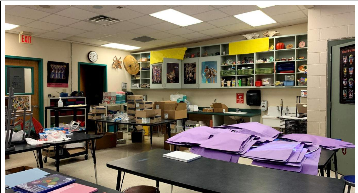
Art Room: Due to COVID restrictions, this picture does not reflect normal conditions; however, it shows the furniture and storage/plumbing amenities. .