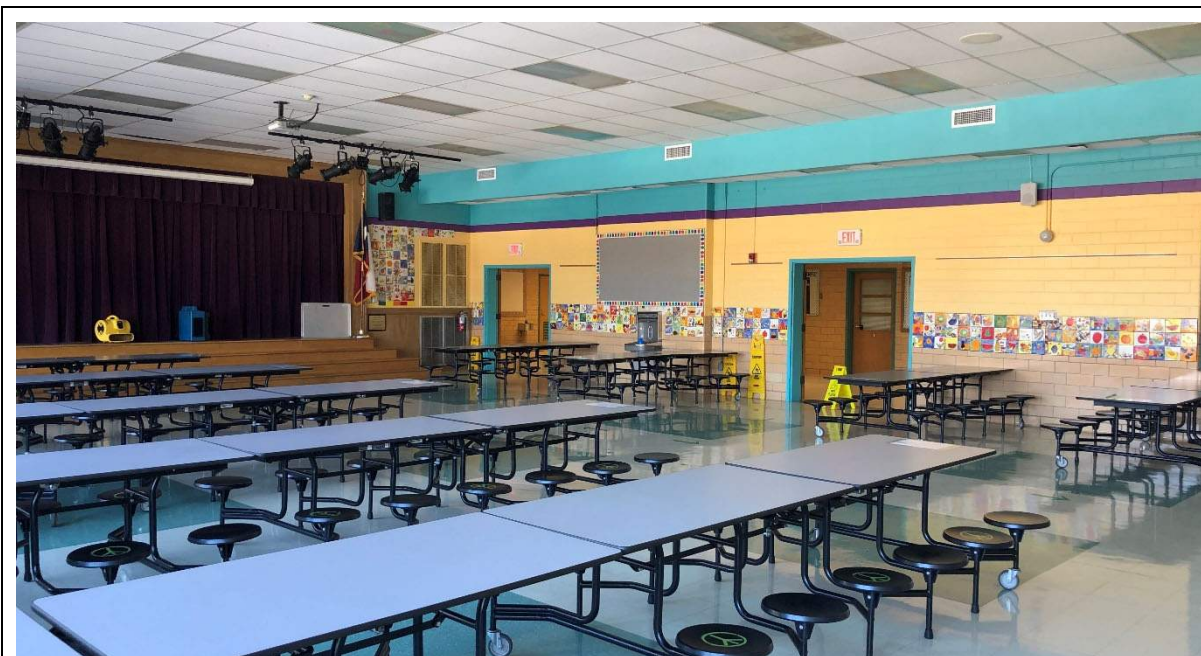
Cafeteria: The size of the cafeteria is adequate and has great daylight, however no designated place for trash, composting and recycling.