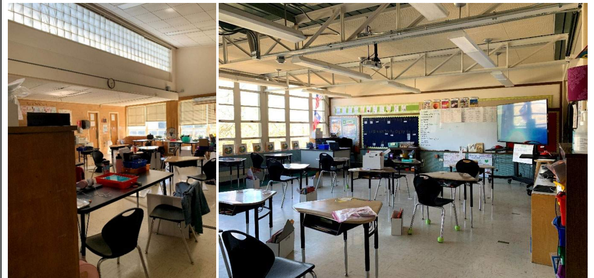
Studios: There is ample daylight in most of the studios due to orientation and clerestory windows. Furniture in studios is sturdy and in good condition and has flexibility with separate desks and chairs.