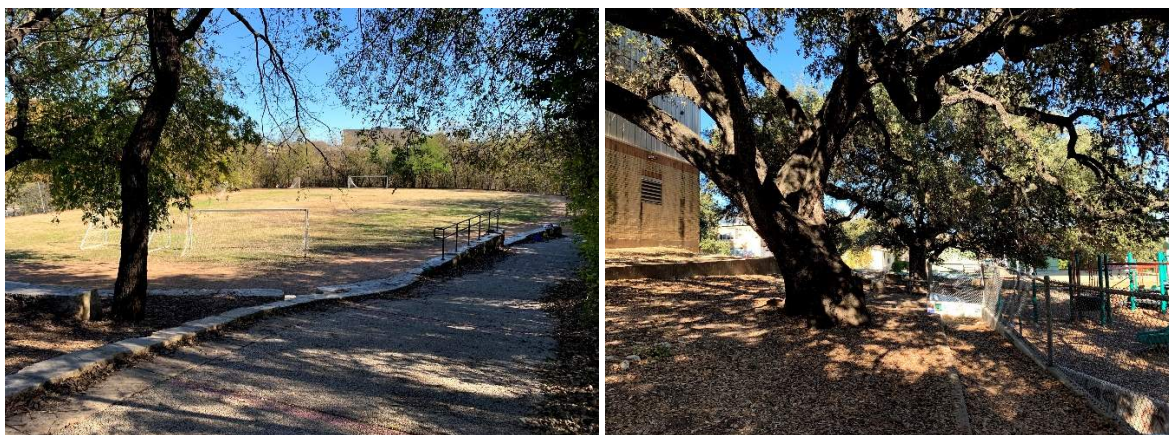
Outdoor Paths: The image on the left shows the path to and around the multipurpose field. The image on the right shows one of many large oak trees on site that shade paths and seating areas.