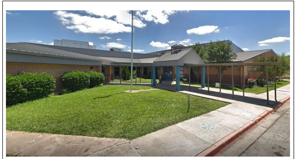
A large, covered walkway provides a welcoming front entrance, but school signage is poor.