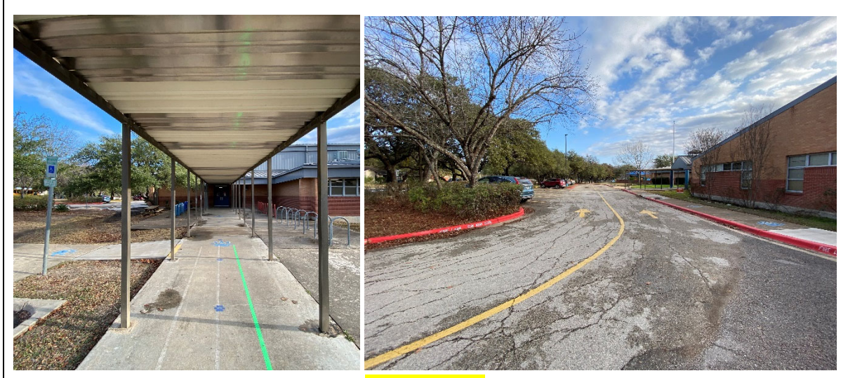
The drop-off canopy needs updates and better lighting (left); the primary entry drive loop needs wayfinding signage (right).