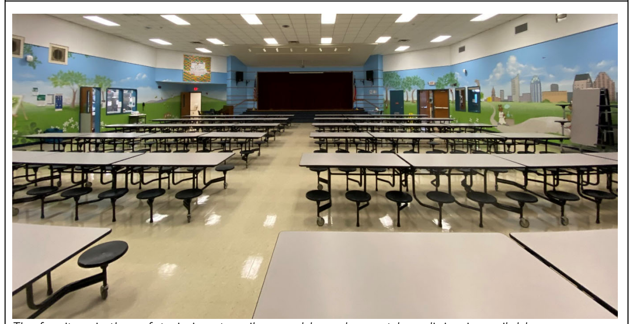
The furniture in the cafeteria is not easily movable and no outdoor dining is available.