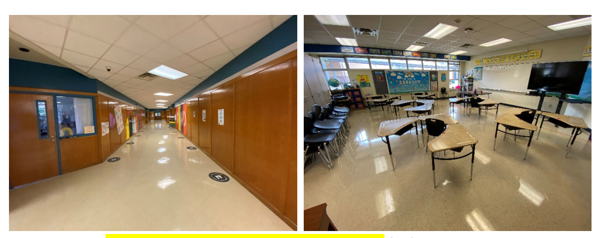
Academic Wing: Limited visibility between studios and corridors (left); typical learning studio (right).