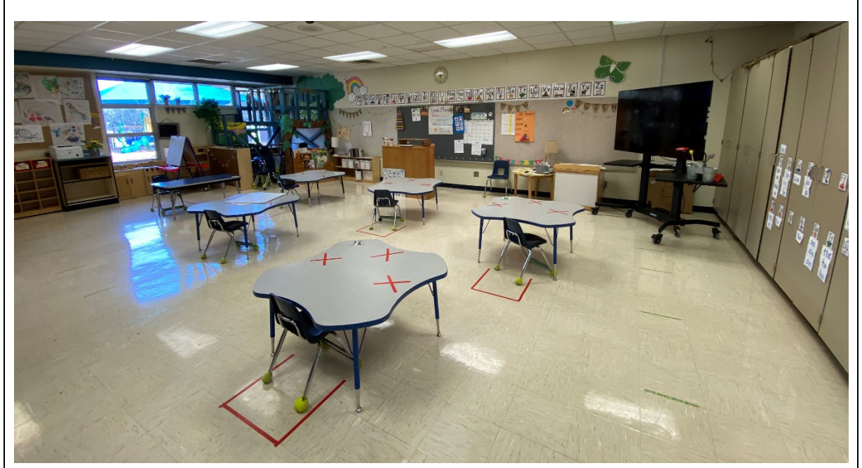
Studios have access to natural light and views. Furniture updates and flexible partitions are needed to support project-based learning.