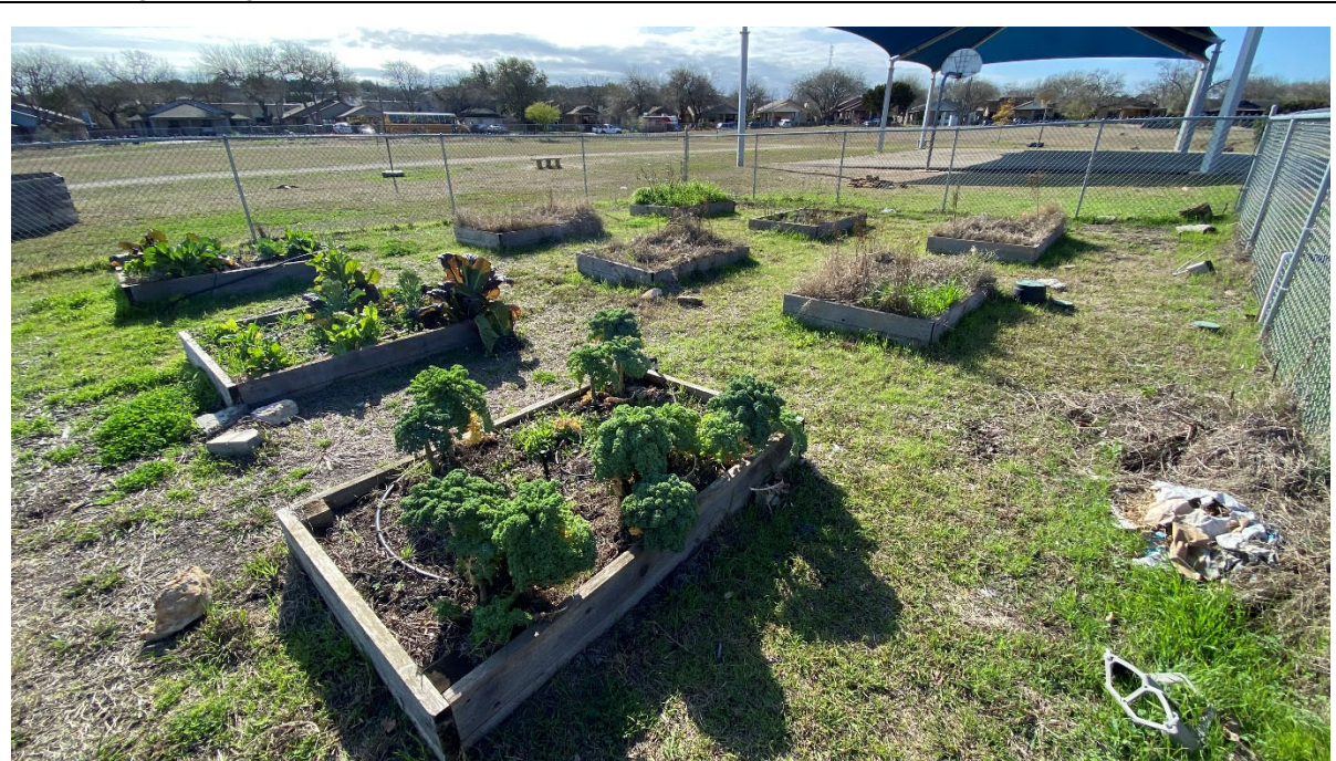
The learning garden is secured with a fence and has plenty of room. Garden beds are not raised for accessibility and the rainwater cistern is not located nearby.