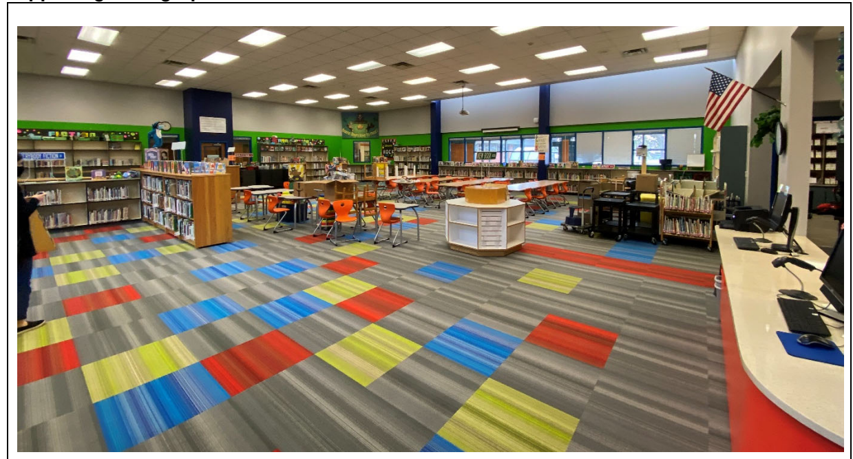
Media Resources: The library has modernized furniture that is easy to reconfigure.