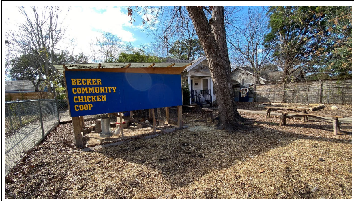
School chicken coop provides animal husbandry learning opportunities, though it's disconnected from the main building.