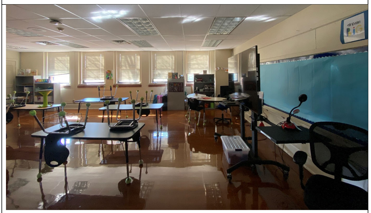
Studios are small and lack flexibility. They are rich in natural daylighting and views, but do not provide proper technology or reconfigurable furniture.