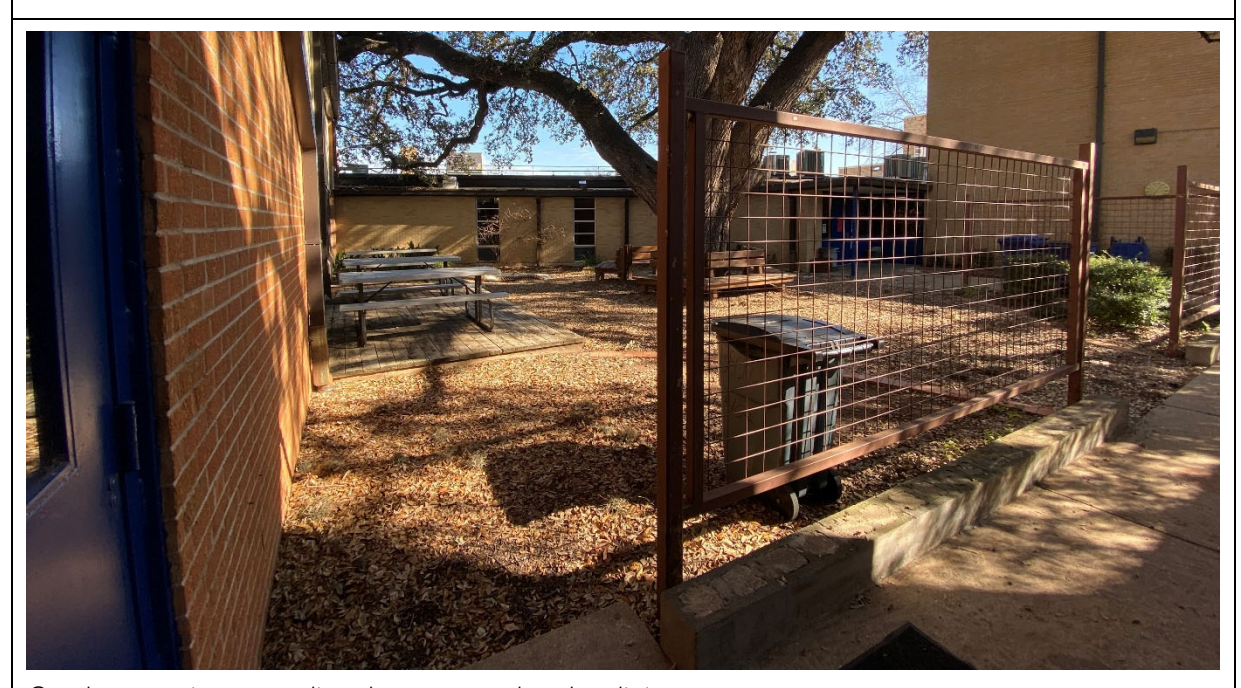
Outdoor seating area directly connected to the dining commons.