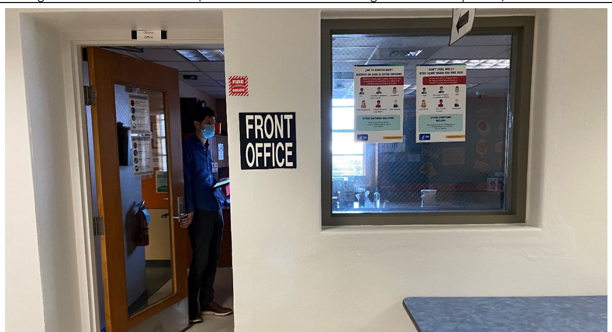
The reception area is small and does not feel inviting. Reception is disconnected from the main entrance and lacks transparency and a view to the front door.

Student drop-off provides small queuing space and lacks overhang. Main entrance is not easily distinguishable from the street. (Main entrance is near the right side of this photo.)