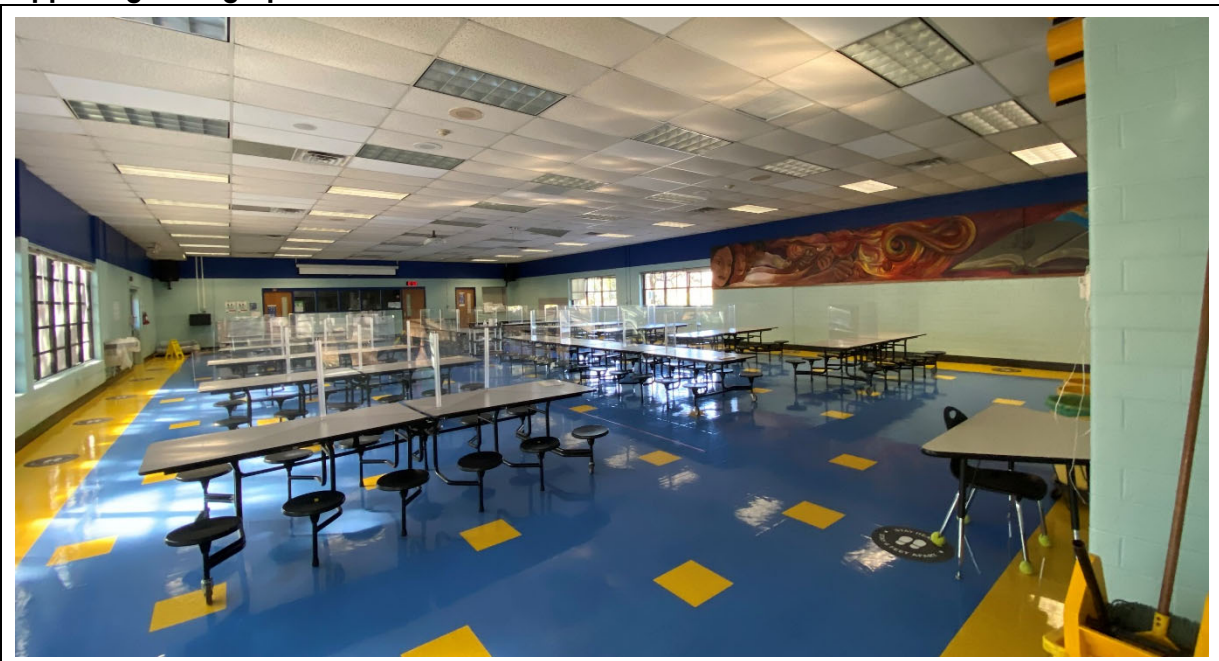
Dining commons is spacious and filled with natural daylight but does not have a connected stage.