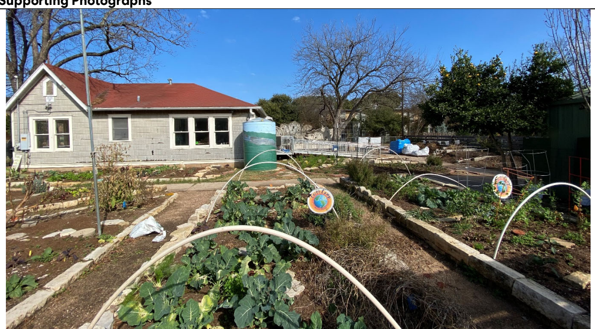
Outdoor learning gardens provide plots for each class to grow their own crops, though they're disconnected from the main building.