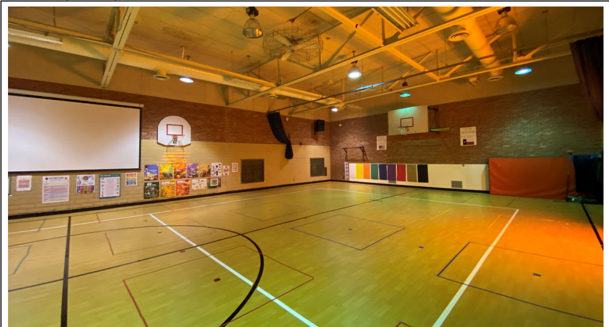
Part of the gym has been converted to a makeshift stage, though it's disconnected from learning spaces.