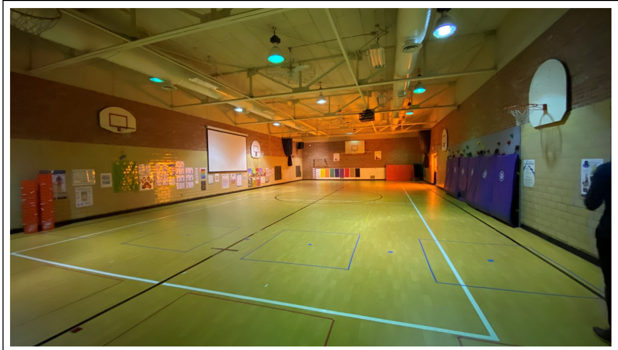
Although it lacks daylighting and views, the gym is an adequate size and has new flooring.