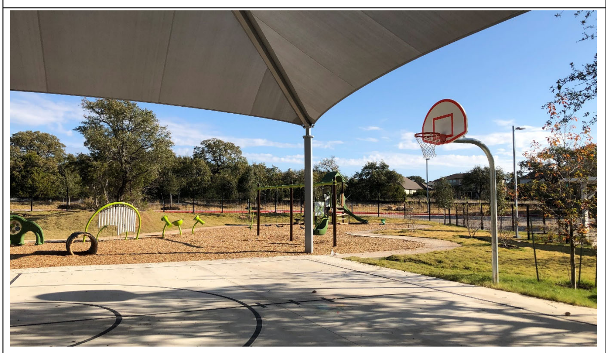
The outdoor covered basketball area is adjacent to the gym. Pre-K and kindergarten playground is beyond.