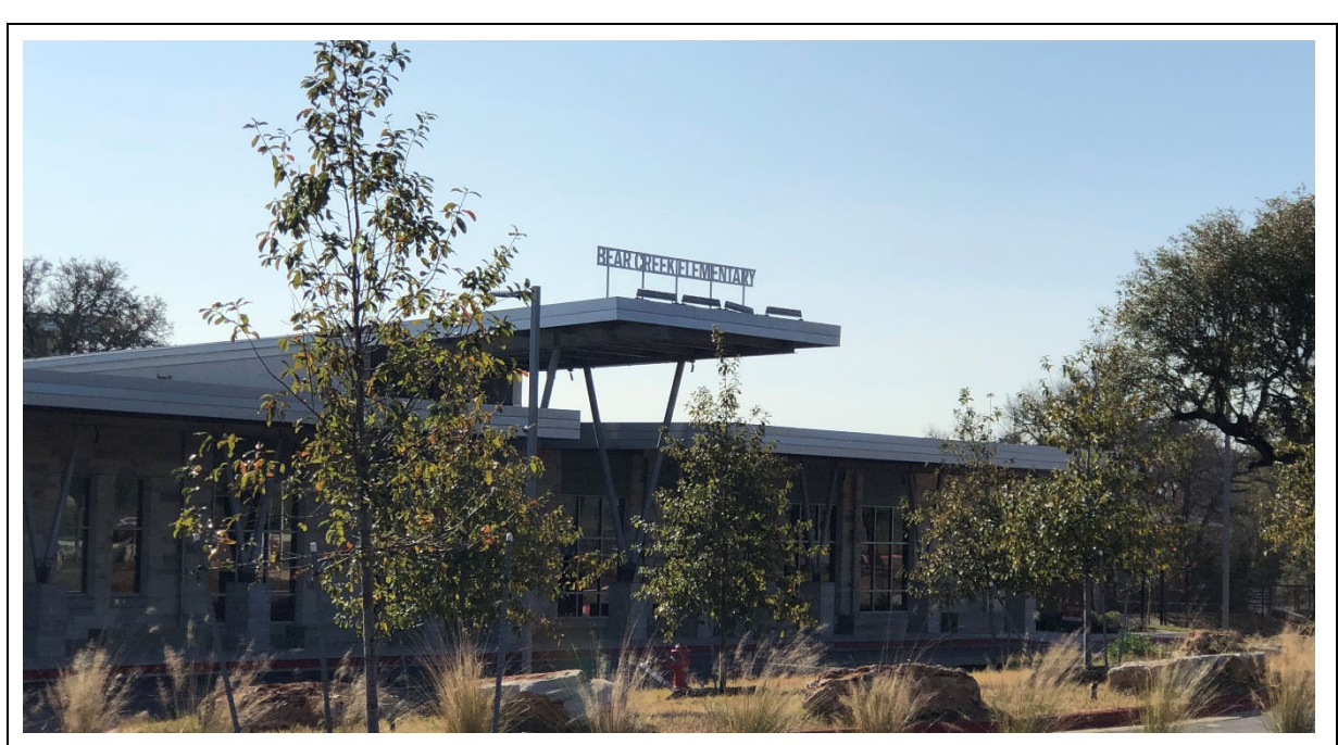
Entry to Bear Creek is welcoming, and a covered entry is provided. The school was inaugurated in 2020.