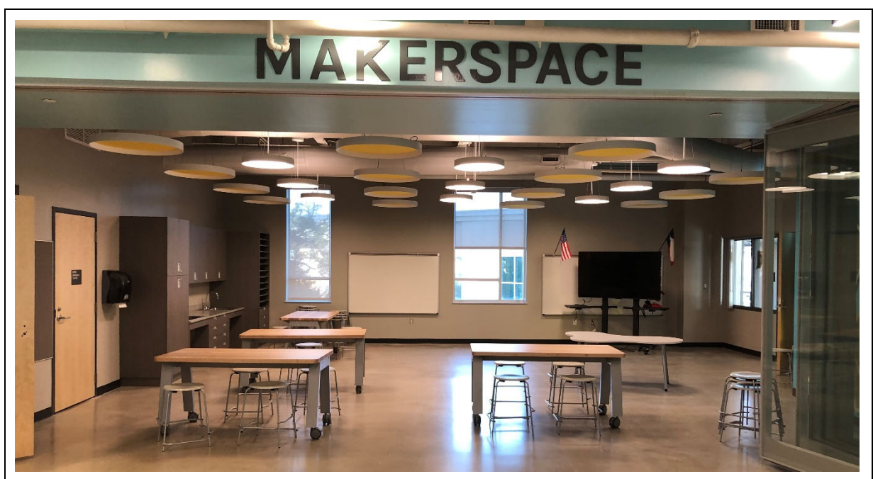
The maker space has movable partitions allowing the space to open to the corridor.