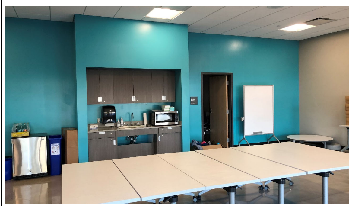
The community room, including a prep area and restroom, is adjacent to the secured entrance lobby for easy access to the public.