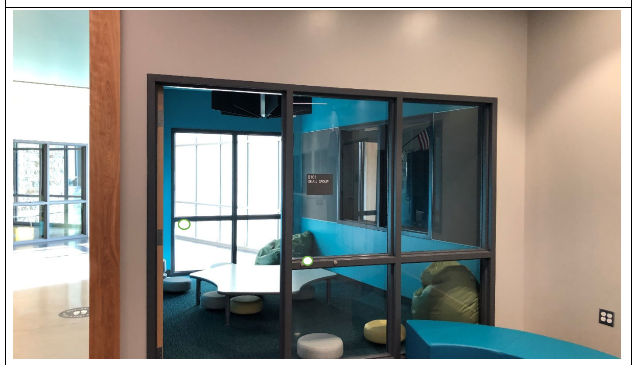
Small group rooms are located adjacent to studios and have good transparency for passive supervision.