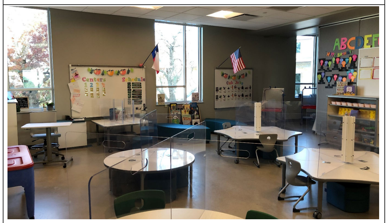
Studios have flexibility to create multiple areas for different teaching methods and have good control over artificial and natural lighting.