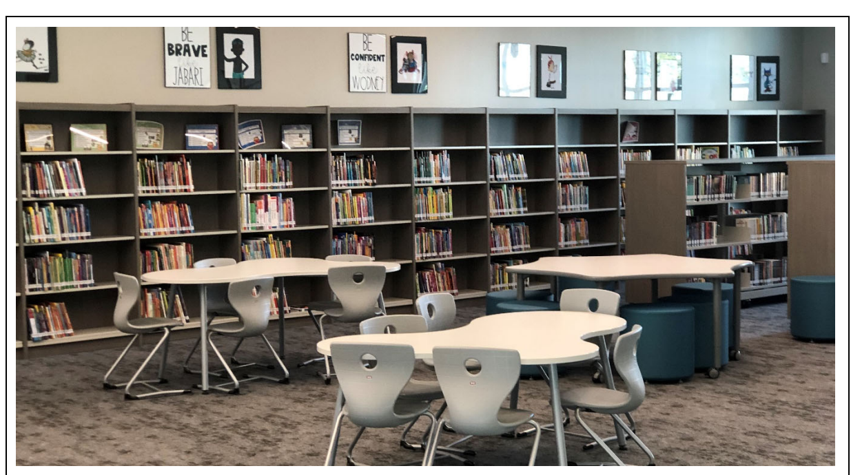
The Media Center just past the secured entrance lobby. Flexible furniture allows for different size groups.