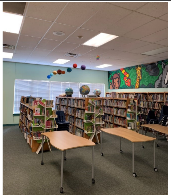
Media Resources: Mix of old and new furniture present, but limited space for larger groups.