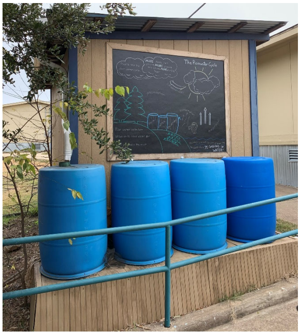
Small cisterns collect rainwater for the gardens. This was completed as a project for a student in Boy Scouts.