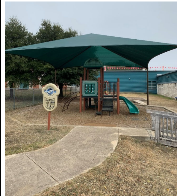
Two of the three playgrounds have a canopy and are in good condition.