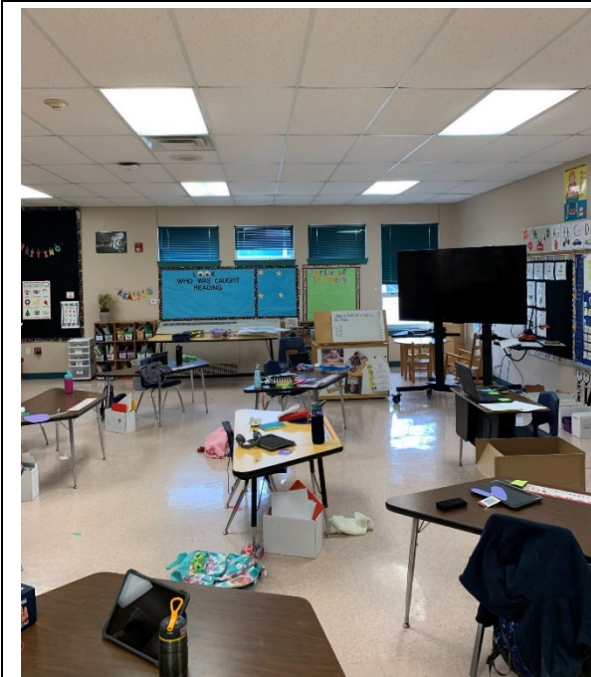
Environmental Quality: All studios have windows and access to natural light.