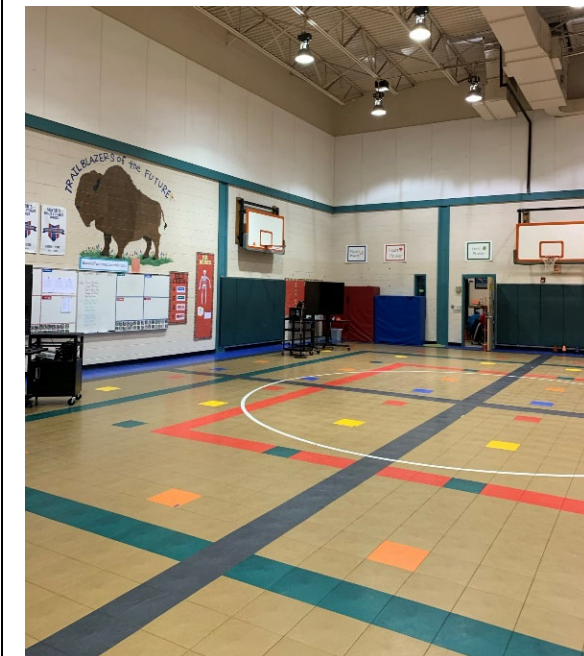
Gym and cafeteria are connected by an operable wall. Flooring is in process of being replaced