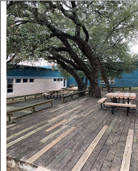
Large wooden deck serves as outdoor learning or dining space but needs updates.