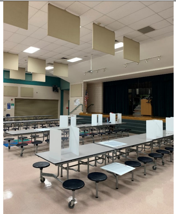
Cafeteria is undersized and only has one type of seating.