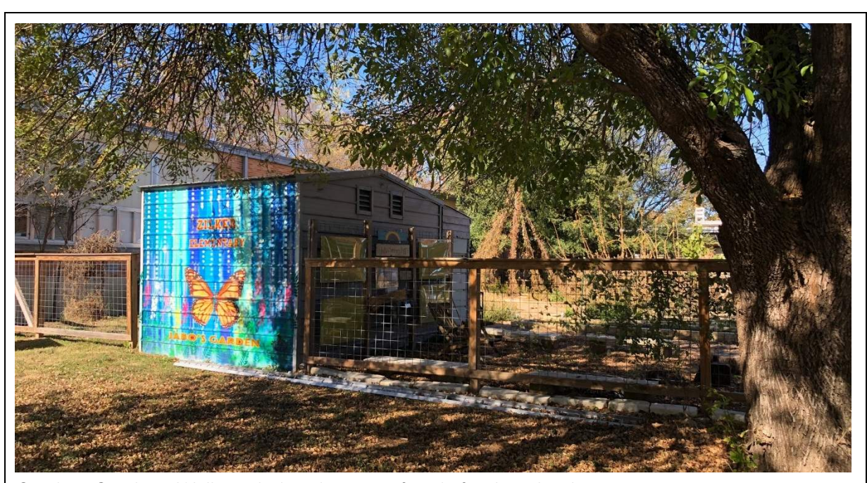
Outdoor Gardens: Well-tended and source of pride for the school.