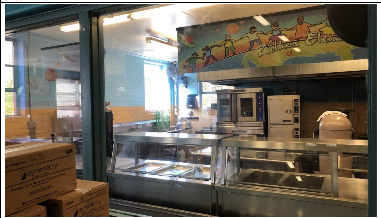
Kitchen/servery is undersized and does not meet current Ed Spec standards.