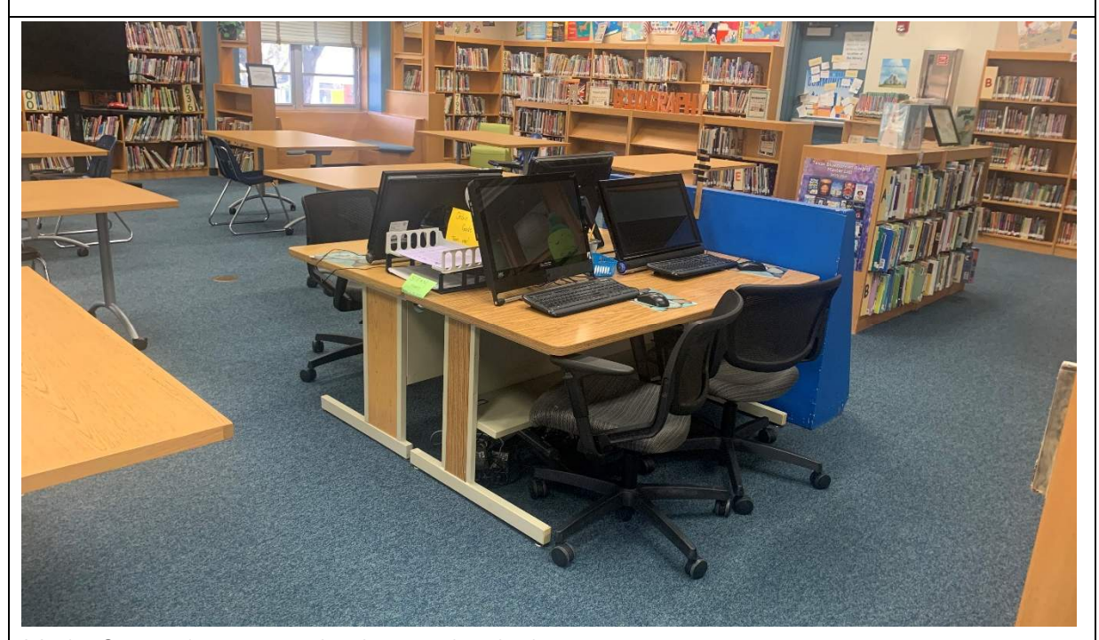
Media Center: Access to technology and multiple seating options.