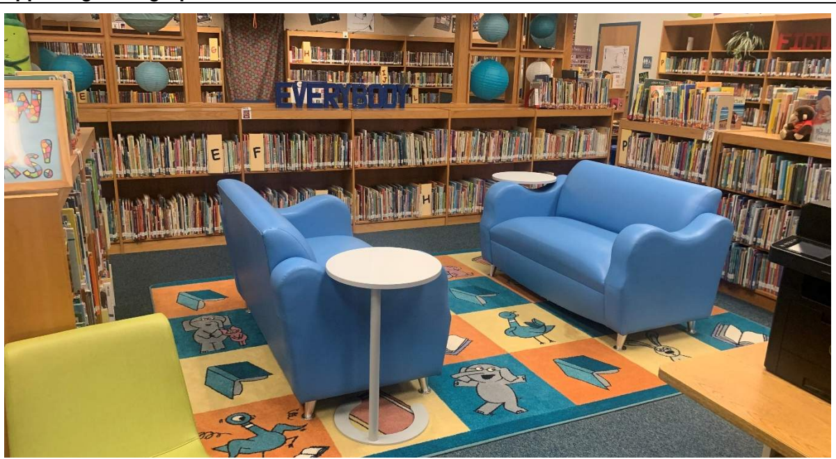
Media Center: Provides different seating areas.