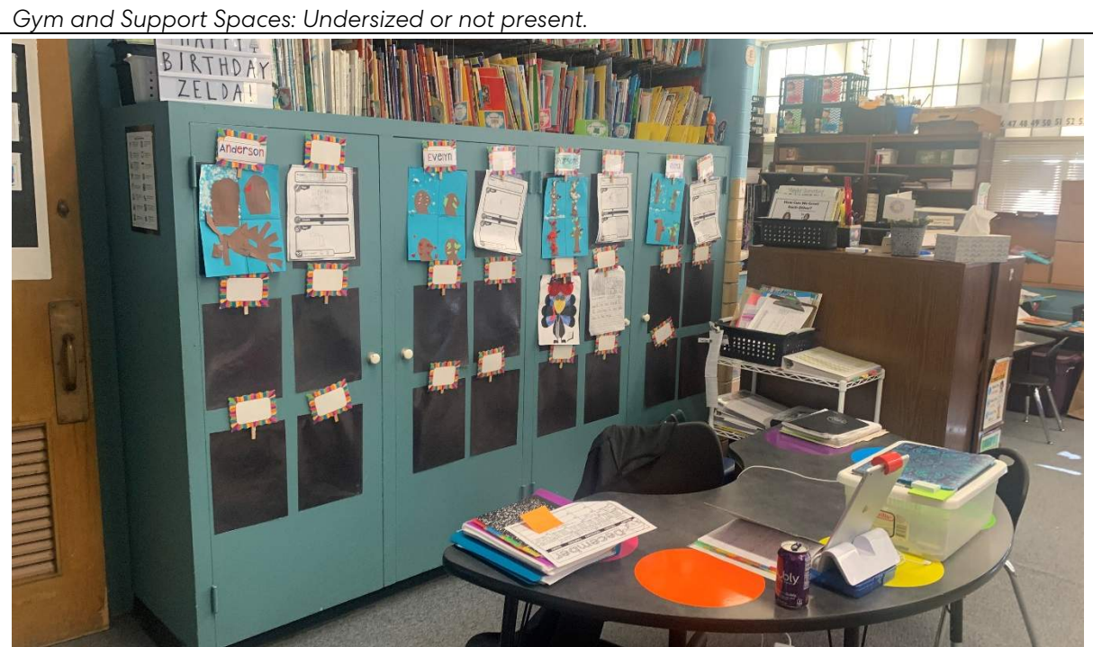
Storage is not consistent in all the studios. Entire school lacks storage spaces.