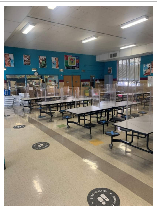
Stage and A/V in poor condition. Cafeteria SF accommodates 1/3 of learning population but is dated and doesn't function well in hosting events. School doesn't have storage available for adult-sized chairs.