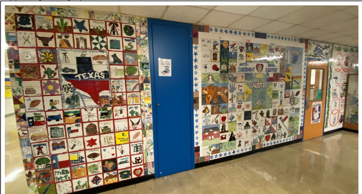
School Pride: The community quilt is very important to the school and is an item that should not change due to campus importance.