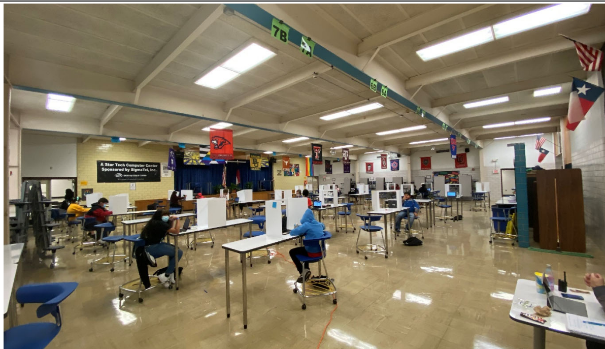
Food Services: Cafeteria is appropriately sized. The stage is not big enough for performances and has unsatisfactory A/V equipment.