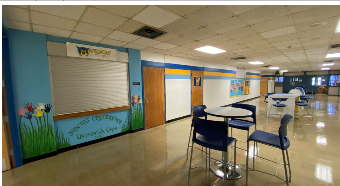
Updated furniture in main hall outside of cafeteria provides some group collaboration space. No collaboration or small group space provided near the studios.