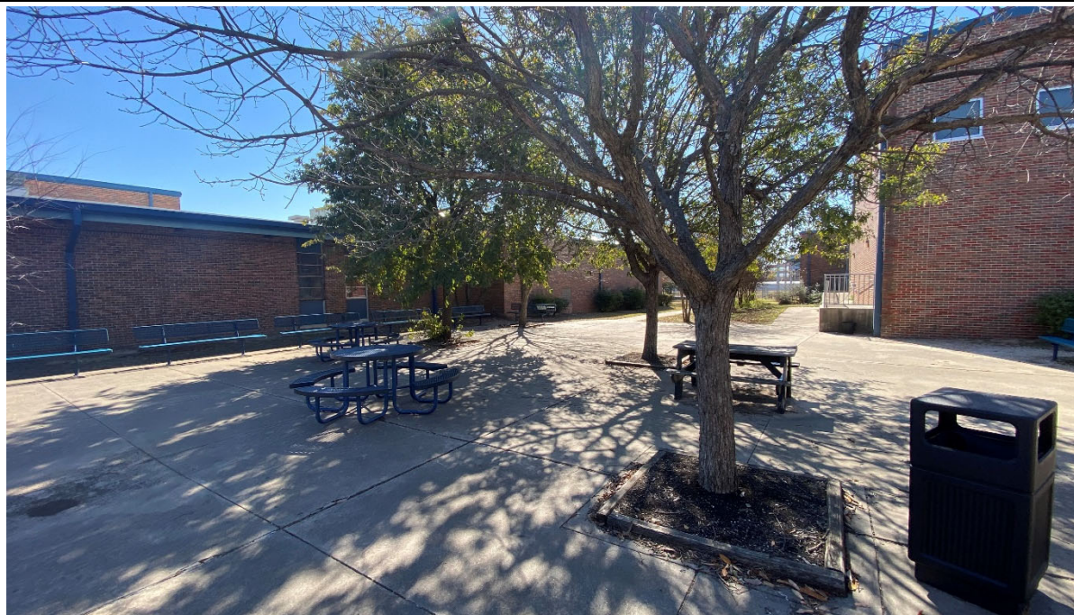
Outdoor Learning: Courtyard between school and fine arts building is well utilized but needs additional upgrades, such as shade, furniture and technology, to function well.