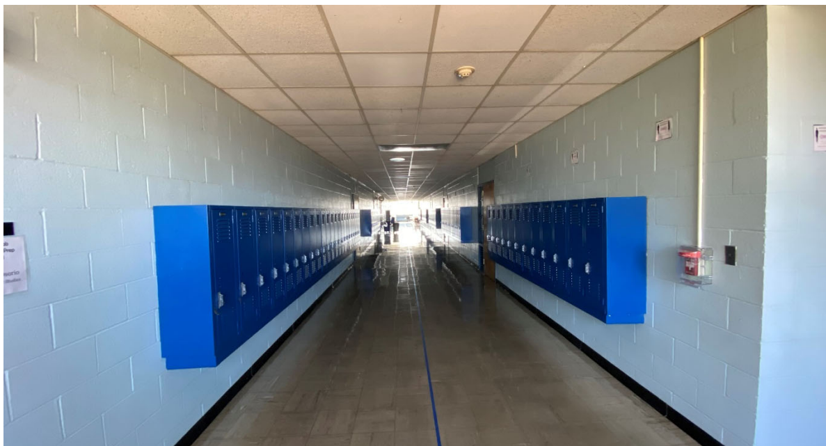
Corridors are approximately 10' wide but there is limited to no transparency into studios.