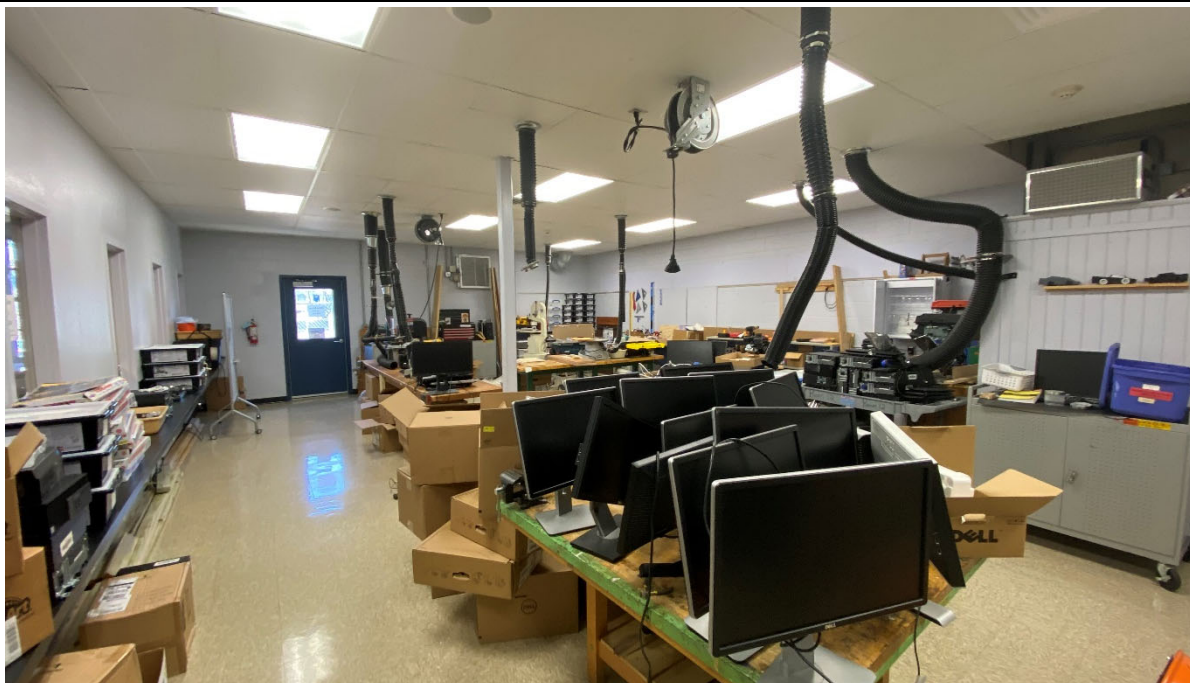
CTE: Computer Lab and adjacent wood shop have had recent upgrades with the addition of flexible overhead power and overhead exhaust in the back of the room. The computer monitors are being installed, and their current location does not represent the typical state of the studio.