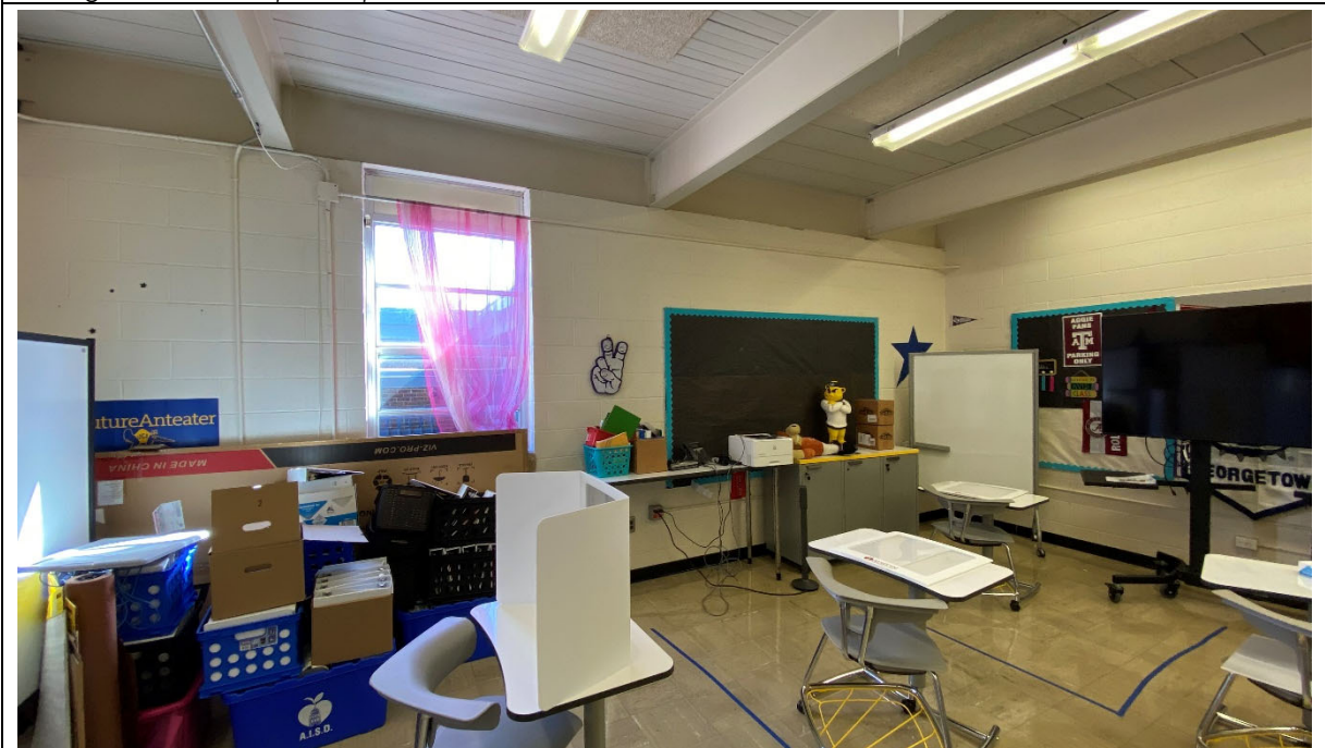
Typical studio is undersized, but all have new, updated furniture. Small windows are provided in most studios.