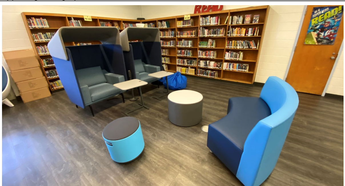
Media Center: Library and rest of school have received updated/new furniture. The media center doesn't have small group breakout rooms but does provide a variety of furniture for different types of studies.