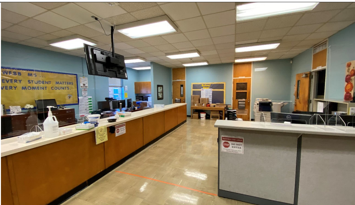
Administration: Space is large but does not have seating in the reception area and does not feel welcoming.