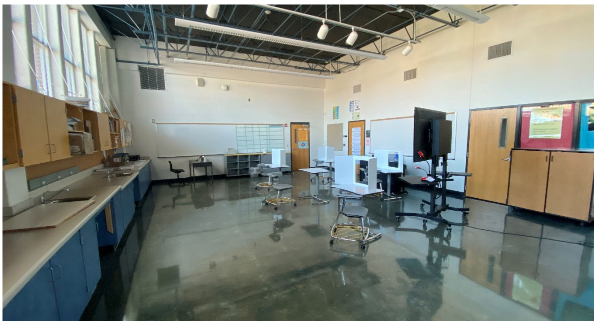
Visual/Fine Arts: Art classrooms in fine arts building are in good shape and have good access to natural daylight.