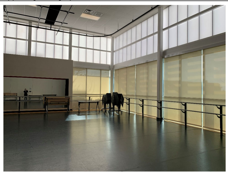
Dance Studio: Issues with daylighting so cannot use it as any other performance space. Upper panels pop during temperature changes.