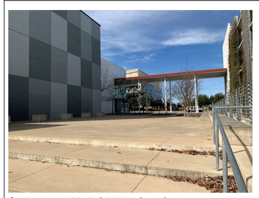
Outdoor area with lack of electricity for performances.