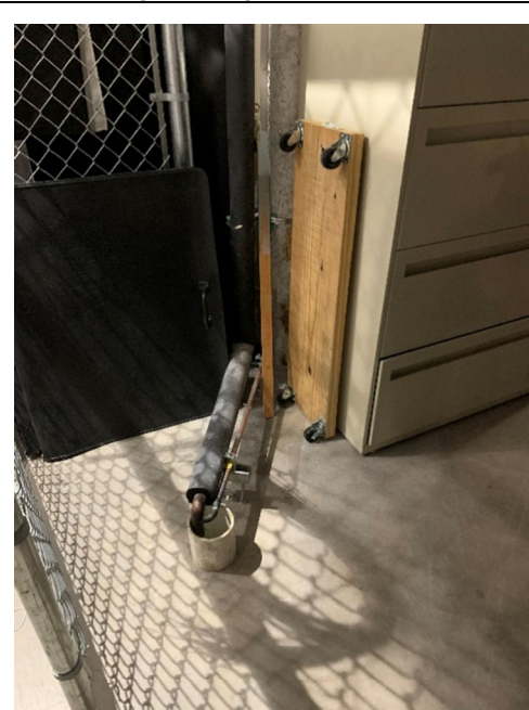
Piping that sometimes backs up and smells.