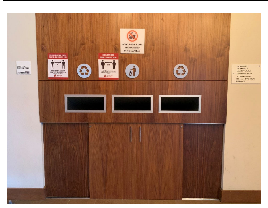
Recycling and landfill receptacles throughout but no compost.