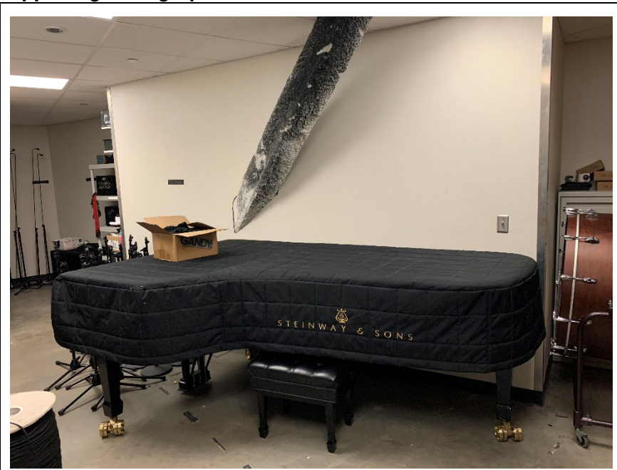
Grand piano not stored in proper climate- and humidity-controlled space.