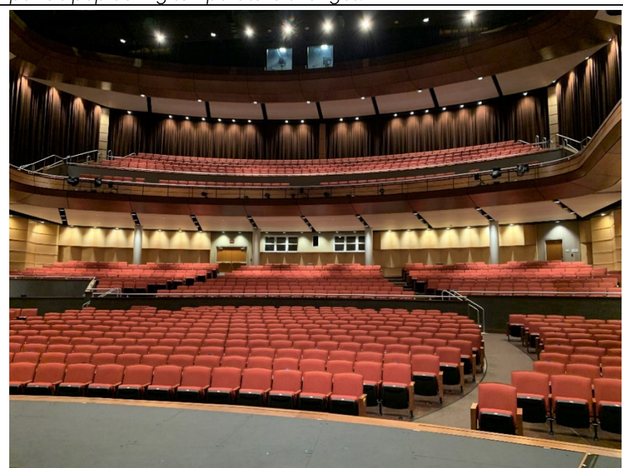
Main performance hall in good condition.