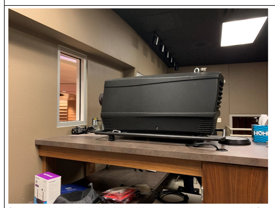
Projector is loud and gets hot. Would like to suspend it in the main hall if possible.