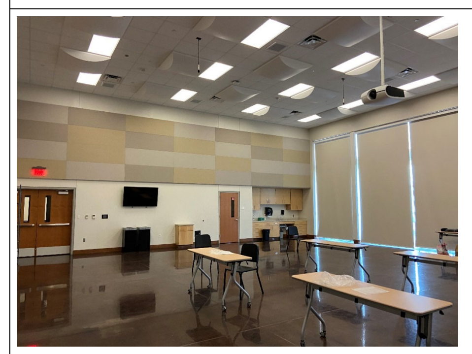
Multipurpose Room: Requested a folding partition so that it can be more flexible and host two events at once.