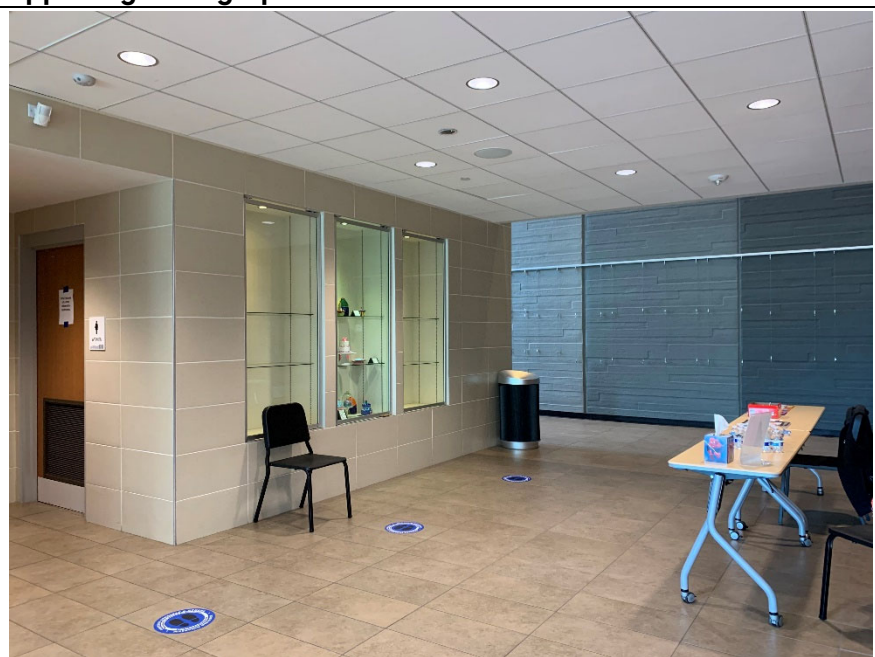
Lots of display options for student and local art.