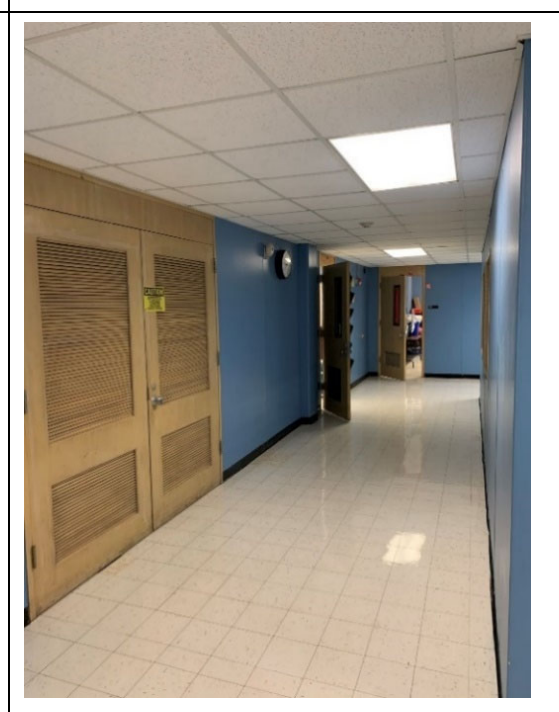
Narrow interior corridors, poorly lit and low visibility. Little opportunity for collaboration spaces.