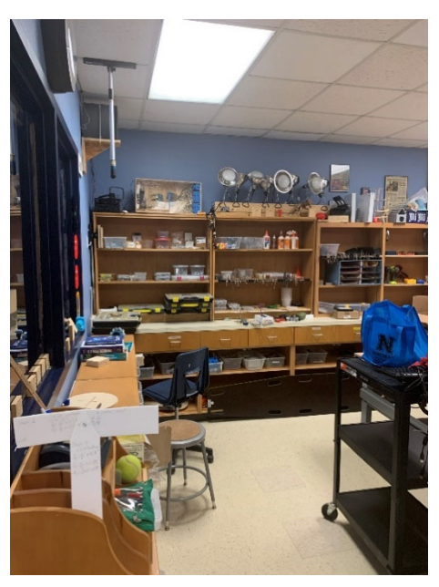
Well-equipped Maker Lab and robotics program with some additional storage needs.