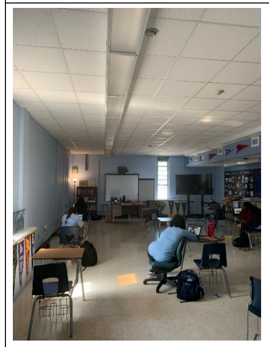
Dated furniture and limited lighting controls. Natural light present but poor due to narrow windows.