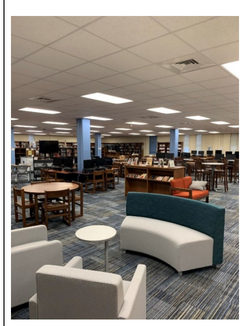
Media Center: No quiet zones or areas for independent study and a mix of old and new furniture.