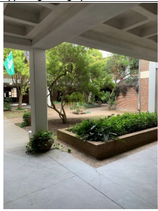
Generous outdoor space but limited functionality.