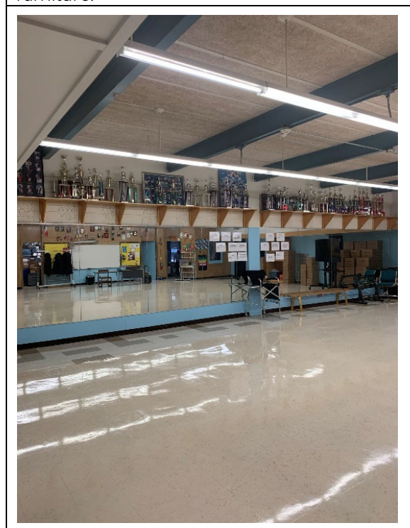
Undersized dance space needs storage and a dedicated dressing room.