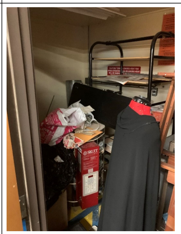
Broken kiln now serving as space for additional storage. More storage and power needed.