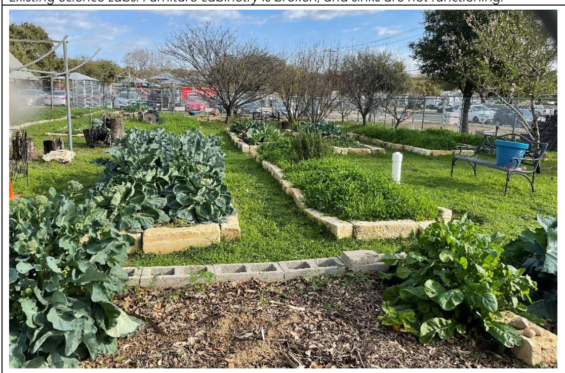
Outdoor gardening area is well maintained.