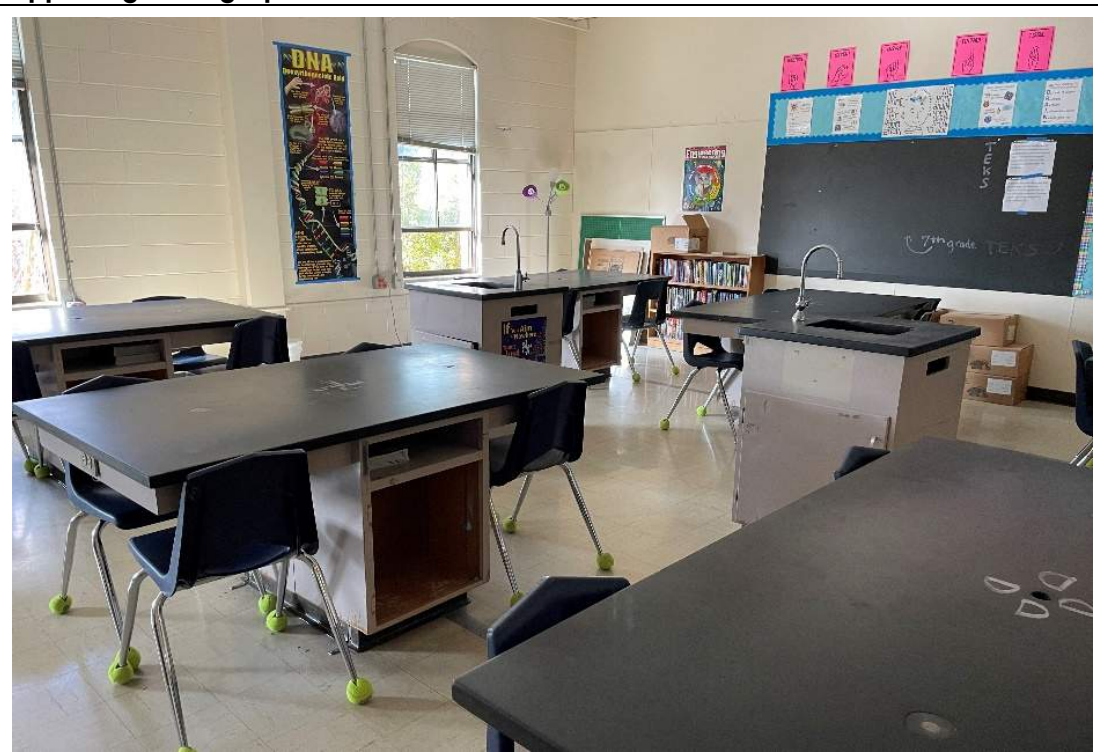
Existing Science Labs: Furniture cabinetry is broken, and sinks are not functioning.