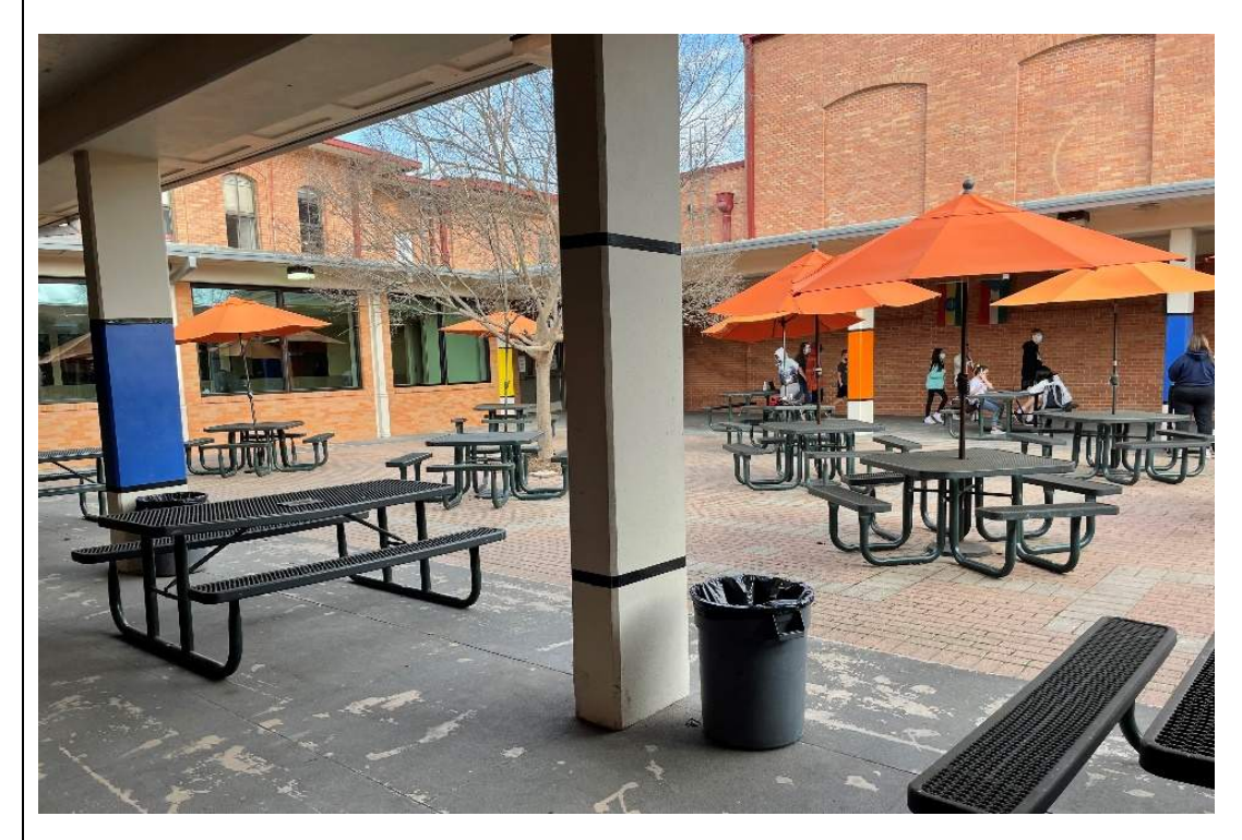
Outdoor dining area is large and has shade.