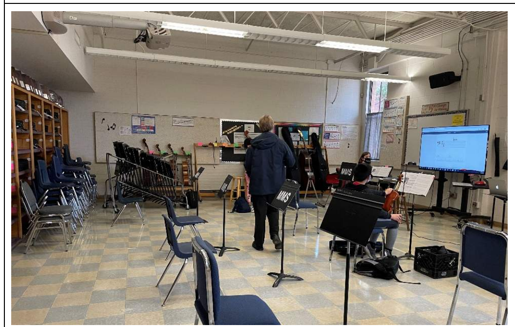
Performing arts areas are small and lack enhanced acoustical solutions.