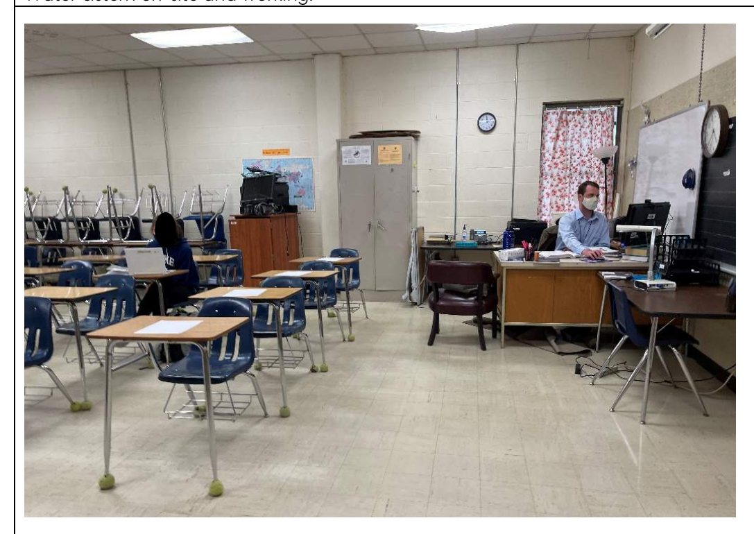
Furniture in existing building is outdated and offers only one type, which is not flexible.