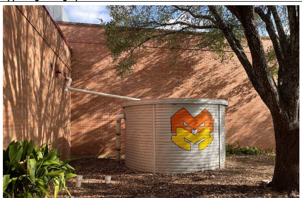
Water cistern on-site and working.