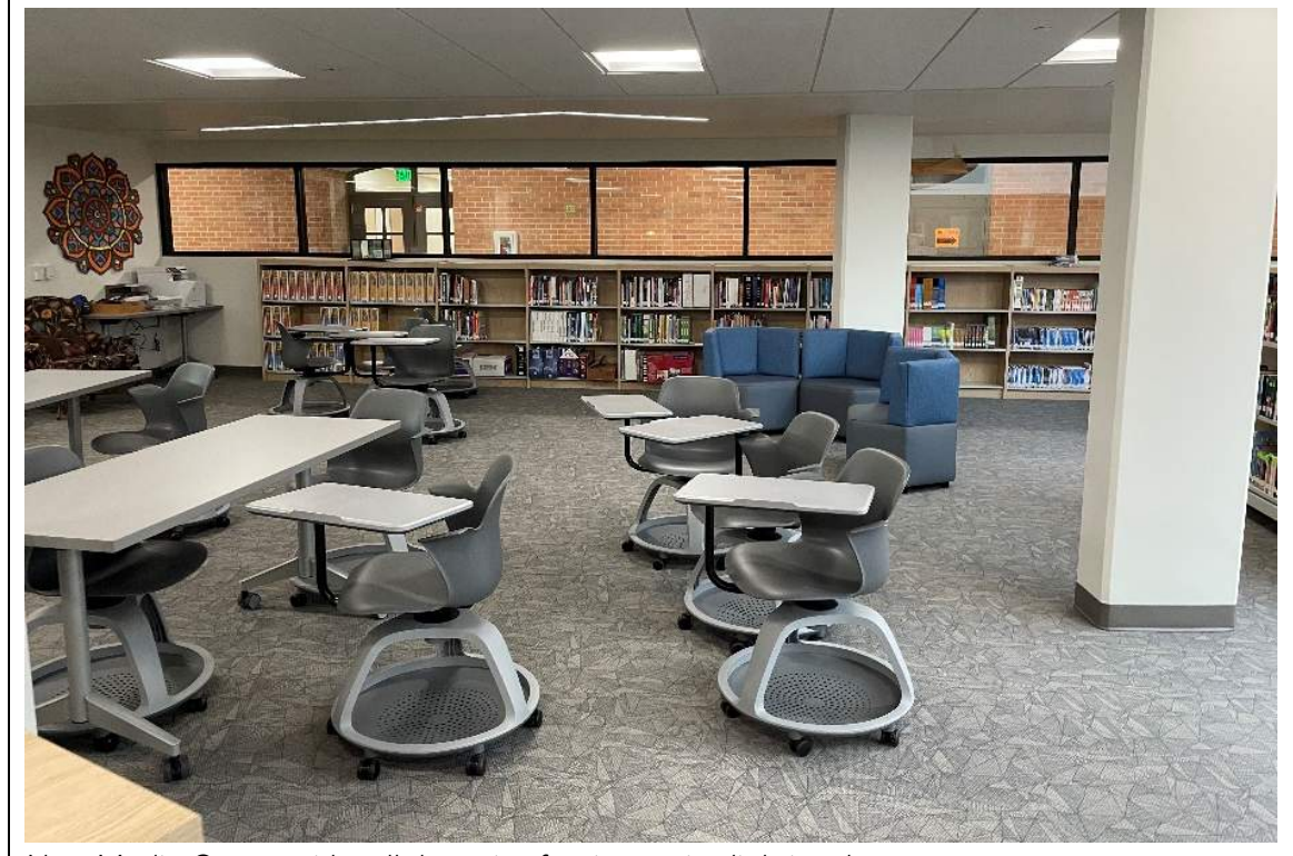
New Media Center with collaborative furniture, nice lighting, large space.