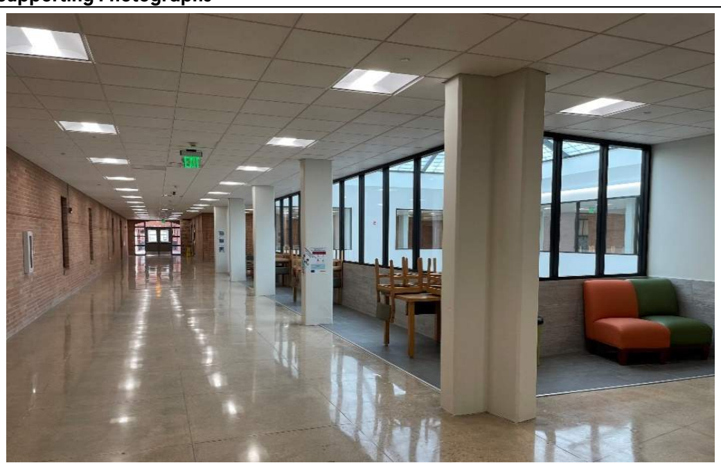
Existing building modernized to have open collaboration in corridors.