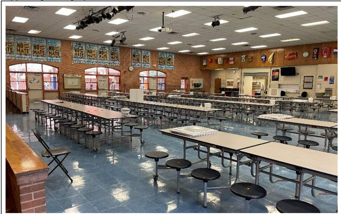
Cafeteria has only one type of furniture and needs acoustical enhancements.