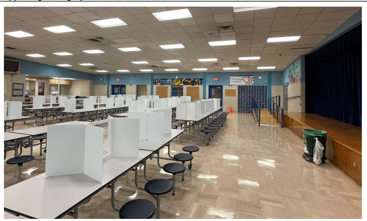
The small cafeteria stage is the only area for performances, and it is difficult to fit all students and visitors. The space is undersized for food service and performances.