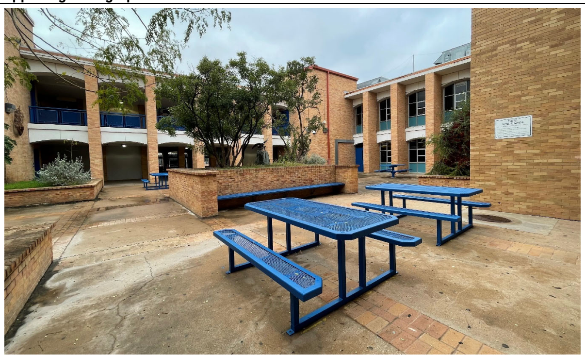
Courtyard spaces are equipped with furniture but lack shade canopies or power access.