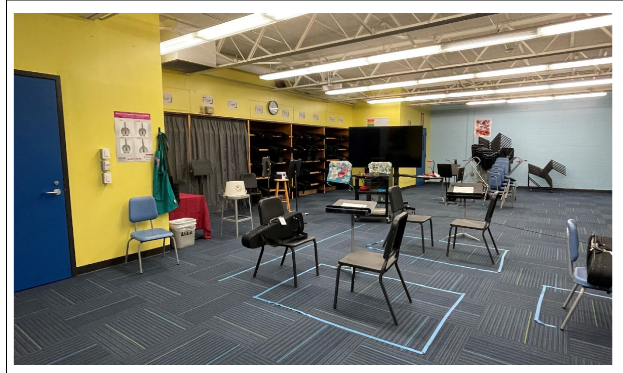
Orchestra and guitar share the same space with one practice room and limited storage.