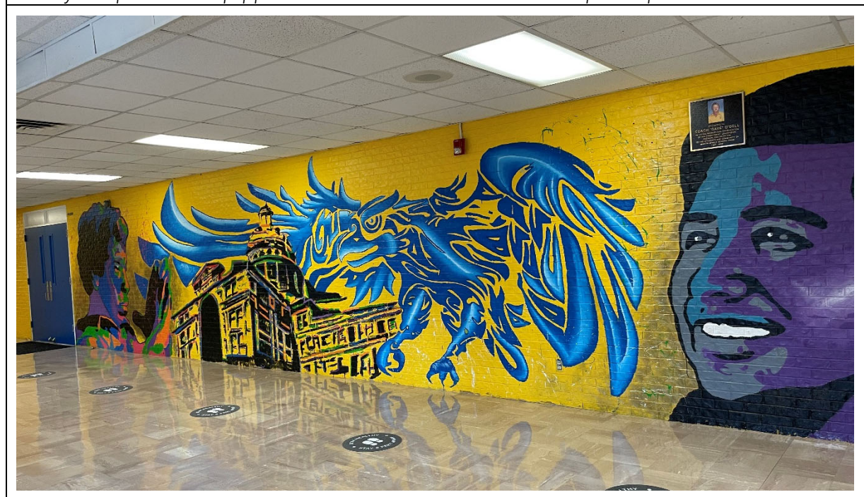
There are areas with murals around campus and most spaces are well-maintained given the age of the school.