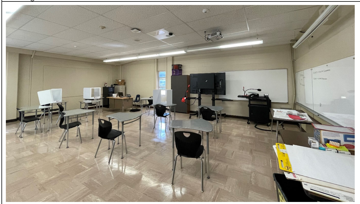
Studios are equipped with projectors and mobile TV displays. Windows in some studios are narrow and provide limited natural light and views.