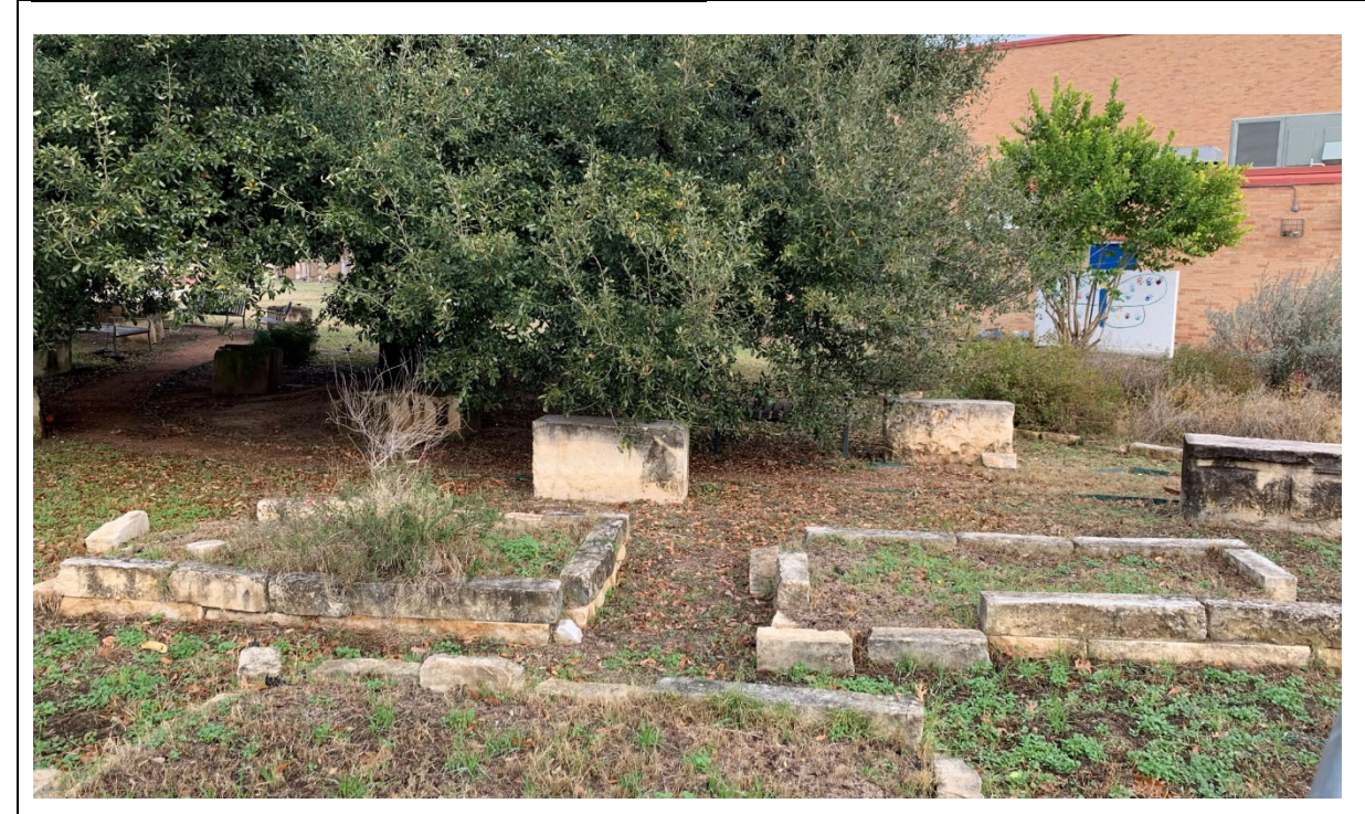
Gardens are a bit disconnected from learning spaces and need updates to function well.