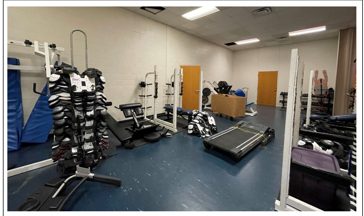
The weight room is in the converted stage area of the large gym and is very undersized.