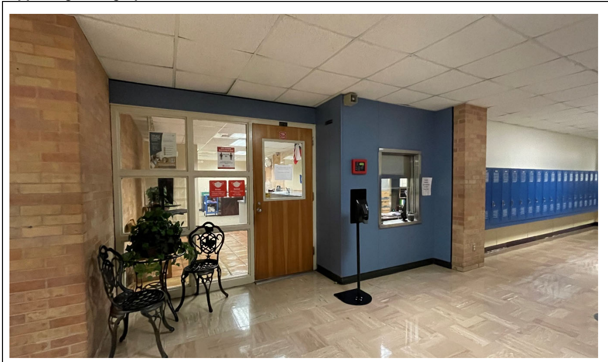
Main reception area is not welcoming.