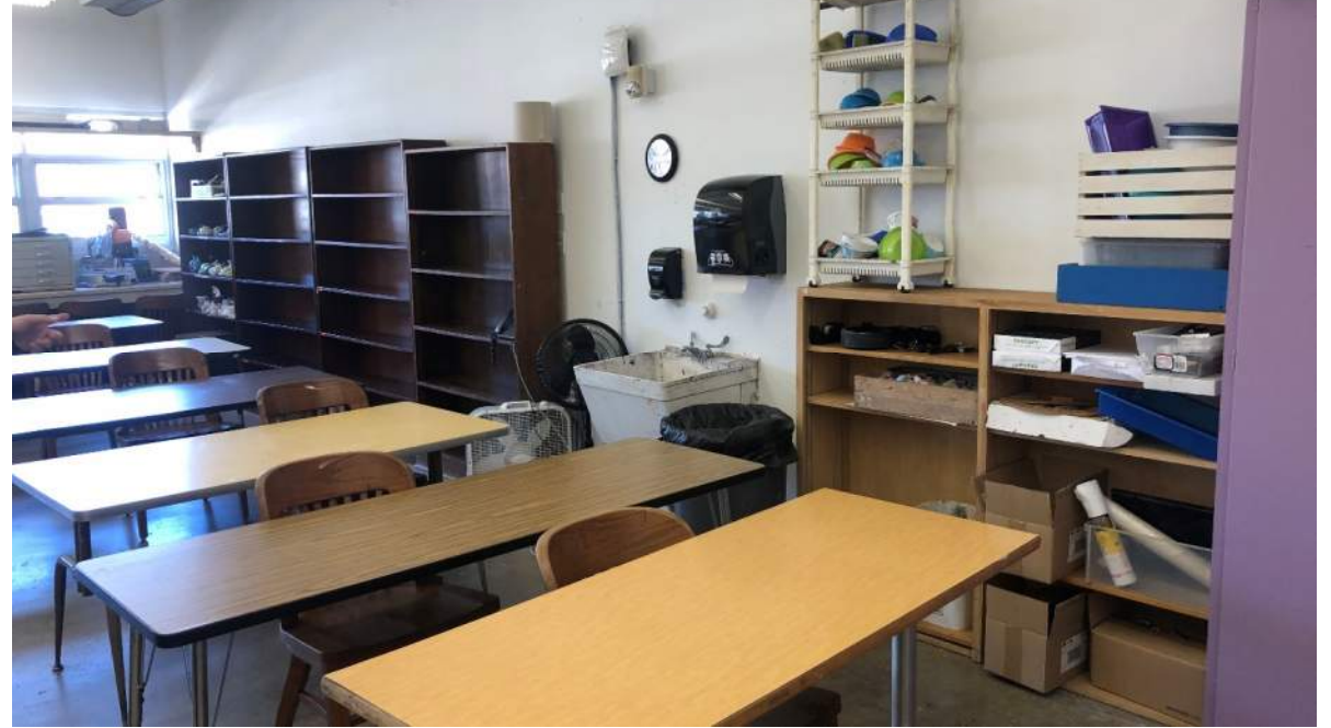
Art studios do not have adequate support. There is only one sink in each art studio, but they do not have clay traps and get clogged frequently.