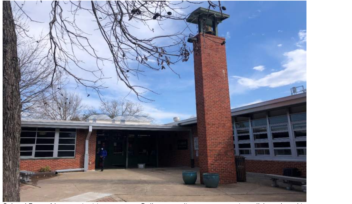
School Entry: Not very inviting or open. Belltower adjacent to entry is well-loved and is one aspect of the campus that should not change in the future.