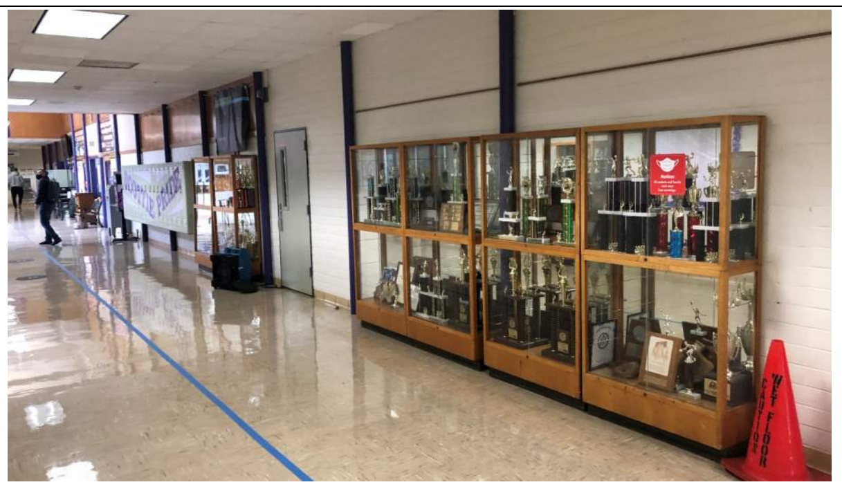
Display throughout the school is limited. Even though it is a fine arts academy, that is not evident when walking the halls.