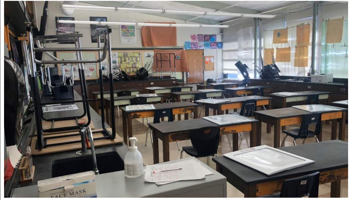
Science studios are undersized and have old heavy tables. Water at sinks is sporadically hooked up and many sinks do not have water.

All studios are undersized per current Ed Spec square footage. All studios have excellent access to daylight and views. Outlet placement is sporadic and does not allow for adequate charging locations. Many studios have mechanical equipment units taking up floor square footage.