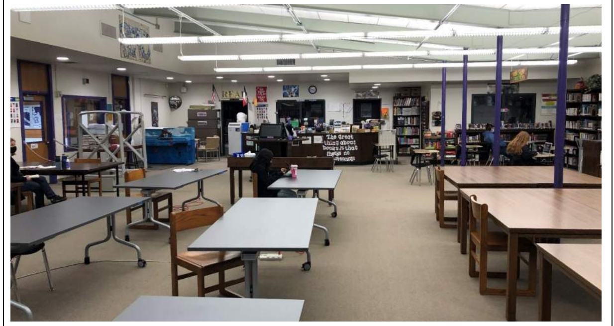
Media Center: Square footage is adequate and there is a mix of old and new furniture. Space needs updates to function well. Media center does not have adequate support space.