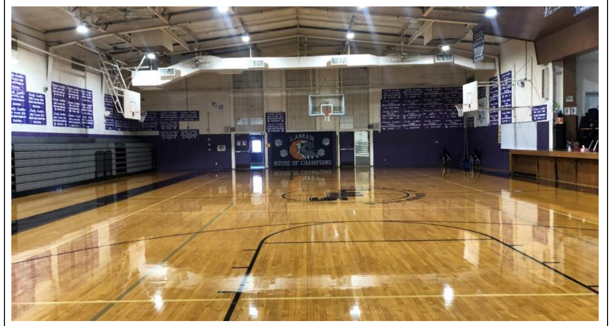
Main Gym: Main/aux gym are undersized per Ed Spec.